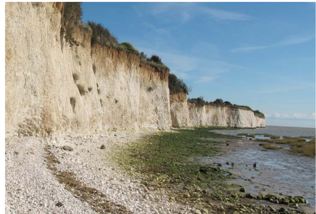
Chalk cliffs at Pegwell Bay are of geological and biodiversity interest. The diverse coastline in this NCA provides good recreational opportunities.