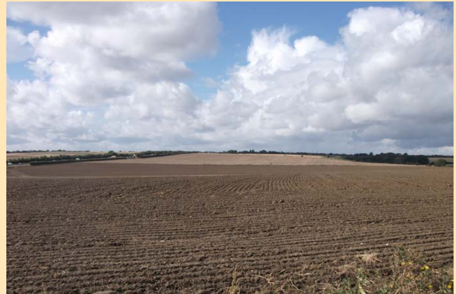
An open, low and gently undulating landscape characterised by high-quality, fertile, loamy soils dominated by agricultural land uses.