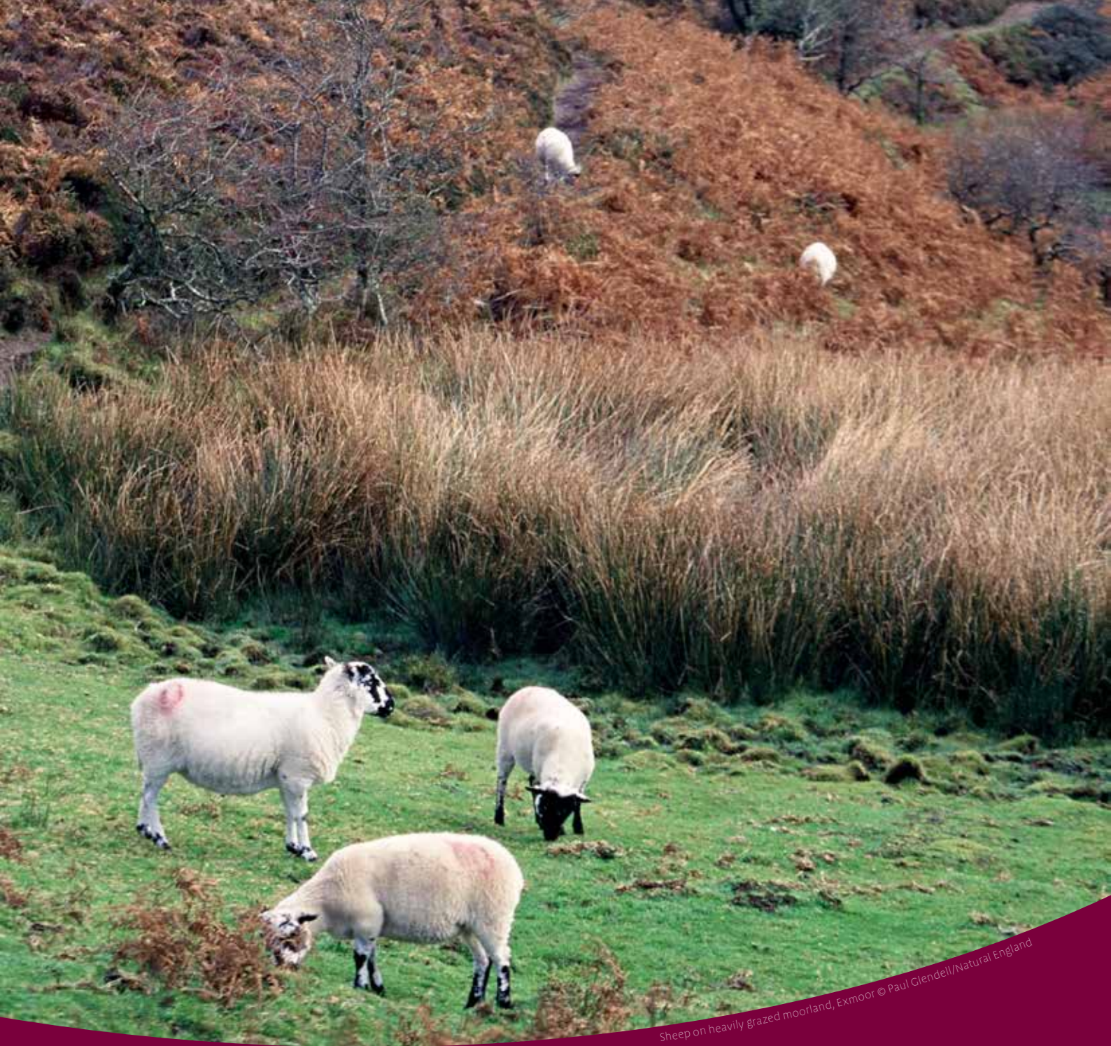
Sheep on heavily grazed moorland, Exmoor