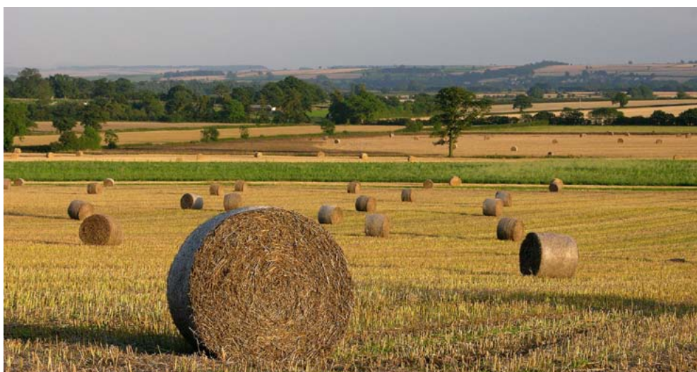
The Vale is a largely farmed landscape, predominantly arable and feed grains, with some livestock.