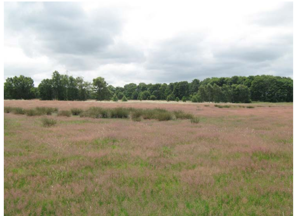
This area of lowland acid grassland near Wykeham is an unusual habitat in the Vale of Pickering.

Biodiversity and geodiversity are crucial in supporting the full range of ecosystem services provided by this landscape. Wildlife and geologically-rich landscapes are also of cultural value and are included in this section of the analysis. This analysis shows the projected impact of Statements of Environmental Opportunity on the value of nominated ecosystem services within this landscape.