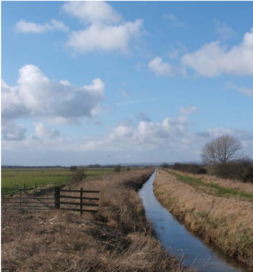
A landscape of rivers and wetlands which have been artificially drained and modified for productive farming.