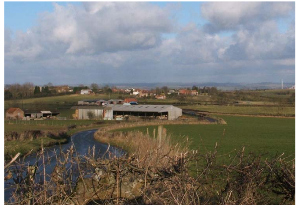
Small settlements were established on the slightly elevated, drier ground. Red pantiles are characteristic.

peat itself it indicates past changes in climate and vegetation from the early Holocene onwards; earlier sediments belonging to the warm Ipswichian interglacial 120,000 years ago have been found in Kirkdale Cave and contain a diverse vertebrate fauna, including the remains of a hyena den and the most northerly remains of hippopotamus. It is known that from at least around 9,000 BC humans were modifying the natural environment to improve the quality of their own lives. Every period from the late Palaeolithic to the present day is represented and recorded somewhere within the Vale.