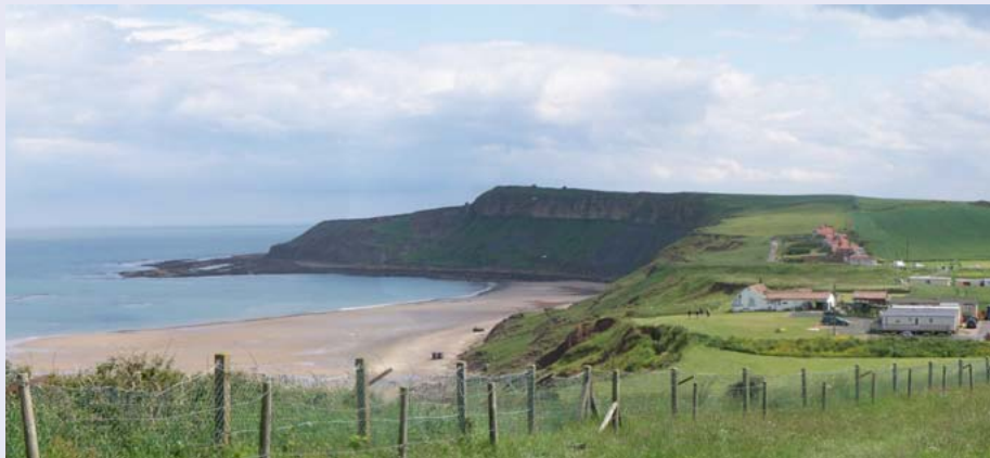
Looking south across Cayton Bay, with its soft cliffs of glacial till, towards the headland of Yons Nab.