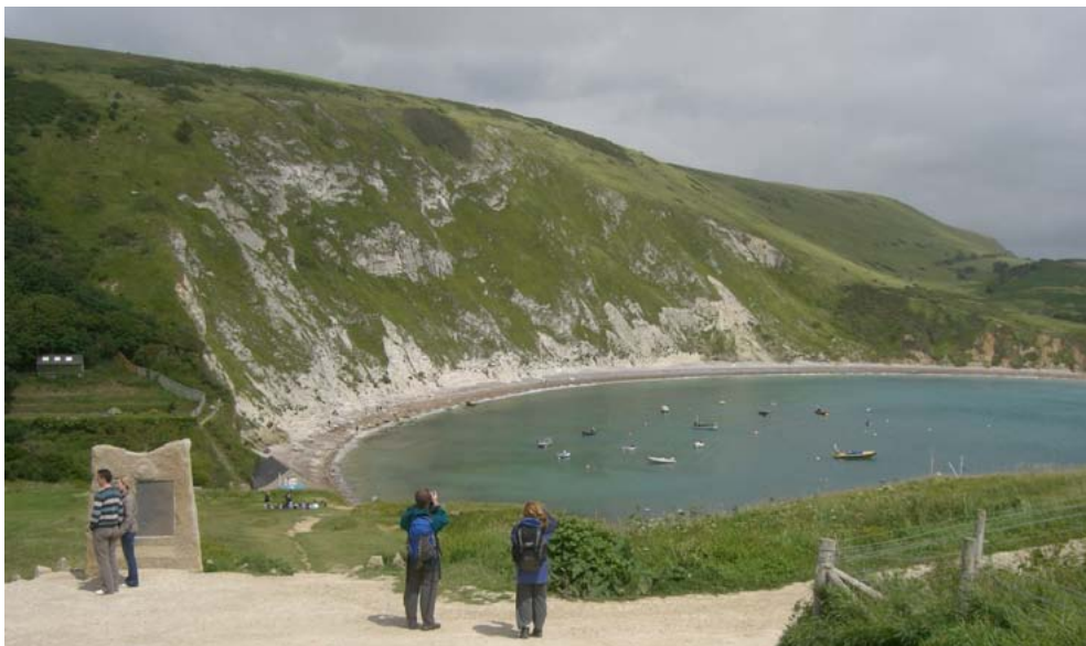
Lulworth Cove attracts over 500,000 visitors a year.

A part of the Purbeck Monocline, the steeply dipping chalk buttress of the Purbeck Ridge dominates, shelters and delineates much of the National Character Area (NCA), while also continuing, across the English Channel via the Old Harry sea stacks, to The Needles and the Isle of Wight. The gently seaward-dipping limestone plateau can be seen, continuing on the Isle of Portland