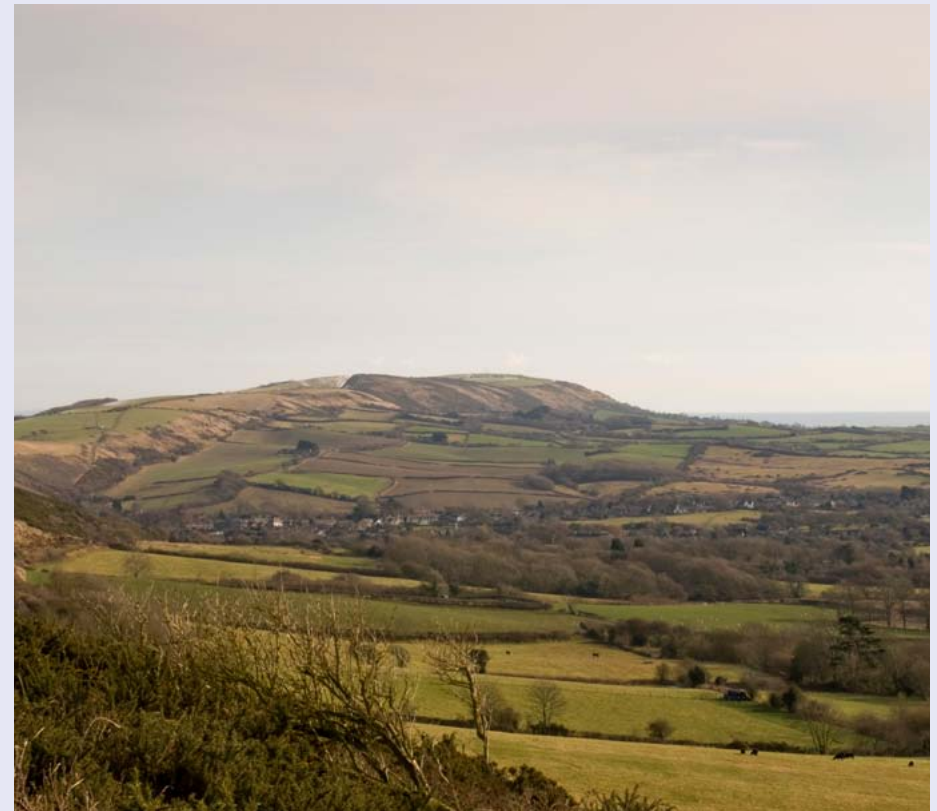
Wind blasted scrub characterises the Purbeck Ridge, thick hedgerows and copses emphasise the shelter within the Corfe Valley below.