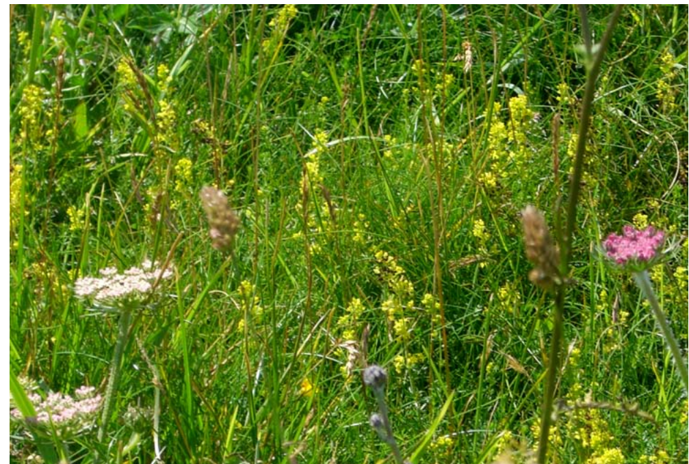
Species-rich chalk grassland, Dorset.