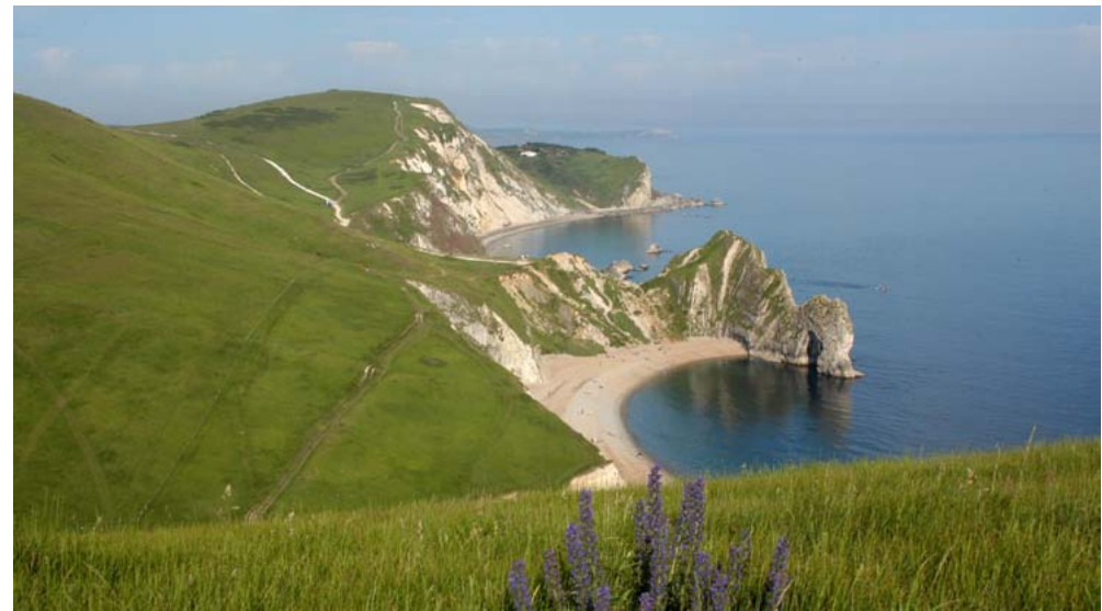
The SW Coast Path provides uninterrupted access to the outstanding geology and biodiversity of the South Purbeck coast.