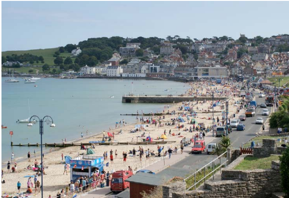
Swanage has a long history as a seaside resort, it is still a popular visitor destination.

Patches of scrub and scrappy hedgerows do provide important 'wooded' features and important refuges for birds and other animals. In the central valley and other sheltered areas thick hedges, shelter belts and small copses enclose fields and hamlets alike and create a sheltered, intimate landscape. The top and southern slopes of the Purbeck Ridge used to be almost exclusively open grassland but in recent decades scrub, mainly gorse, has gained an increasing hold on the slopes.