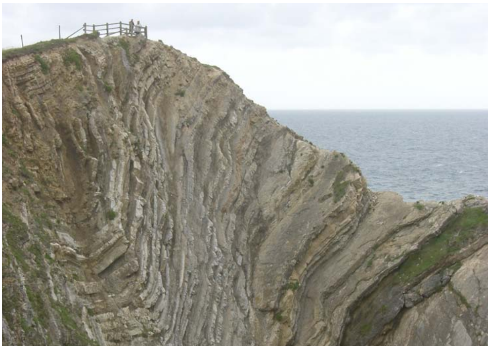
Visible here at Stair Hole, collision of the African and Eurasian continental plates caused intense folding in the strata of South Purbeck.

After sea levels rose and flooded this surface the Gault Clay and Upper Greensand were laid down. Sea levels continued to rise and the erosion that had previously supplied sediment to this area ceased, allowing the formation of the pure limestone called the Chalk. Following the end of the Cretaceous (65 million years ago) the chalk sea bed was uplifted and exposed to erosion here by the ongoing opening of the Atlantic Ocean. Deposition did not resume until the Eocene with a return to marine conditions. These deposits only appear north of the Chalk ridge and only the oldest of these rocks are included in the South Purbeck area.