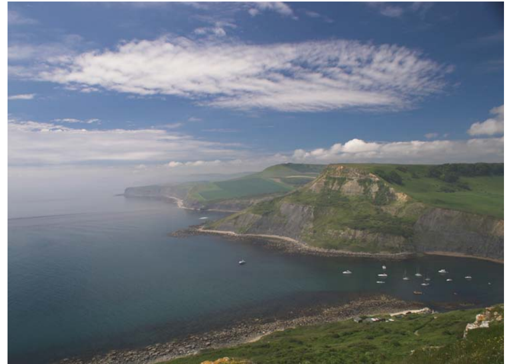
Almost unimpeded patterns of erosion and deposition create the complex geomorphology characteristic of the South Purbeck coast.

Biodiversity and geodiversity are crucial in supporting the full range of ecosystem services provided by this landscape. Wildlife and geologically-rich landscapes are also of cultural value and are included in this section of the analysis. This analysis shows the projected impact of Statements of Environmental Opportunity on the value of nominated ecosystem services within this landscape.