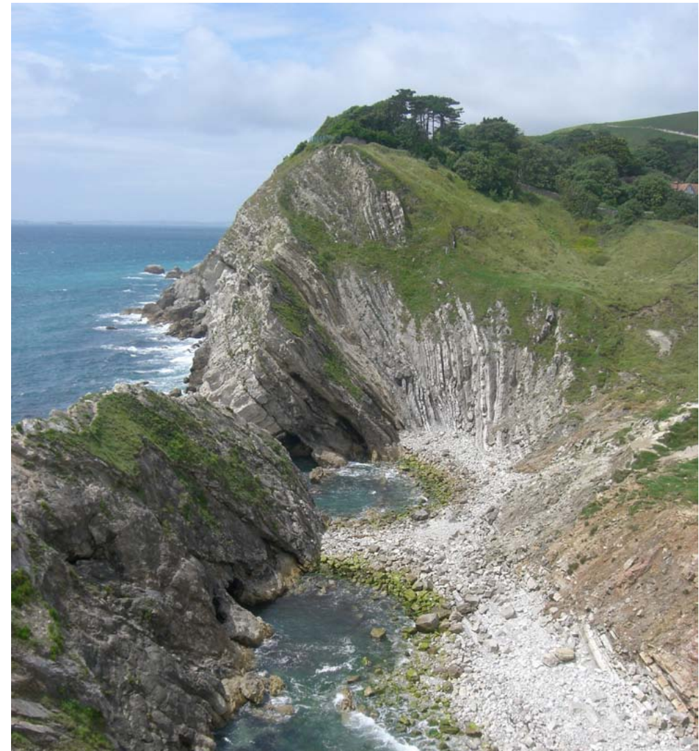
Dramatic geodiversity of the Jurassic Coast near Lulworth.