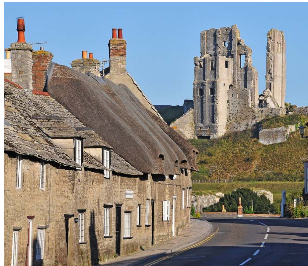
Corfe Castle and Corfe Village, spanning five hundred years of building, unified through exclusive use of local Purbeck Stone.

Following uplift in distant areas to the west and north, large rivers carried sand, grit and clay into the area, creating the Wealden Beds. A slow return to marine conditions began with the Lower Greensand but was interrupted by significant uplift and erosion across the region.