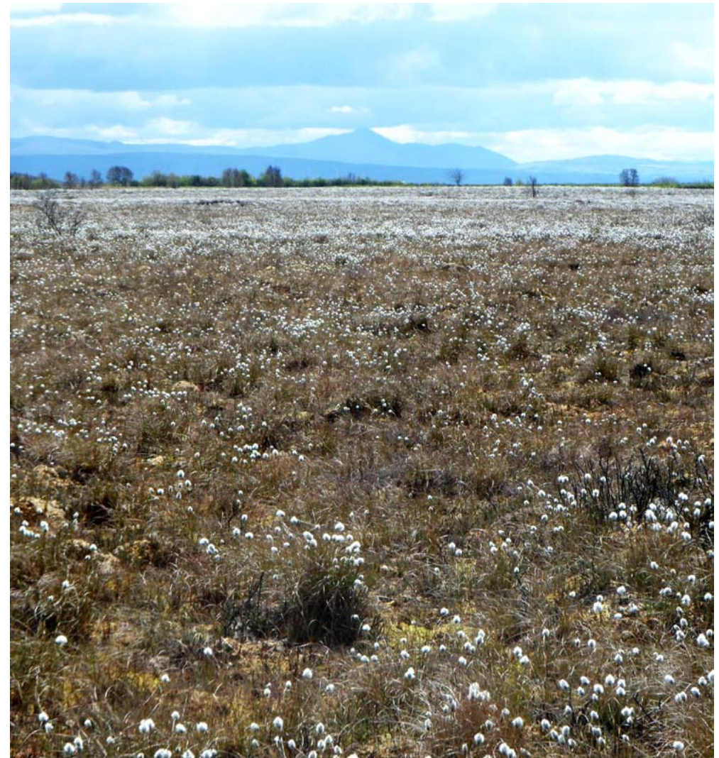
The peat bogs of the Solway are the most intact in England supporting many specialist species and locking away significant carbon reserves.