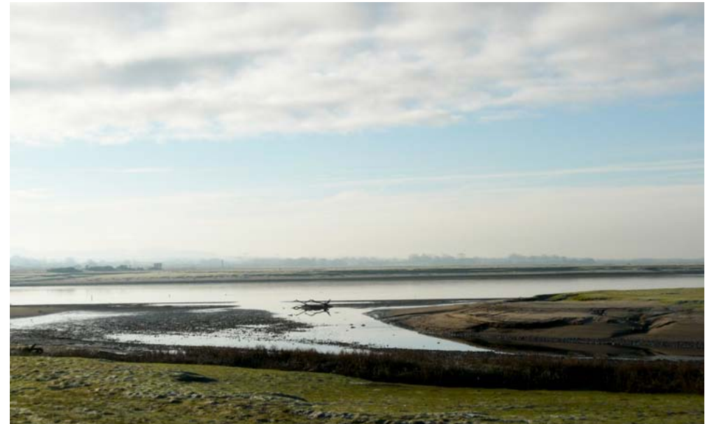
The Solway is a place of quiet and tranquility.