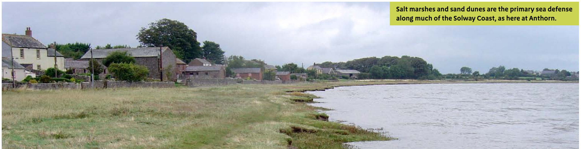
Salt marshes and sand dunes are the primary sea defense along much of the Solway Coast, as here at Anthorn.