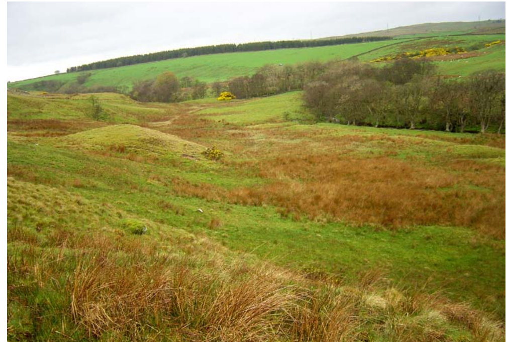
The upland fringes of the NCA are still a broad and open landscape but forestry plantations and more extensive farming systems mark the transition to the adjoining uplands.

The eastern part of the area acts a major transport hub with the main routes linking Scotland and England west of the Pennines, such as the M6, A7 and the West Coast Main Line railway, and east-west links such as the A69, A595 and the Carlisle to Newcastle railway line converging on Carlisle.