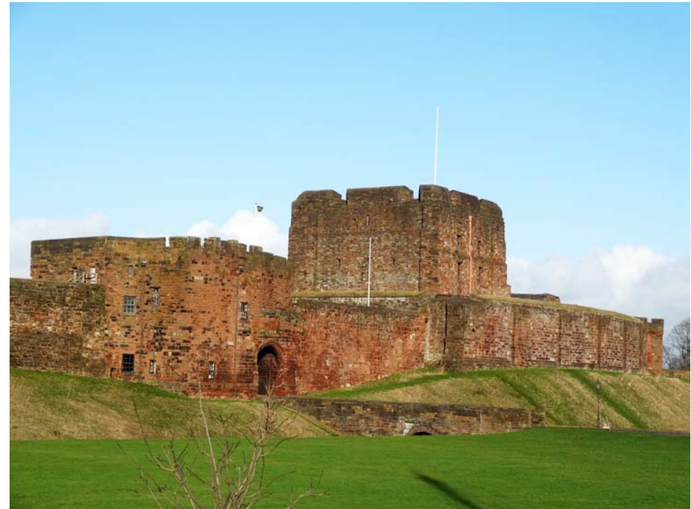
Guarding the Eden crossing, Carlisle Castle was built in red sandstone, the dominant building material across the area.

Today, recreation remains an important part of the rural economy with the (partly overlapping) AONB, World Heritage Site and various nature conservation designations, and their associated nature reserves, as well as National Trails, encapsulating a landscape rich in environmental assets that are popular with those seeking quiet recreation. To these can be added coastal links golf courses, other areas of historical heritage and open access areas enjoyed by local residents and visitors alike.