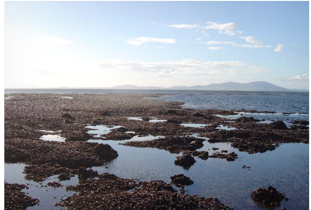
The shellfish beds of the outer Solway are important both for the industry and wildlife alike.