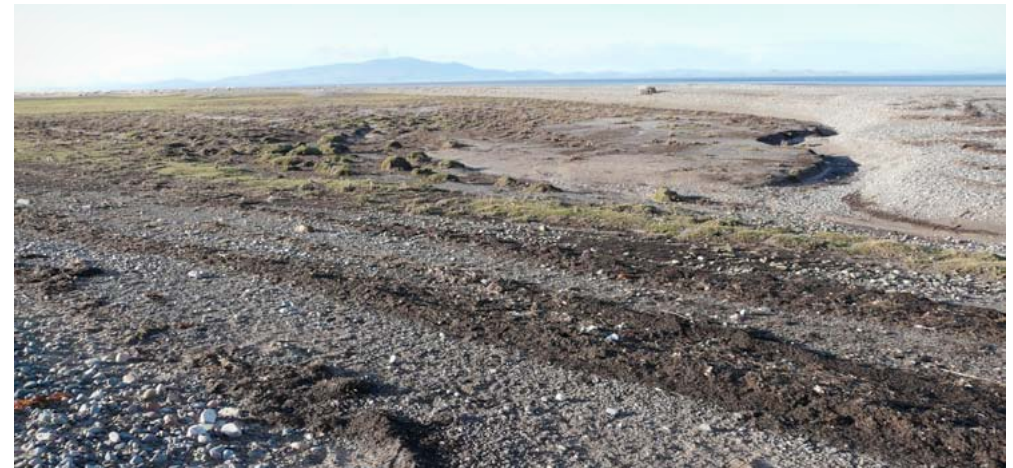
The Solway coastline continues to evolve in response to tidal processes as here at Grune Point.

the coastal road. Further north coastal defences have been strengthened at Skinburness. Grune Point, the northernmost point on the outer Solway, continues to realign in response to modification of sediment supply with erosion of the western shore and deposition on the east.