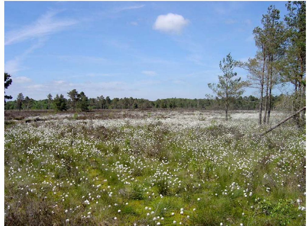
Protecting and restoring peat bogs supports unique wildlife, protects archaeology and stores carbon.

In the future, climate change and its associated impacts on sea levels and weather patterns are likely to have an even greater effect on this low-lying area at the head of the Irish Sea; adaption to these challenges will be a driver for future management.