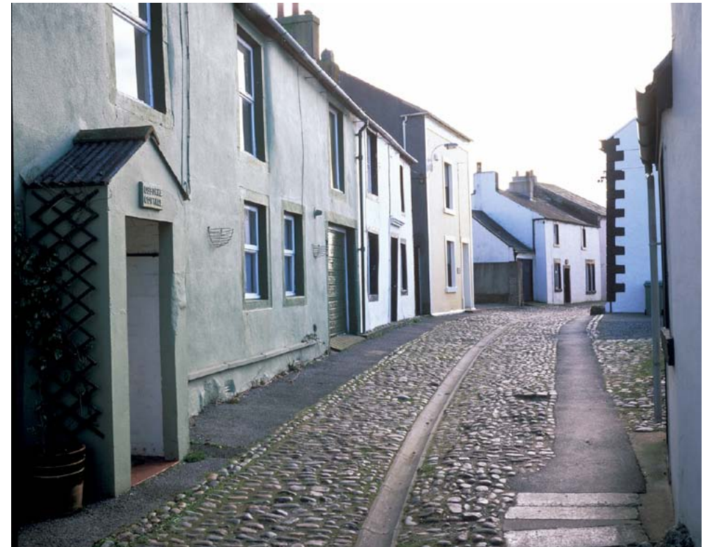
Allonby on the outer Solway Coast. Vernacular settlement style varies across the NCA in response to local resources.