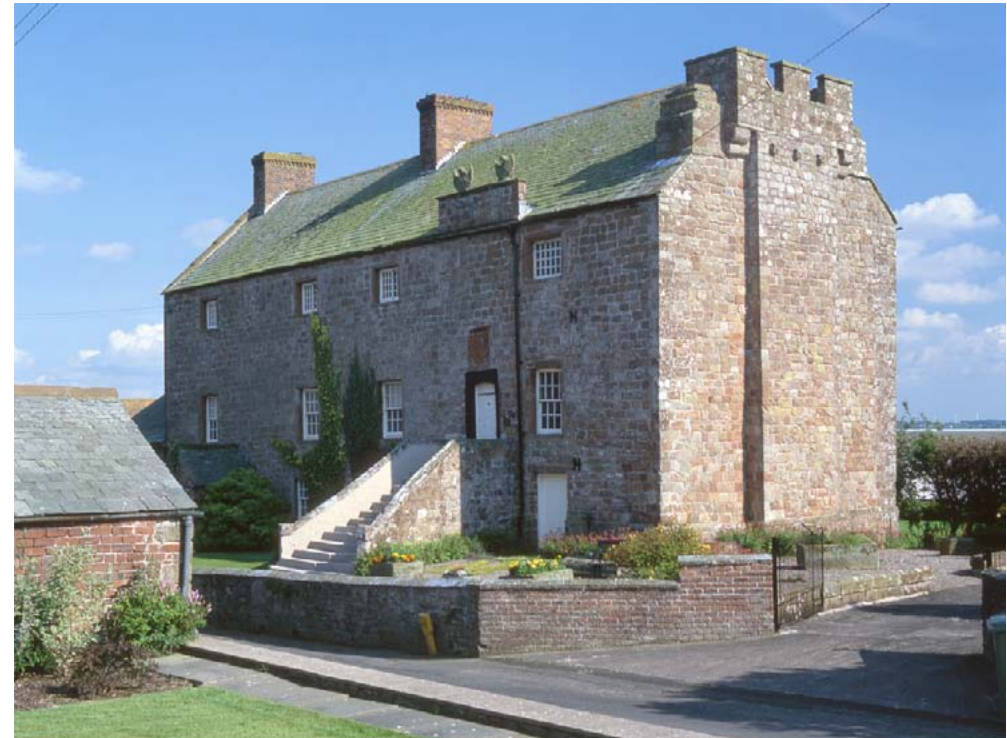
Through the Middle Ages many farmhouses were built as fortified structures to guard against attack, as here at Drumburgh.

The modern agricultural landscape includes sheep and cattle that wander freely on the unenclosed salt marshes, regulated by 'marsh committees' and managed under a stinted system (restricting the number of animals) that dates back to the 16th century. Inland, the enclosed land lies mainly in holdings of 20–40 ha and is dominated by land that has been improved for agriculture by drainage, fertilising and reseeded. Arable cultivation is found on the better-drained land, particularly over the low hills. Recent years have seen further significant changes with the shift from hay to silage production and the introduction of maize as a fodder crop. As well as the agricultural economy, the area is popular with visitors seeking the open-air recreation afforded by the area's wildlife, coastal AONB landscape, golf courses and Hadrian's Wall.