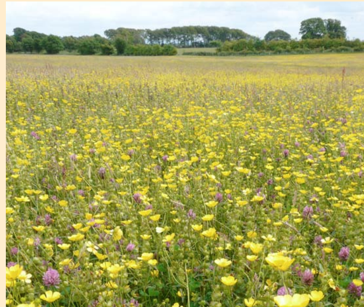
Scattered across the Solway Basin are a suite of restored hay meadows, reminders of formerly common agricultural systems and an important resource for wildlife.