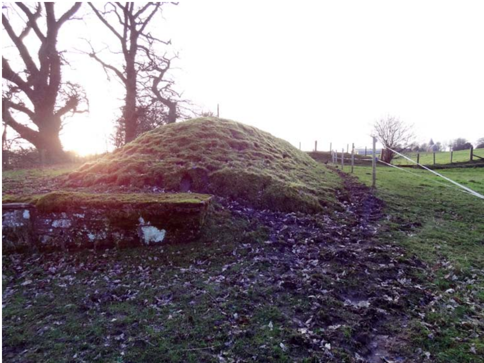
Protecting archaeological features is an ongoing challenge. Here Hadrian's wall has been turfed to protect it from the elements and livestock.

The decline in prosperity following the Dissolution of the Monasteries from the late 1530s, combined with the ongoing border conflicts and raids, meant that there was little change in the rural landscape until the late 17th century. From this period, and given added impetus by the Napoleonic Wars of the early 19th century, the agricultural economy recovered with an intensification of the cattle trade through the droving of Scottish cattle across the Solway 'waths' (crossing points over the estuary), combined with a new phase of land