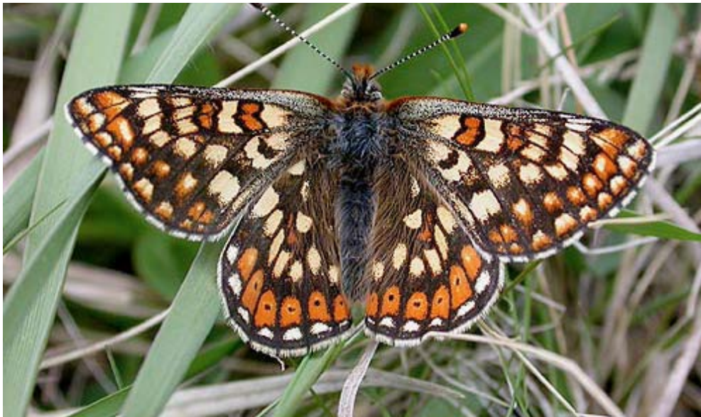
Once extinct in the wild in Cumbria, the marsh fritillary is now restored as part of the Solway landscape.