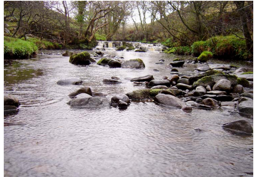
River corridors flanked by ancient and riparian woodlands are a feature of the eastern part of the NCA.

The coastal zone is designated for its landscape quality as the Solway Coast AONB and is internationally important both for the coastal habitats and for the species they support including large numbers of waders and wildfowl, and natterjack toads. The geomorphology of the Solway is also nationally important, as is the sedimentary record of past sea level change.