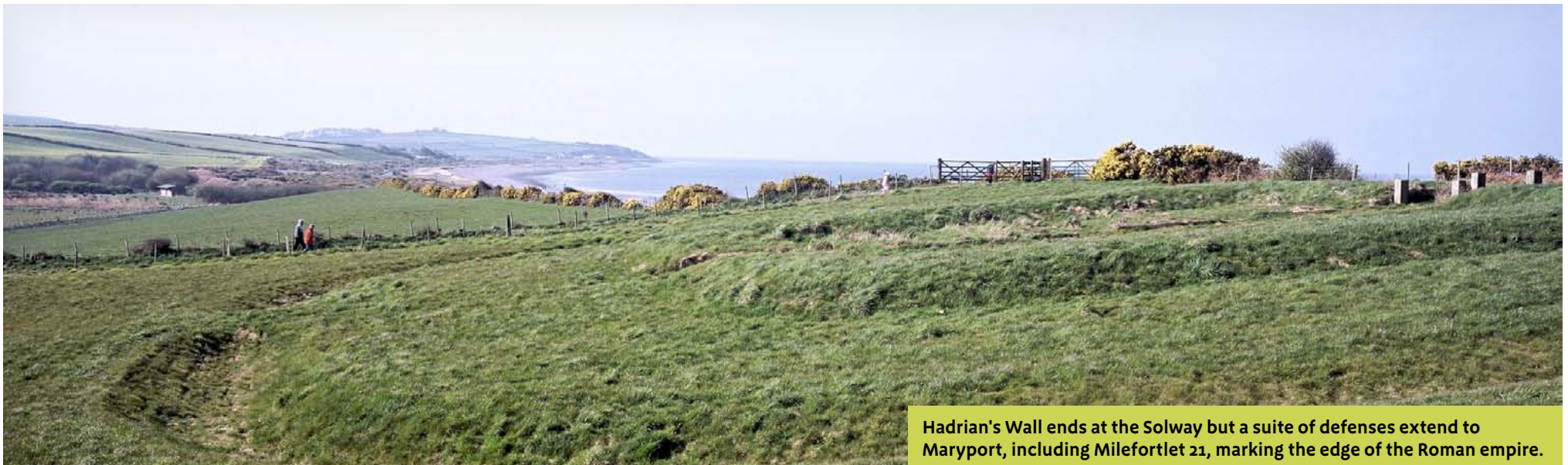
Hadrian's Wall ends at the Solway but a suite of defenses extend to Maryport, including Milefortlet 21, marking the edge of the Roman empire.

streamlined hills and drumlins. The area is also characterised by features formed by glacial erosion and deposition, including melt water channels, moraines and eskers, and the formation of kames, ice-contact deltas (for example, at Holme St Cuthbert) and kettle hole lakes from ice decay at the end of the last ice age. Since the last ice age, climatic amelioration allowed the lower part of the Solway Basin to develop into a network of coastal wetlands formed by the accretion of estuarine material behind the barrier spit running north from Maryport to Grune Point. These coastal wetlands gradually evolved into peat-forming freshwater wetlands, including fens and raised bogs that characterised the landscape of the lower parts of the Solway Basin until they were drained in the Middle Ages. The sediments along the margins of the Solway estuary contain records of past sea level changes and the raised bogs contain an important record of past environmental change.