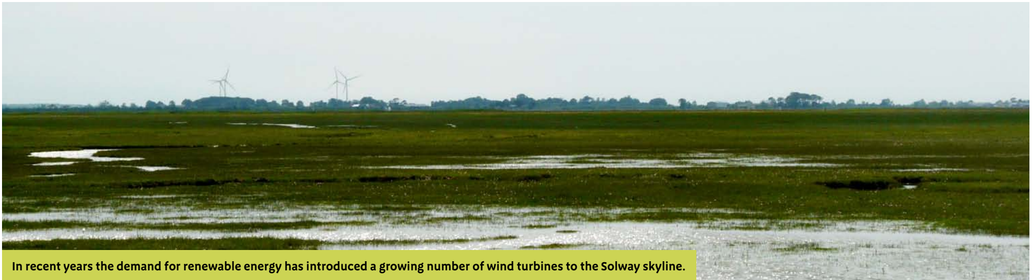
In recent years the demand for renewable energy has introduced a growing number of wind turbines to the Solway skyline.