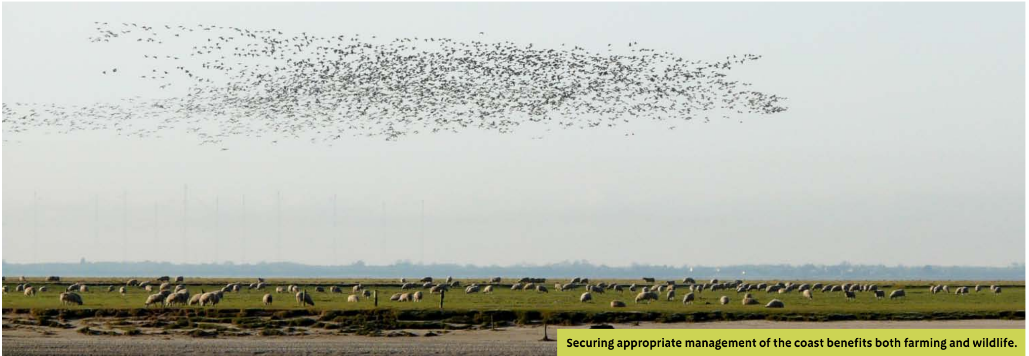
Securing appropriate management of the coast benefits both farming and wildlife.

Biodiversity and geodiversity are crucial in supporting the full range of ecosystem services provided by this landscape. Wildlife and geologically-rich landscapes are also of cultural value and are included in this section of the analysis. This analysis shows the projected impact of Statements of Environmental Opportunity on the value of nominated ecosystem services within this landscape.