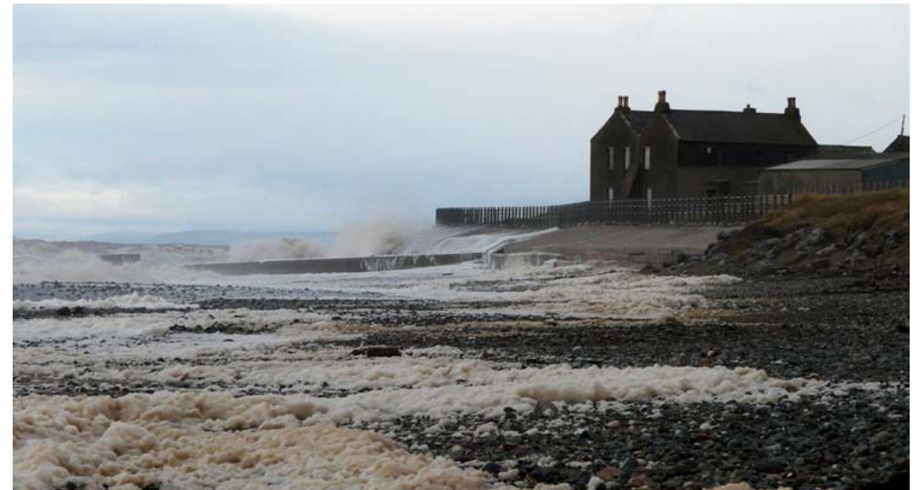
Climate change with its projected impacts on sea level and storminess will continue to drive change along the Solway Coast.