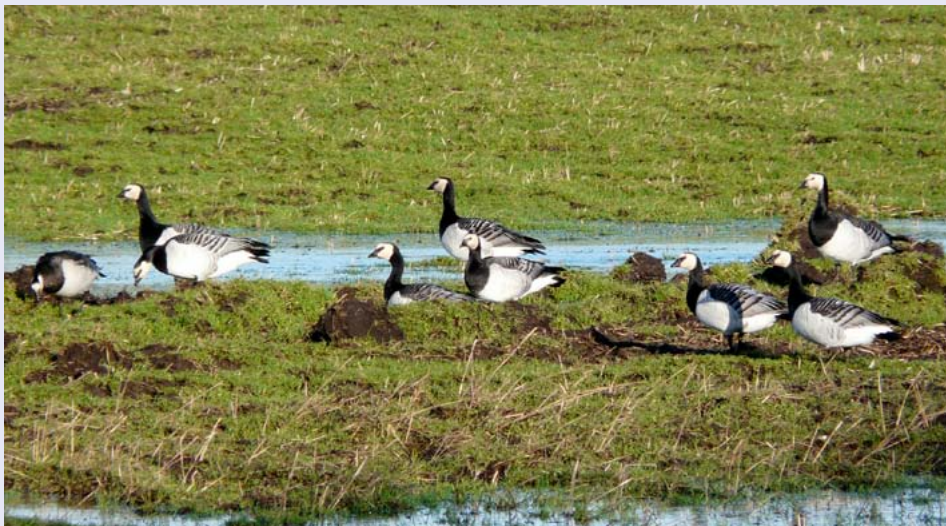
The entire Svalbard-breeding population of barnacle geese winters on the Solway.