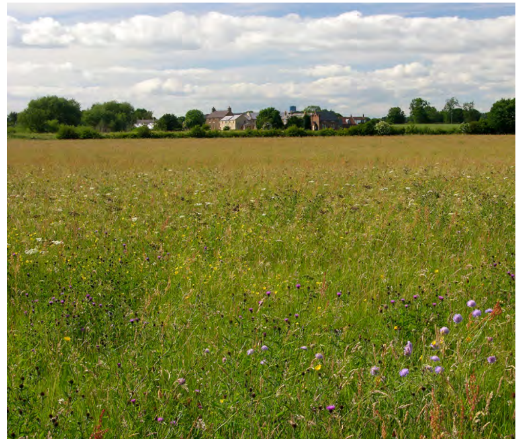
Patches of semi-natural habitat remain within the more intensely managed arable areas of the NCA and are important to provide a network for species movement.

Biodiversity and geodiversity are crucial in supporting the full range of ecosystem services provided by this landscape. Wildlife and geologically-rich landscapes are also of cultural value and are included in this section of the analysis. This analysis shows the projected impact of Statements of Environmental Opportunity on the value of nominated ecosystem services within this landscape.