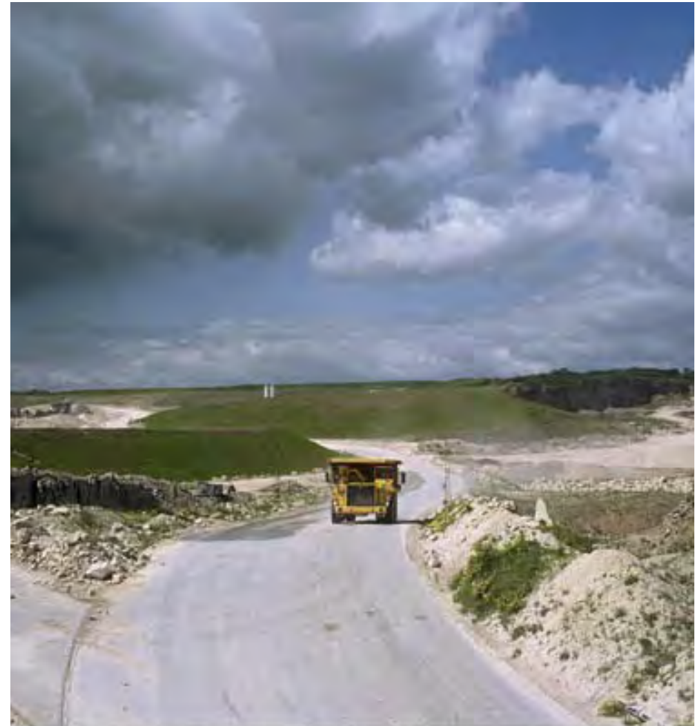
Limestone quarrying in central and southern areas has local impacts on the landscape but can also provide opportunities through restoration of sites after use.

North of Wetherby the Magnesian Limestone is largely covered with glacial deposits from the last glaciations. South of Wetherby the Magnesian Limestone has only a thin local cover of glacial deposits. The soils here are derived from the limestones and, locally, their associated red clays. They are generally very fertile and often support agricultural land classified as Grade 2 in quality.