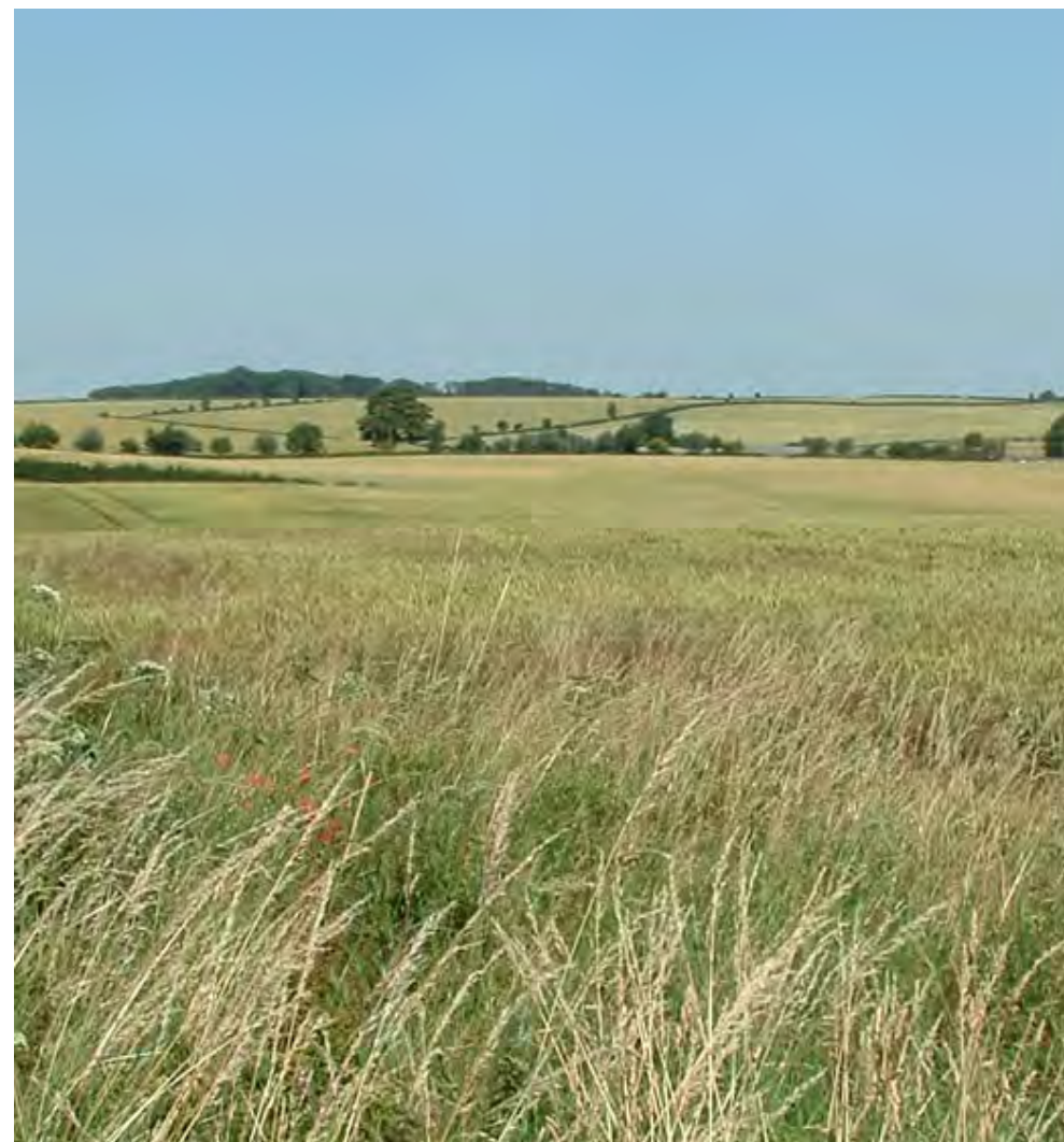
The low limestone ridge runs north-south through the NCA which is of an open, farmed character with few hedgerow trees.