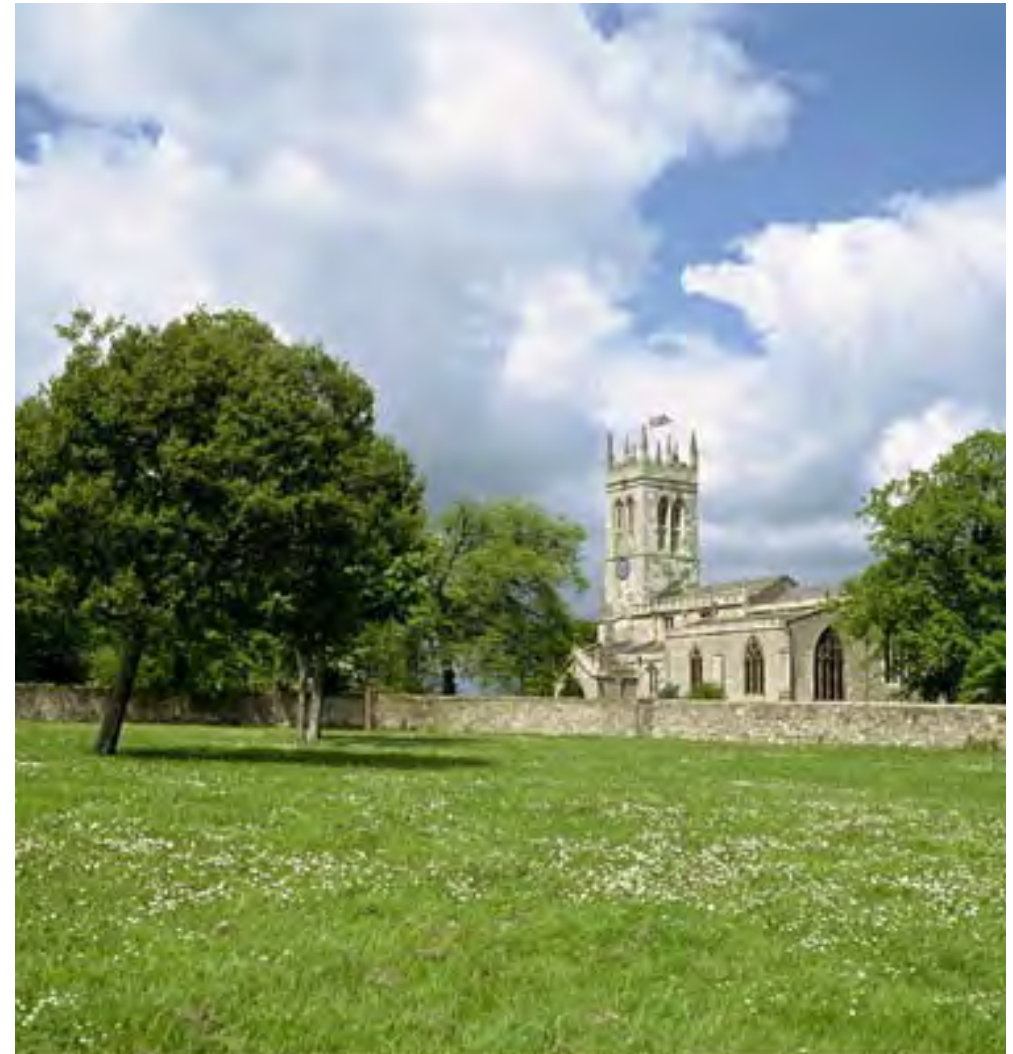
Limestone has traditionally been used as a building material throughout the NCA providing a link to the local geology.

In the past there have been significant economic links between the fertile farmland on the ridge and the industrial areas to the west.