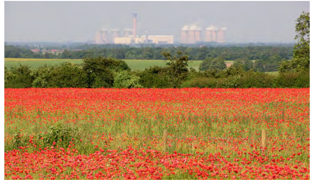
There are some large wooded areas within the NCA giving some places a well wooded feeling within the more open landscape.

There is evidence that, from the Iron Age to well after the end of the Roman occupation, there was increased agricultural exploitation of the area with the use of ditches and banks to define settlements, stock pens, fields and tracks. In this period, the landscape had probably been cleared of much woodland and was occupied by single, quite widely spaced farmsteads with their associated field systems and ditched trackways leading outwards to the open pastures and woodland. Examples of important defensible hill forts remain from this period at Barwick in Elmet in the central section and Markland Grips in the south.