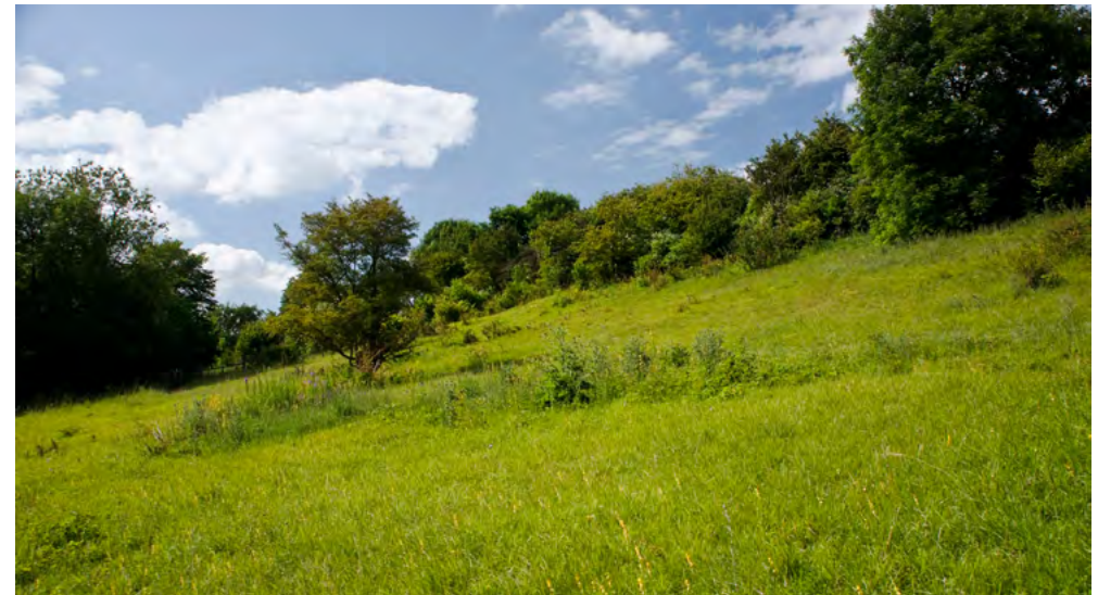
Hetchell Woods provides a refuge for species of lowland calcareous grassland habitat and a mosaic of grassland, woodland and wetter habitats.

The designed parklands and gardens, supported by estates, are a major influence on the landscape. With their extensive areas of woodlands, plantations and game coverts, in places they give the feel of a well-wooded landscape. The estates include early monastic abbeys such as Fountains Abbey and Newstead Abbey, and later, country houses established with the wealth generated from the industrialisation of the coalfield to the west. Designed parklands include the internationally renowned gardens at Studley Royal, along with Newby Hall, Bramham Park, Lotherton Hall, Brodsworth Park, Hardwick Hall and Annesley Hall. Fountains Abbey is part of the Studley Royal and Fountains Abbey World Heritage Site and provides outstanding value to the area through the designed landscape and associated Cistercian abbey.