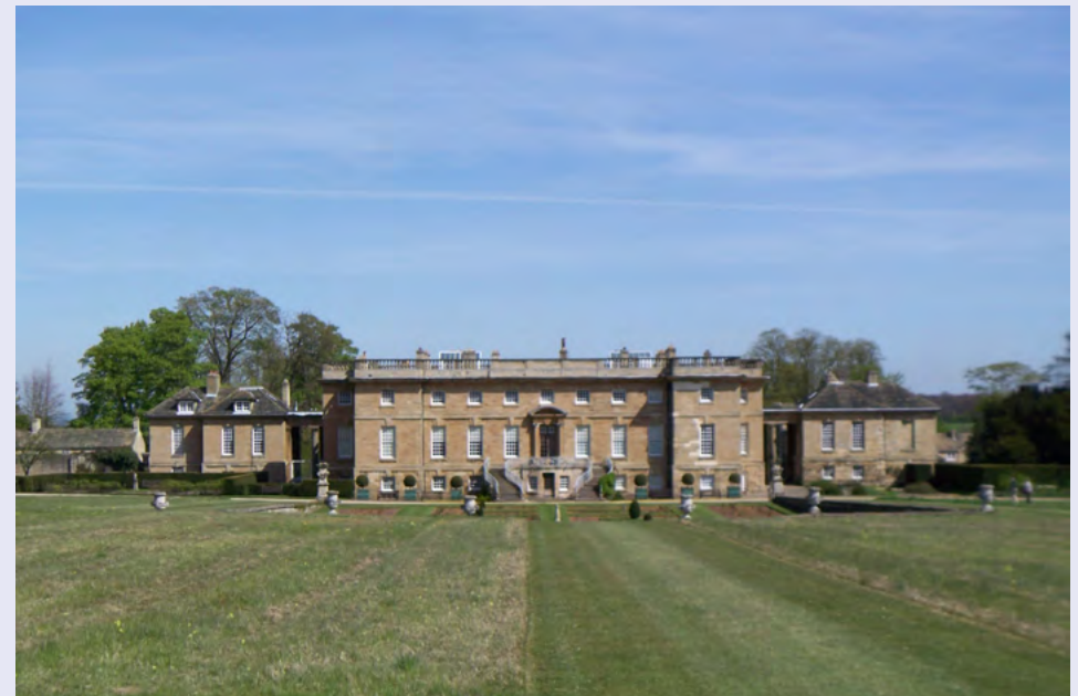
Bramham Park is one of a number of large country houses that have designed gardens and parklands.