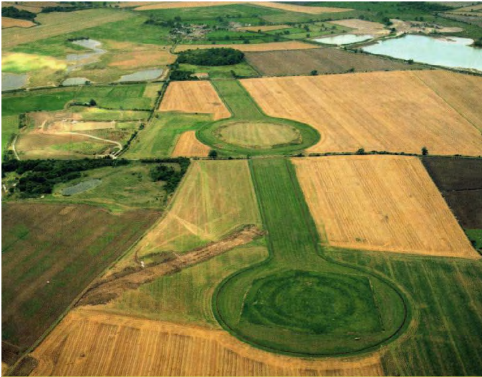
The three henges at Thornborough are of national importance and form part of a complex Neolithic and bronze-age ceremonial landscape.

Managing and maintaining these key landscape characteristics will be important in retaining the 'essence' of the Southern Magnesian Limestone NCA. There is a need to promote sustainable agriculture and appropriate hedgerow and woodland management and planting. Appropriate habitat enhancement and links are fundamental to this, along with guiding suitable development and appropriate mitigation of the impacts of changes to the landscape.