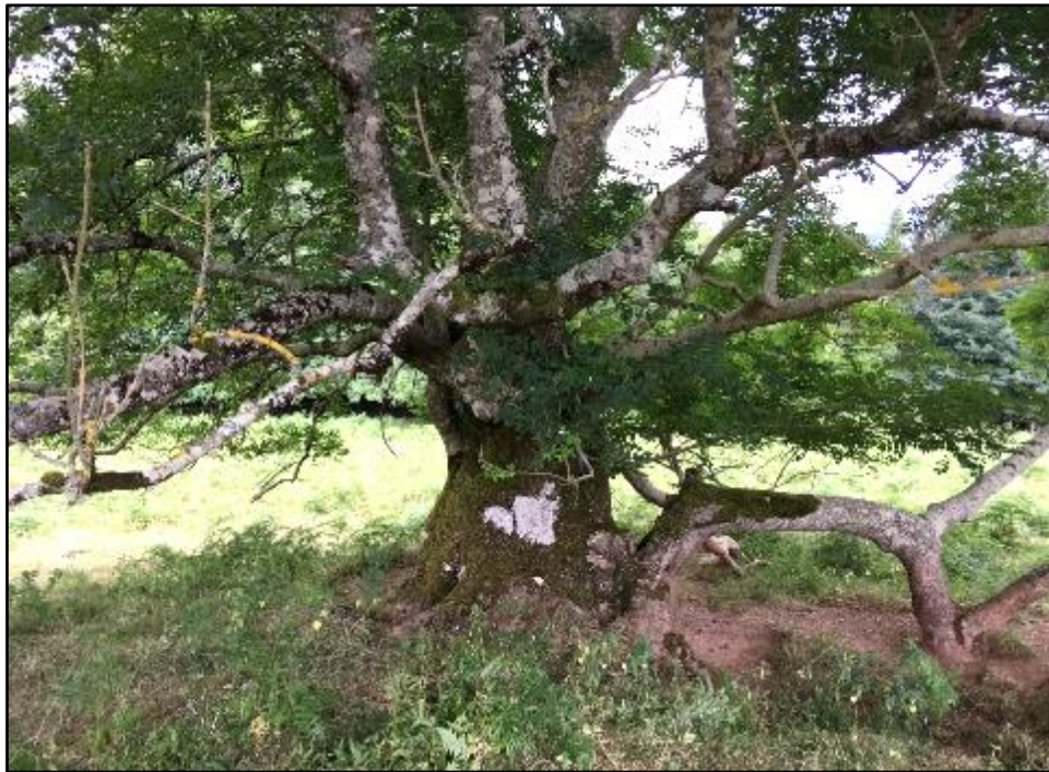
Veteran ash pollard

The lower northern strip of the pasture and some of the eastern slopes contain an abundance of Pteridium aquilinum (Bracken) but at the time of survey this appeared to have been recently bruised and/or crushed in an attempt to control its spread. It was apparent that the U4 grassland community persists in this area and the findings from the mycological surveys also confirm this. Within the central part of the lower slope there is a fine solitary veteran ash tree which displays evidence of former pollarding.