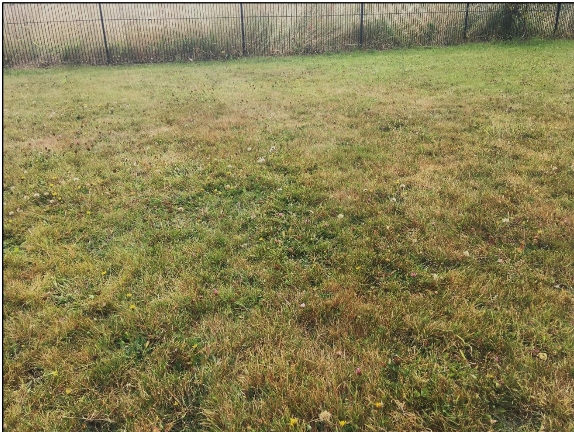
View of Croquet Lawn at Nettlecombe Court. July 2018

The series of formal lawns and adjacent churchyard at Nettlecombe Court were also seen to be highly representative of rich CHEGD fungi localities. Old unfertilised lawns such as these are essentially relict ancient semi-natural grasslands and can sometimes support nationally-important numbers of waxcap species. The lawns at Nettlecombe have produced a remarkable total of 23 waxcap species which is one of the highest counts in England for a site of this small size. Typically the lawn sward has a high content of moss and fine grasses and as described above was seen to be reasonably herb-rich. The lawns vary somewhat in quality, the Croquet Lawn being the richest mycologically was also seen to have the highest herb content whilst the larger circular lawn in front of the Field Studies Centre contains a greater component of Lolium perenne and has produced fewer fungal records of note. It should be noted however that this amenity lawn is heavily used for recreation by visitors to the centre and is therefore more prone to trampling and sward compaction.