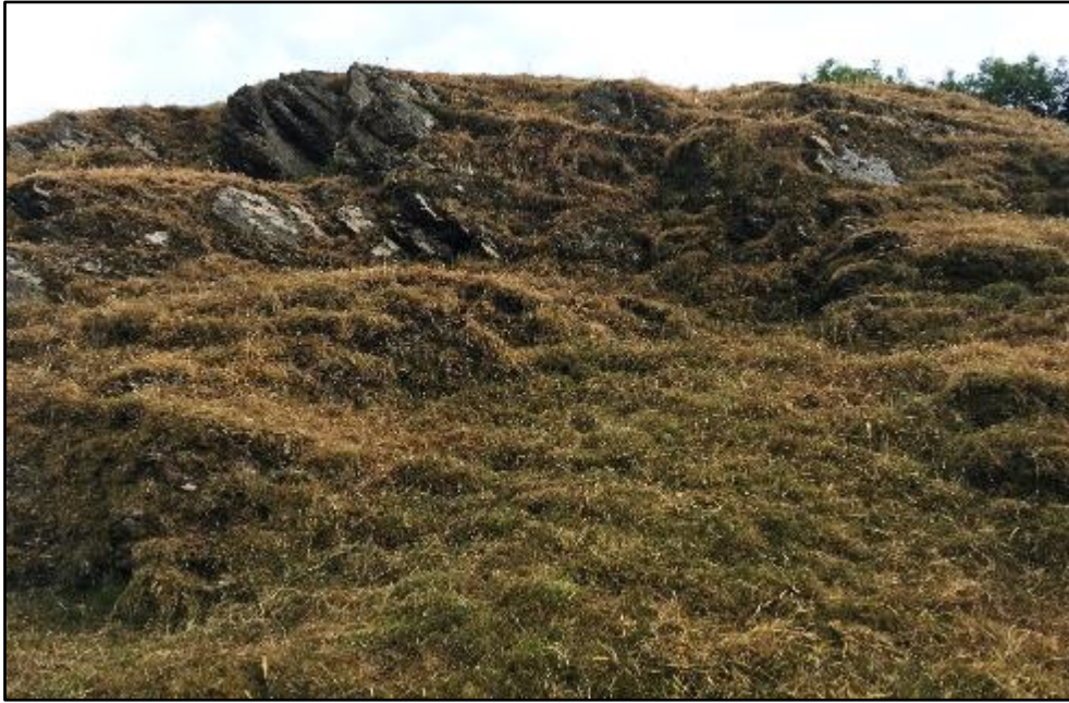
Rock exposures in south western corner of field

The lower northern strip of the pasture and some of the eastern slopes contain an abundance of Pteridium aquilinum (Bracken) but at the time of survey this appeared to have been recently bruised and/or crushed in an attempt to control its spread. It was apparent that the U4 grassland community persists in this area and the findings from the mycological surveys also confirm this. Within the central part of the lower slope there is a fine solitary veteran ash tree which displays evidence of former pollarding.