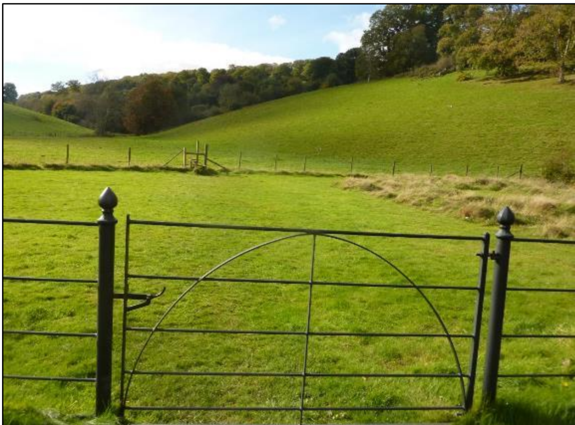
Nettlecombe Court Slope. October 2017.

At Court Slope all fungal records were made during the 2017 survey when the sward was still short enough to produce fruiting bodies. On that visit it was evident that the grassland was developing a more coarse character but the photograph below taken in October 2017 still contrasts strongly with those shown above.