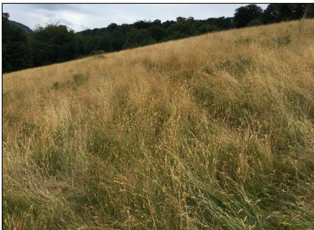
Nettlecombe Court Slope. July 2018

In July 2018 the Court Slope was found to contain a rather tall and increasingly coarse grass-dominated sward and it was evident that there had been no recent livestock grazing here. Holcus lanatus (Yorkshire Fog) was frequent across the slope and both Dactylis glomerata (Cocksfoot) and Taraxacum officinale agg. (Dandelion) were occasional throughout. The key community indicator species for U4 acidic grassland – Festuca ovina , Agrostis capillaris , Anthoxanthum odoratum and the moss Rhytidiadelphus squarrosus still formed the bulk of the vegetation but low-growing forbs such as Potentilla erecta and Galium saxatile were not recorded. Both Achillea millefolium (Yarrow) and Trifolium repens (White Clover) were however widely present and further added to the somewhat mesotrophic character of the grassland.