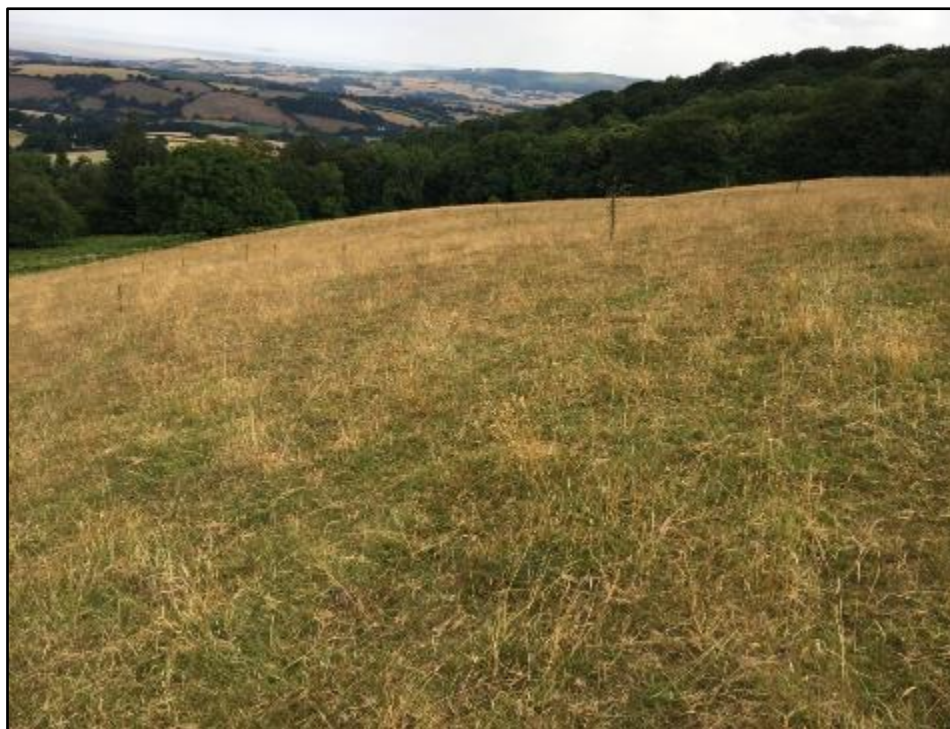
Old Weather Station Field. July 2018

Apart from a small area of semi-improved even ground adjacent to the weather station at the top of the field, the vast majority of vegetation within this pasture conforms to the NVC community U4: Festuca ovina - Agrostis capillaris - Galium saxatile grassland . This habitat type is the principal semi-natural acidic grassland community within the cooler and damper parts of the UK and is particularly frequent in and around the upland fringe. It is often well-grazed and frequently occurs in association with heathland habitats from which it is sometimes evidently derived. In addition to Agrostis capillaris (Common Bent) and Festuca ovina (Sheep's Fescue) or F. rubra (Red Fescue) the most frequent associated forbs are usually Galium saxatile (Heath Bedstraw) and Potentilla erecta (Tormentil). The pleurocarpous moss Rhytidiadelphus squarrosus is nearly always present and often abundant within the sward, frequently growing with Pseudoscleropodium purum .