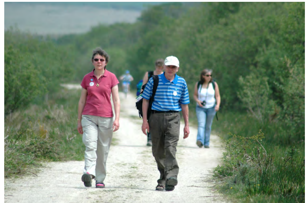
Walkers on the line of the old A30 across Goss Moor National Nature Reserve.

The A30 road once ran through the middle of Goss Moor but single lane sections caused a major bottleneck in the county. In late 2004 it was re-routed and widened, the dual carriageway running around Goss Moor being opened in 2007. Much of the previous road has now been converted to a cycle lane which opened in 2008.