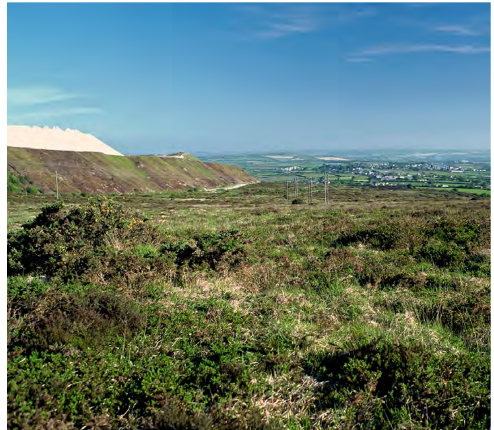
Heathland alongside china clay tips.

Biodiversity and geodiversity are crucial in supporting the full range of ecosystem services provided by this landscape. Wildlife and geologically-rich landscapes are also of cultural value and are included in this section of the analysis. This analysis shows the projected impact of Statements of Environmental Opportunity on the value of nominated ecosystem services within this landscape.