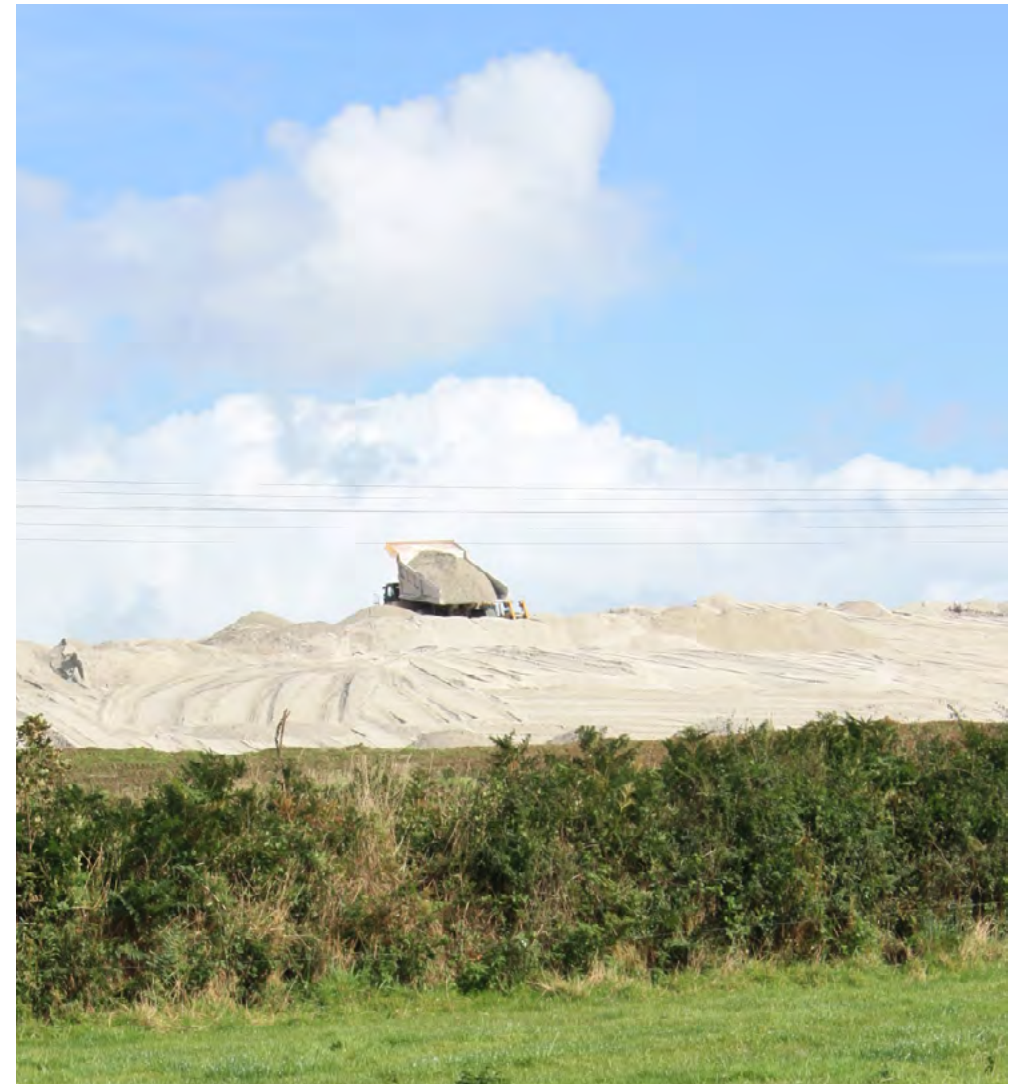
China clay waste heap being developed adjacent to agricultural land.