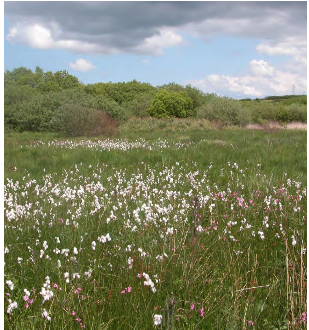
Important grassland habitat on Goss Moor National Nature Reserve.