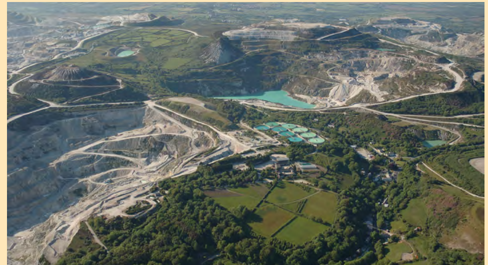
Carthew Clay Pit.