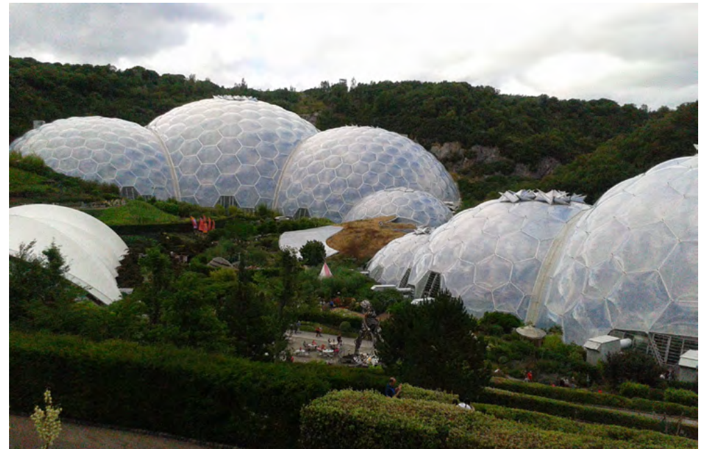
The Eden Project - located in a redundant china clay pit.

Since the 1990s the area has been developing as a visitor destination owing to the development of Wheal Martyn, Luxulyan Valley and the Eden Project in a disused clay pit. Eden attracts over 1 million visitors a year. This, combined with a more holistic approach to the management of redundant mine workings, has led to the development of cycle ways and recreation routes. The visitors who are initially drawn in by the Eden Project often go on to visit other attractions such as the China Clay Museum at Wheal Martyn. Regeneration of the area can also be seen in examples such as the conversion of china clay 'dries' to self-catering cottages at Carbis Wharf. These developments have injected significant income and generated respect for a historically poor and deprived area.