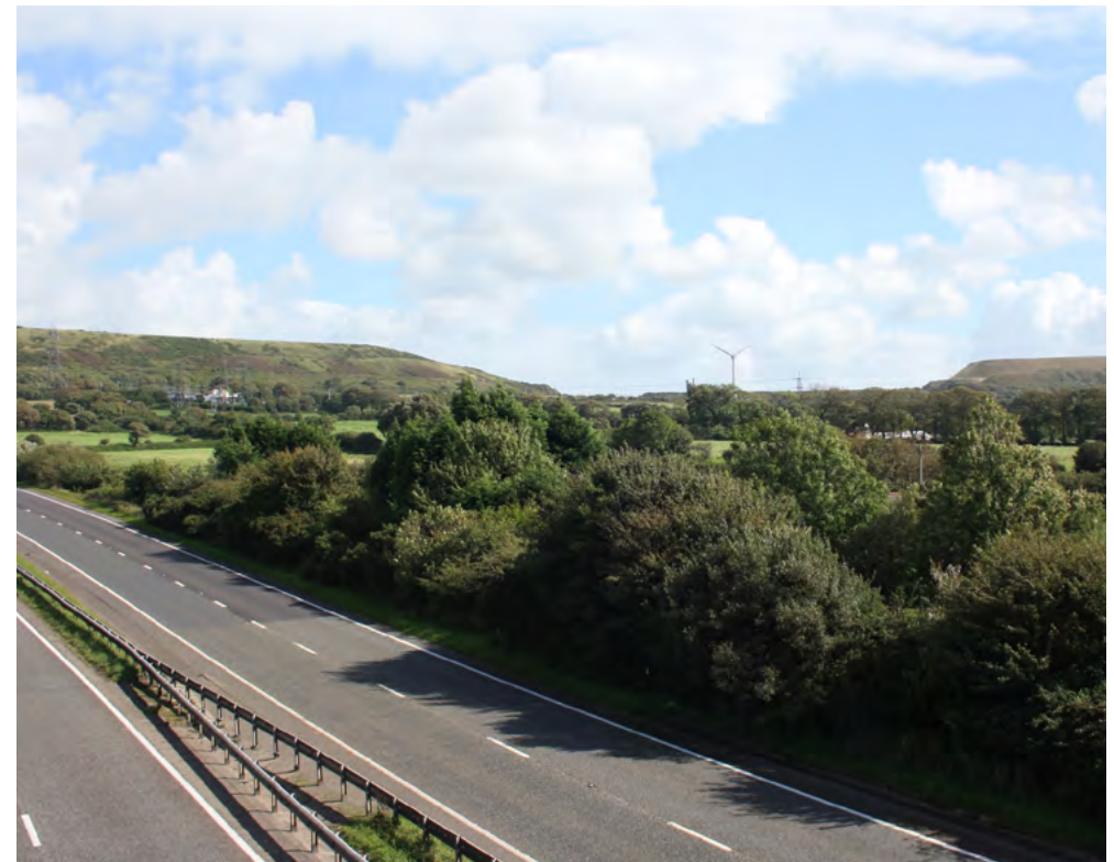
Typical view of Hensbarrow NCA from the A30.

Links to the surrounding countryside are also emphasised through the settlement pattern of farmsteads connected to the areas of lowland moor by trackways, enabling grazing of livestock in the summer on the moor and in the winter on the lower valley pastures.