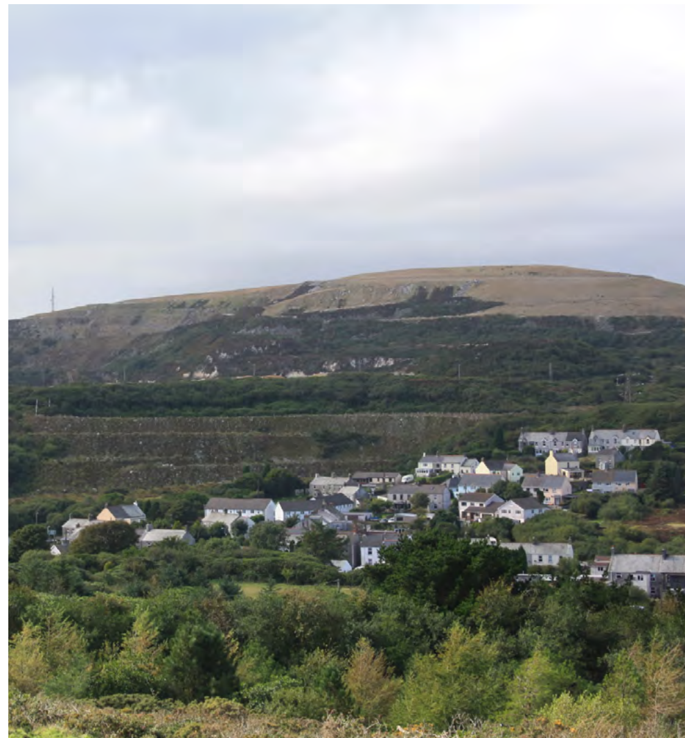
Typical village of Stenalees nestled under the clay tips.