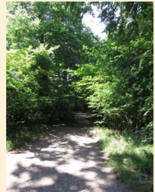
Icknield Way, prehistoric routeway as seen today.