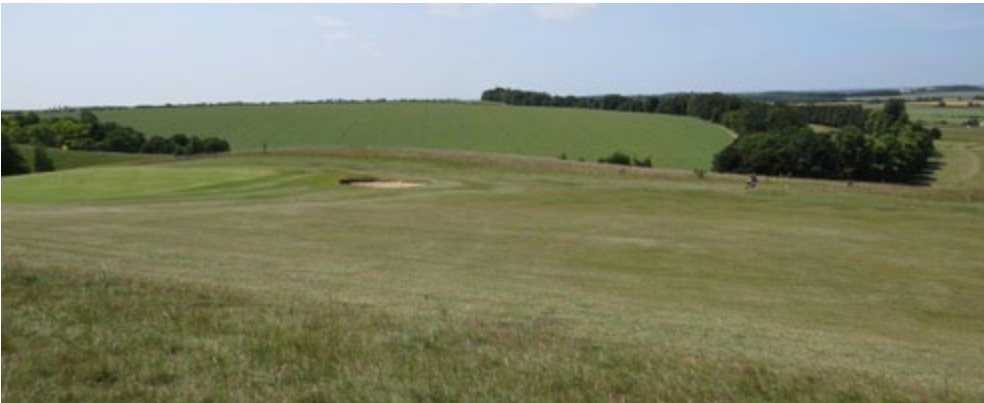
Golf course on Therfield Heath with good biodiverse grassland.