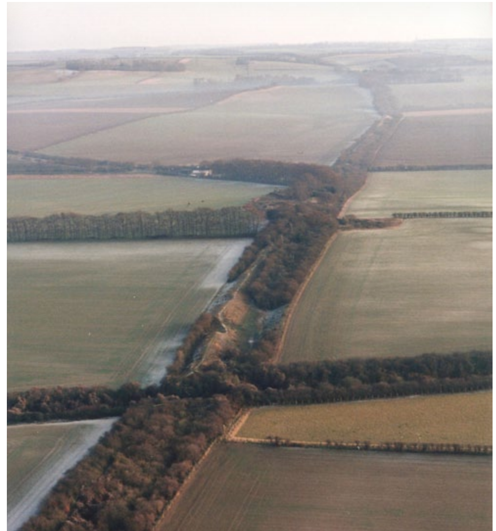
Fleam dyke, one of the four ancient defensive earthworks preventing access to East Anglia.

The NCA has experienced dramatic land use changes in past and recent times. These changes have influenced the present nature, location and extent of the wildlife resource. There is recognition of the importance of the remnant habitats, sometimes confined to roadside verges; the small scale of these sites makes management - and therefore maintenance of biodiversity value - very difficult.