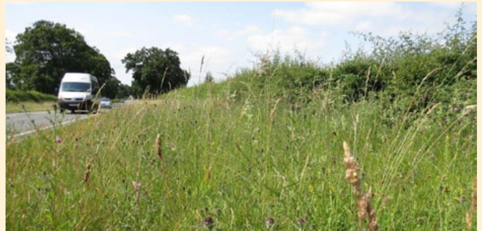
Chalk grassland roadside verge with remnant grassland flora.