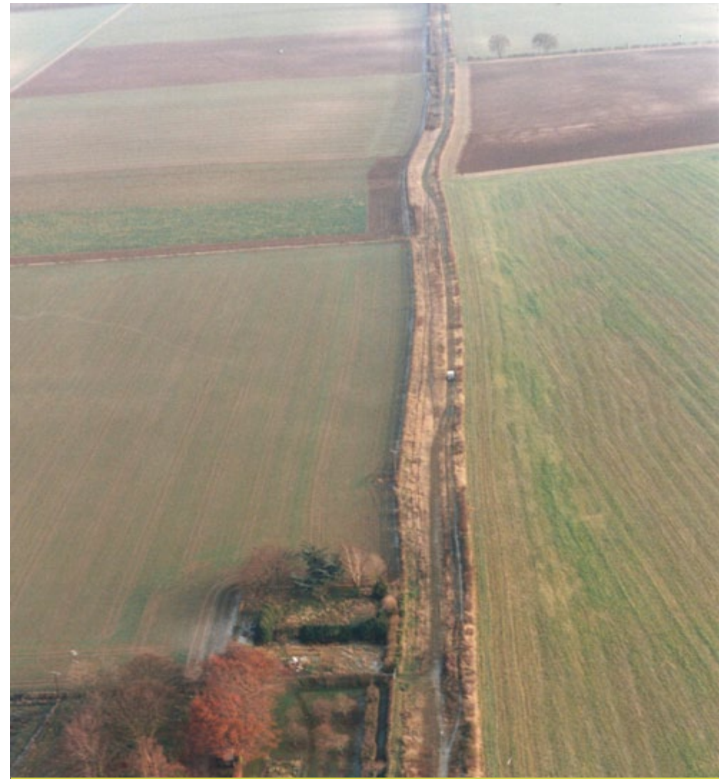
Worsted Street, Roman road, clearly seen from an aerial photograph.