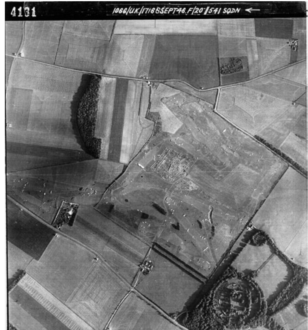
Trees growing on Wandlebury hill fort and surrounding land seen from a 1946 aerial photograph.

Spring-fed prehistoric settlements developed on the chalk downs (such as at Ashwell, Melbourn and Steeple Morden), on the terraces of the Cam valley and around exploitation sites where flint nodules used for tool making (for example at Duxford and Thriplow) were exposed in the upper strata of the Chalk. Neolithic and bronze-age ceremonial and funerary monuments are widespread across the Chalk (for instance at Therfield Heath), attesting to their long-term