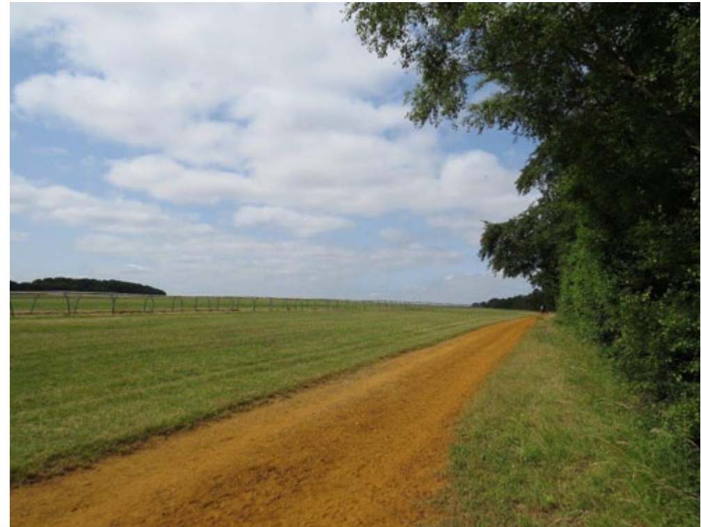
Gallops, near Newmarket showing rectilinear field pattern, enclosed by tall hedges and currently species-poor grassland.

The chalkland landscape is united with the rest of the East Anglian NCAs as a major food producer, with arable farming being the predominant land use. The smooth, rolling chalkland hills are dissected by the two gentle valleys of the rivers Granta and Rhee, which converge flowing westward into the River Cam just south of Cambridge. The Rhee begins at Ashwell Springs in Hertfordshire, running north then east 19 km through the farmland of southern Cambridgeshire. The longer tributary, the Granta, starts in Essex and flows north into the East Anglian Chalk NCA near Saffron Walden. The underlying chalk aquifer provides functional links between these areas and the population of East Anglia, whose water the aquifer supplies.