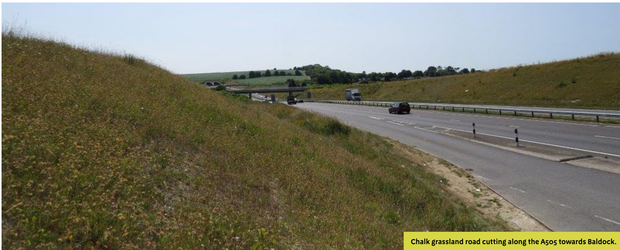
Chalk grassland road cutting along the A505 towards Baldock.