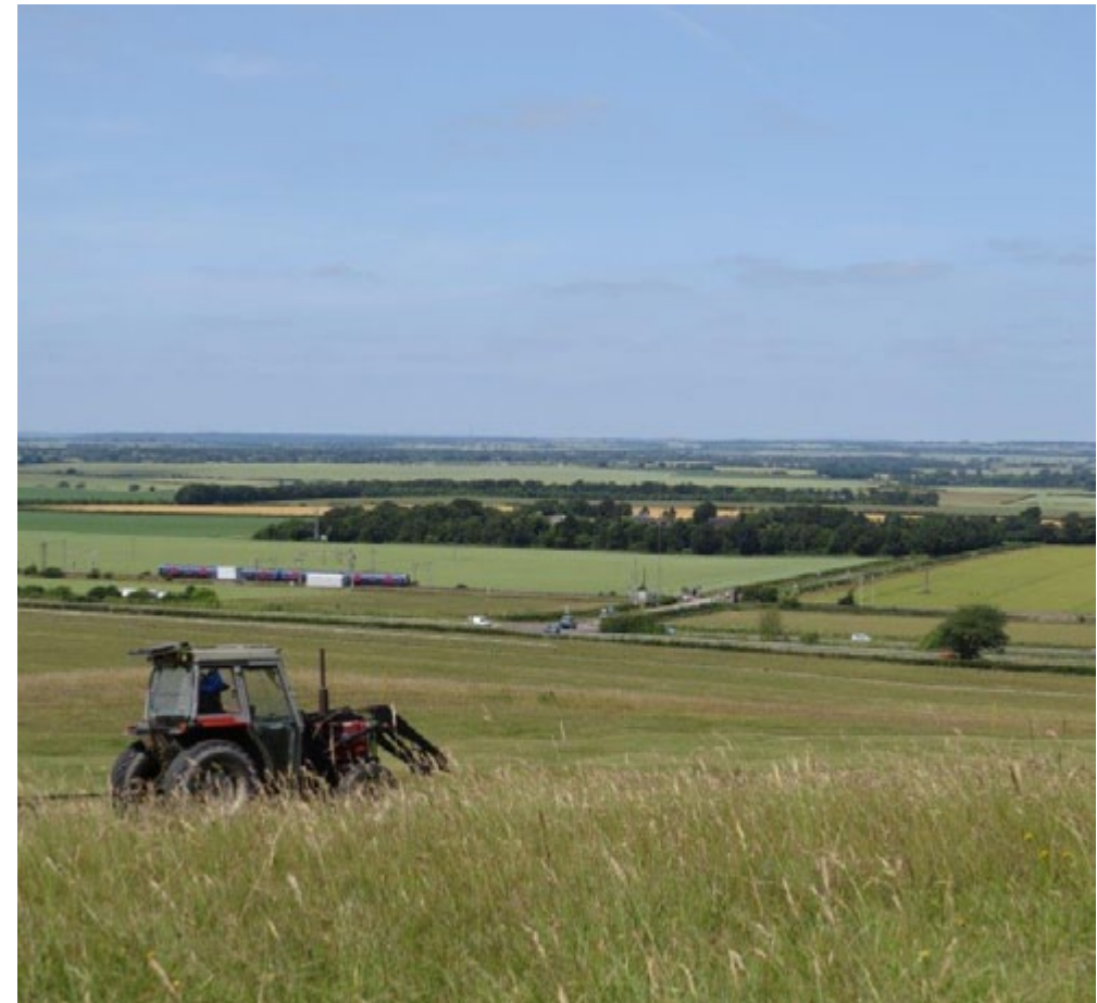
Looking towards Cambridgeshire claylands and modern transport routes from Therfield Heath.