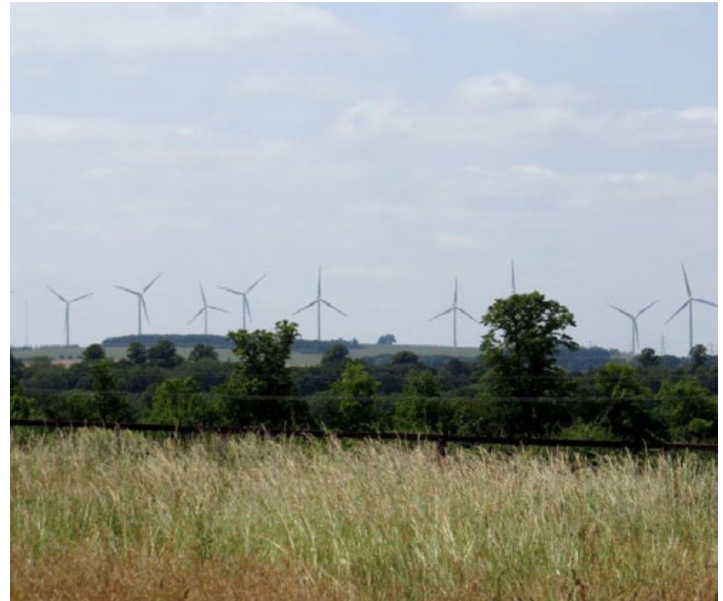
Wadrow wind farm, north of Balsham, is a prominent feature in the landscape.