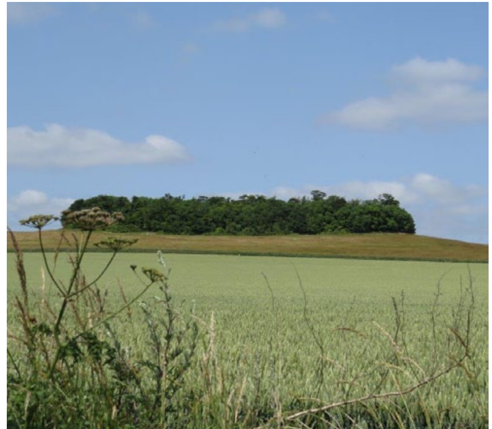
Beech hanger on top of a hill, surrounded by arable fields, near Dullingham.

Biodiversity and geodiversity are crucial in supporting the full range of ecosystem services provided by this landscape. Wildlife and geologically-rich landscapes are also of cultural value and are included in this section of the analysis. This analysis shows the projected impact of Statements of Environmental Opportunity on the value of nominated ecosystem services within this landscape.