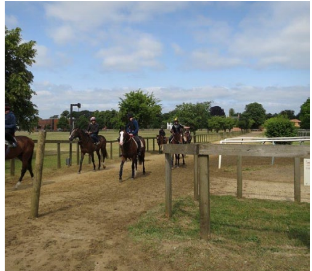
Racehorses setting off for morning exercise near Newmarket.

Arable farming, as well as sheep grazing, have been significant since the prehistoric period; their importance has ebbed and flowed, as in the other chalk and limestone plateaux and downs of southern England. The smooth, rolling chalkland hills were historically grazed by sheep but the land use is now dominated by large-scale cereal production. The large fields are enclosed with low thorn, and characterised by often 'gappy' hedgerows and few trees. There is very little grazing pasture or livestock except within the small river valleys. Medieval deserted settlements testify to the shrinkage of arable cultivation after the 14th century, and there is an abundance of archaeological sites dating from the Neolithic Period. Also prominent are Anglo-Saxon linear dykes (Devil's Dyke,