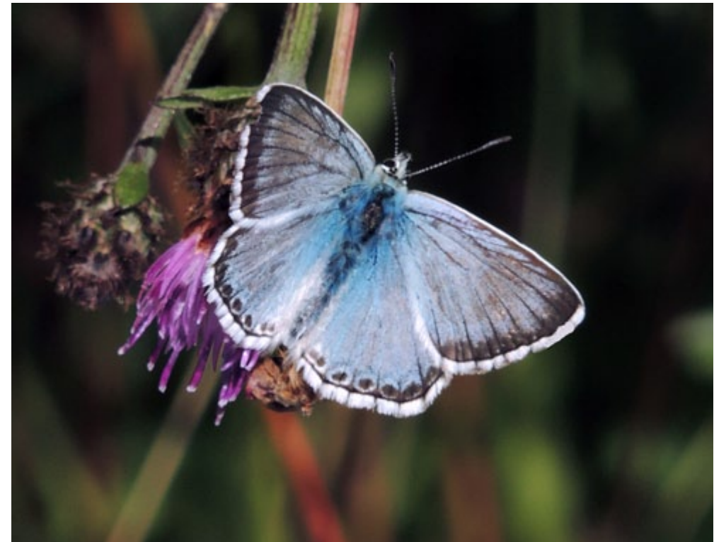
Chalkhill blue butterfly feeding on knapweed, on a small remnant grassland site.