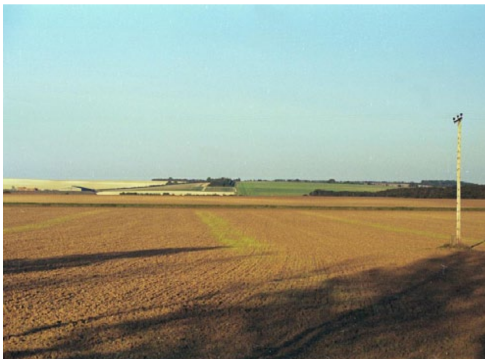
Large-scale arable production: view taken near Newham.

The East Anglian Chalk NCA provides a wide range of benefits to society. Each is derived from the attributes and processes (both natural and cultural features) within the area. These benefits are known collectively as 'ecosystem services'. The predominant services are summarised below. Further information on ecosystem services provided in the East Anglian Chalk NCA is contained in the 'Analysis' section of this document.