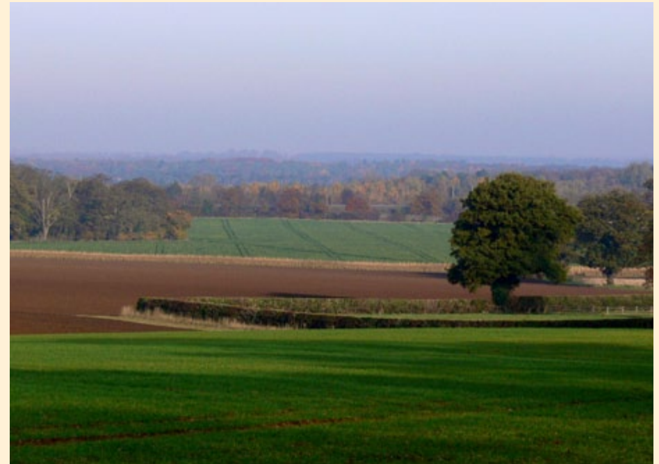
Looking from the open chalk landscape near Gazely towards the more wooded Brecks NCA.