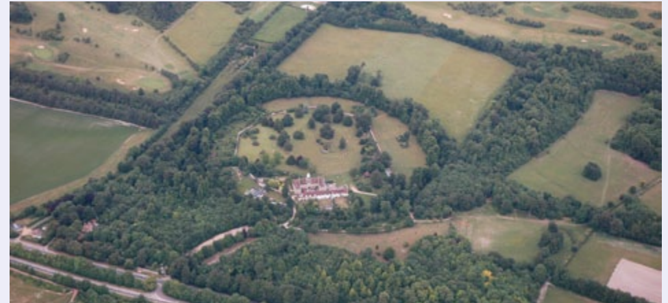
Wandlebury Hill Fort from the air in 1980. The wooded concentric earth bank can be clearly seen.