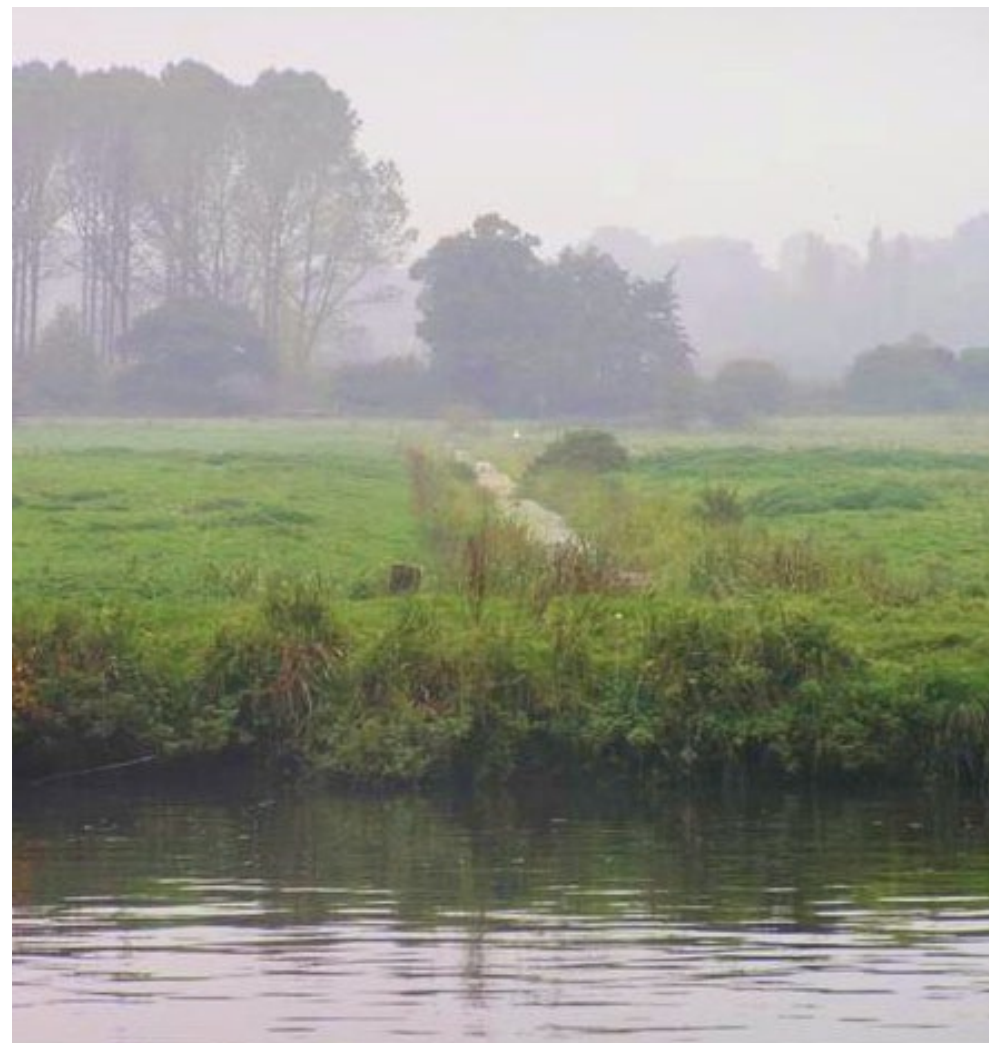
Postwick Marshes in the Yare Valley contain many historical sites including an early Saxon-aged round house.