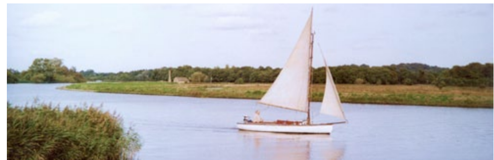
Sailing on the River Yare.