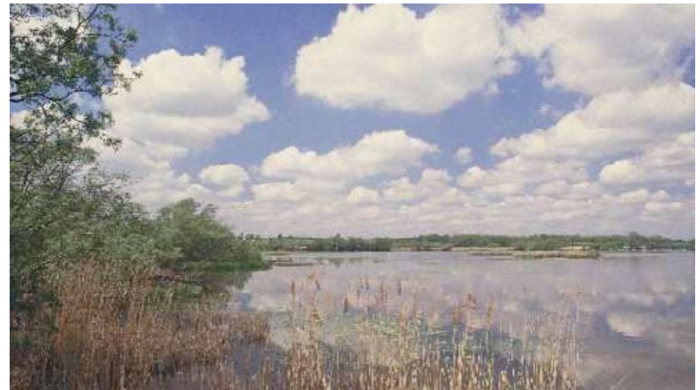
Rockland Broad, Yare Broads and Marshes SSSI.

Modern infrastructure developments are scarce, although overhead lines and pylons gain visual prominence in this open, low landscape. When coastal visibility is clear, the thirty 108-metre-high wind turbines of Scroby Sands, located offshore from Great Yarmouth, can be seen from Horsey and all points south.