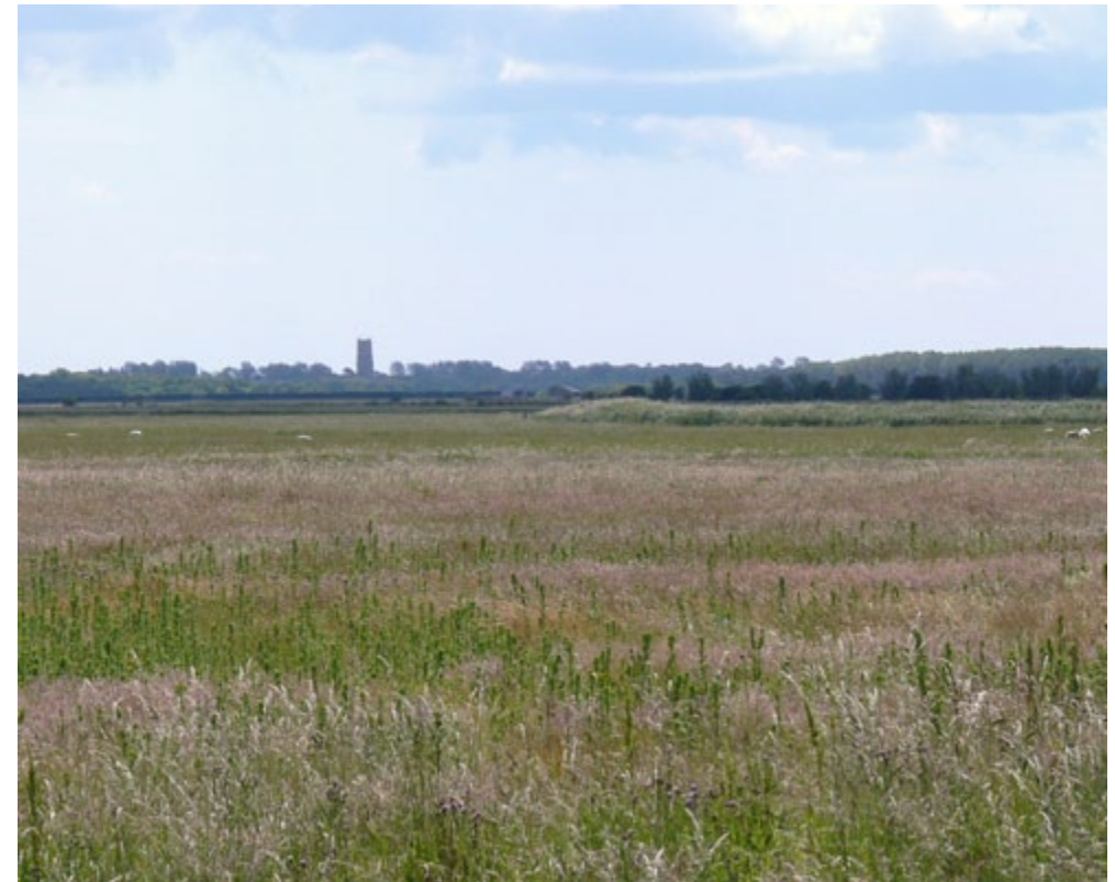
Wetland habitats including remnants of the traditionally wet grassland and grazing marsh.

The arable clay plateau landscape of South Norfolk and High Suffolk Claylands abuts The Broads NCA in the south. Here the Yare and Waveney river valley corridors of riparian vegetation intertwine the two NCAs. A large proportion of the catchments of these two Broadland rivers as well as the catchment of the River Tas are found within this adjacent NCA.