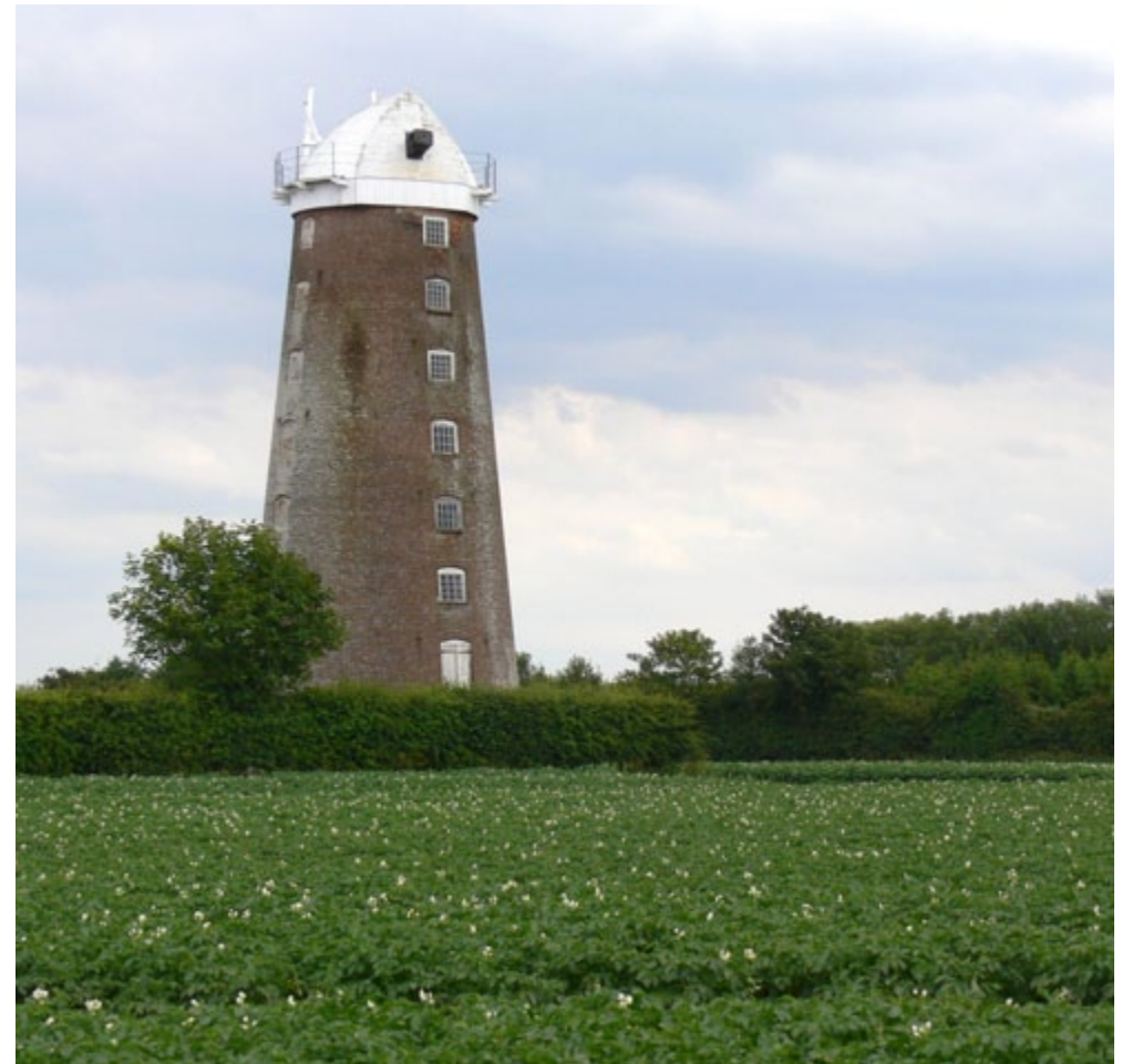
The 18m Hickling Tower Mill built in 1818.

Please note that the following analysis is based upon available data and current understanding of ecosystem services. It does not represent a comprehensive local assessment. Quality and quantity of data for each service is variable locally and many of the services listed are not yet fully researched or understood. Therefore the analysis and opportunities may change upon publication of further evidence and better understanding of the inter-relationship between services at a local level.