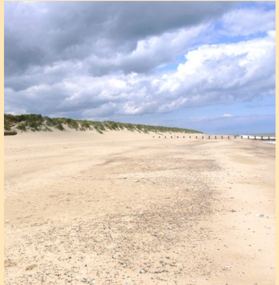
The golden sand shoreline at Waxham with coastal defence structures and backed by dunes.