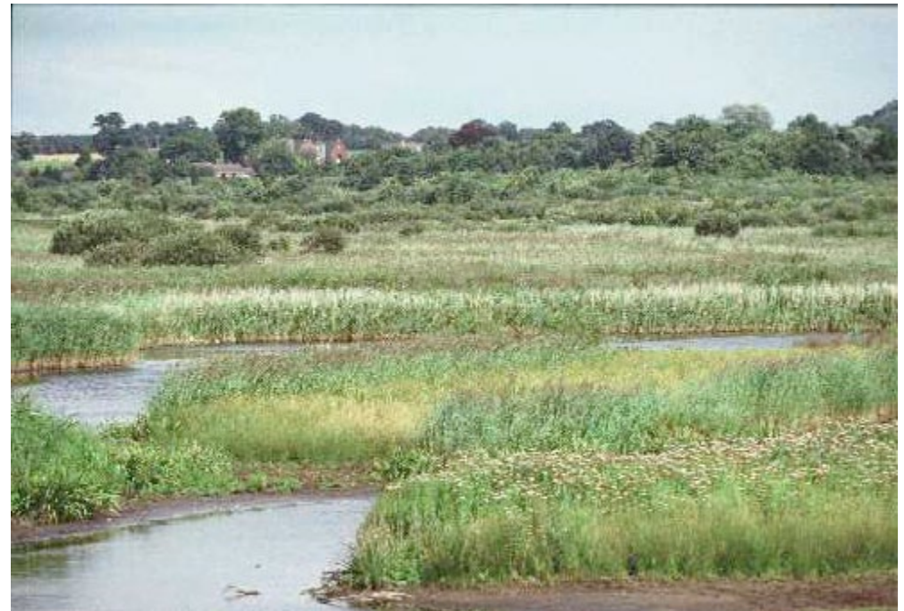
Reedbeds and ponds on the Mid Yare National Nature Reserve shape the distinctive historic landscape of the Broads.