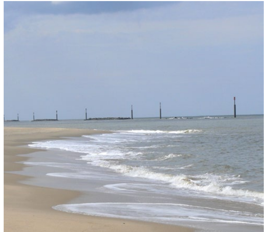
Artificial offshore reefs constructed since 2001 form coastal defences between Sea Palling and Waxham.