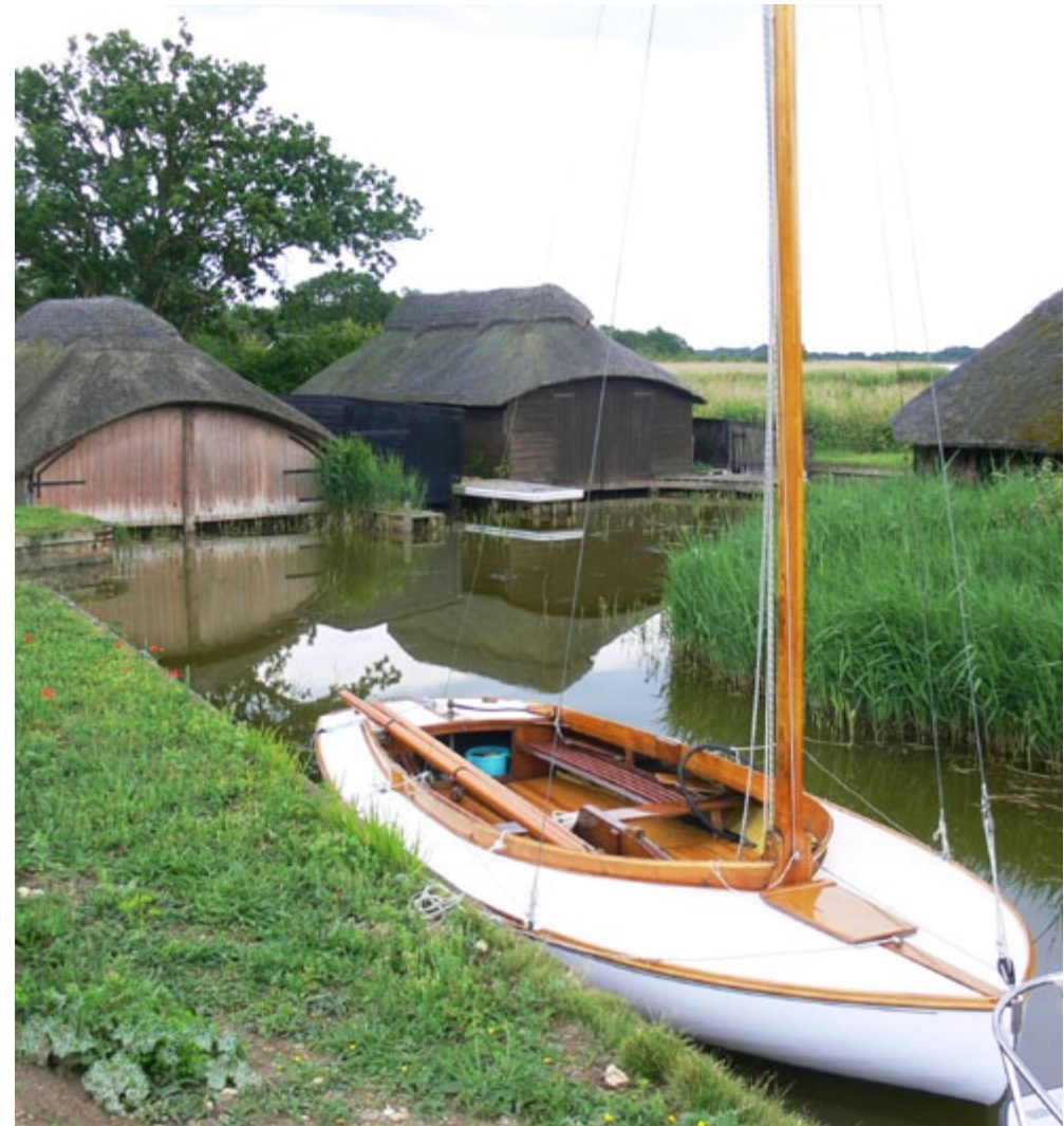
Traditional reed thatched boat sheds at Hickling.