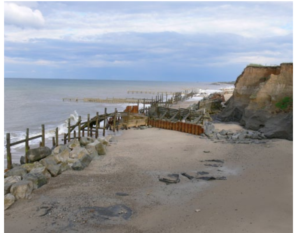
Natural erosion of the soft crumbling sea cliffs at Happisburgh.