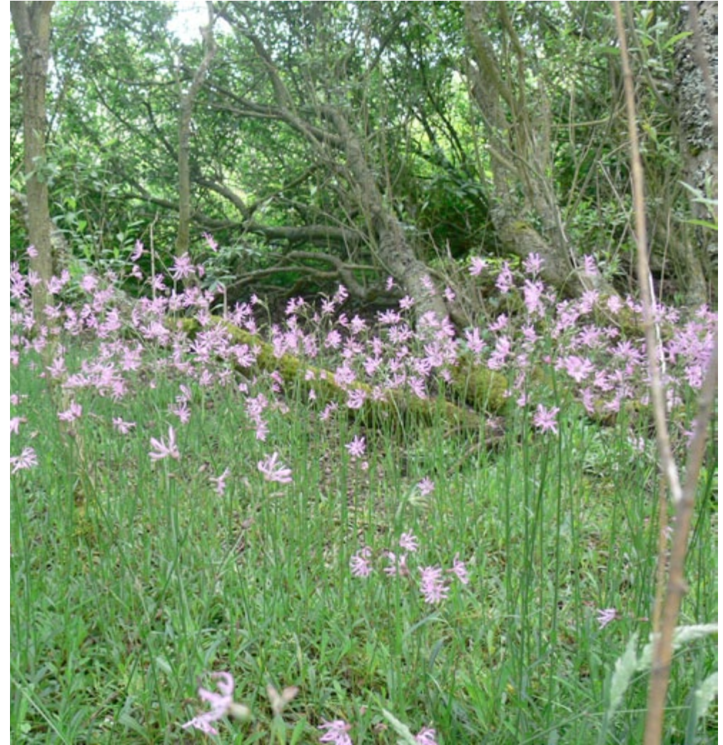
Wet woodland with a ground flora of ragged robin.