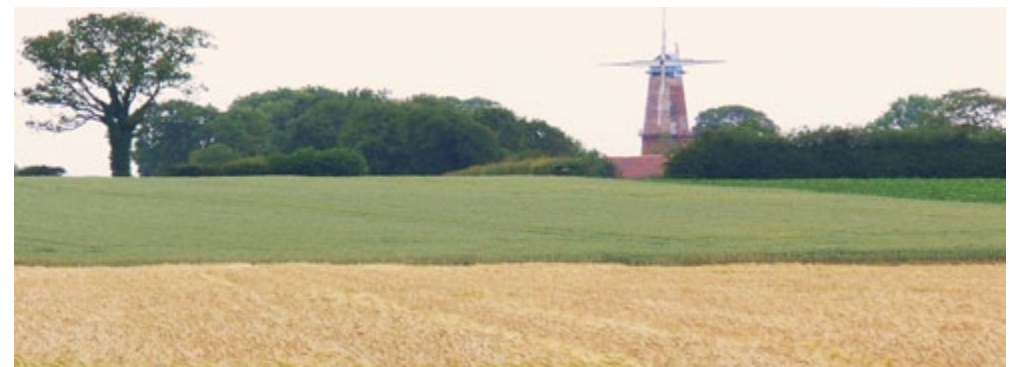
Arable farming is a important component of the Broadland landscape.

Please note: (i) Some of the Census data are estimated by Defra so may not present a precise assessment of agriculture within this area (ii) Data refers to Commercial Holdings only (iii) Data includes land outside of the NCA where it belongs to holdings whose centre point is recorded as being within the NCA.