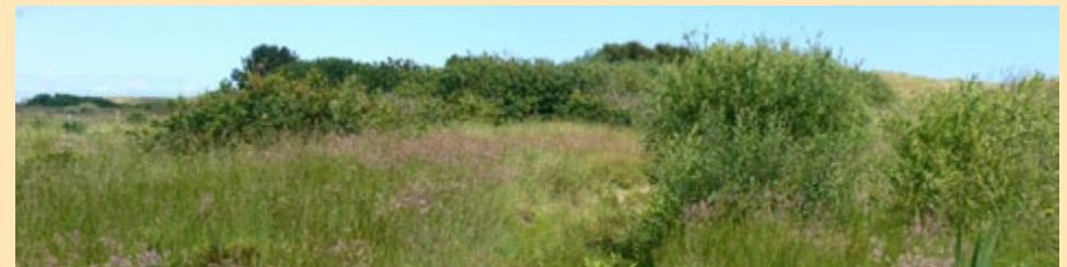
Coastal dune heath and wet dune slacks provide a habitat for natterjack toads and great crested newts.