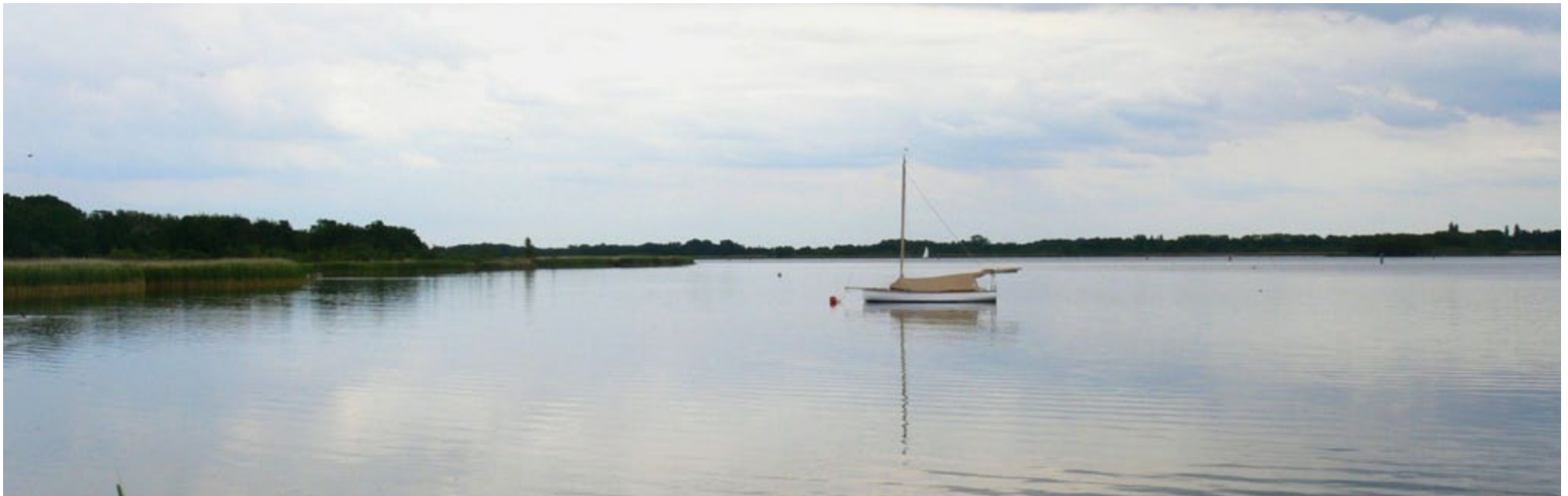
The extensive open waters of Hickling Broad, formed by the flooding of former peat workings.

Biodiversity and geodiversity are crucial in supporting the full range of ecosystem services provided by this landscape. Wildlife and geologically-rich landscapes are also of cultural value and are included in this section of the analysis. This analysis shows the projected impact of Statements of Environmental Opportunity on the value of nominated ecosystem services within this landscape.