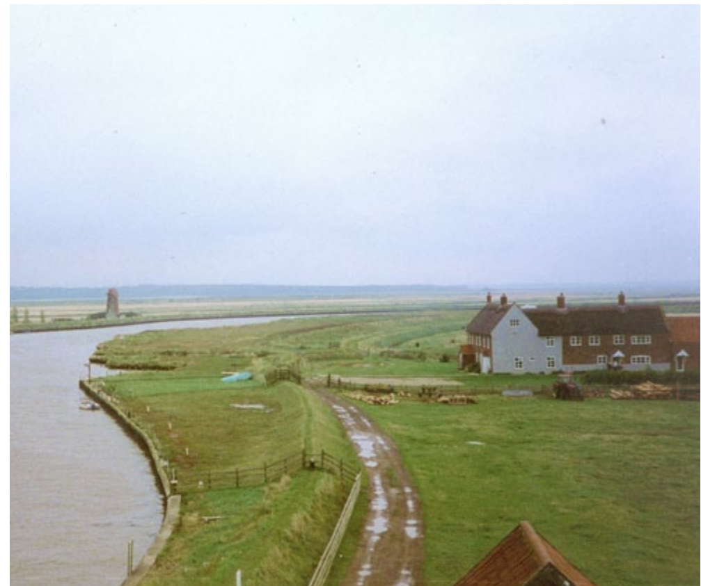
Lower reaches of the Yare with wide grazing levels, isolated farms and wind pump relics.

from land management potentially threaten the quality of water in the Broads and the whole nature of the flood plain environment. Climate change and rising sea levels add further challenges as well as opportunities for the landscape and local communities in this diverse and unique NCA.