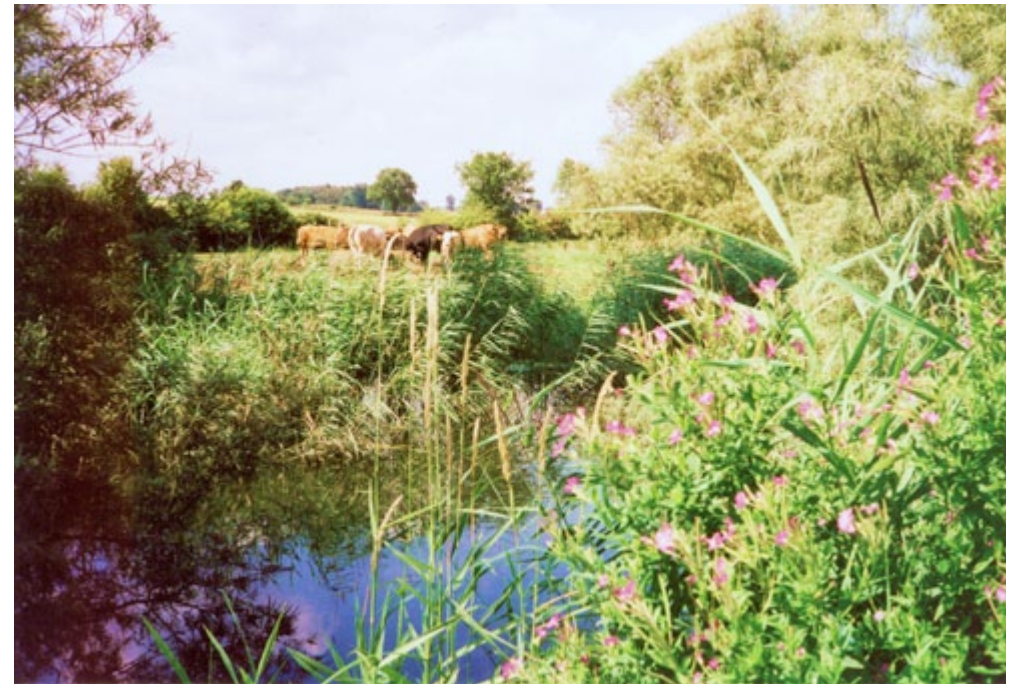
Looking across the dyke at Rockland Broad to grazing pasture and wet woodland.