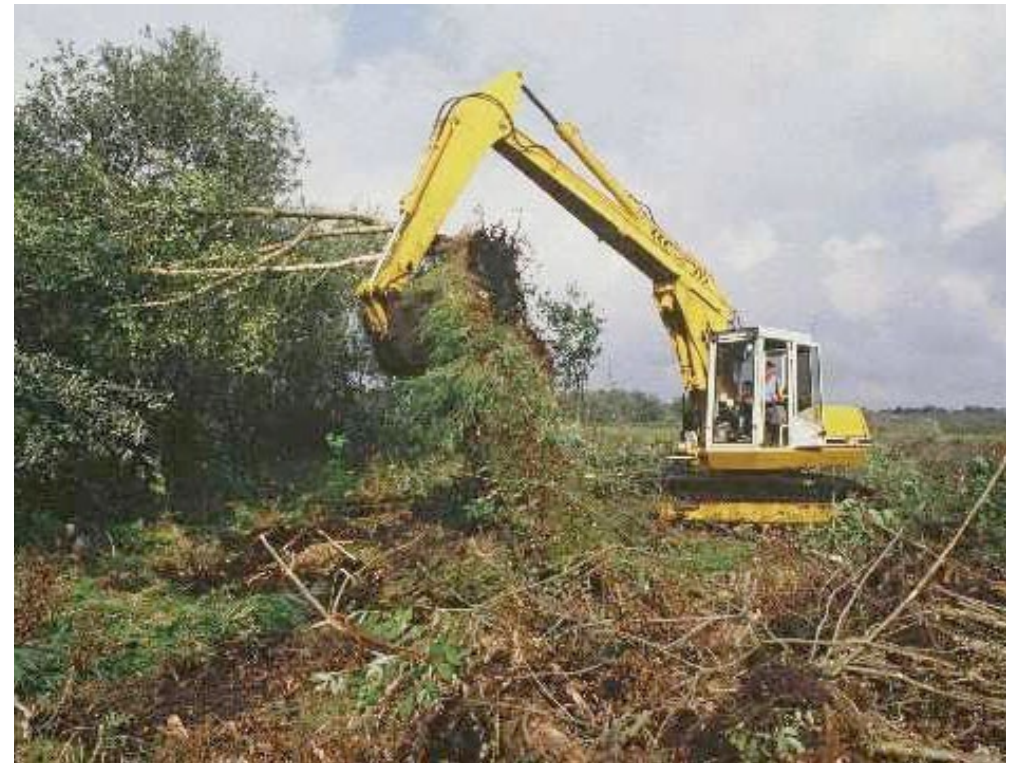
Conservation scrub clearance on the Bure Broads and Marshes SSSI, Bure Marshes National Nature Reserve.