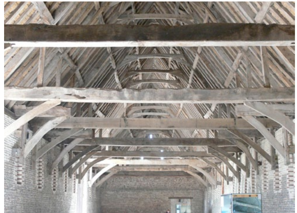
The Grade I Listed Waxham Great Barn which was built in the last quarter of the 16th century. Flint with brick dressings and thatching.