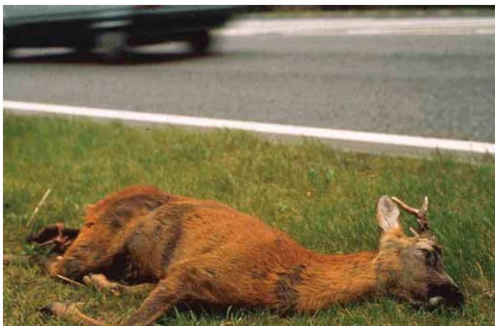
Roe deer road casualty

Achievements The Deer Research Working Group (DRWG) has been set up to ensure continuity and a consistent approach to deer research commissioned by Government and