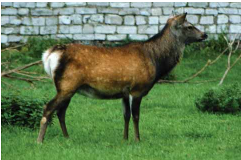
Sika-red hybrid

B10. Consider making it an offence to release Chinese water deer (CWD) into the wild. This could be achieved by adding them to Schedule 9 of the Wildlife and Countryside Act 1981.