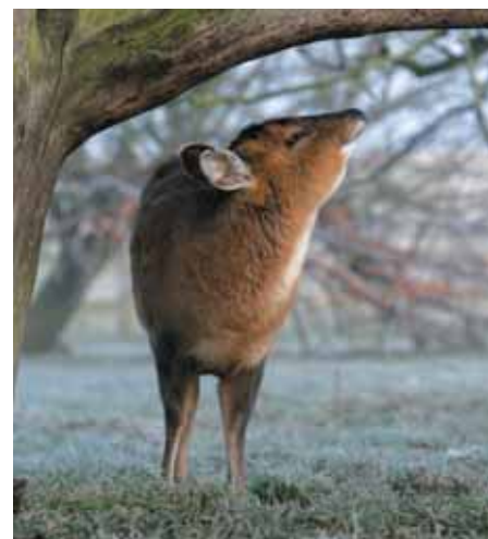
Muntjac in autumn

Further action Further discussion with the EA on the Waste Framework regulations are required and planned. Defra will advise on the Animal By-Products Regulations.