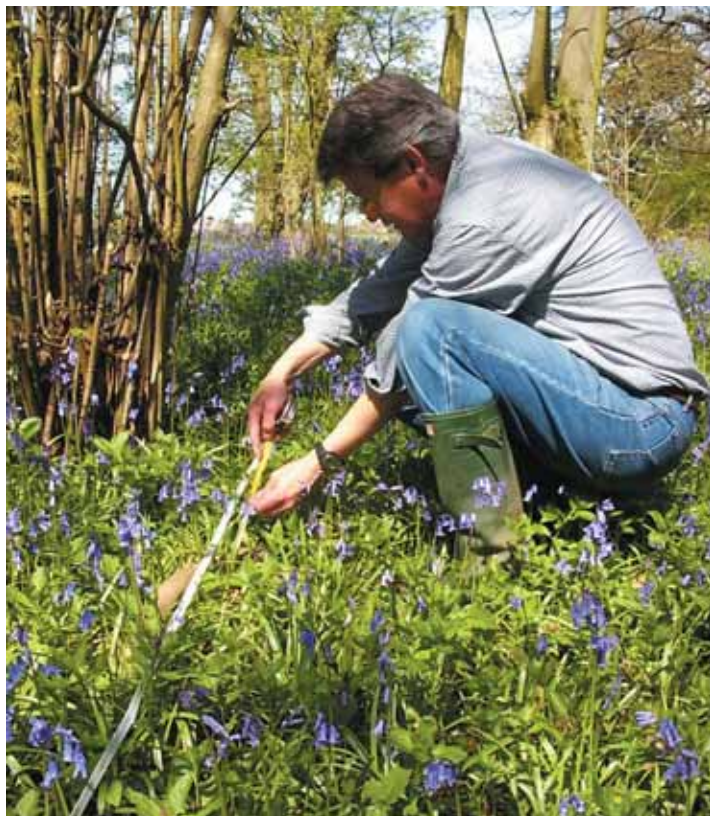
Deer impact assessment

Further action DI will maintain ongoing dialogue with FSA to influence and respond to changes in EU hygiene legislation.