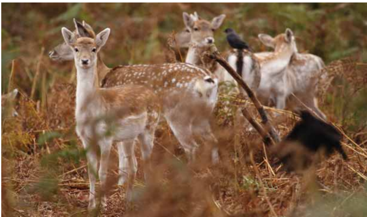
Group of fallow

The aims of this document are firstly to review the achievements of the period December 2004 to 2008, and secondly to set out key actions to March 2011.