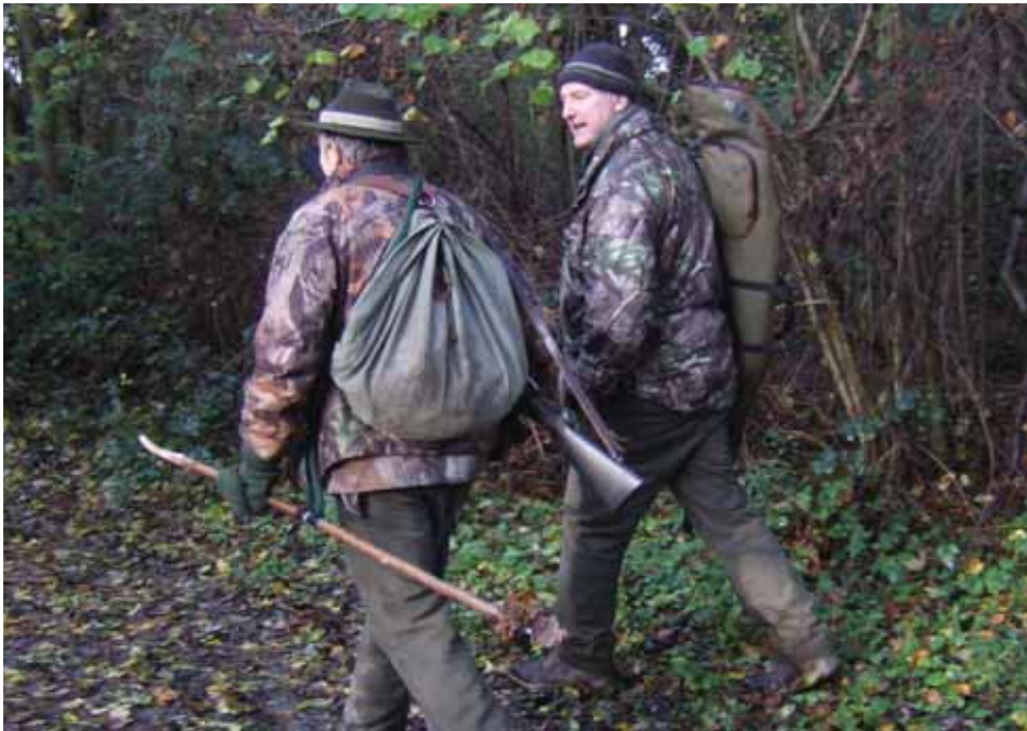
Stalkers in Thetford