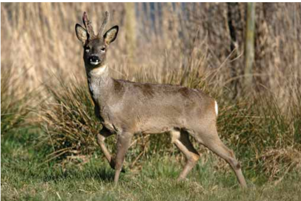
Roe buck