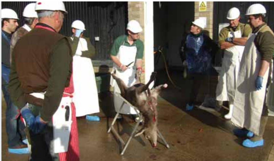
Carcass handling demonstration, Thetford

NE have agreed to explore the role of Regional Development Agencies (RDAs) and Axis 1 funding under the Rural Development Programme for England (RDPE) where larder provision could be associated with regional projects encouraging employment and training.