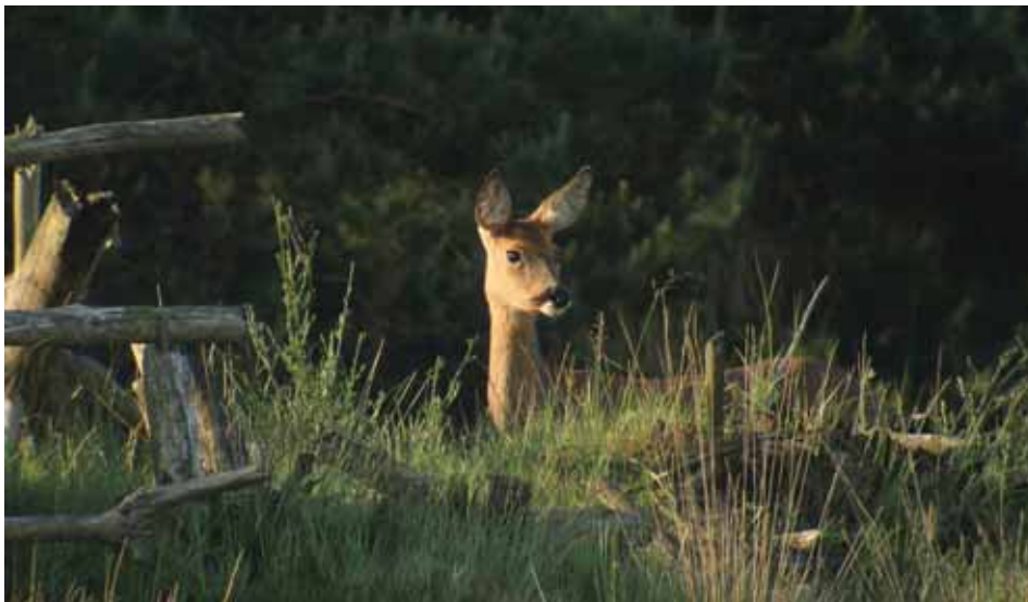
Roe doe

B3. Revise Section 6 of the Deer Act 1991, with regards to actions taken to prevent suffering, in line with the Scottish legislation; such that a person shall not be guilty of an offence in respect of any act done for the purpose of preventing suffering.