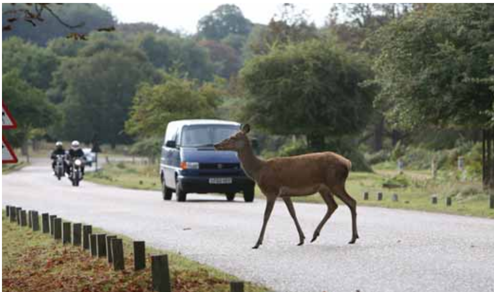
Red deer