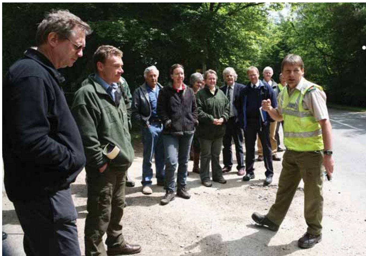
Deer Initiative visit to Ashdown Forest

Natural England will, where necessary, continue to advise Defra on statutory issues relating to notices under the Agriculture Act 1947. However, the new provisions for licensing may further reduce the need for the use of the Agriculture Act to resolve problems and use of this Act has always been very limited.