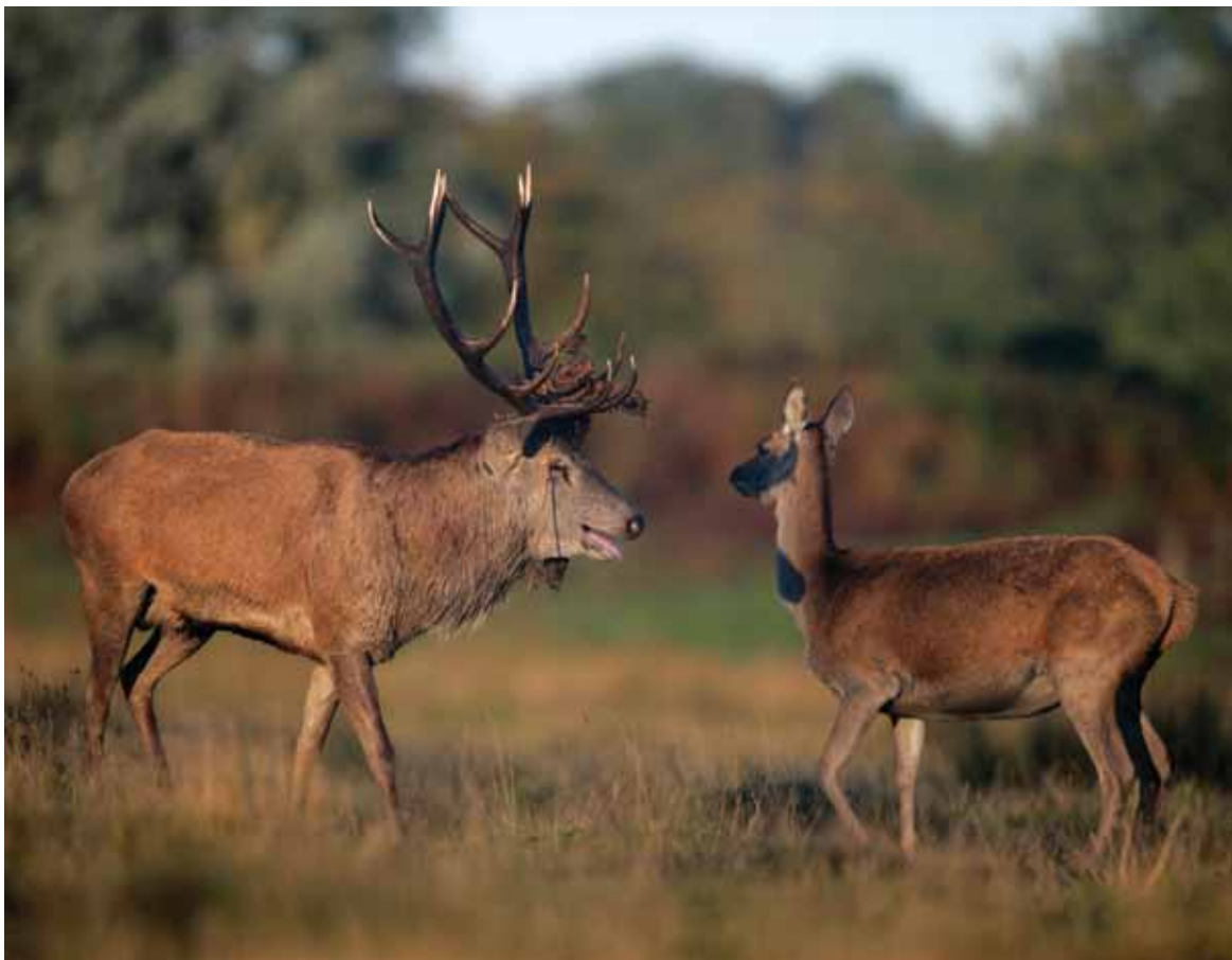
Red deer

Further action The rollout of these grants schemes and associated support for deer management will be continued to new owners particularly in identified priority areas.