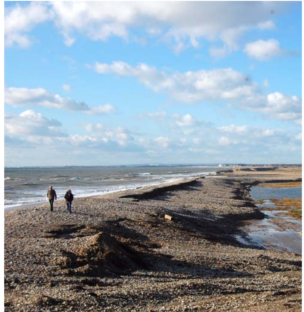
Coastal realignment at Medmerry.