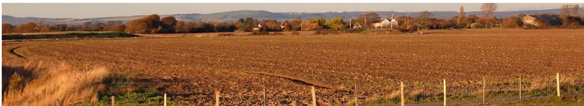
Arable fields in the South Coast Plain with the South Downs in the background.