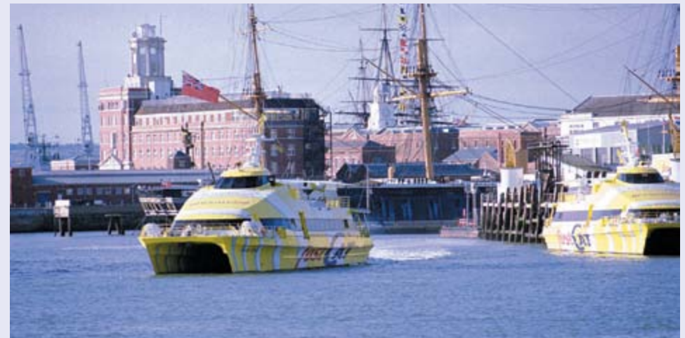
Catamaran departing Portsmouth Harbour.