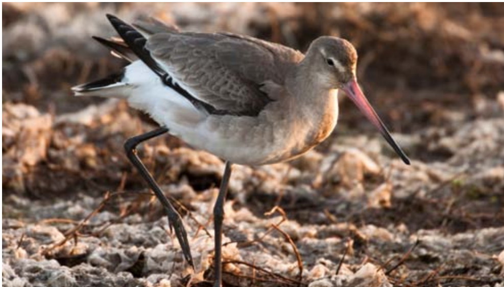
The area supports internationally important populations of bird species including the black-tailed godwit.