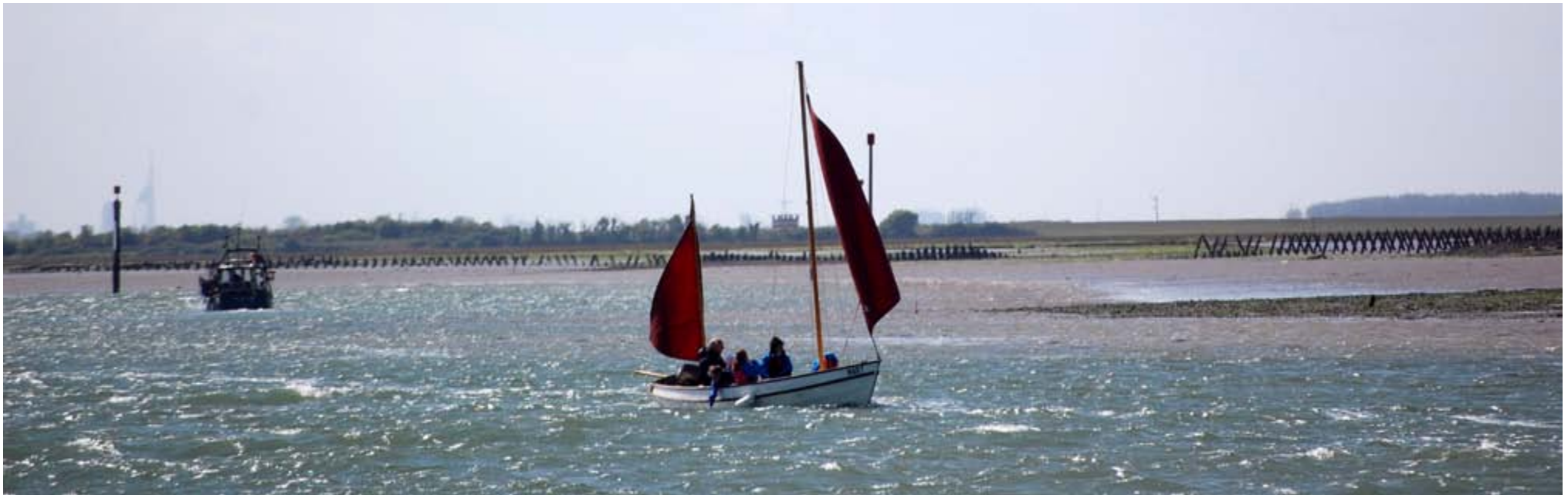
Sailing in Chichester Harbour AONB.

Biodiversity and geodiversity are crucial in supporting the full range of ecosystem services provided by this landscape. Wildlife and geologically-rich landscapes are also of cultural value and are included in this section of the analysis. This analysis shows the projected impact of Statements of Environmental Opportunity on the value of nominated ecosystem services within this landscape.