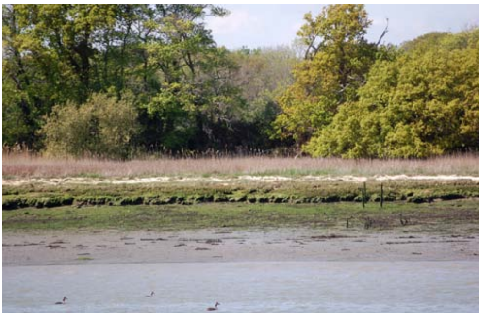
Chichester Harbour AONB.