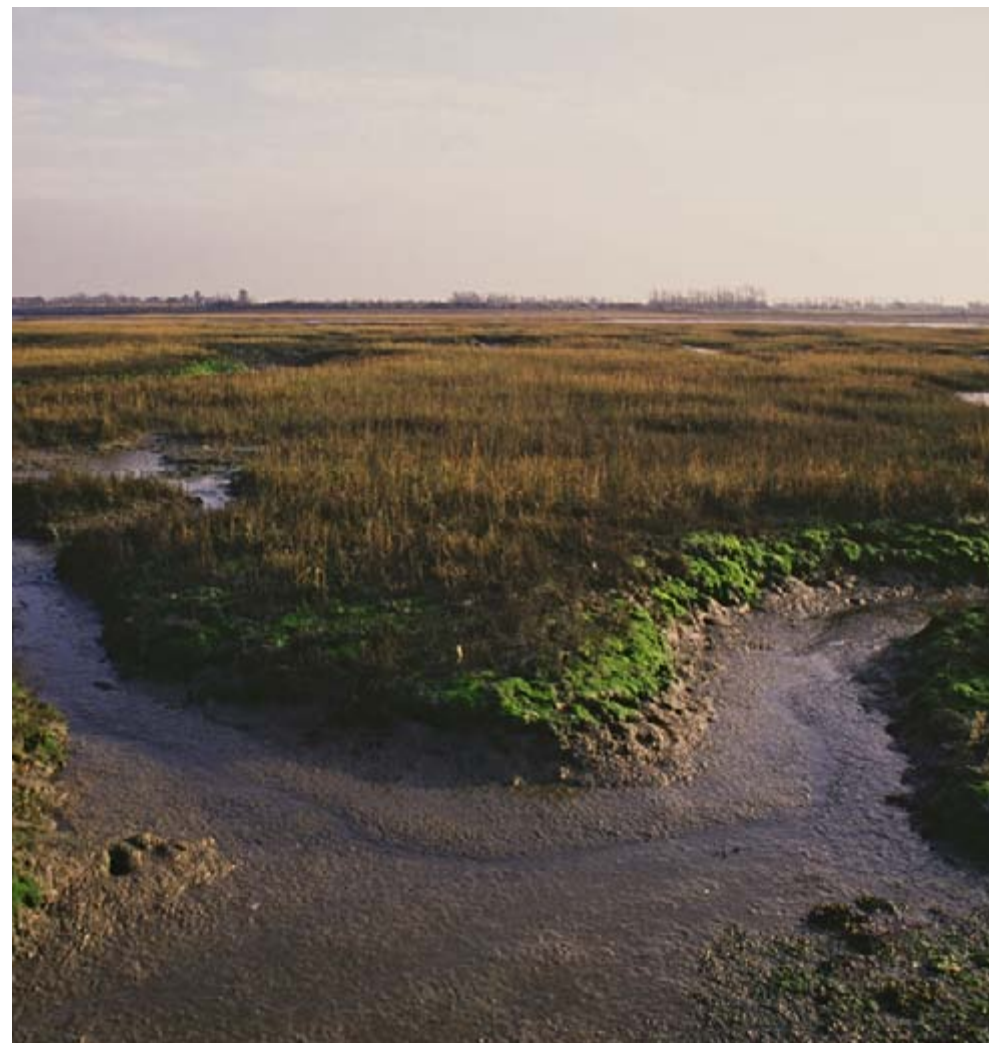
Saltmarsh at East Head.

Maps are available from the Environment Agency showing current and projected future status of water bodies at: http://maps.environment-agency.gov.uk/wiyby/wiybyController?ep=maptopics&lang=_e