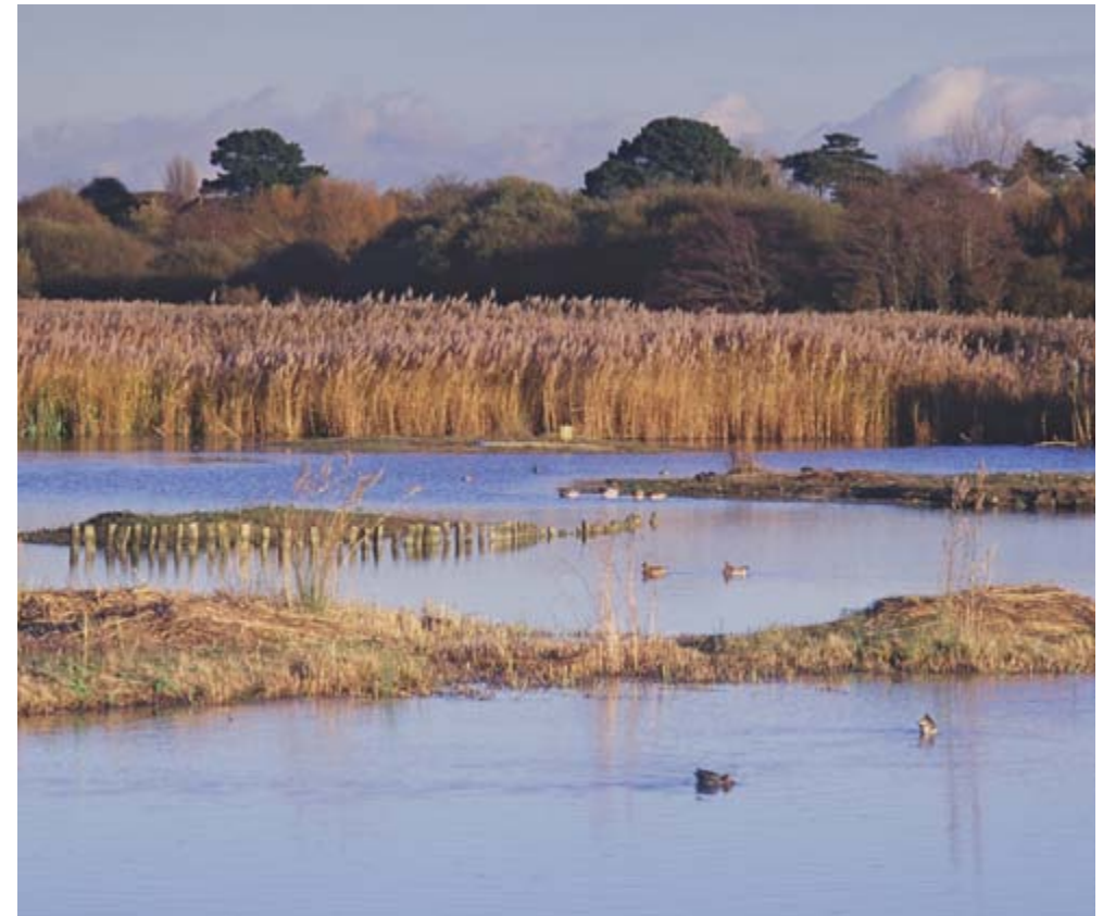
Titchfield Haven National Nature Reserve.

The long history of intervention to reduce the risk of flooding and erosion means that the shoreline is generally in a highly modified form and realignment schemes protect the coast, including the country's first managed realignment on the open coast at Medmerry.