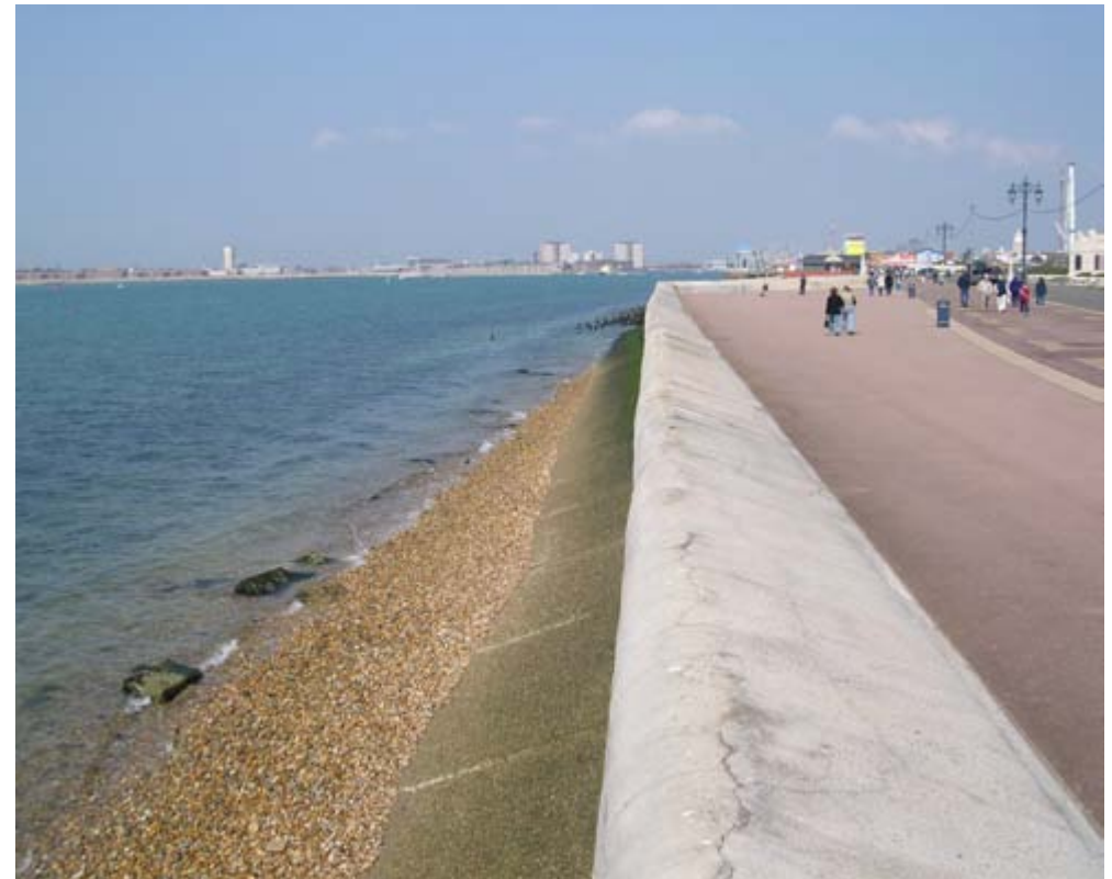
Sea wall at Southsea, Portsmouth.