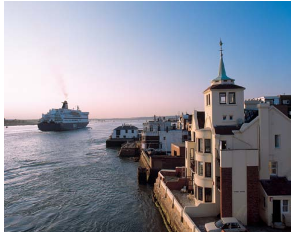
View of harbour and Old Portsmouth from fortifications.