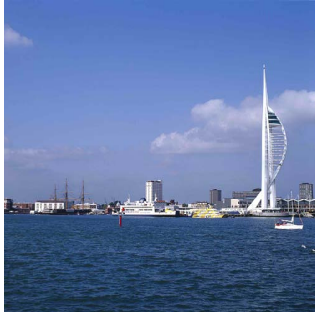
Portsmouth Harbour and Spinnaker Tower.