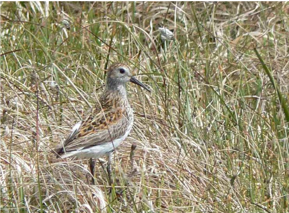
Dartmoor's internationally important blanket bogs provide breeding ground for the dunlin.

Granite has shaped, influenced and framed Dartmoor for millennia: it unites the upland moorland and the surrounding pastoral landscape; it characterises historic features, walls and settlements; and it has influenced man's activities since at least the Bronze Age. Dramatically shaped granite tors and outcrops punctuate large, open skylines, and clitter or boulder-strewn slopes interrupt otherwise smooth hillsides.