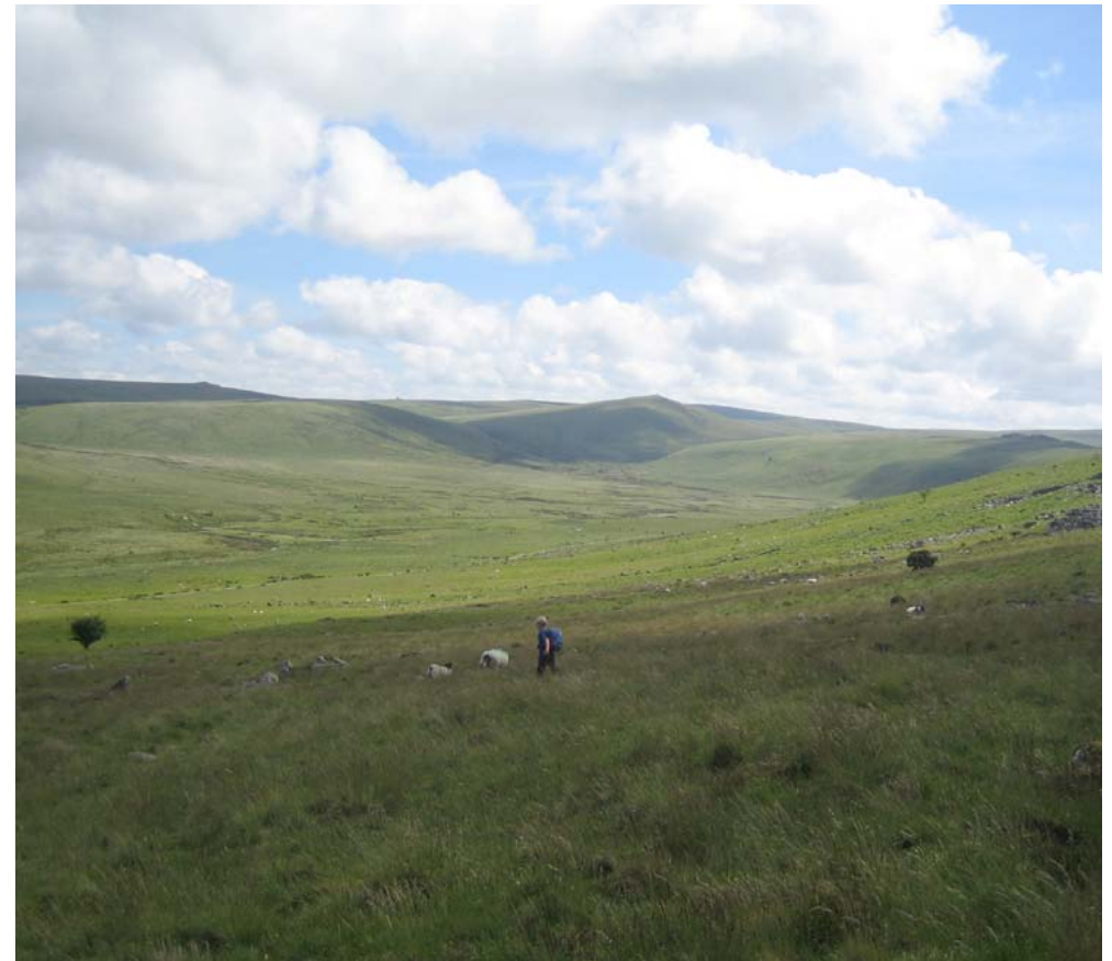
An area of quiet enjoyment, extensive grazing and water catchment.

Biodiversity and geodiversity are crucial in supporting the full range of ecosystem services provided by this landscape. Wildlife and geologically-rich landscapes are also of cultural value and are included in this section of the analysis. This analysis shows the projected impact of Statements of Environmental Opportunity on the value of nominated ecosystem services within this landscape.