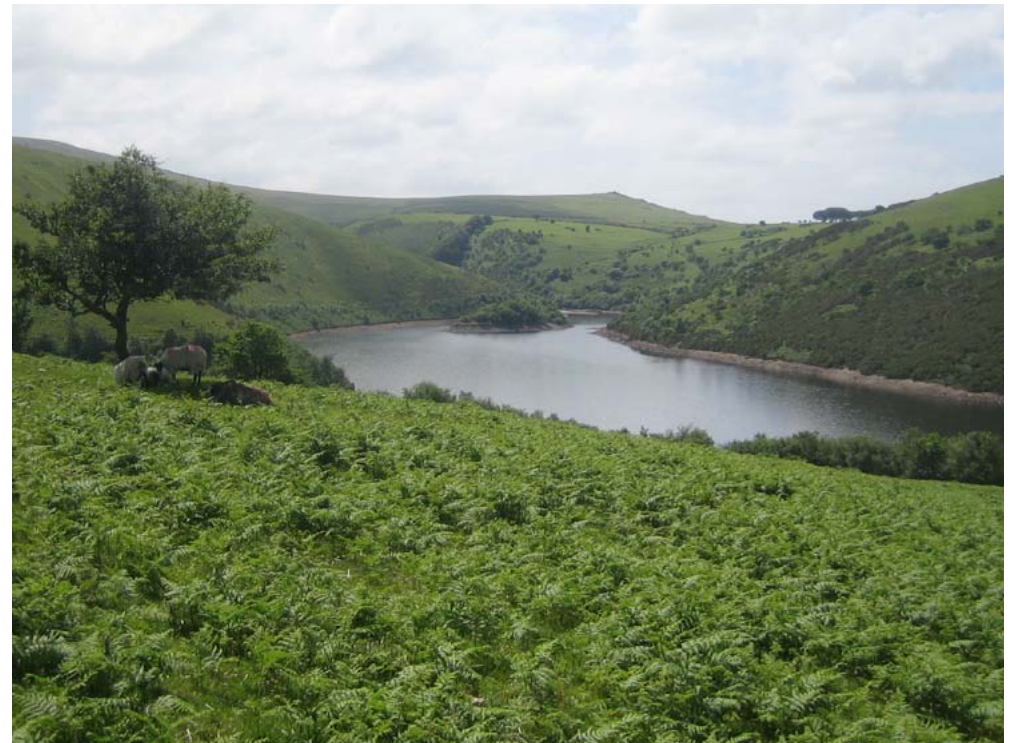
Meldon Reservoir. Dartmoor supports eight reservoirs, providing water for most surrounding areas.