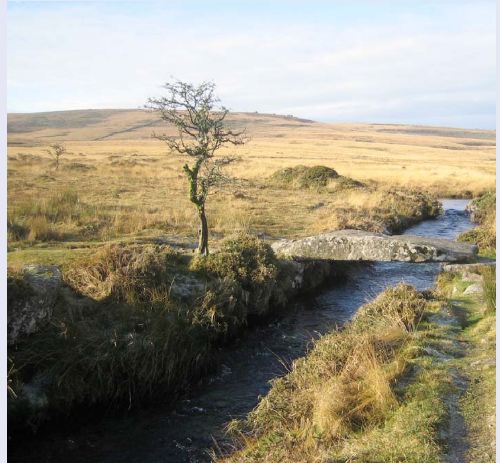
Streams radiate from the extensive moorland, often crossed by ancient granite clapper bridges.