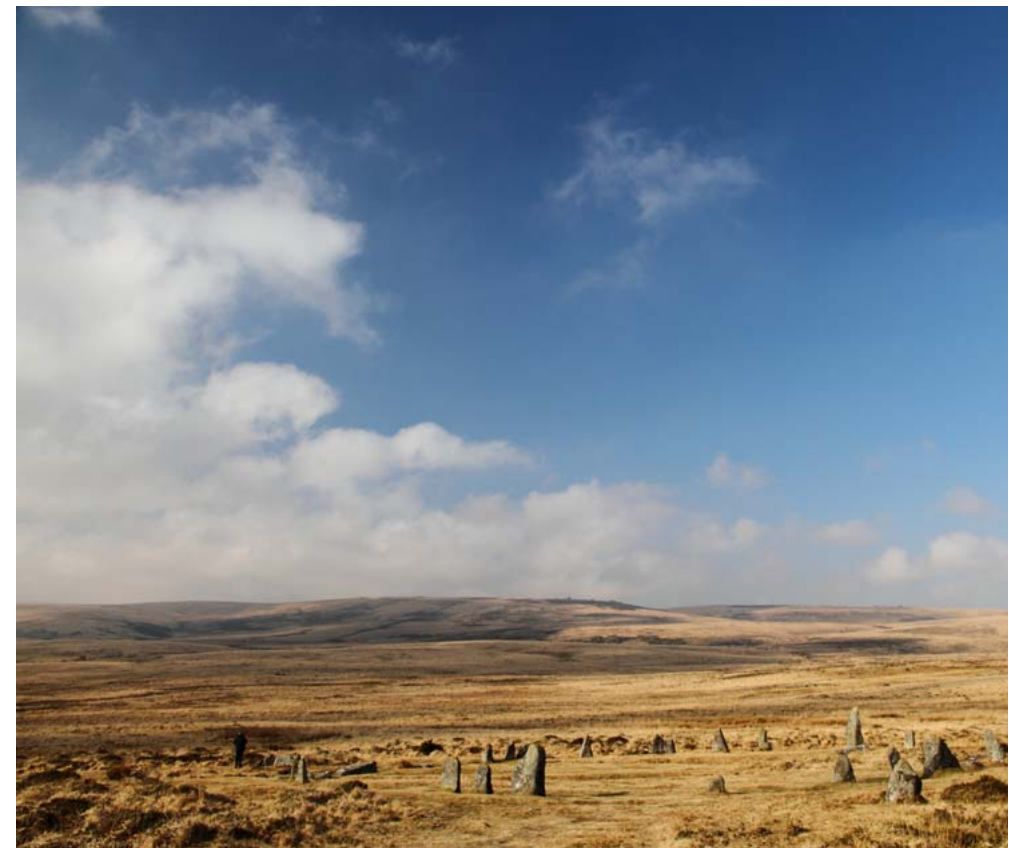
Scorhill stone circle. A significant concentration of stone rows and circles create a strong time depth on Dartmoor.

Infrastructure developments from the late 18th century made Dartmoor more accessible and spurred the prosperity of the quarrying, mining and farming industries. Major roads were turnpiked, stimulating further development of the larger settlements and the introduction of 'universal' architecture and non-local materials such as Welsh slate and brick.