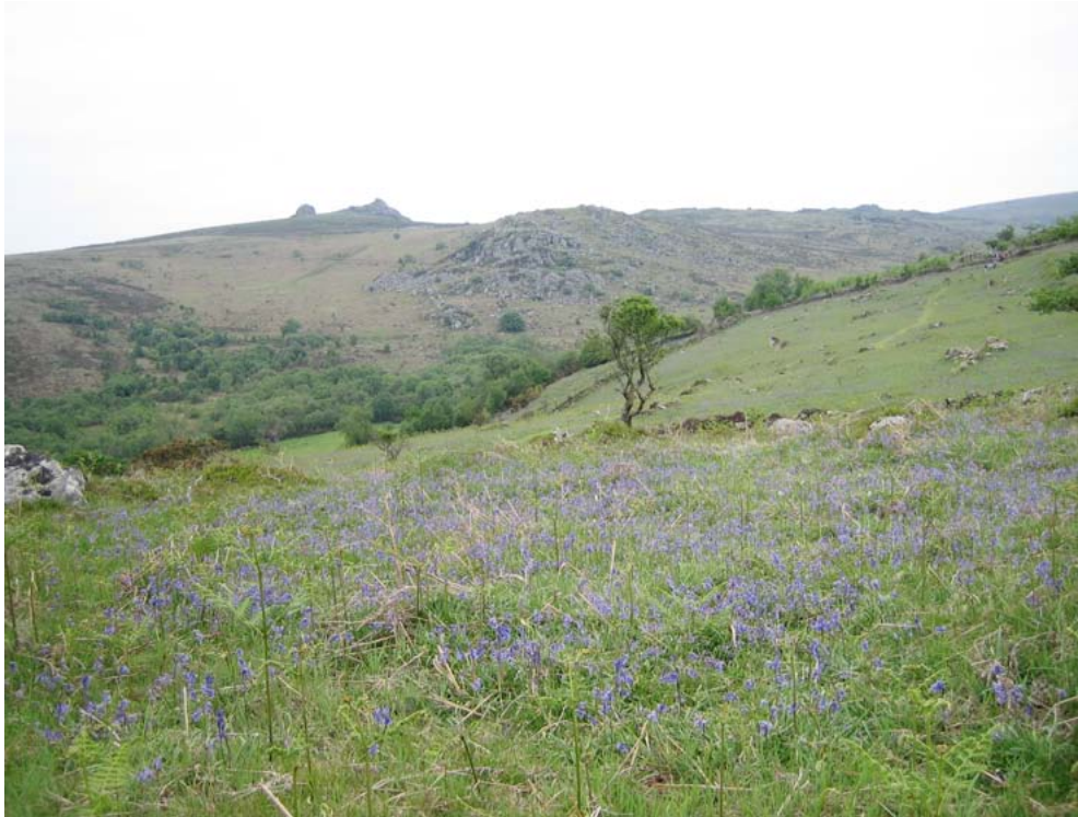
Vertical granite exposures of Holwell Quarry below Haytor.