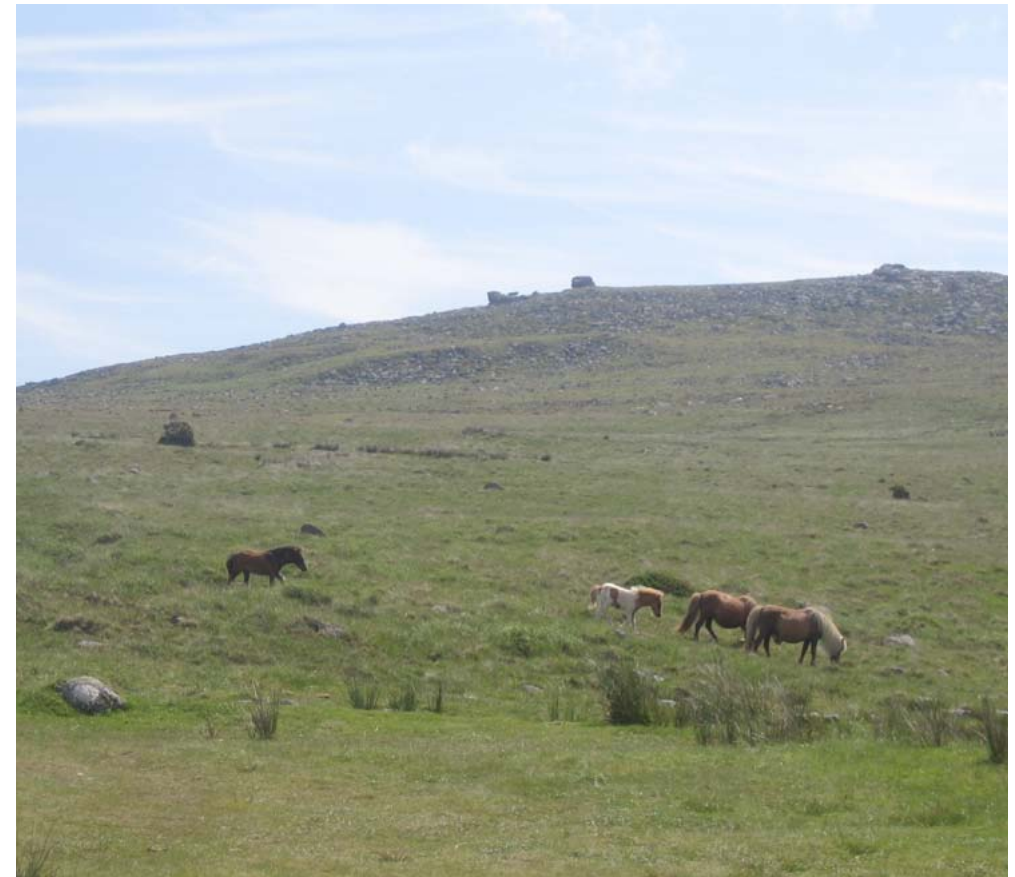
Dartmoor ponies graze the moors and clutter-strewn tors.

tranquillity and dark night skies. The North Hessary Tor transmitter mast also impacts on dark night skies; at just under 200 m in height and illuminated at night it is a significant modern feature.