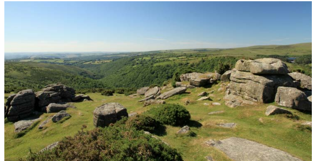
The River Dart meanders through steep, wooded valleys to the adjoining South Devon NCA.

Many of the historical infrastructure links between Dartmoor and the surrounding NCAs relate to the transportation of granite and minerals. The most notable form of transport is the Haytor granite railway, linking Haytor quarries with the docks at Teignmouth via the Stover Canal. Cultural links also exist between Dartmoor and the surrounding NCAs. Henry Williamson's classic Tarka the Otter connects Dartmoor with Exmoor through The Culm NCA along the River Taw corridor. It depicts the obvious biodiversity connectivity along the numerous river corridors.