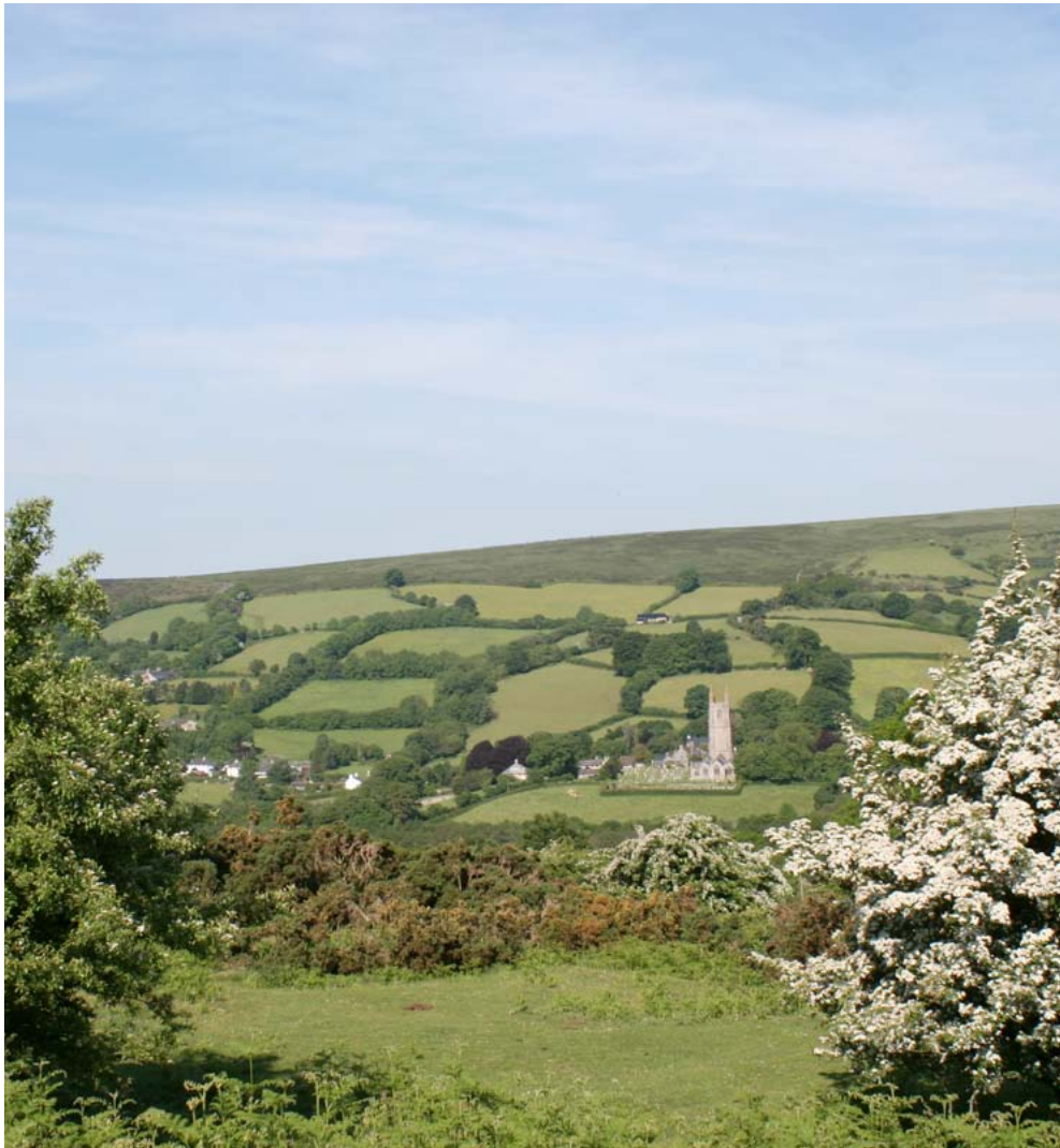
Widcombe-in-the-Moor, an iconic village nestled in a sheltered location with a prominent church tower.

Exploitation of Dartmoor's natural resources to supply expanding urban populations continued with the construction of eight reservoirs. The first was completed in 1861 at Tottiford, and the last at Meldon in 1972. Afforestation of the open moorland for timber production began in earnest after the First World War and several plantations were associated with the newly created reservoirs. The plantations still represent a major source of timber in south-west England. Military training on Dartmoor began in the late 19th century and brought the construction of structures in previously undeveloped areas, although restrictions on access and agricultural uses have helped to preserve many of Dartmoor's internationally important habitats and archaeological features.