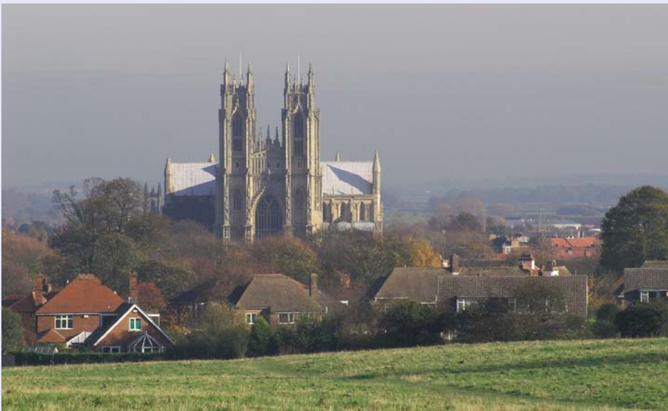
Beverley Minster, completed in 1425, inspired the design of Westminster Abbey.