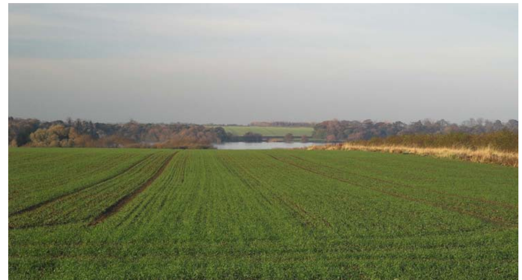
Arable farming along the coast.

lease note: (i) Some of the Census data are estimated by Defra so may not present a precise assessment of agriculture within this area (ii) Data refers to commercial holdings only (iii) Data includes land outside of the NCA where it belongs to holdings whose centre point is recorded as being within the NCA.