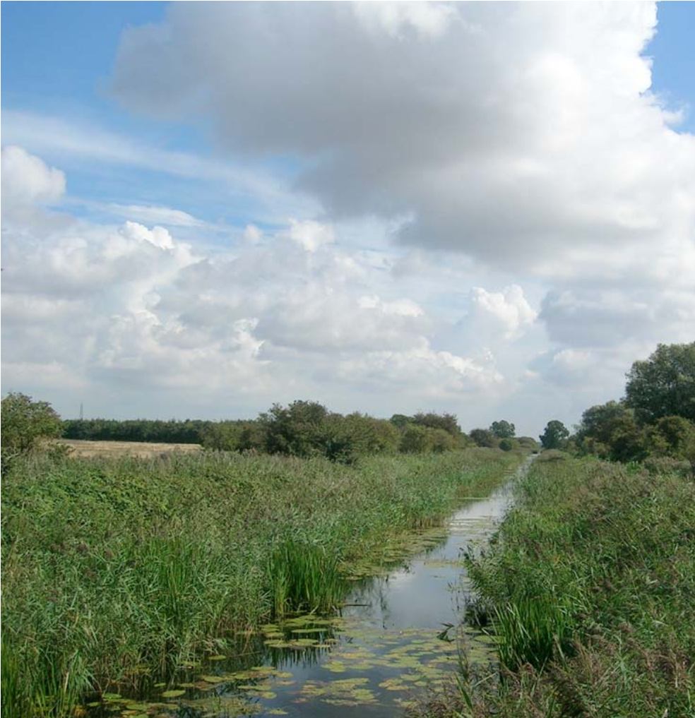
There are many drains, ditches and dykes in Holderness such as here at the Leven Canal SSSI (Akdale Bridge looking east).