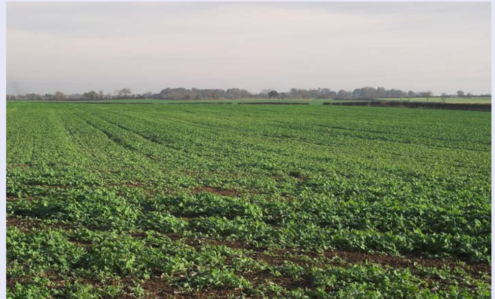
Open landscape with long views and large-scale arable farmland near Hornsea.