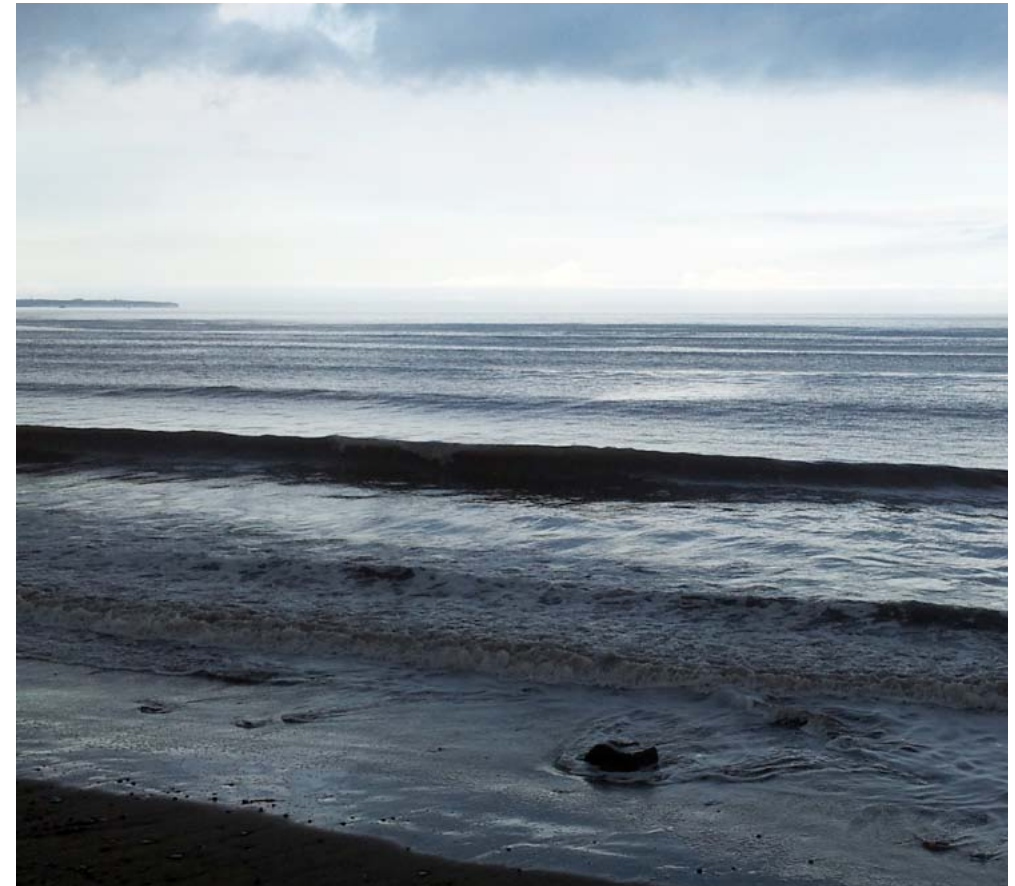
Views of the North Sea along the Holderness coast looking towards Bridlington. The North Sea is an important shellfish ground.

In the marine environment around Holderness, the North Sea is an important shellfish ground of significance to the local economy, with the largest port located at Bridlington and additional landings at Hornsea and Withernsea.