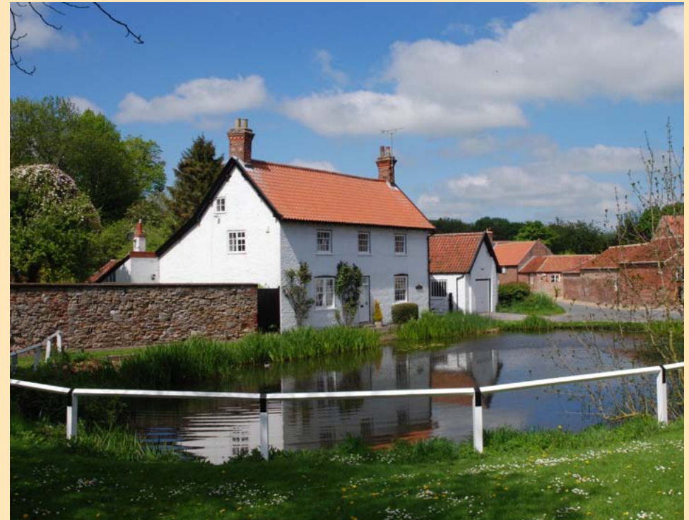
Bishop Burton. Many villages in Holderness have village ponds which contributes to the strong sense of place.