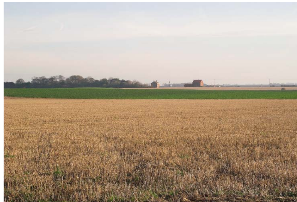
Farming is predominantly arable with cereal production covering 38,997 ha.