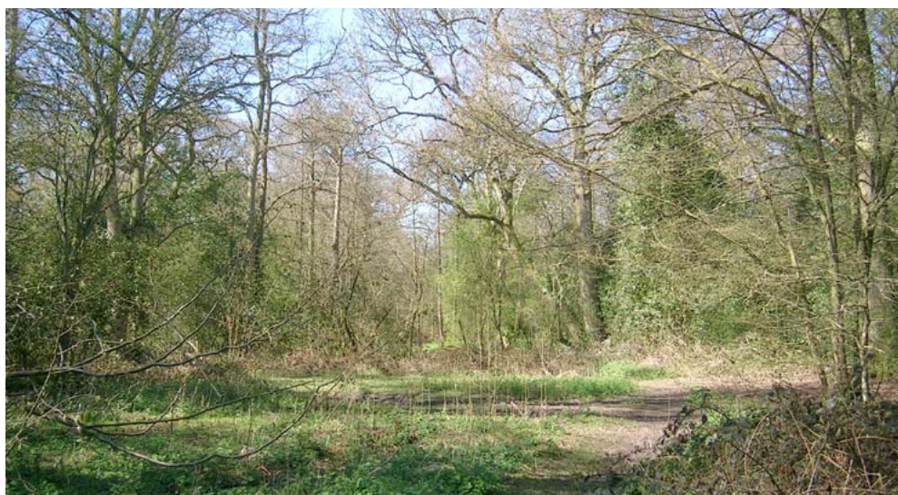
Beverley Westwood common land.

The area of publically accessible land in the NCA is very low. The coast offers tourism and recreation opportunities at Bridlington and Hornsea where there are holiday homes and caravan parks, and beaches.