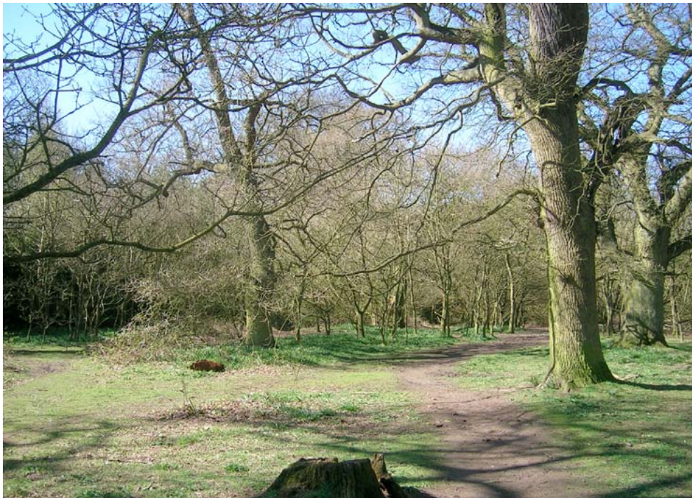
Burton Bushes in Beverley Westwood may have links to ancient woodland.

century when the landscape must have been a mix of enclosed land, common pastures and open fields, supporting production of grass, corn, hay, sheep and cattle. Parliamentary enclosure introduced a similar pattern of dispersed farmsteads set apart from the villages and areas of large, regular fields enclosed by thorn hedges. The coastal farmland from Hornsea to Bridlington was enclosed early in the 19th century with straight roads and tracks, and the formation of new farmsteads. Large and widely dispersed 18th- and 19th-century farmsteads occurred and industrial-scale pig rearing developed after 1940.