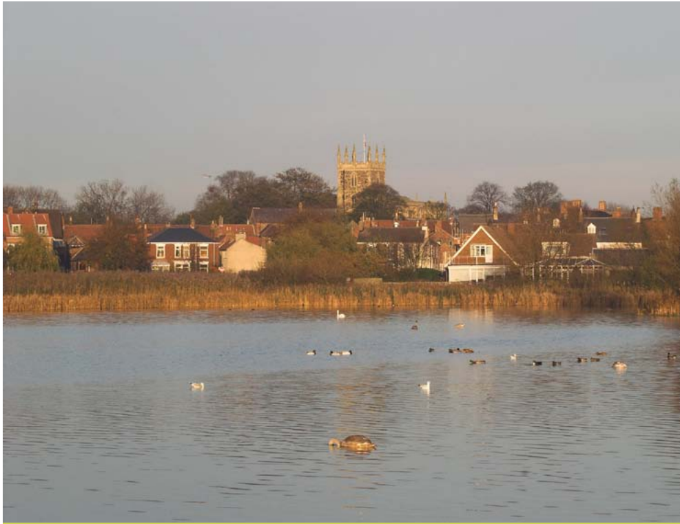
Hornsea Mere is a large natural lake with important marginal habitats and attracts large populations of wintering wildfowl.

Holderness is a productively farmed, low-lying landscape located east of the Yorkshire Wolds. A broad, undulating plain, centred on the valley of the River Hull, this largely rural area is shaped by modest changes in topography, tree cover and land use.