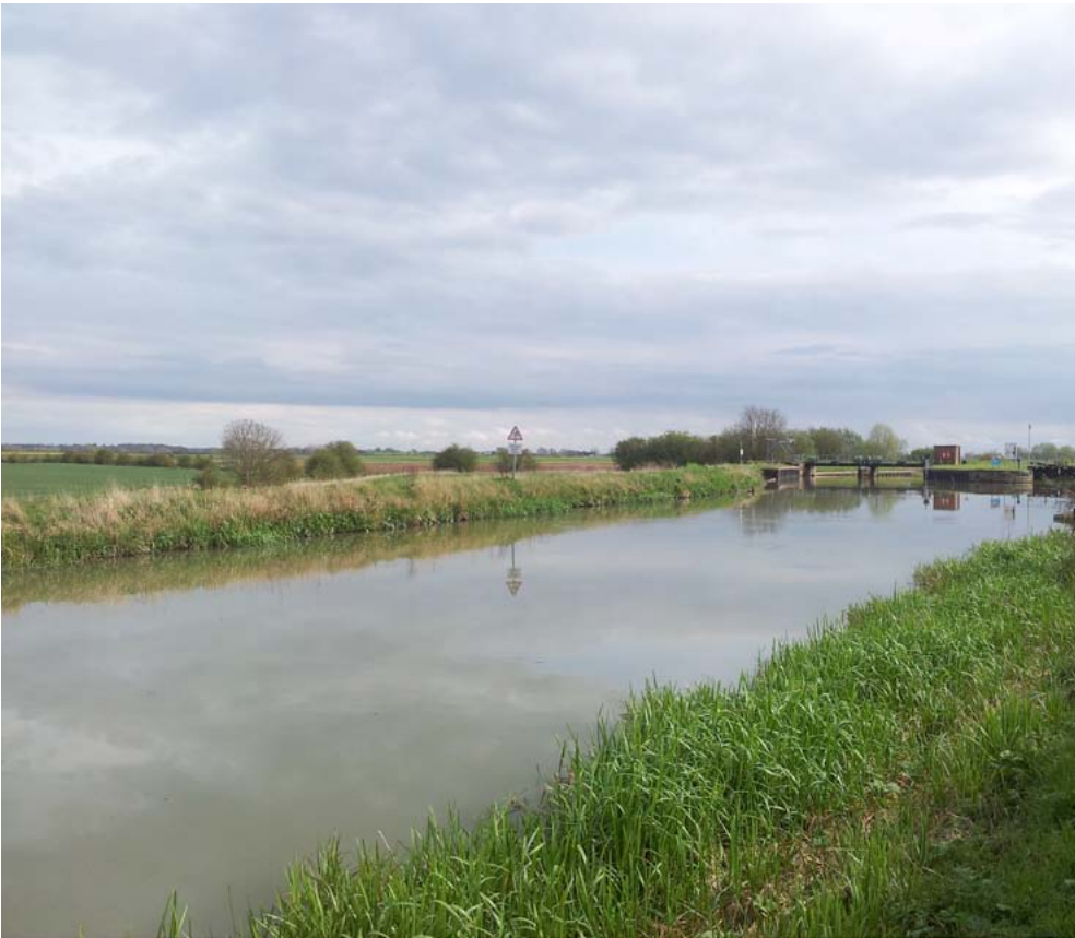
Pumped drainage on the River Hull helps protect agricultural land from flooding.

Flooding along the course of the River Hull can affect properties, businesses, the transport infrastructure and farming. This is particularly prevalent around Beverley, and further south in and around the City of Hull and the Humber Estuary where flood events can be heightened by tidal influences. Policies to prevent inappropriate development within flood plains should be supported, farming practices should be modified to safeguard soil resources where there is frequent water inundation and the expansion of flood storage areas should be implemented where appropriate.