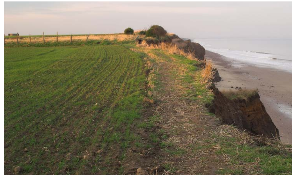
The soft, boulder clay cliffs of Holderness erode rapidly.

Settlement was concentrated on the high areas of hills and ridges. Early drainage occurred in medieval times and continued until the mid-18th century when the last reaches of the River Hull were drained. Ancient enclosure occurred in Holderness on the glacial tills, while the fertile peaty carr lands in the Hull Valley continued to be used in common. Open field villages survived until the 17th