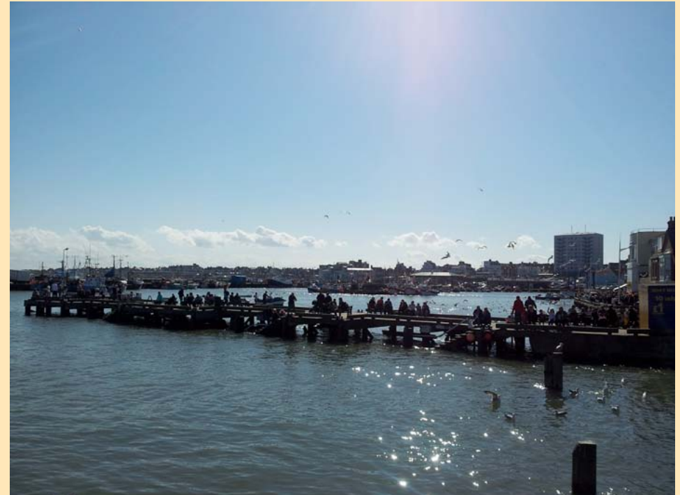
The coastal resort of Bridlington is a fishing port and is popular with visitors to the area.