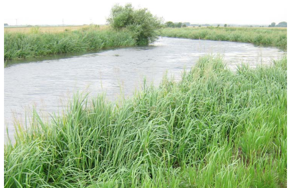
The River Hull headwaters form the most northerly chalk stream system in Britain and are designated a Site of Special Scientific Interest (SSSI).

Eastwards along the dip slope of the Yorkshire Wolds, views are extensive in this predominantly flat, open and gently undulating plain which extends over the valley of the River Humber and runs south to Hull. The Humber Estuary is visible but with restricted views where there are flood embankments. Towards the coast, the proximity of the sea is scarcely apparent due to the low-lying cliffs, which provide a backdrop of upland views.