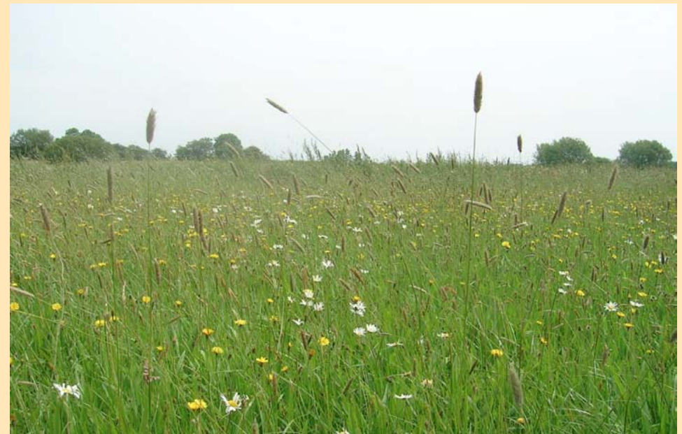
Species-rich grassland of Lambwath Meadows.