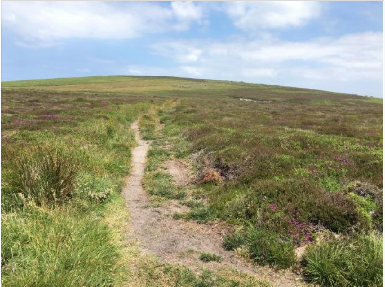
Lowland heathland habitat at Tredinney Common (July 2019)