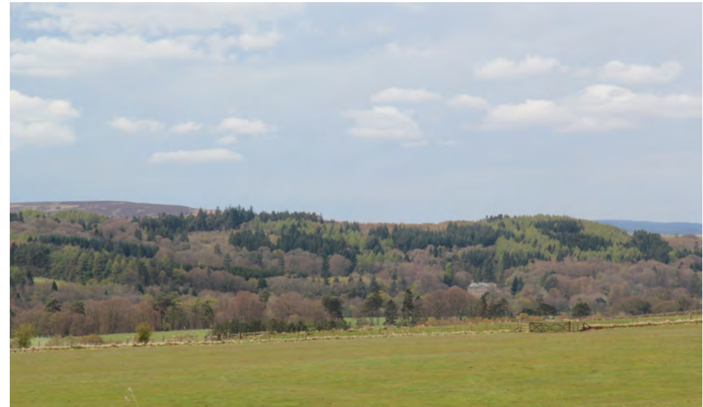
Coniferous woodland consists of a variety of species and age classes, and is often mixed with broadleaved trees.

Widespread afforestation during the 20th century, beginning in the 1920s, had a highly significant impact on the landscape. The extent of mire habitat was reduced, with conifer encroachment and forestry drainage posing a threat to remaining mires. Afforestation may also have impacted on the potential for new archaeological discoveries. The creation of Kielder Water in the late 1970s was also highly significant. As well as allowing for large-scale water storage, it also brought about a major change in the landscape character and began to attract many more visitors to the area. The establishment from the early 20th century of military training areas at Spadeadam and Otterburn has introduced intrusive features such as military camps, roads, security fences, safety notices and overhead power lines, and military operations have had some influence on perceptions of tranquillity. Other significant changes during the last century have included the introduction of asphalt roads and power grid connections, and the consequent increases in motor vehicle traffic and light pollution respectively. Architectural changes have also taken place – modern, colour-washed houses which have been built for forestry workers, for instance at Stonehaugh and Byrness, and modern agricultural buildings which contrast with the more traditional sandstone farmhouses with slate roofs.