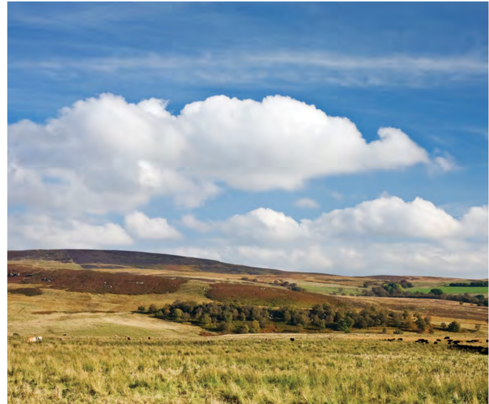
Upland hay meadows on the moorland fringe are grazed by hardy breeds of sheep and cattle.

Owing to the remote upland nature of the area, there are very few major transport links with other NCAs. The A68, which follows the Rede Valley, is the only principal route passing through the area, linking the Tyne Valley to the south with the Scottish Borders to the north.