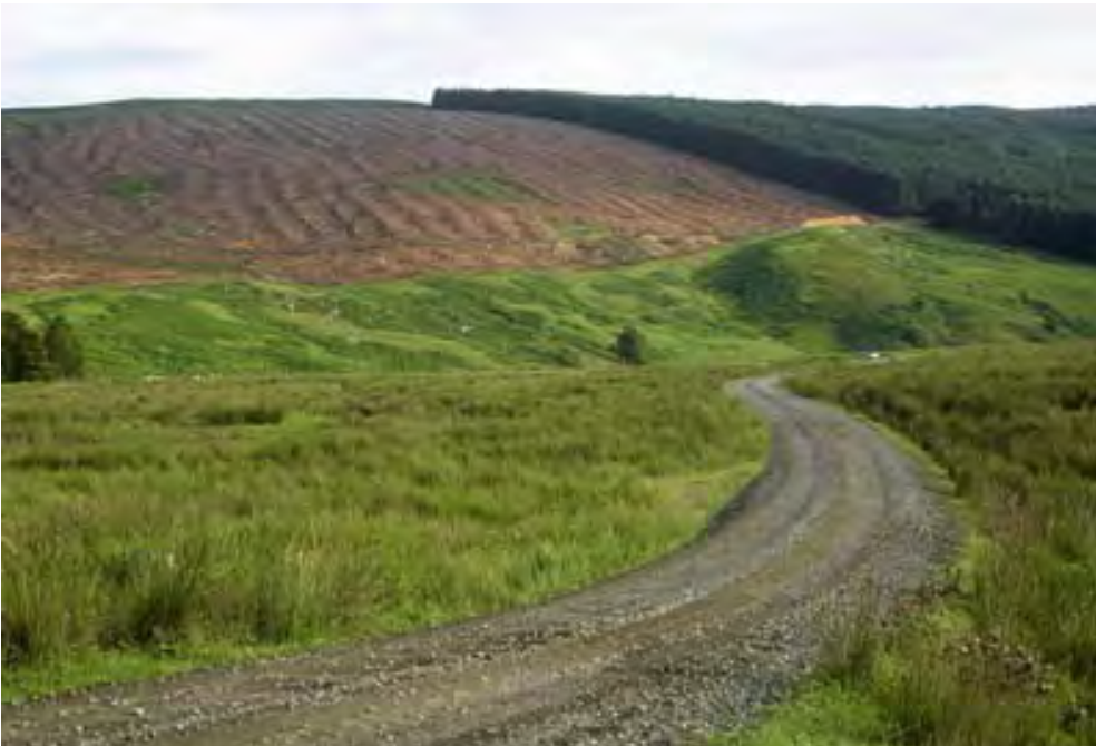
Recently felled areas are a feature of the forested landscape.

The Pennine Way National Trail runs through the NCA from south to north, and with a large proportion of public forest and uncultivated country much of the land is accessible to the public. The remoteness, tranquillity and high landscape value of the area has been recognised by the designation of Northumberland National Park, which accounts for 39 per cent of the NCA.