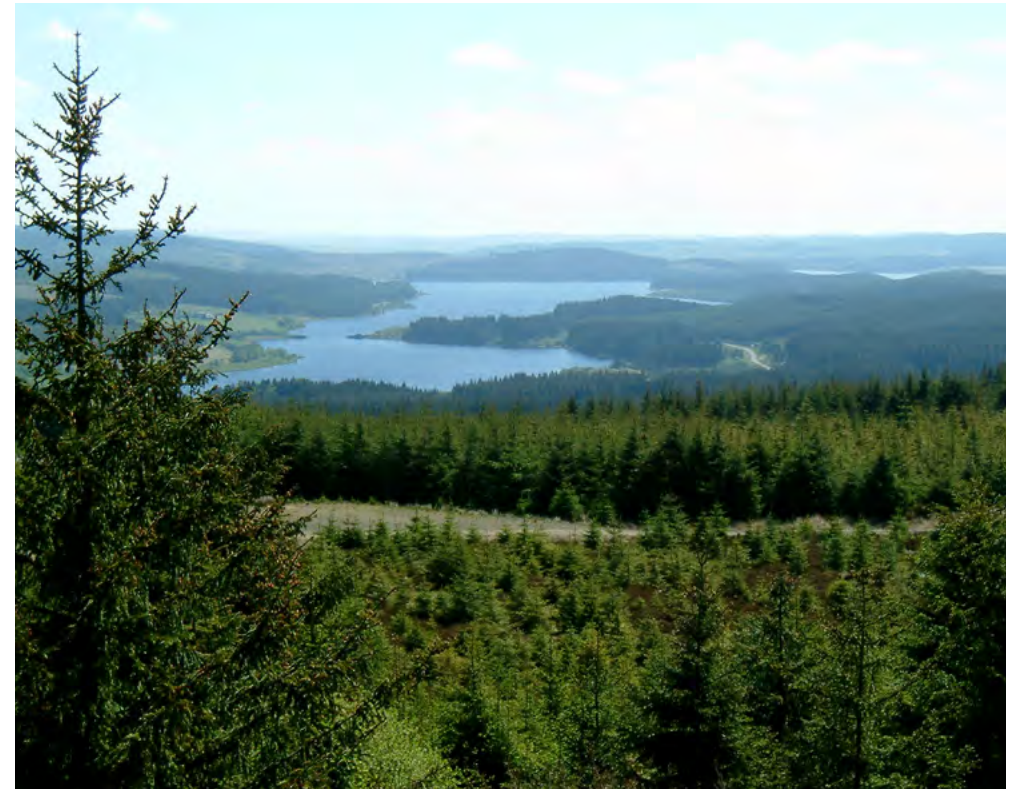
Kielder Water, built in the 1970s at the head of the Tyne Valley, forms a distinctive feature in the landscape.

Human influence on the landscape began in prehistoric times with the clearance of native broadleaved woodland from the Neolithic period. There is abundant archaeological evidence of prehistoric land use (including field systems), ritual sites (such as standing stones and burial cairns) and settlement (in the form of hill forts, palisaded enclosures and enclosed farmsteads), especially from the Bronze Age to Romano-British periods. The evidence of Roman occupation is internationally significant; the modern A68 follows the course of Dere Street, the main north–south Roman road, for much of its length through the Redesdale Valley and there is further archaeological evidence of the road, along with a branch road heading east towards the coast. The series of Roman marching camps along the course of Dere Street are a clear indication of Roman military presence and the strategic importance of the area close to the northern limit of the Roman Empire. The camps are likely to have been