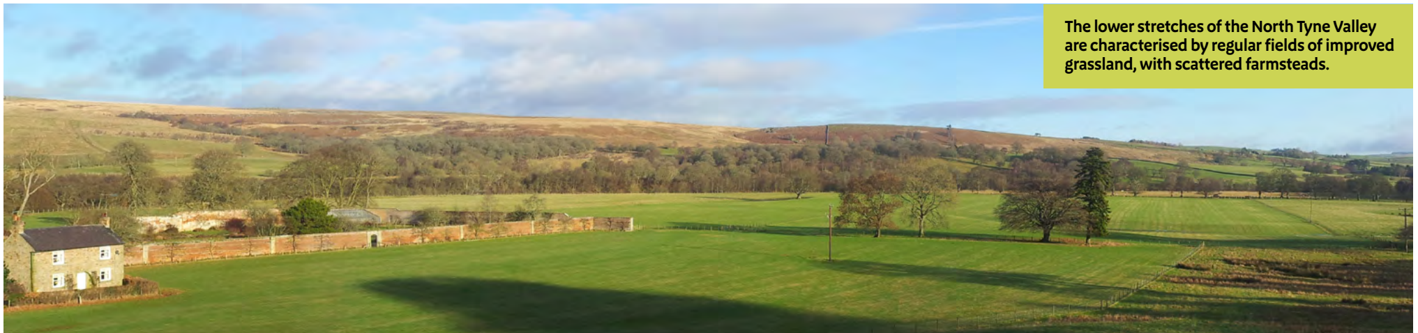
The lower stretches of the North Tyne Valley are characterised by regular fields of improved grassland, with scattered farmsteads.