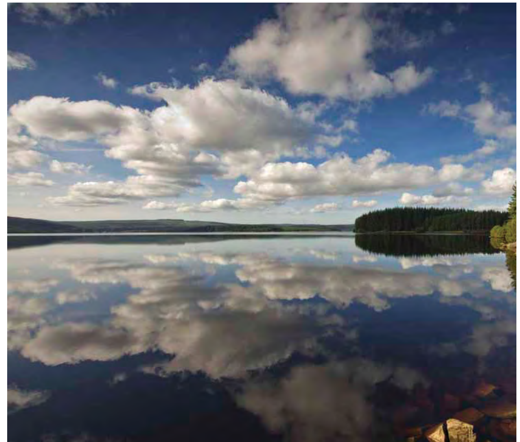
Kielder Water enhances the sense of tranquillity in the NCA, as well as offering opportunities for recreation.

Biodiversity and geodiversity are crucial in supporting the full range of ecosystem services provided by this landscape. Wildlife and geologically-rich landscapes are also of cultural value and are included in this section of the analysis. This analysis shows the projected impact of Statements of Environmental Opportunity on the value of nominated ecosystem services within this landscape.