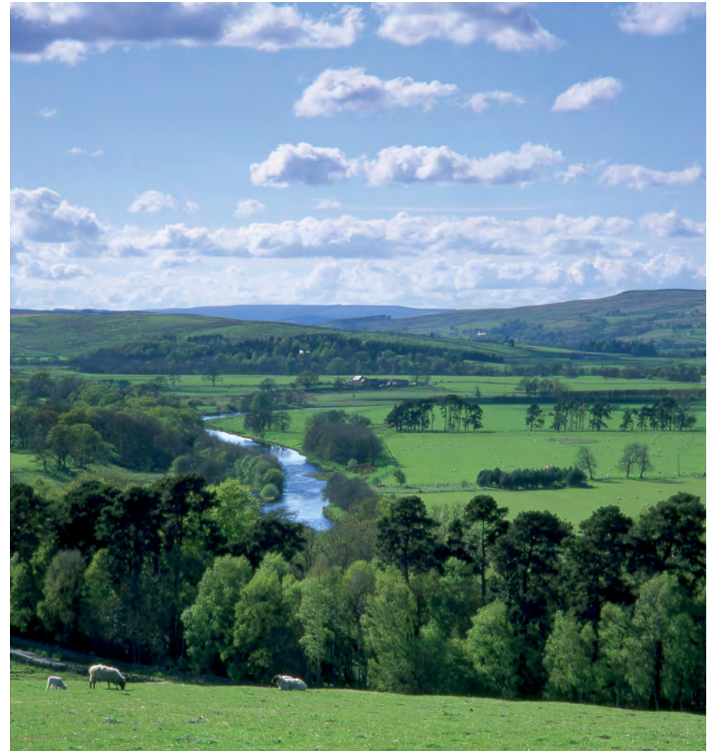
Maintaining woodland strips alongside watercourses , such as here in the North Tyne Valley, helps to reduce sediment run-off.