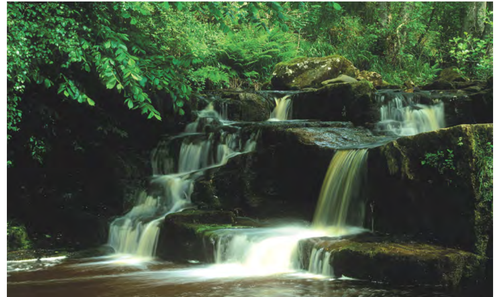
The uplands are drained by a network of streams and rivers in enclosed valleys, with narrow gorge sections.

Kielder Forest is the largest area of planted woodland in northern Europe, and forms a dramatic landscape of forested hillsides around Kielder Water. The forest consists of a variety of age classes and species including spruce, pine and larch, and is broken up by valleys and craggy outcrops, recently felled areas and forest tracks. Open mires also form a mosaic within forested areas. Kielder Forest supports a number of iconic wildlife species, and is one of the last strongholds in England for the red squirrel. Other important species include breeding osprey, otter, salmon and the Kielder feral goat, a descendant of domestic goats which now roams the area wild. It is a popular destination owing to its high landscape value and opportunities for walking, horse riding, cycling and mountain biking, and water-based activities, while osprey watching together with observation of other birds and wildlife are also popular activities.