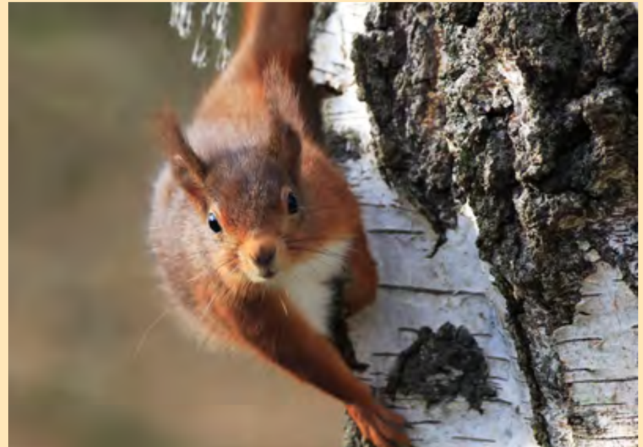
Kielder Forest is one of the last strongholds in England for the red squirrel.