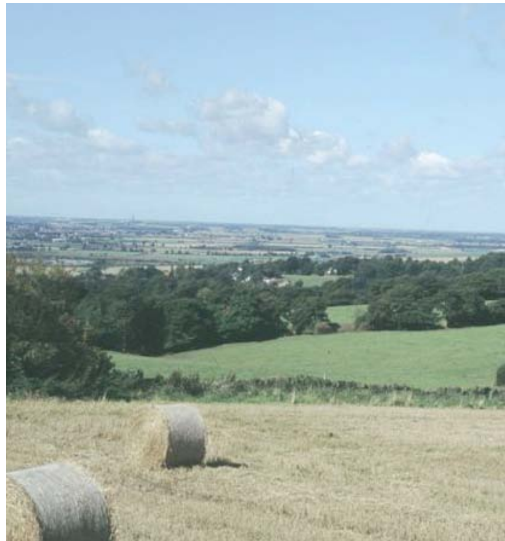
View from Parbold Hill across the Lancashire Plain.

To the south of the Ribble Estuary, the plain has a different physiographical history. This is reflected in the land use of the area: it is predominantly highly productive arable land much of it Grade 1, with some Grade 2 – with large, rectilinear fields bounded by ditches. Arable fields provide a habitat for farmland