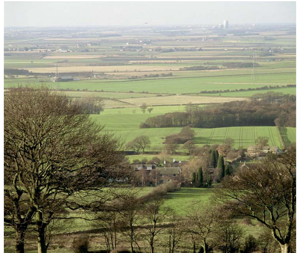
Harrock Hill across fields and villages towards Burscough.

Biodiversity and geodiversity are crucial in supporting the full range of ecosystem services provided by this landscape. Wildlife and geologically-rich landscapes are also of cultural value and are included in this section of the analysis. This analysis shows the projected impact of Statements of Environmental Opportunity on the value of nominated ecosystem services within this landscape.