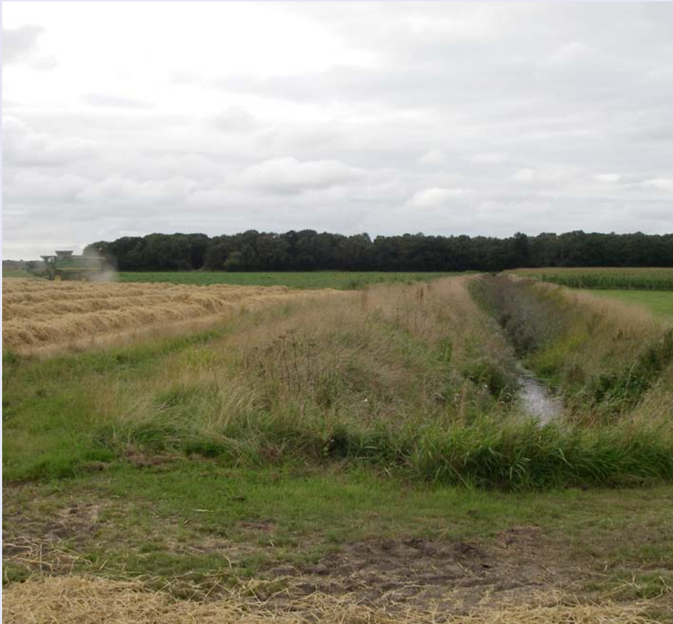
Agriculture near Rufford.