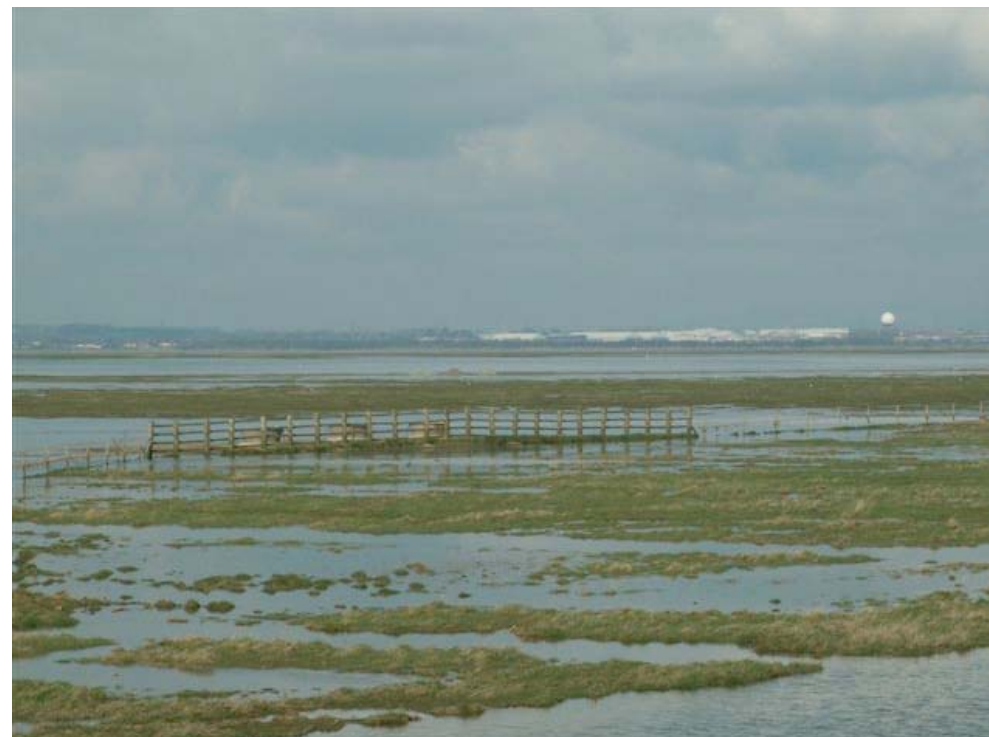
Ribble Estuary, Lytham can be seen in the background.