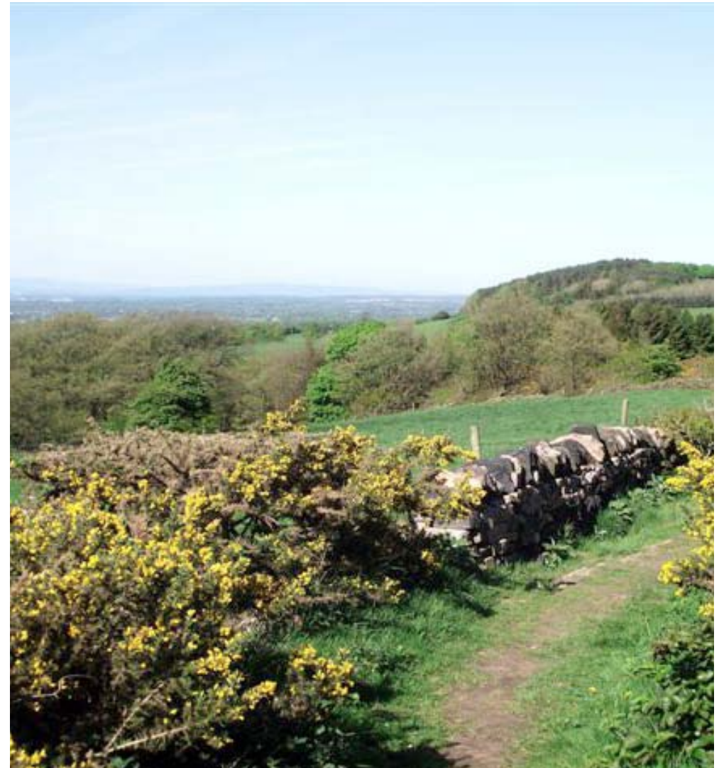
View across Harrock Hill towards Preston.

The Lancashire Cycleway crosses the NCA both above and below the Ribble Estuary, and there are long stretches of cycle paths around the coast. Other activities include birdwatching at the many marsh sites (including the Ribble Estuary National Nature Reserve, Hesketh Out Marsh, Fairhaven Lake and Granny's Bay, Pilling Marsh, Marton Mere, Rossall Point and Fleetwood Marsh), while the series of Local Nature Reserves (LNR) provide further opportunities for observing wildlife and enjoying contact with the natural environment.