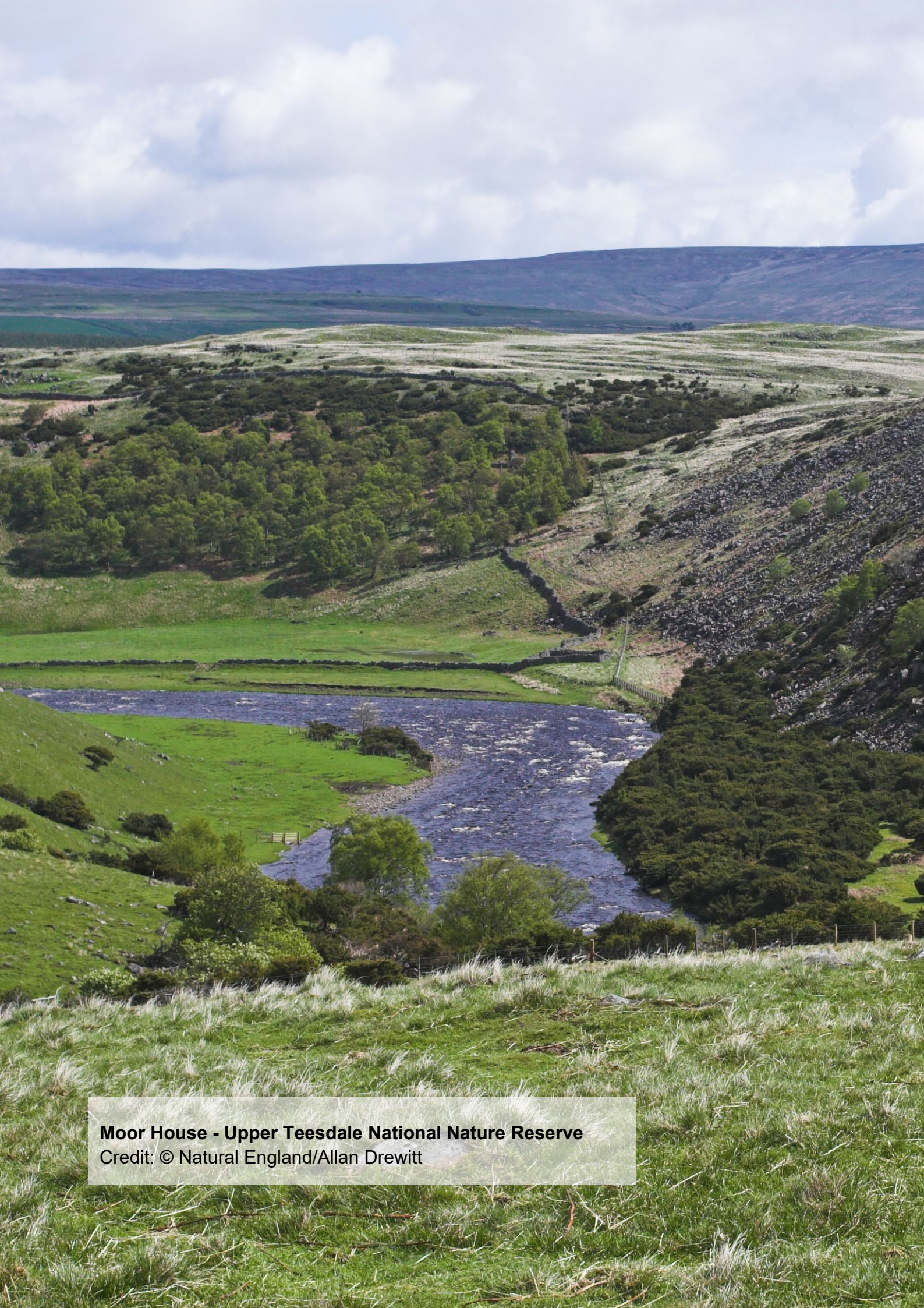
Moor House - Upper Teesdale National Nature Reserve