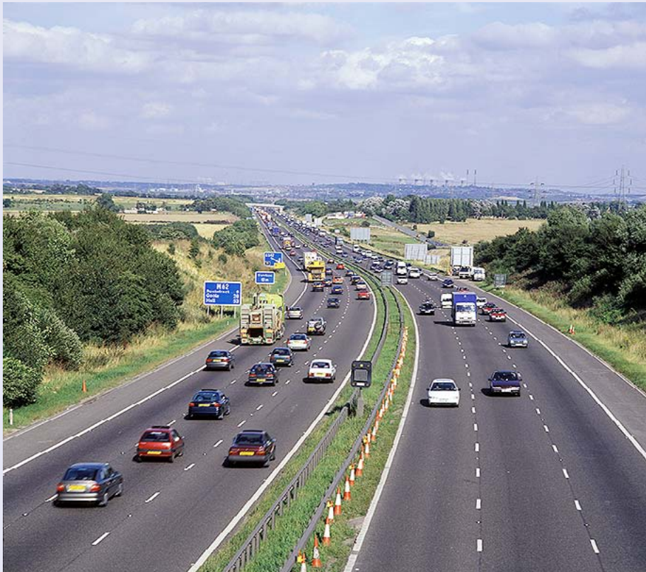
Key transport routes run through the NCA including major roads that have a large impact on the landscape.