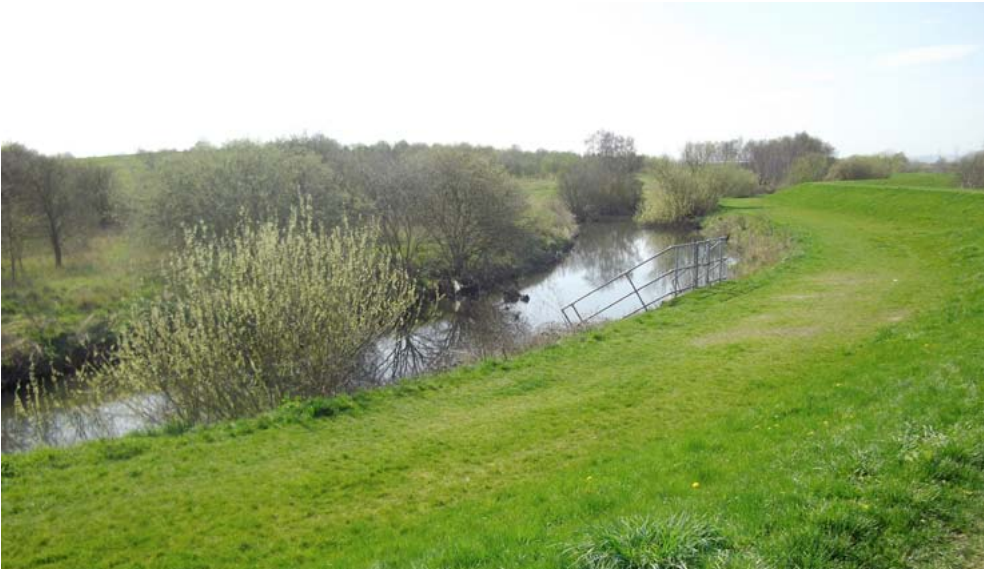
Several major rivers cross the area, including the Erewash, Aire, Calder, Don, Rother and, as seen here, the Dearne. Their courses have sometimes been heavily modified but they can form important foci for environmental enhancement and recreation.

It is, however, the working of coal by deep mining and later by open casting, together with resources of stone, fireclay, ironstone and soft water, which led to the greatest effects on the shape of the landscape by triggering the industrial growth which has been so dominant in its impact on the area.