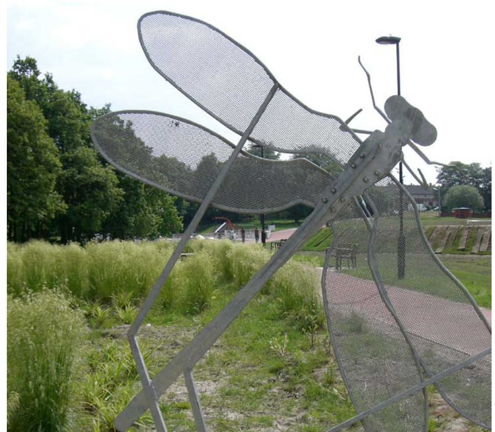
Busk Meadow Park in Shirecliffe, north Sheffield; a popular green space for local residents.

Biodiversity and geodiversity are crucial in supporting the full range of ecosystem services provided by this landscape. Wildlife and geologically-rich landscapes are also of cultural value and are included in this section of the analysis. This analysis shows the projected impact of Statements of Environmental Opportunity on the value of nominated ecosystem services within this landscape.