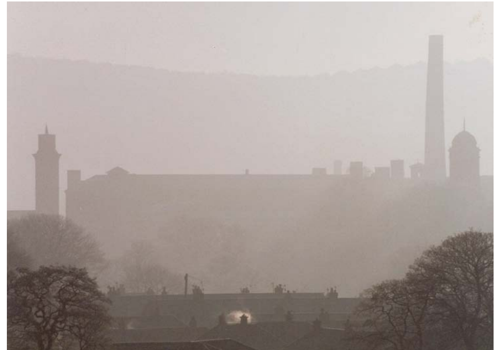
Saltaire, a World Heritage Site, is a model village created for workers at the Salts Mill.

The area's streams and rivers were subject to intensive management from the medieval period in order to power fulling, textile and metal-working mills. With the combination of these natural resources and good-quality agricultural land, wealth was rapidly accumulated from the 17th century onwards. Former deer parks were often landscaped in the 18th century, usually retaining their herds of deer. Wealthy industrialists created a number of large country houses, parks and estates in the area in the 18th and 19th centuries, many of which still contribute to the character of the landscape today.