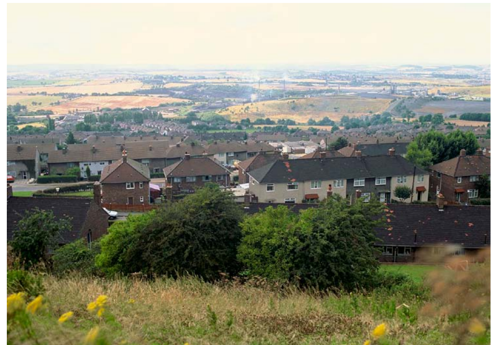
Restoration of former mining sites for biodiversity and recreation close to where people live has meant large changes in the landscape over the past twenty years.

Around Sheffield and Rotherham, the rivers Don and Rother are heavily urbanised. The River Don takes a large volume of treated effluent from Blackburn Meadows Waste Water Treatment Works (WWTW) in Sheffield while the Rother takes treated effluent from Old Whittington WWTW in Chesterfield. Key measures to help to restore better water quality are diverse and include the use of sustainable urban drainage systems in urban areas and new developments, the management of nutrient inputs in rural areas and the upgrading of sewage treatment works.