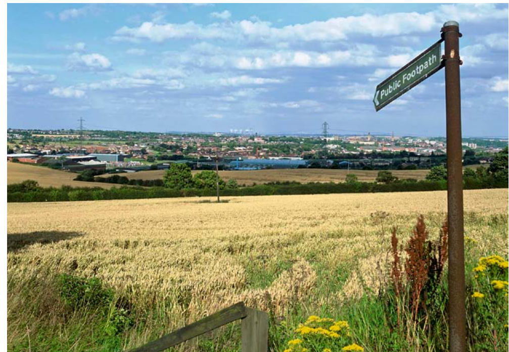
The NCA has many, different opportunities to improve and increase recreation for the local population.