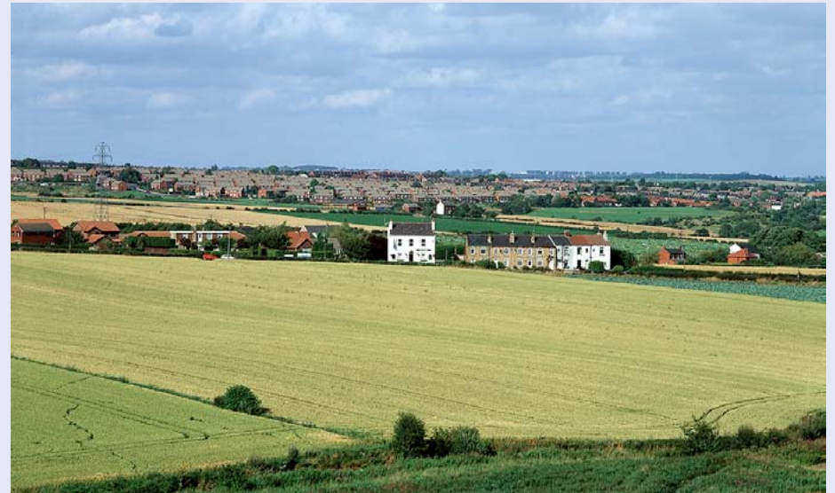
The NCA displays a mixed pattern of developed areas and farmed, open countryside.