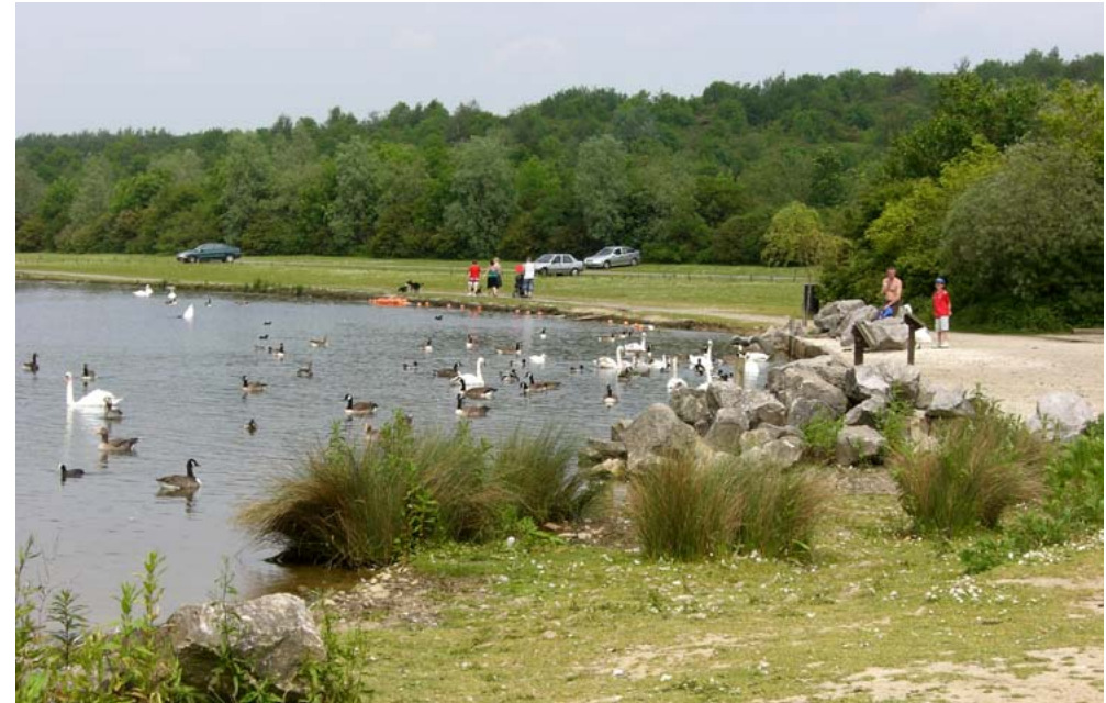
Rother Valley Country Park restored from opencast coal mining and a popular visitor destination for local residents in Rotherham, Sheffield and north-east Derbyshire.