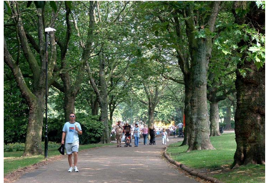
Award-winning Clifton Park in the centre of Rotherham, recently restored with Heritage and BIG Lottery Funds.