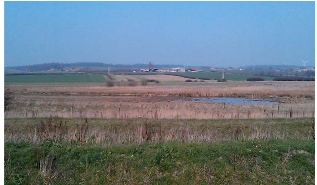
The river valleys of former mining areas today provide opportunities for habitat creation and creating a new landscape such as here at Adwick.

Country parks provide over 1,000 ha of accessible land within the NCA and are an important recreational asset, offering further opportunities to engage the local population. Reservoirs also provide opportunities for recreation, both active sites, for example Ulley, and inactive sites, such as Thrybergh. Recreational opportunities are provided by a large number of local walking initiatives, parks, reservoirs and canals, and links outside the NCA in the form of long-distance routes such as the Ebor Way. Further opportunities are afforded by closed mineral railway lines which have been developed into multi-user trails, such as the Trans Pennine Trail.