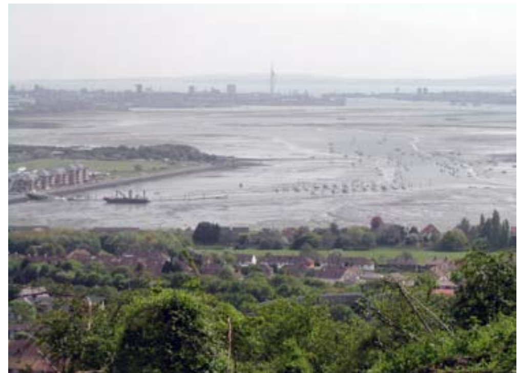
The view across Portsmouth Harbour from Portsdown Hill.

Two National Parks, the New Forest and South Downs, in neighbouring NCAs are popular recreational destinations for people from the Southampton area and elsewhere within the NCA. Southampton and the coastal river valleys offer many water-based activities such as yachting and attract visitors from outside the NCA.