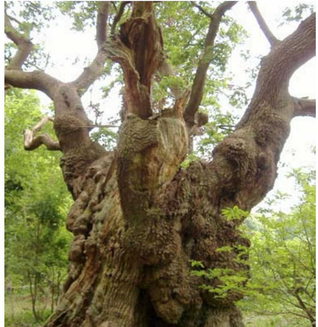
A veteran oak tree at Creech wood.

During the 20th century, Southampton emerged as the major starting point for cruise ships and it remains a major port today for both freight and passenger traffic with the port authority being the largest employer in the city. In the post-war period, other urban centres within the NCA, such as Waterlooville and Havant, saw a rapid expansion to provide housing for an increasing population. Southampton City Council became a unitary authority in 1997.