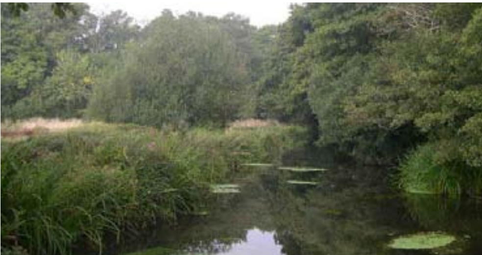
The River Test.