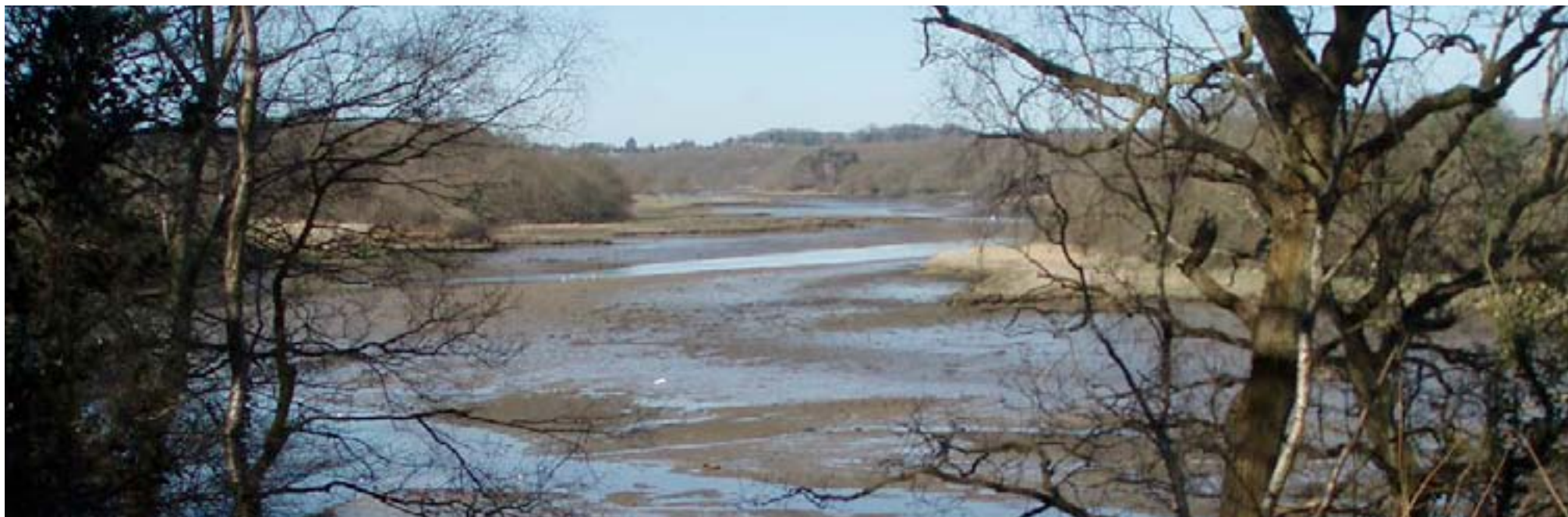
The unusual estuarine habitat of the Upper Hamble Estuary SSSI may be vulnerable to increased marine inundation in the future.

Biodiversity and geodiversity are crucial in supporting the full range of ecosystem services provided by this landscape. Wildlife and geologically-rich landscapes are also of cultural value and are included in this section of the analysis. This analysis shows the projected impact of Statements of Environmental Opportunity on the value of nominated ecosystem services within this landscape.