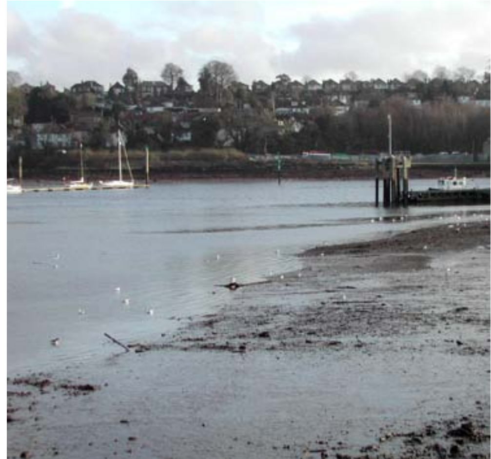
The mudflats of the Solent and Southampton Water SPA support a wide assemblage of waders and waterbirds.