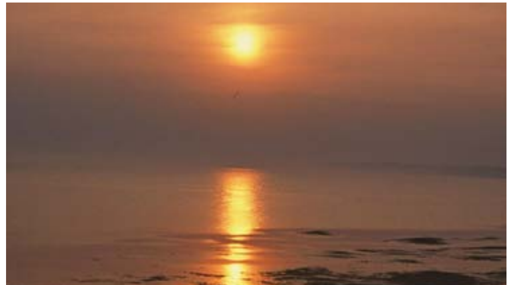
Sunset on Solent harbour