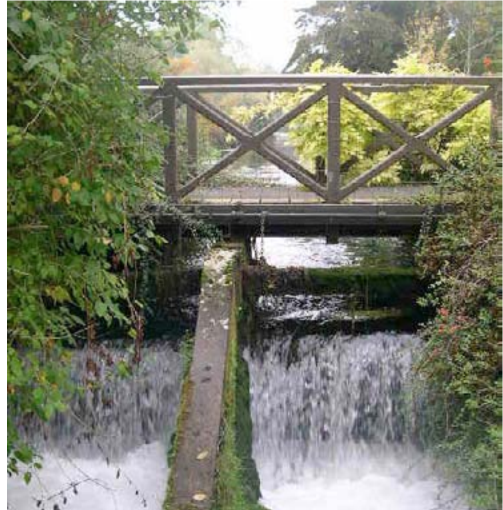
Weirs on the chalk rivers can act as barriers to fish passage.