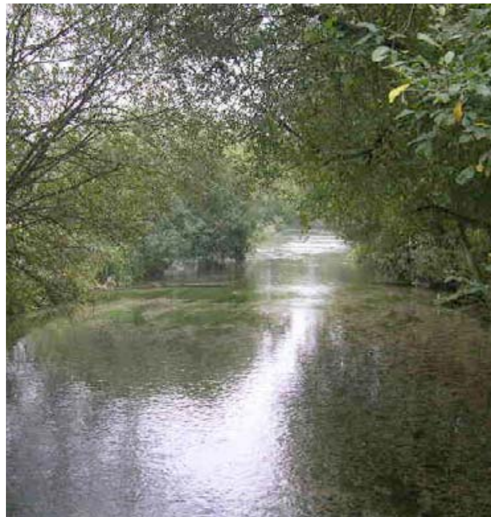
The River Test.

Maps are available from the Environment Agency showing current and projected future status of water bodies at: http://maps.environment-agency.gov.uk/wiyby/wiybyController?ep=maptopics&lang=_e