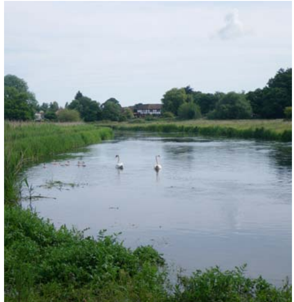
Swans on the River Itchen at Highbridge.