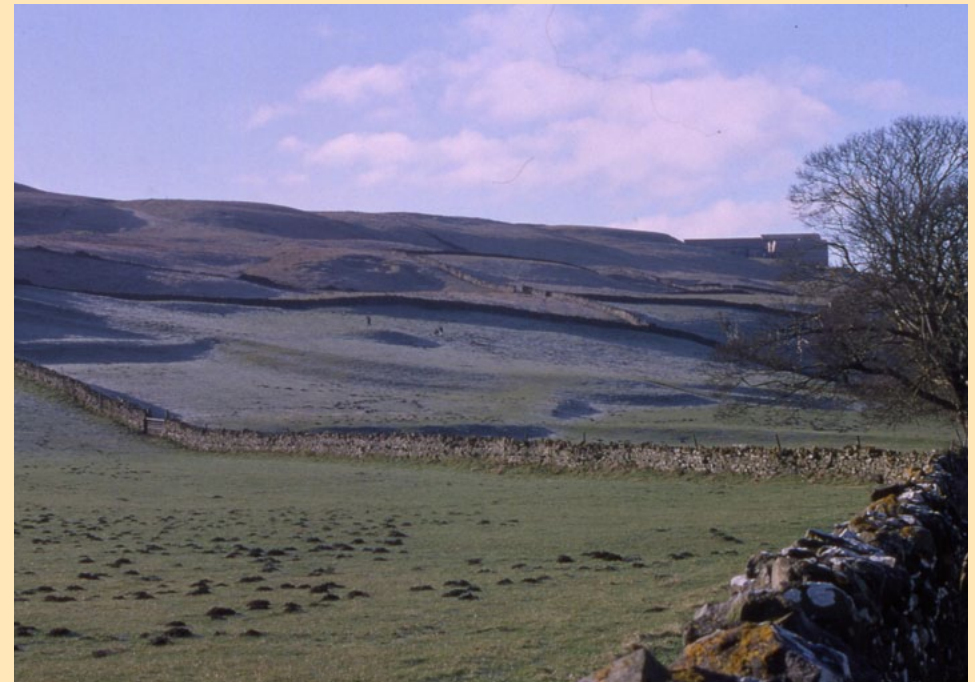
This view of a characteristic historic landscape near Eastgate in Weardale shows 18th century drystone walls cutting across a Romano-British track, with evidence of prehistoric field patterns and local small-scale quarrying. The 20th century cement works on the skyline have now been removed.

interpretation and enjoyment of the distinctive pastoral landscape of the dales, their history and their contribution to food provision, biodiversity, climate change mitigation and the landscape.