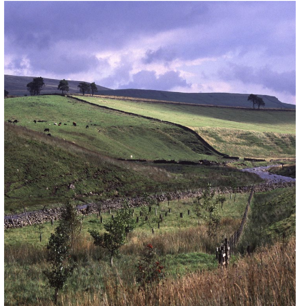
Small areas of broadleaved trees and scrub alongside watercourses can reduce soil erosion as well as provide shelter and food sources for black grouse.