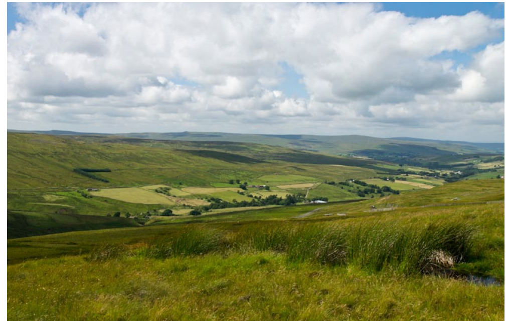
The North Pennines is an open and remote landscape, with extensive heather moorlands on the fell tops, rough pastures on lower slopes, and dispersed farms and a few small settlements in the valleys, as here in South Tynedale above Garrigill.