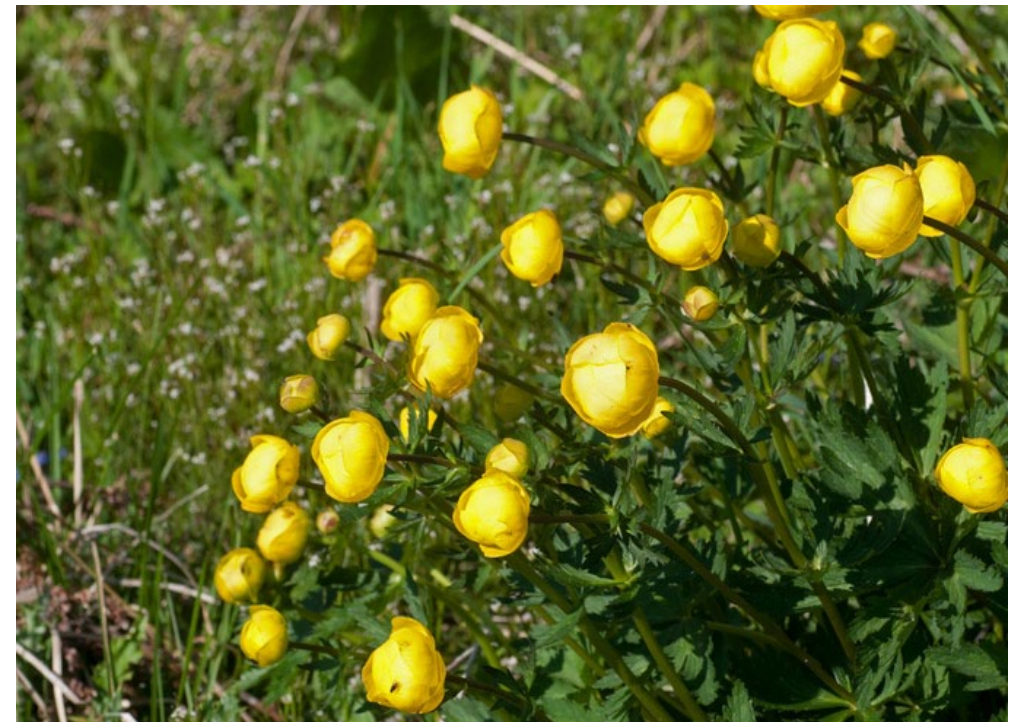
Road and track verges often support a range of wild flowers, such as these globeflowers on the side of a track in Langdon Beck.