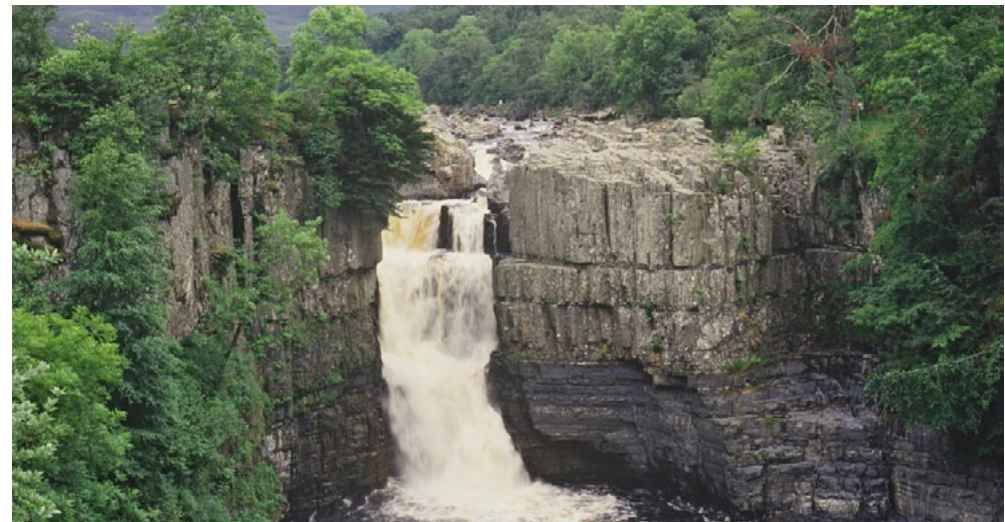
Dramatic waterfalls are created where rivers flow over the hard outcrops of Whin Sill, with High Force on the Tees one of the most popular sites with visitors.