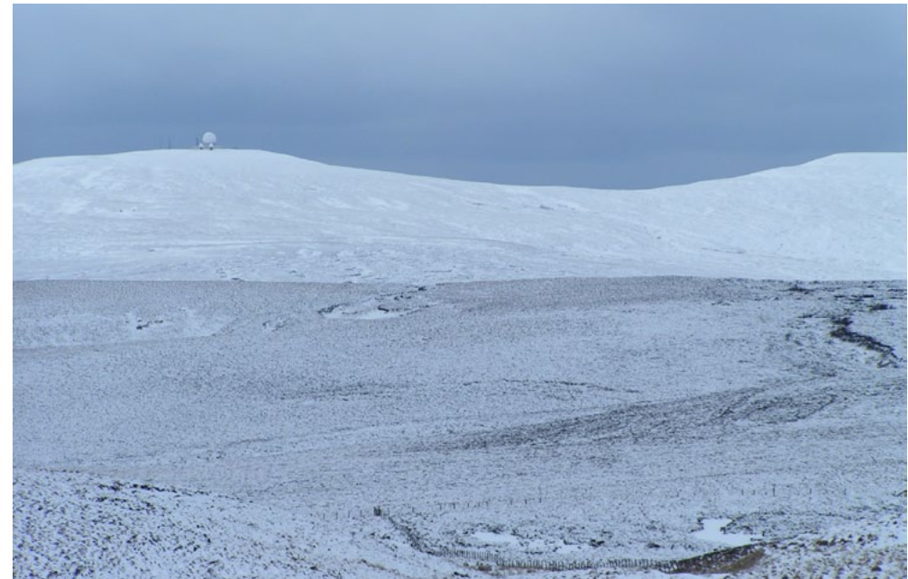
The high, extensive fells of the North Pennines experience a severe climate but offer some of the most wild and remote landscapes to be experienced in England.

The extensive areas of semi-natural moorland and grassland habitats form important links between the adjoining uplands to the north and south, with their similar habitats. The few roads and settlements are contained within valleys, reinforcing the area's sense of remoteness and tranquillity.