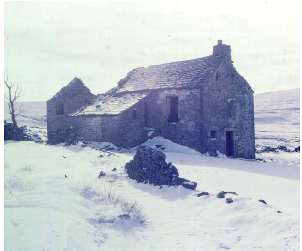
This abandoned byrehouse, near Westgate in Weardale, is typical of the vernacular architecture that arose from the 18th century miner / farmer landscape, with the family living on the first floor, above the livestock.