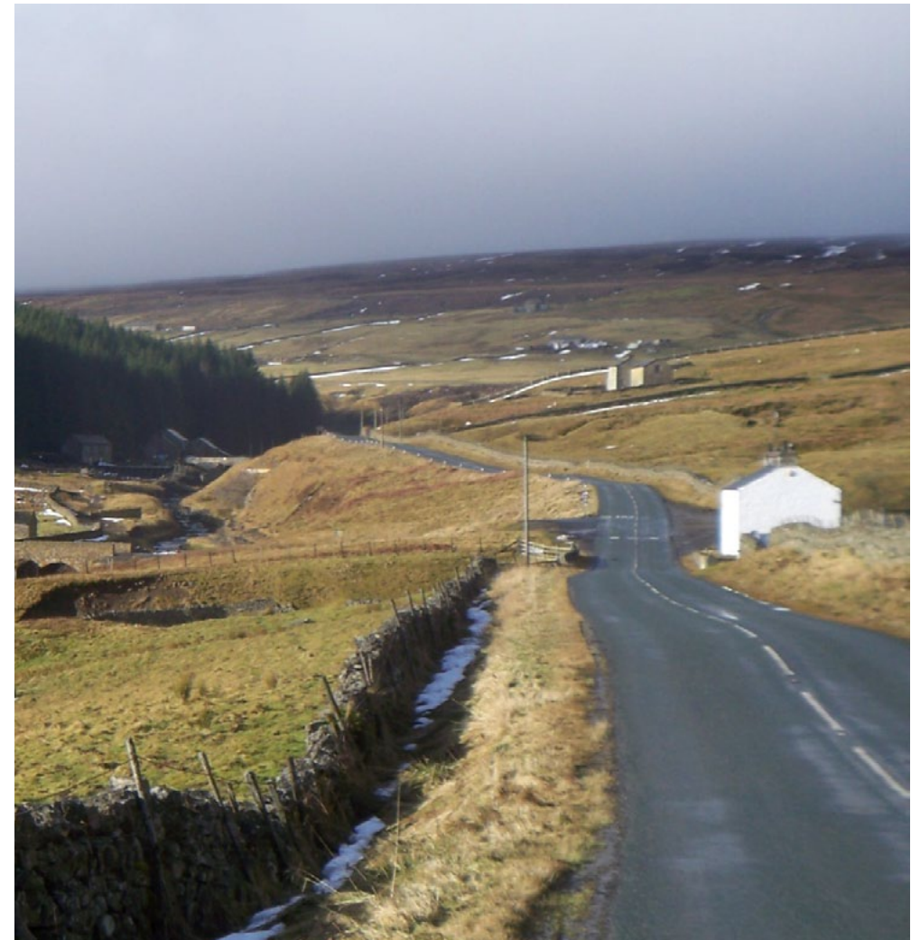
Kilhope Mine, with its restored structures and interpretation of the lead mining industry, and now sheltered by a 20th century plantation, is a popular heritage centre for visitors.

http://magic.defra.gov.uk/website/magic/ – select 'Landscape' (shows ALC classification and 27 types of soils).