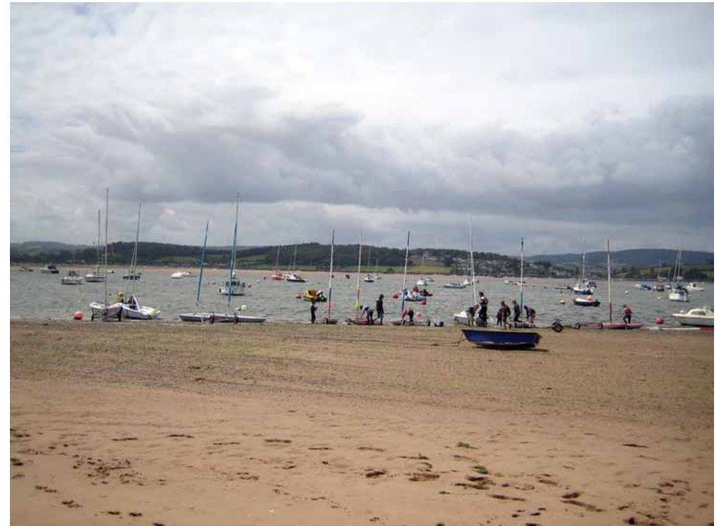
Recreational use of the internationally designated Exe Estuary.