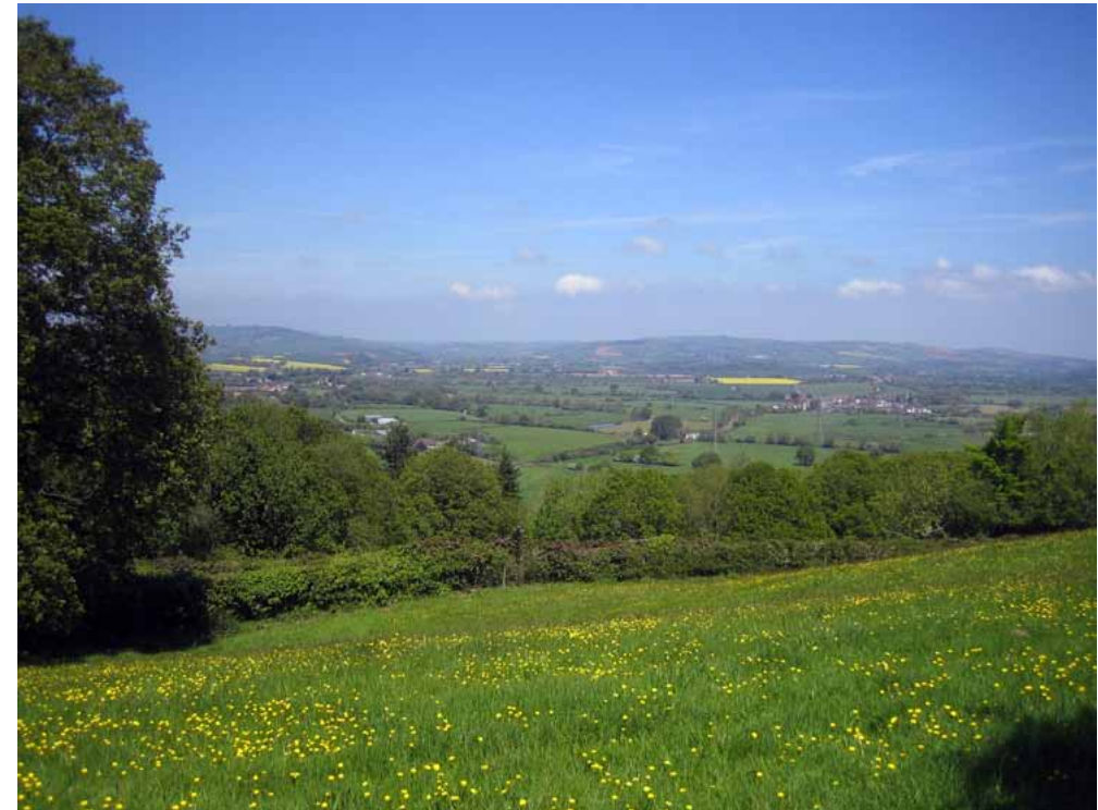
The extensive Exe Valley with hills rising to the north, an area supporting mixed agriculture.

SEO 4: Plan and manage for a strong landscape framework to support and integrate the expansion of Exeter, Exmouth, Teignmouth, Tiverton, Crediton and Cullompton, and the road and rail network throughout the area. Conserve and enhance the existing character, form and pattern of the area's historic settlement, from single farmsteads to larger villages.