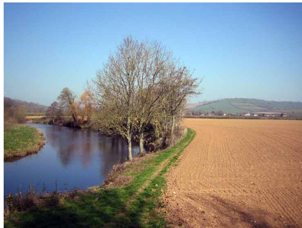
The River Exe meanders through the mixed farmed fertile flood plain.

Please note all figures contained within the report have been rounded to the nearest unit. For this reason proportion figures will not (in all) cases add up to 100%. The convention <1 has been used to denote values less than a whole unit.