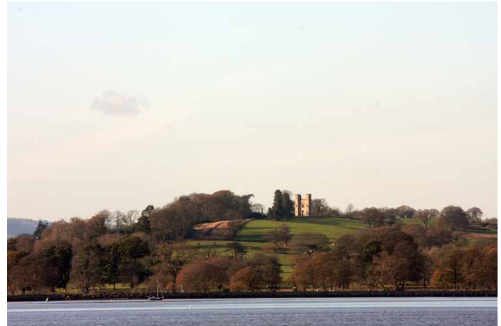
One of the historic designed landscapes overlooking the Exe Estuary: Powderham Belvedere.

Other changes across the NCA include the implementation of a Heathland Management Plan for the East Devon Pebblebed Heaths, and there has also been quite a significant change of use on the Haldon Hills with the development of a mountain biking centre. Renewable energy technologies are starting to have a cumulative impact and larger developments in adjoining NCAs are influencing the setting of the NCA in places.