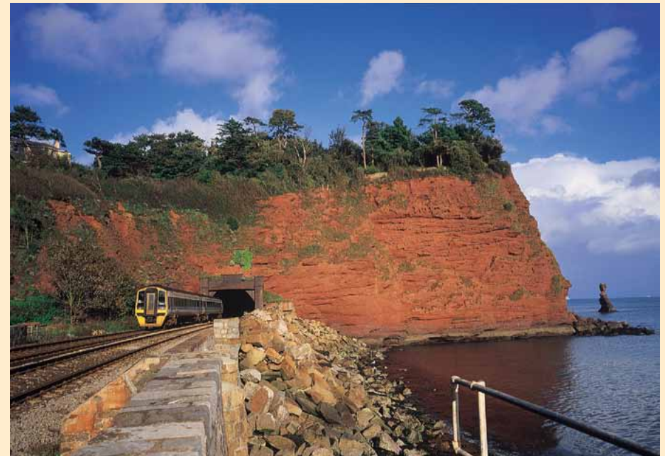
The London to Penzance train line cutting through and along the coast.