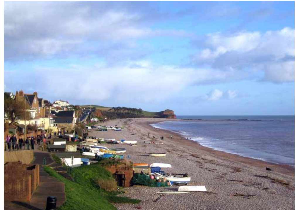
The extensive pebble beach at Budleigh Salterton with the spit denoting the mouth of the River Otter; part of the Jurassic Coast World Heritage Site.

Medieval and post-medieval archaeology is all around and beneath the Redlands as well, as in prominent monuments such as the Norman Tiverton