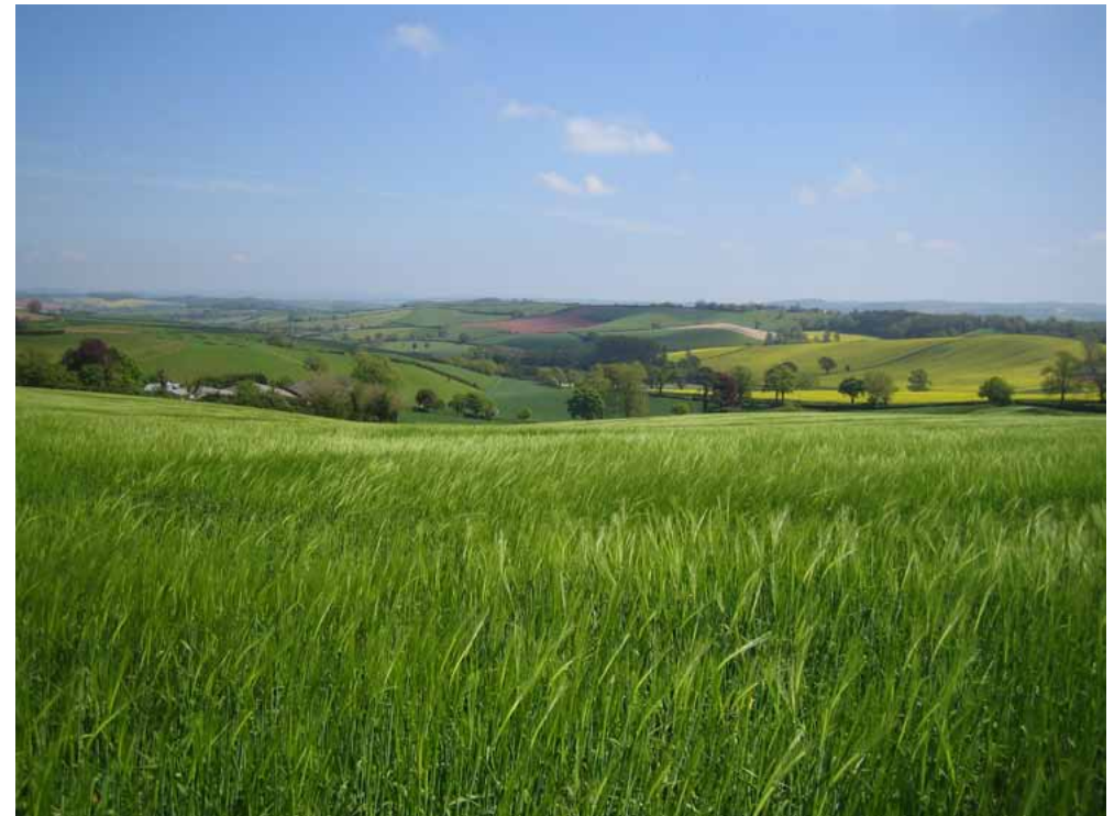
Far reaching views across the Devon Redlands from the west.

Biodiversity and geodiversity are crucial in supporting the full range of ecosystem services provided by this landscape. Wildlife and geologically-rich landscapes are also of cultural value and are included in this section of the analysis. This analysis shows the projected impact of Statements of Environmental Opportunity on the value of nominated ecosystem services within this landscape.