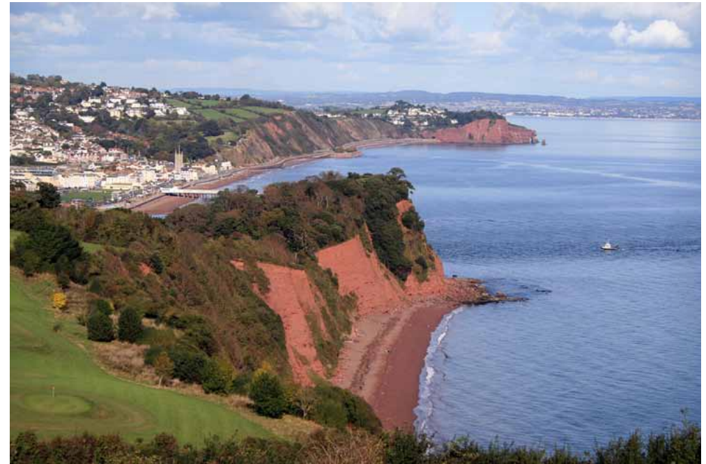
The distinctive red coastline under multiple use.

Towards the coast, the hills gradually decrease in height (176 m) and appear more rounded with gentler, convex slopes. The river valleys widen into more open flood plains emphasised by larger fields, low-cut hedgerows or fences and a lack of tree features. Arable dominates on the better, flatter land around the centre of the NCA, although the lower flood plains are generally devoted to permanent pasture. The coast is dominated by striking red cliffs and rocky shores. The sea has eroded to form well-developed wave-cut platforms and spectacular stacks, such as at Ladram Bay. The geological significance of the coast from Exmouth eastwards is such that it forms part of England's only natural World Heritage Site. The rivers Exe, Teign and Otter break through the sandstone cliffs into estuaries of reedbeds and salt and grazing marshes; all are protected at their mouth by sand or pebble spits extending from long beaches. Significant bird populations, including the avocet, use the estuaries over winter. The Exe Estuary is one of the most highly designated sites in south-west England, recognised at international, European and national levels. The entire length of the coast in this NCA is accessible by the South West Coast Path National Trail.