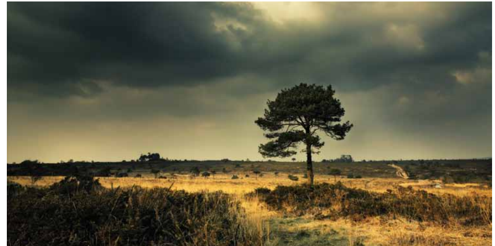
Open lowland heath and 'big' skies on the East Devon Pebblebeds.

All the main rivers flowing through the Devon Redlands rise in adjoining, higher NCAs and flow into the sea through tidal estuaries. The Exe rises on Exmoor and passes for 39 km through the NCA before flowing into the internationally designated Exe Estuary. On its course it passes through Exeter, a regional centre and hub for all road and rail networks into Devon and Cornwall. The Teign rises on Dartmoor and flows southwards outside, but parallel to, the Devon Redlands before turning abruptly eastwards at Kingsteignton into the estuary. The Otter rises in the adjoining Blackdown Hills before flowing out to sea through the nationally