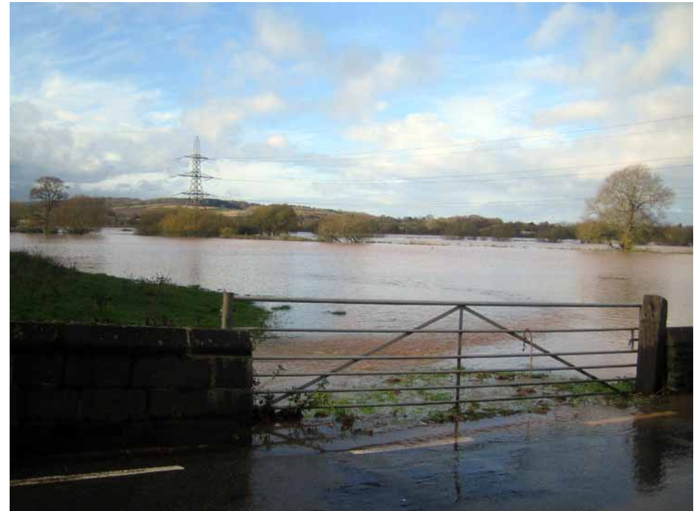
Extensive flooding across the Exe Valley.

storm surge, as a result of an eroding coastline and rising sea levels. Strategies of 'Hold the Line' are still largely identified as the current practical option for much of the coastline, including around Budleigh Salterton, Exmouth and stretches south of Dawlish Warren. Managed realignment options are already being considered for parts of the coastline – including the option for possible extension of intertidal habitats north of Powderham Bank associated with the River Clyst if some defences are allowed to fail at Dawlish Warren (as part of the Exe Estuary Coastal Management Study, 2008).