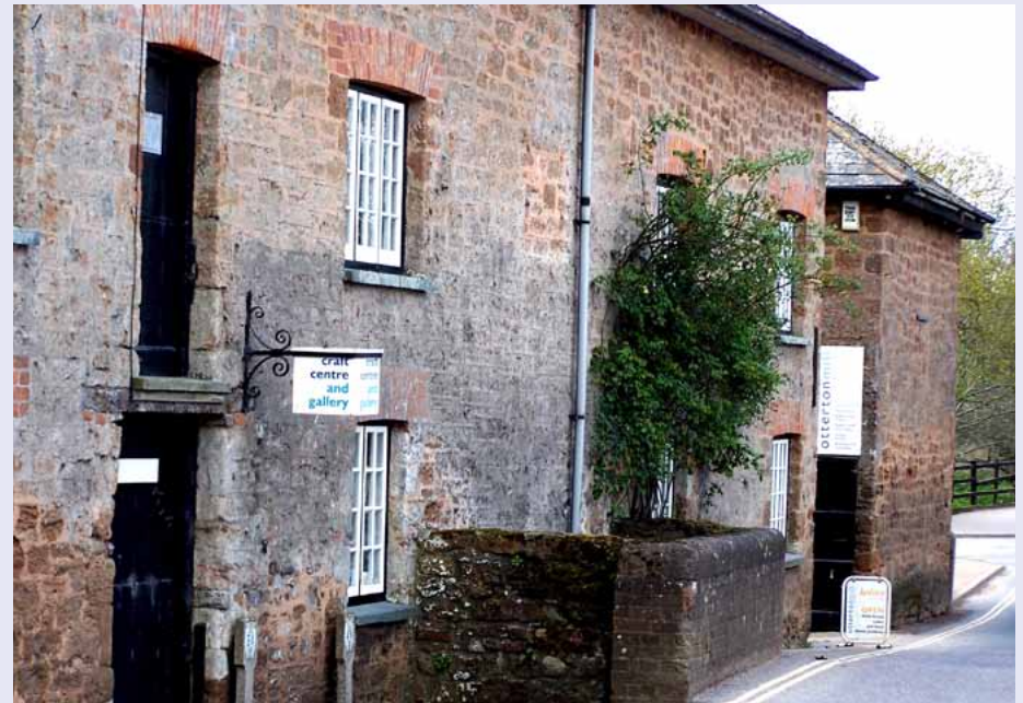
The distinctive red geology reflected in historic buildings: a working mill has been at Otterton since the Norman times.