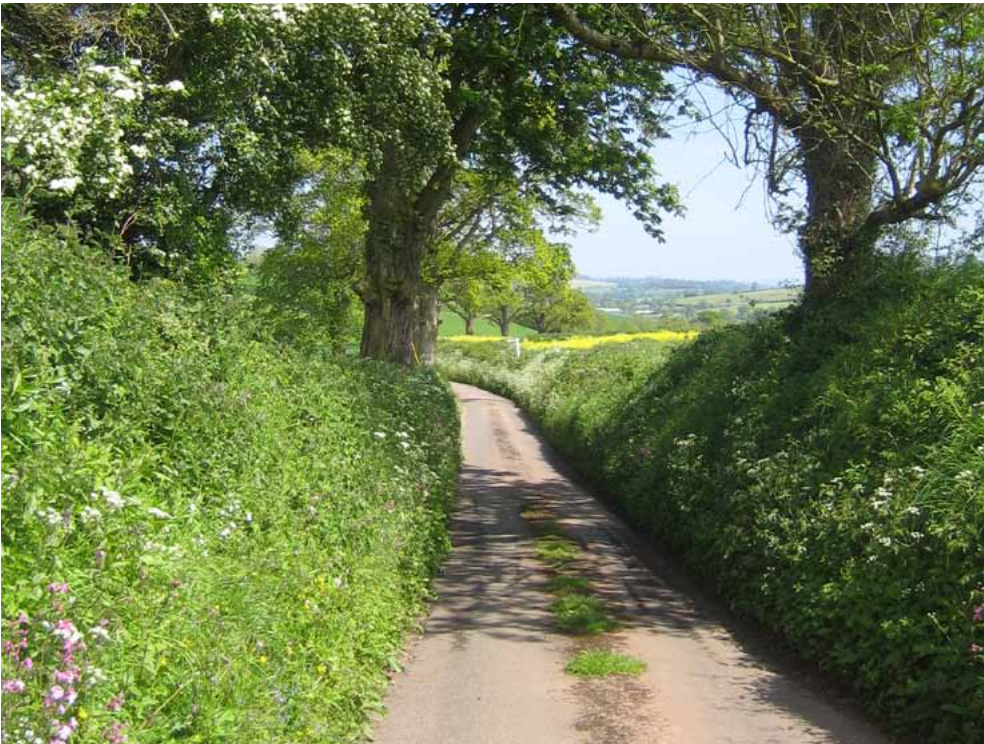
Floristically rich sunken lanes.