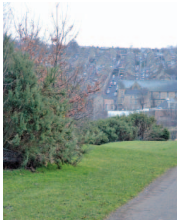
Green space at Newburn Riverside, Newcastle