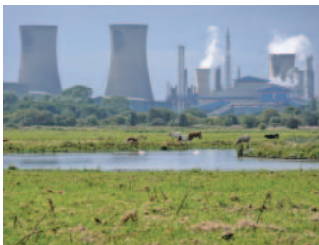
North Tees Marshes