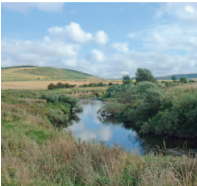
River Till SSSI