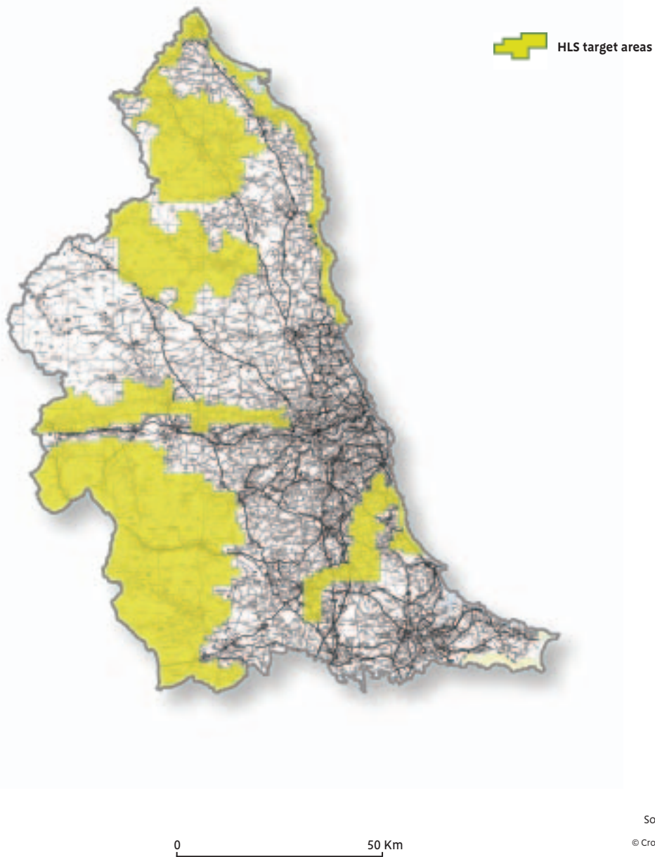
Figure 4 Natural England Higher Level Stewardship Target Areas in the North East