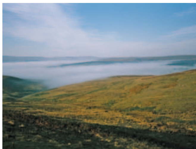
Stanhope, County Durham