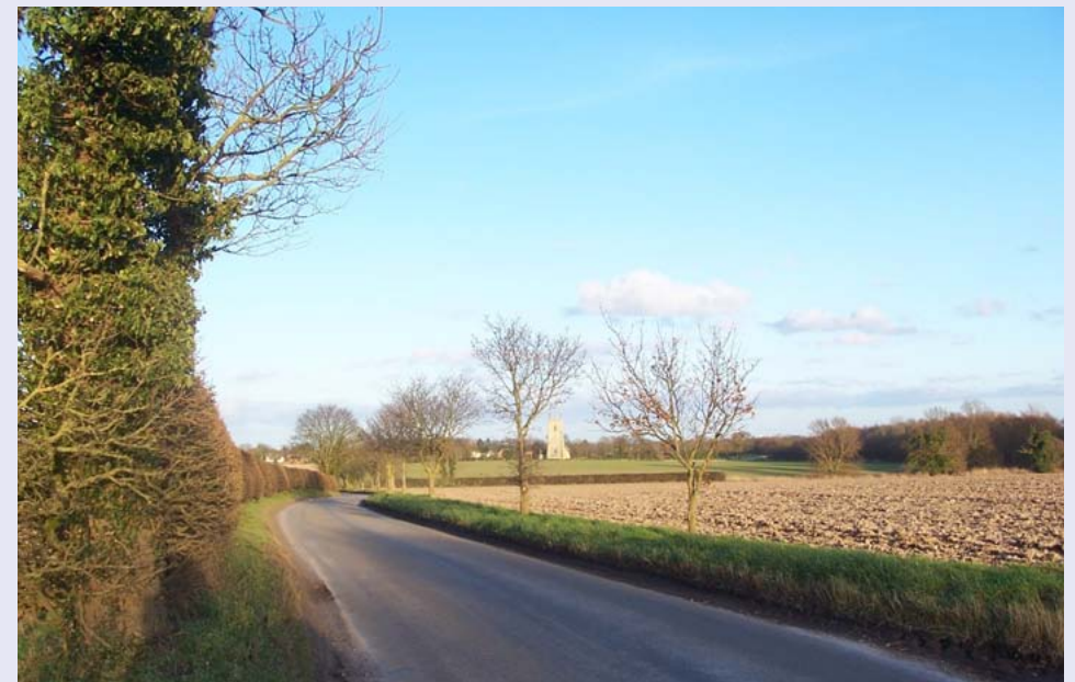
Churches are very prominent in the open landscape with blocks of woodland and copses seen along the Broads margin.