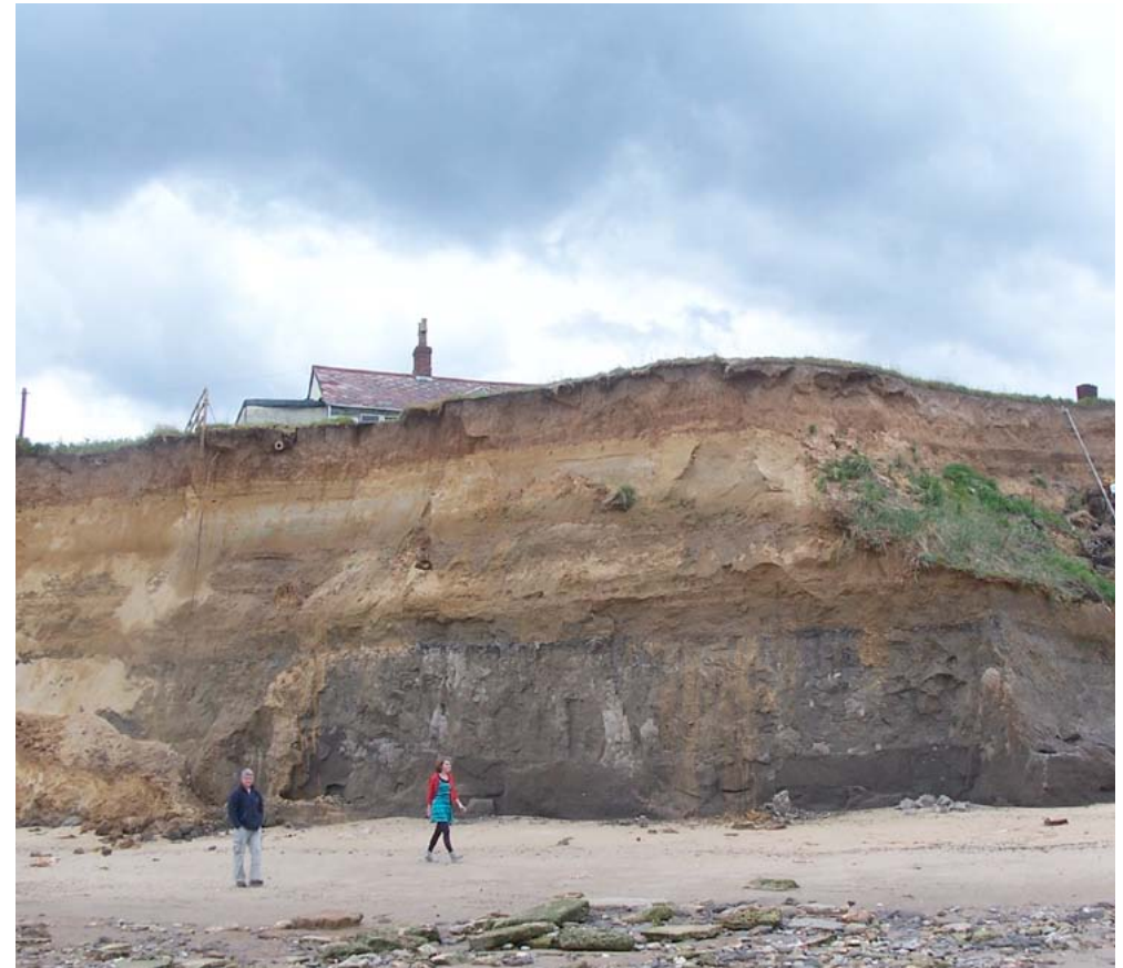
Coastal erosion at Happisburgh in summer 2013. Work is being carried out with communities to help adapt to coastal change and sea level rise, while also enhancing people's education and enjoyment of the area.