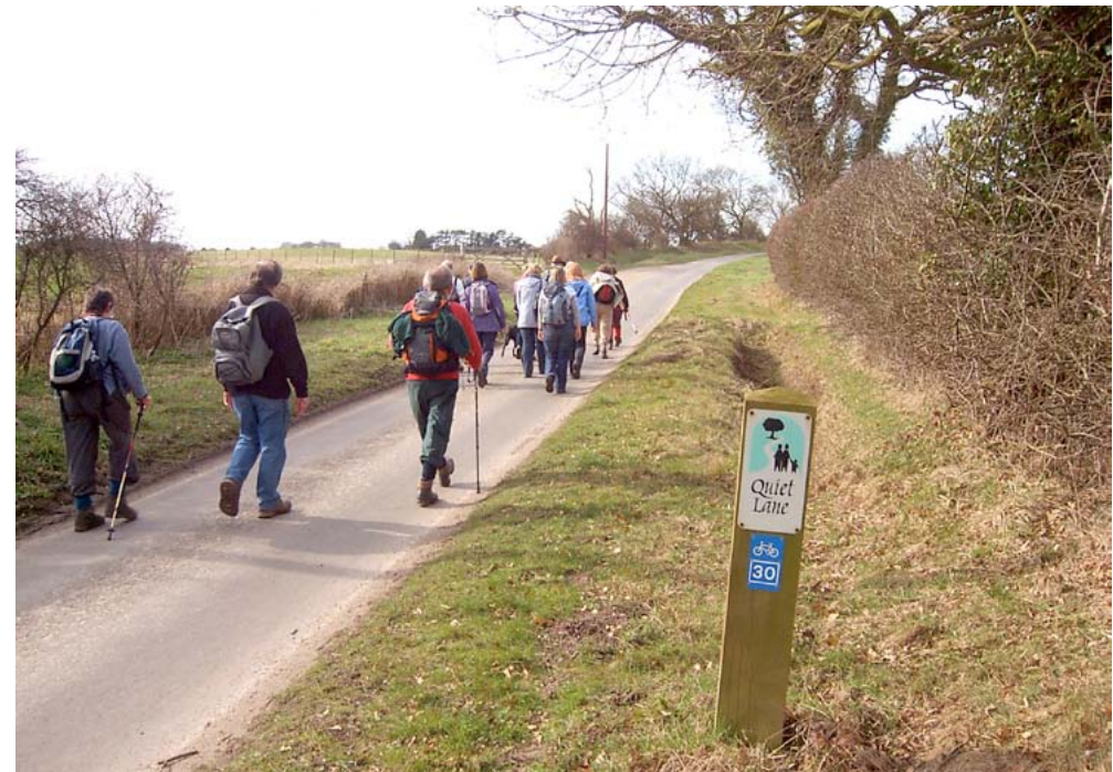
Designated Quiet Lanes near North Walsham provide a network of routes around minor roads for cyclists and horse riders.