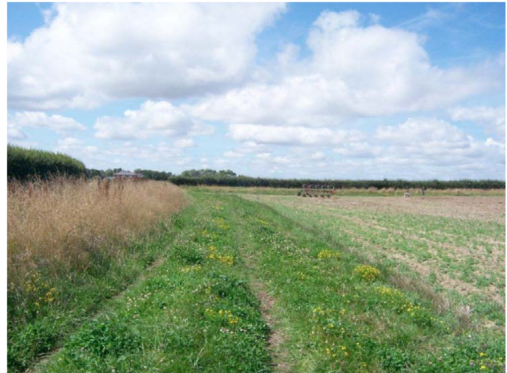
Arable margins have been created in intensively managed agricultural fields as a result of Environmental Stewardship. They also offer opportunities for educational visits.

Biodiversity and geodiversity are crucial in supporting the full range of ecosystem services provided by this landscape. Wildlife and geologically-rich landscapes are also of cultural value and are included in this section of the analysis. This analysis shows the projected impact of Statements of Environmental Opportunity on the value of nominated ecosystem services within this landscape.