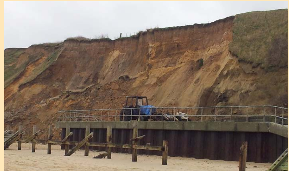
North East Norfolk and Flegg is shaped physically by its underlying geology and also by the influence of the sea and coastal processes.