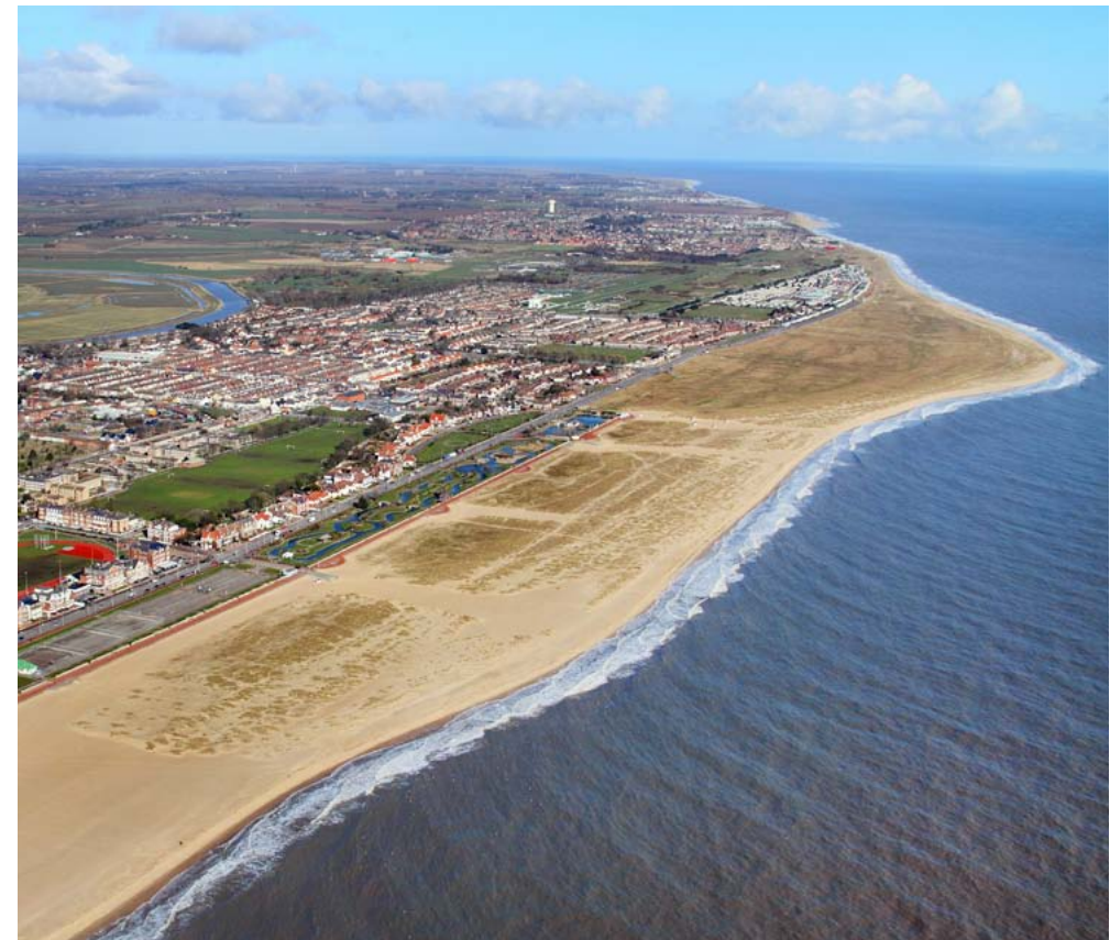
North Denes Special Protection Area, Great Yarmouth, with its wide sandy beaches and vegetated sand dunes is popular with tourists as well as a rare colony of little terns that return to nest here every May.

Great Yarmouth is also an important seaside resort, along with Gorleston-on-Sea, Caistor-on-Sea and Hemsby. Their attractive, wide, sandy beaches provide beach holidays and recreational access to millions of people each year. Large caravan, chalet and theme parks dominate the southern coastal strip.