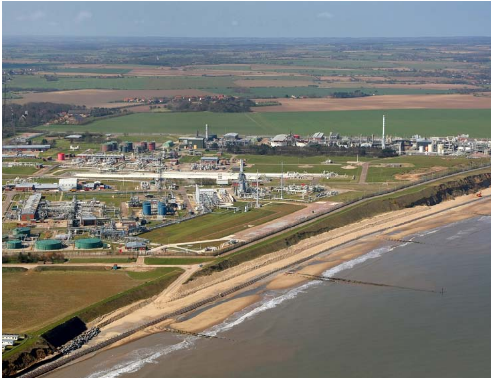
Views are panoramic and expansive along the coastline and out to sea. Bacton Gas Terminal, a site of national strategic importance, is a striking feature, dominating the cliff-top landscape for some distance around.