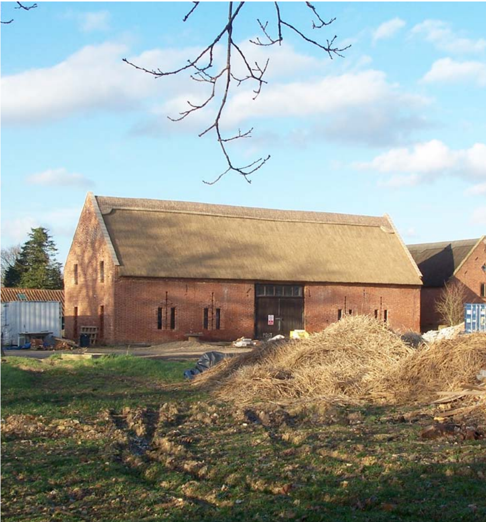
Conserving the historic environment and key features of 'settlements such as historic barns and enclosure patterns, together with sites of archaeological interest.