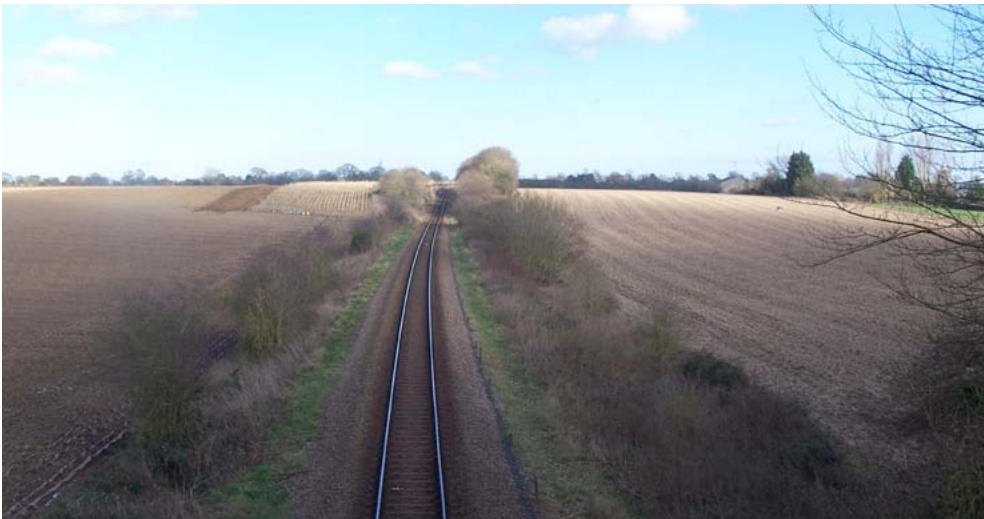
Railway lines physically connect the three distinct areas of the NCA together - view from Lingwood towards Great Yarmouth.

The North East Norfolk and Flegg National Character Area (NCA) is intimately linked with The Broads NCA, which wraps around and between the three distinct parts of this NCA, occupying the flood plains of the five major rivers that form the core of the Broads. Two of the distinct areas of the NCA abut the coast; the other lies entirely inland. To the west, the NCA adjoins the Central North Norfolk NCA, the topography of which is more varied. Great Yarmouth forms its thin, southernmost extent, joining at this point with the northern extreme of the Suffolk Coast and Heaths NCA.