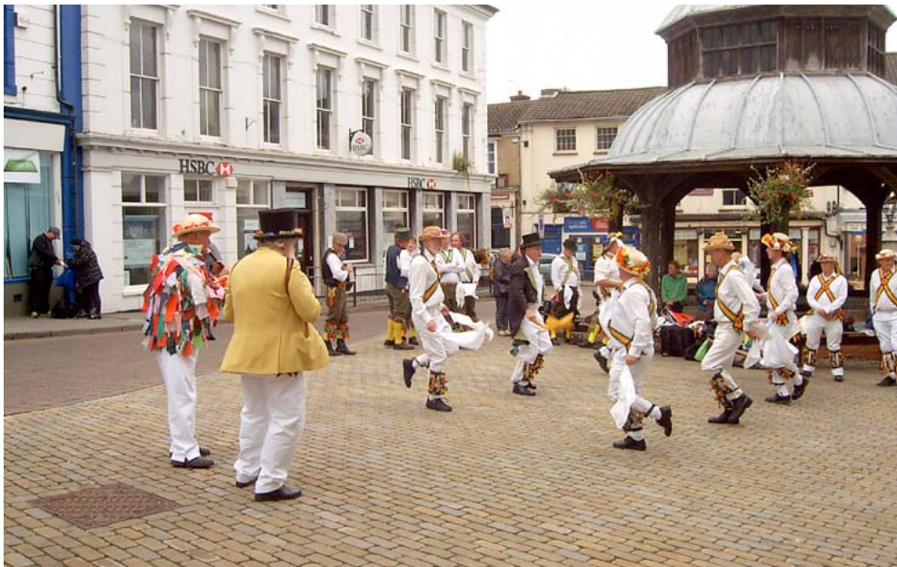
North Walsham is the principal market town in the NCA and was a textile and weaving centre in the 14th century. It has a Flemish influence and is built with flint and red brick with roofs of Norfolk reed thatch or pantiles.

Second World War defences are a prominent feature along the coast, particularly at Winterton-on-Sea, demonstrating the importance of the area to the country's defence at this time.