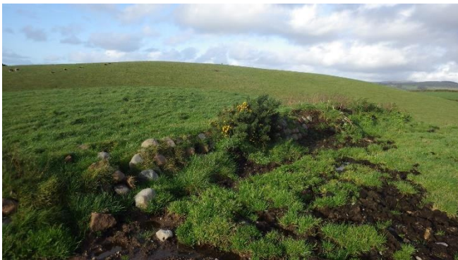
Hallsenna Moor field boundary

Lying within a mostly agricultural landscape, Hallsenna Moor was designated a SSSI and National Nature Reserve (NNR) in 1986. The site has never been cut for peat and supports a range of plants including those typical of woodlands, valley peatland, wet and dry heathland and fen. The Black Beck watercourse runs through the SSSI and suffers from various pollutant issues.