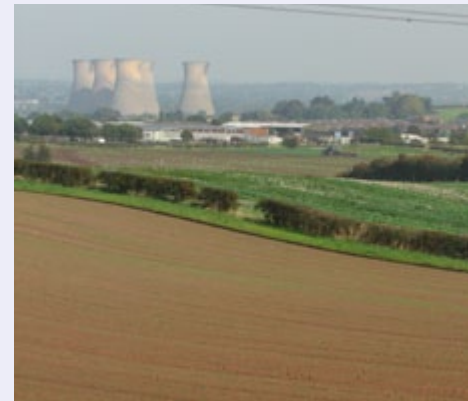
Triassic siltstones and mudstones of the Mercia Mudstone Group, produce a gently rolling plateau of productive, reddish, clay soils suitable for agriculture.