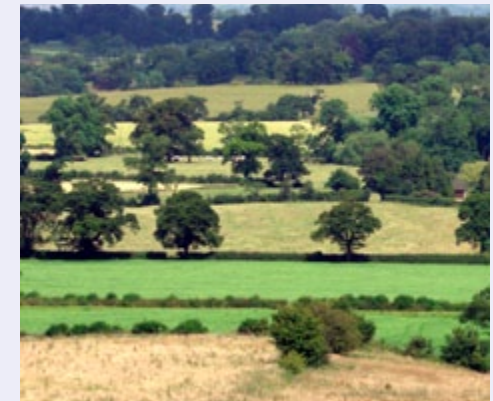
Hedgerow trees, in the wooded estatelands add to the sense of wooded character and enclosure in the surrounding farmland.