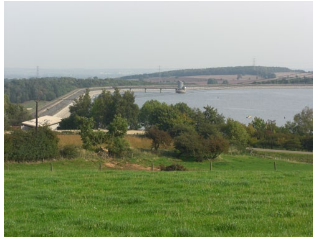
Foremark Reservoir. One of two reservoirs in the NCA that supply drinking water to Leicestershire and the wider area.

The M1 and A42 cross the NCA, and East Midlands Airport is sited on a natural plateau in an otherwise undulating area.