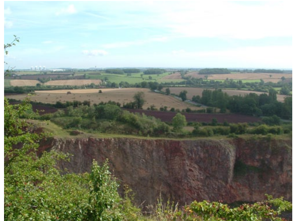
View across and out of the NCA from Breedon Hill with the quarry in the foreground. In the distance, the control tower of East Midlands Airport just within the NCA and the cooling towers of Ratcliffe on Soar power station in Leicestershire and Nottinghamshire Wolds NCA.

An outcrop of the Sherwood Sandstone Group extends towards the River Trent, and this serves as a recharge area for the deep Sherwood Sandstone aquifer, the second most important aquifer in the UK. It is exploited by the brewing industry in Burton-upon-Trent, located in the neighbouring Trent Valley Washlands NCA.