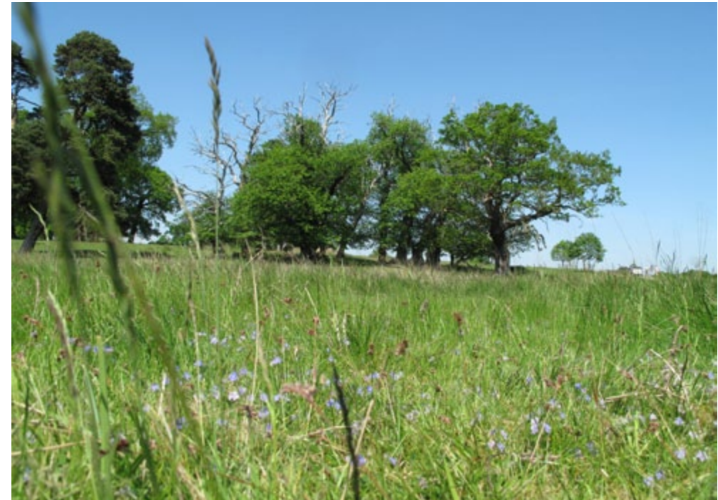
Calke Park, designated both an SSSI and an NNR is recognised internationally for wood pasture and parkland.

The rocks provide strong cultural associations, for example, the spectacularly sited church at Breedon-on-the-Hill is built on an outcrop of Carboniferous limestone on the site of an iron-age hill fort and, later, monastery. Sandstones from the Millstone Grit and Sherwood Sandstone Groups have been