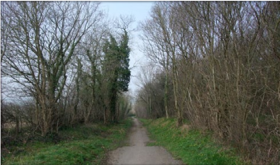
Disused mineral railway lines provide opportunities for recreation. National Cycle Route 6 skirts the boundary of Cloud Wood in the south of the NCA.

The settlement pattern comprises predominantly large, nucleated villages, those furthest from the Trent Valley built of attractive, mellow yellow brick, with a few surviving timber-framed buildings. Settlements closest to the Trent Valley have been enlarged in recent times; Melbourne, Repton and Castle Donington are predominantly red brick, with local sandstone detailing and imported slate.