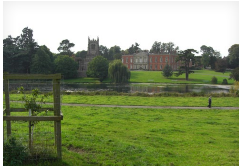
The proliferation of country houses reached a peak in the 17th and 18th centuries. The parkland landscapes make a major contribution to the area both in terms of landscape character and visitors to the NCA.

The rolling, undulating landscape of the Melbourne Parklands is predominantly a tranquil, agricultural landscape that retains a historic estate influence. Most