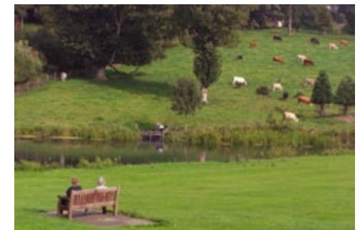
Contrasting strongly with the urban areas, the tranquil setting of Staunton Harold Reservoir attracts visitors seeking quiet recreation.