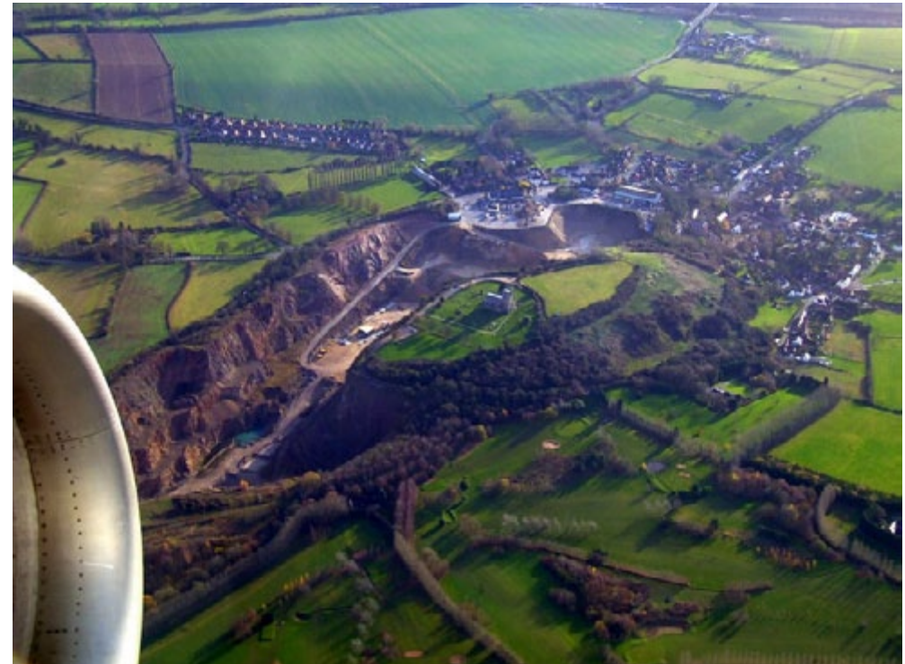
The spectacularly sited church at Breedon-on-the-Hill overlooks cliffs created by quarrying of the Carboniferous Limestone.

Large quarries straddle the southern boundary of the NCA and are a localised feature in an otherwise agricultural landscape. Both Cloud Hill Quarry and Breedon Quarry are important sources of magnesium-rich dolomitic limestone or dolostone. The stone has had many uses, including as a source of lime and