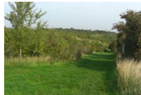
Twenty-five per cent of the NCA is within The National Forest. Woodland planting is strengthening the landscape character of the NCA.

The sense of place and tranquillity within the NCA changes at the eastern and western boundaries of the NCA, with the juxtaposition of the urban fringes of Burton-on-Trent and Swadlincote in neighbouring NCAs in the west, and East Midlands Airport, with its passenger and freight handling centre, in the east. The M1 and A42 also cross the NCA.