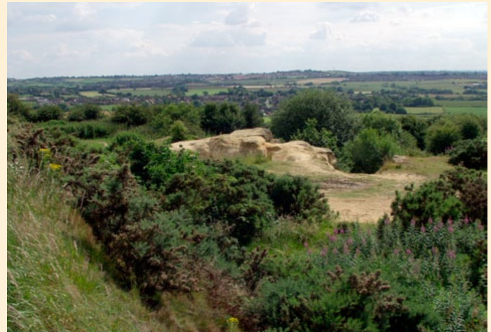
Remnant acid grassland with heathy scrub persist, with woodland on some steep, sandstone slopes.