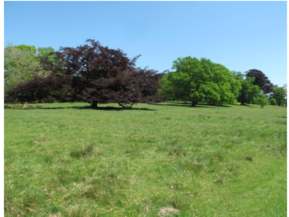
Designed parkland avenues and parkland trees add to the wooded character.