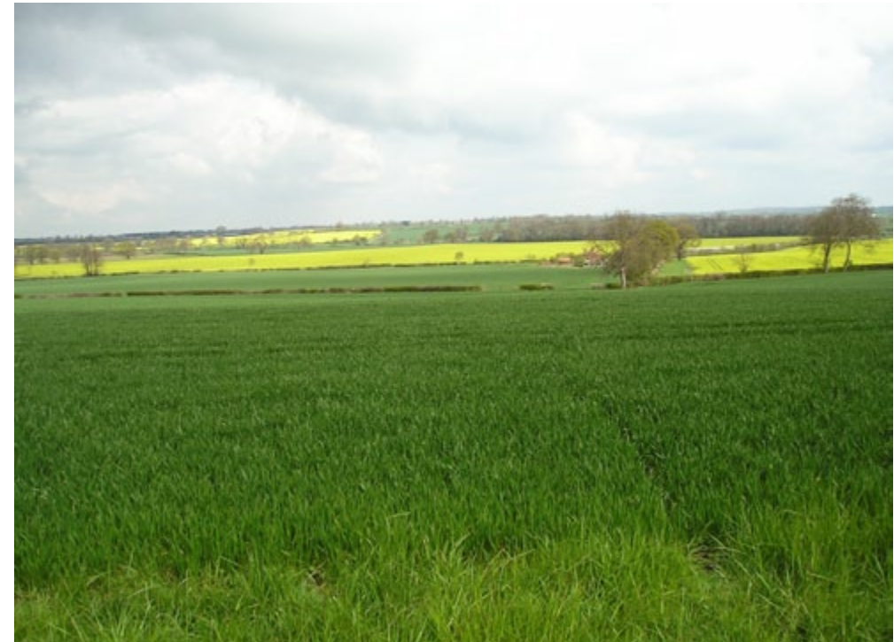
Arable fields are typical of the Kesteven Uplands.

an important source for public water supply. However, the aquifer currently has a Catchment Abstraction Management Strategy (CAMS) 'over-abstracted' status. 5