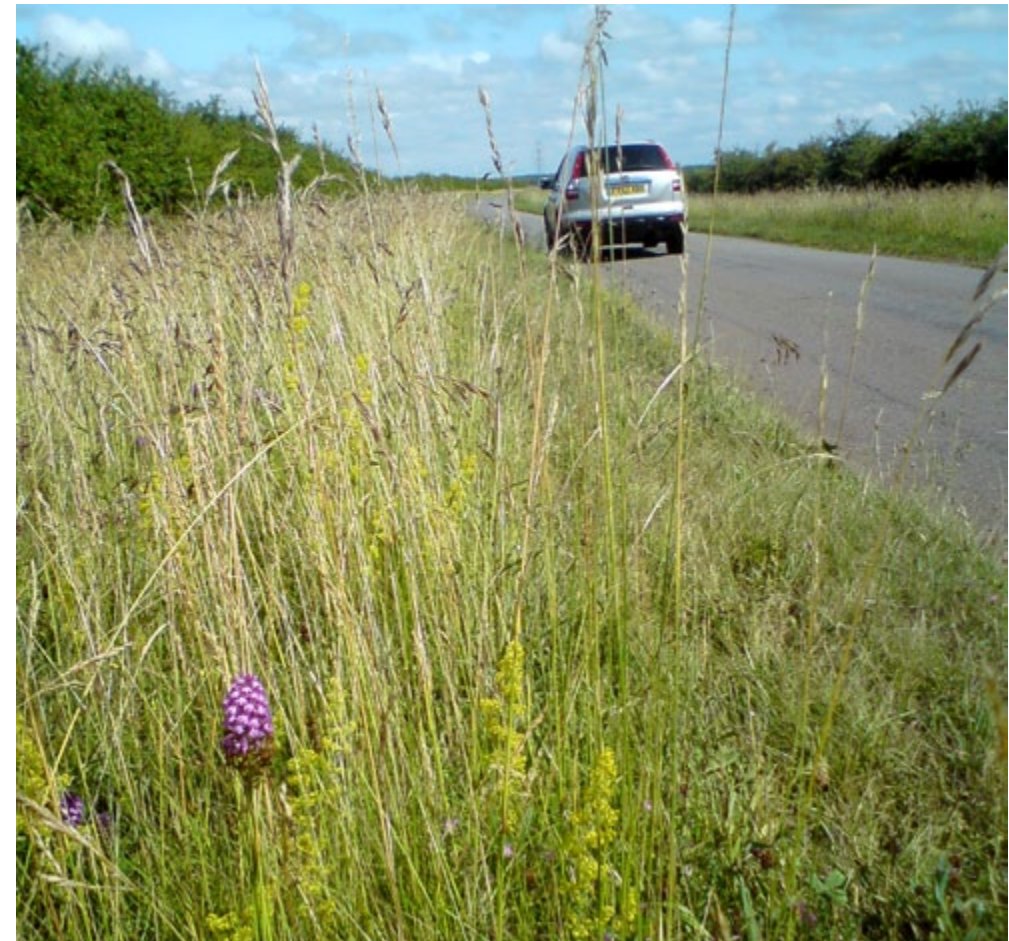
Wildflowers such as greater knapweed are often restricted to areas such as nature reserves where soils are limestone-rich.

Rivers are an important feature of the NCA. Both the East and West Glen rivers run parallel in a southerly direction, having carved their way through the boulder clay towards Stamford and Market Deeping, and eventually drain into The Wash. The