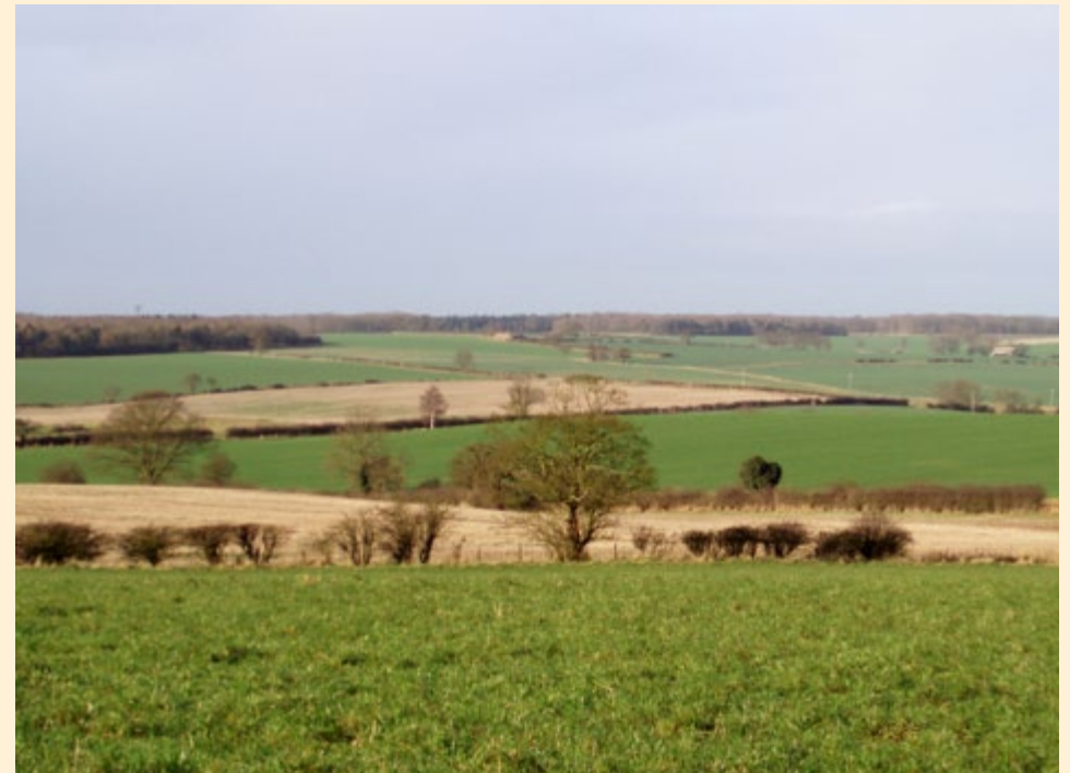
A typical view of the Kesteven Uplands with its rolling landscape with good views and some fragmented habitats.