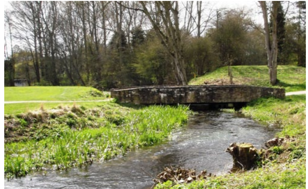
Water resources and water quality are important as shown at Cringle Brook at Stoke Rochford.