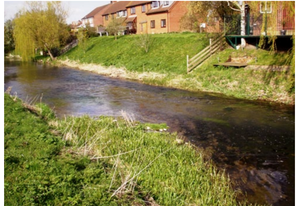
Part of the extensive catchment of the Witham falls within the Kesteven Uplands NCA, such as the Upper Witham at Claypole.

Proximity to the A1 and East Coast Main Line has ensured that Stamford remains the largest settlement. The late arrival of the railway reduced the impact of industrialisation and, despite the construction of several large housing estates on its edges, it has retained its historic core. Towns and villages such as Bourne, Heckington, Colsterworth and Corby Glen which are located close to main roads have experienced considerable expansion. In some places new housing has followed existing main roads, resulting in ribbon development and the loss of the discrete, nucleated character of the fen-edge villages.