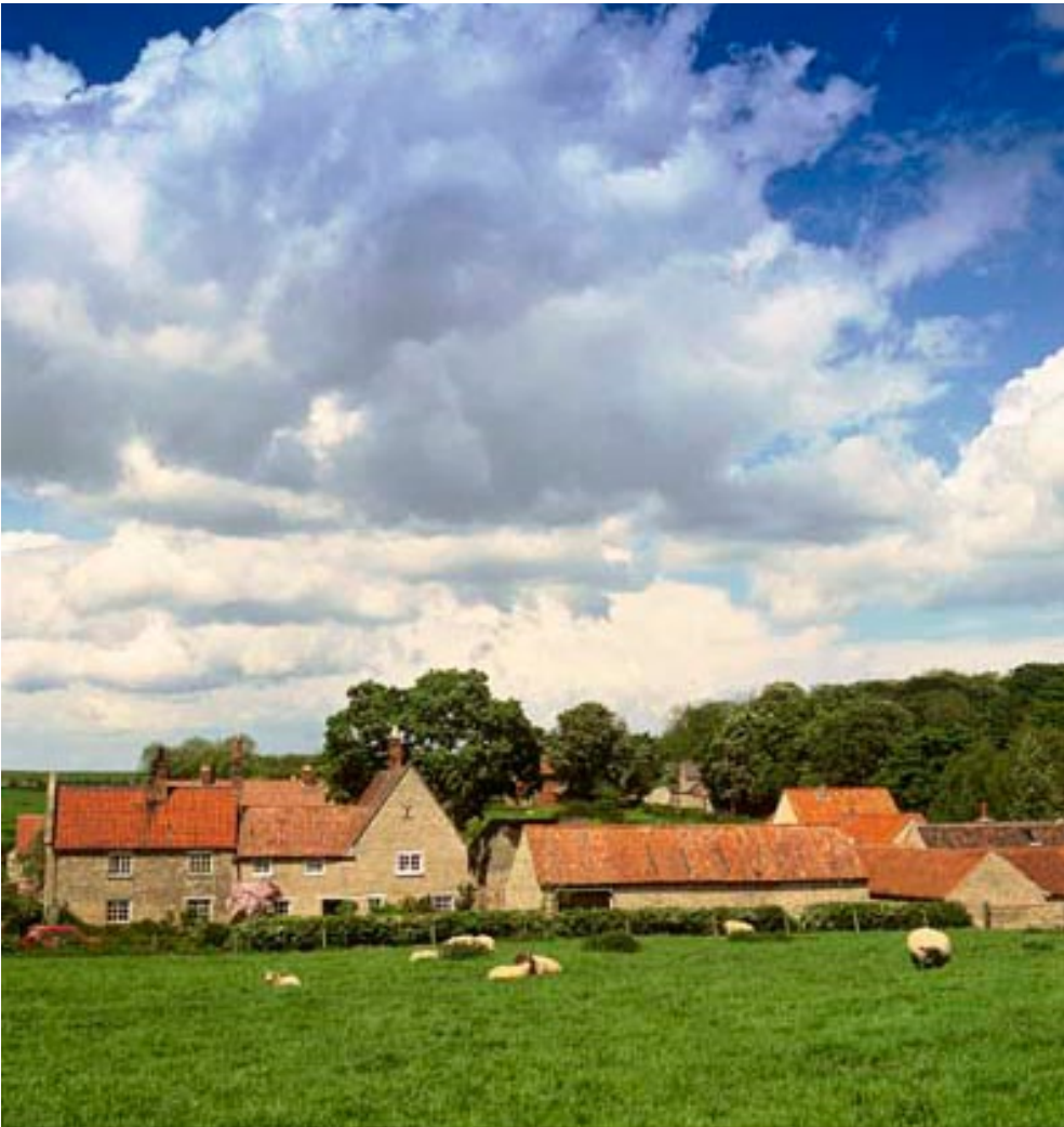
The honey-coloured local limestone has been widely used and combined with pantiles, has created attractive historic village centres.

supports key grassland species such as nationally scarce pasque and early gentian, green-winged orchid and farmland bird species including barn owl, skylark and lapwing.