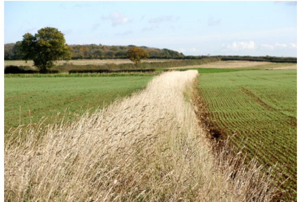
A 'beetle bank' as shown here, improves biodiversity in the Kesteven Uplands arable landscape.

Apart from the main roads of the A1 and A15 and the East Coast Main Line there are some 20th-century intrusions such as wind turbines, and airfield sites, some now redundant, are present in exposed elevated areas. Recent development is mainly residential around the towns and close to the A1.