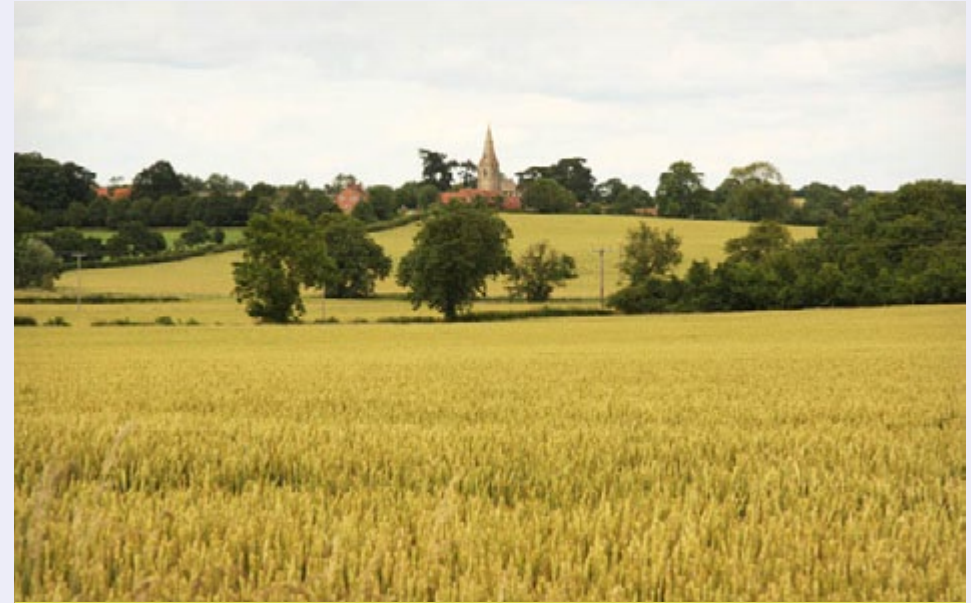
In the hamlet of Lenton, St Peter's Church provides a sense of history.

south and red pantiles in the north. Also present is a concentration of historic country houses with their associated parklands.