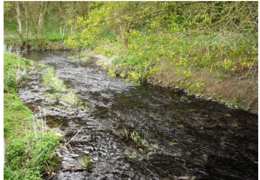
The Upper Witham supports native crayfish, an internationally important species.

Biodiversity and geodiversity are crucial in supporting the full range of ecosystem services provided by this landscape. Wildlife and geologically-rich landscapes are also of cultural value and are included in this section of the analysis. This analysis shows the projected impact of Statements of Environmental Opportunity on the value of nominated ecosystem services within this landscape.