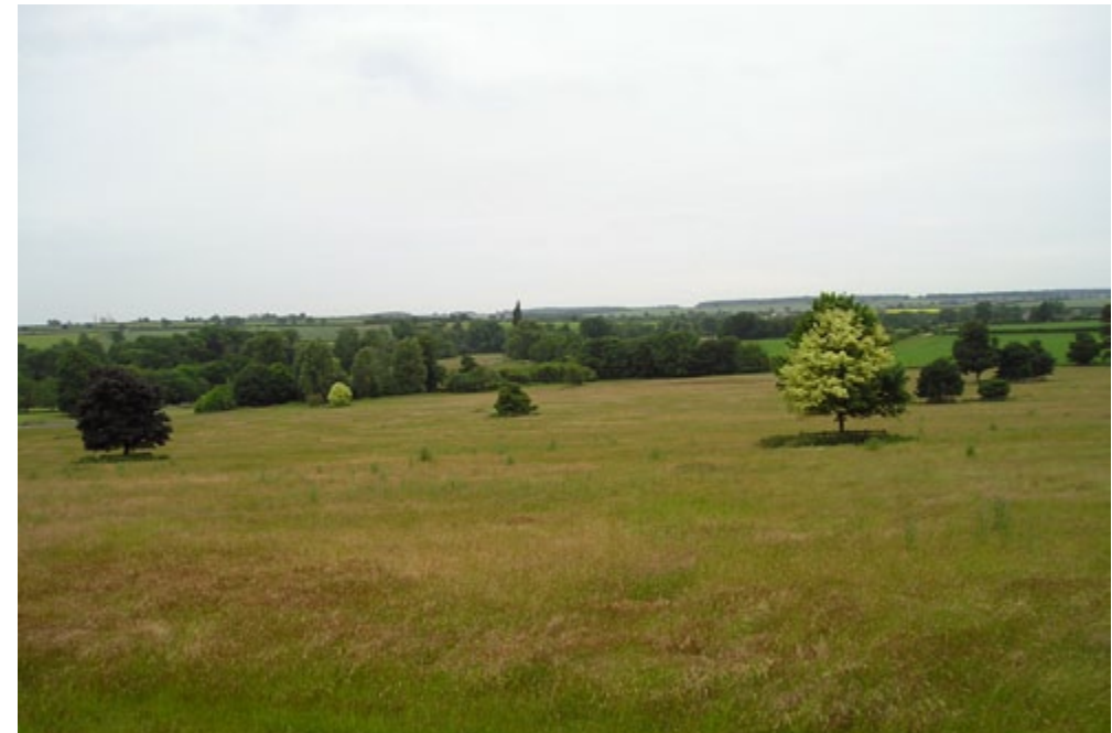
Woodlands are an important aspect of the NCA although can be fragmented.

SEO 4: Protect, manage and promote the area's rich historic environment including the significant limestone geology, the historic parklands, the manor houses and medieval monastic buildings, and deserted medieval villages, while also improving access and interpretation to enhance people's understanding and enjoyment of the landscape.