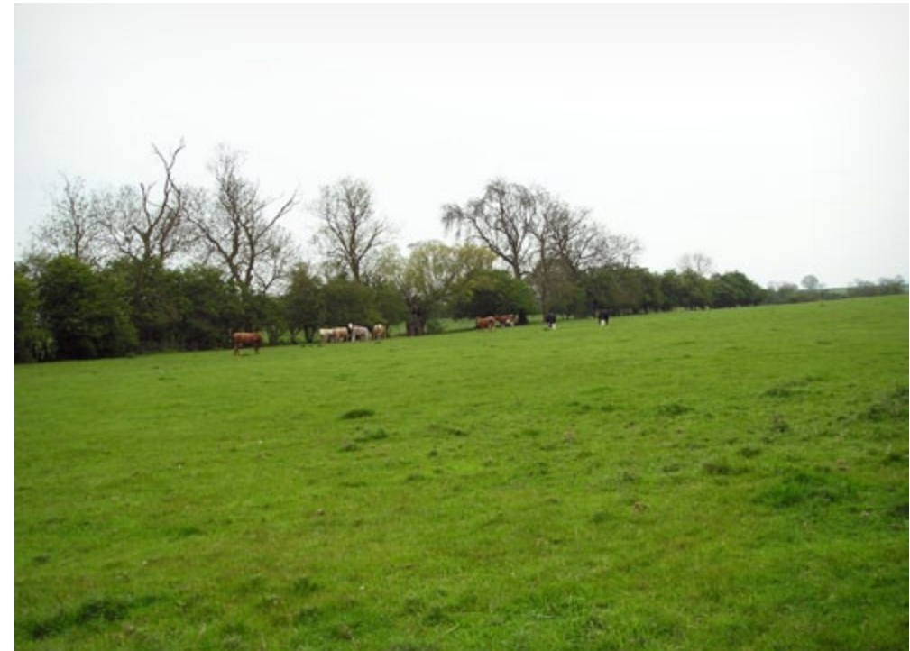
Small areas of grazing land and associated boundaries such as hedgerows are found across the agricultural landscape.

There are significant areas of woodland including semi-natural and ancient woodland. Trees include oak and ash with a variable amount of hazel coppice which, in combination with the topography, frame and contain views. There