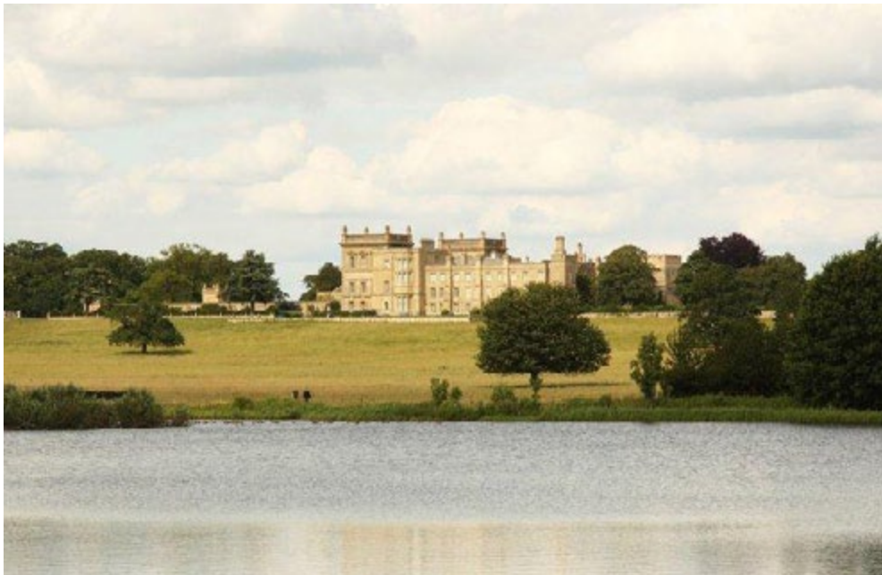
There are several parklands that are important for biodiversity and give the Kesteven Uplands both landscape character and recreational opportunities.

Surviving ridge and furrow earthworks suggest that from the medieval period villages were set within a pattern of open arable fields, farmed in strips by the tenants and rotated annually on a three-field system. The arable land was complemented by areas of grazing land at the edge of each parish, used as common land. These earthworks, and the remains of deserted medieval villages, have been conserved by long use as pasture for sheep which developed from the 14th century in the wake of the collapse in land values following the Black Death and subsequent epidemics. The importance of the wool trade encouraged early enclosure of common land and open field