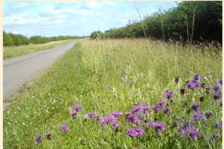
Some roadside verges are home to important limestone grasslands with plants such as pyramidal orchid.