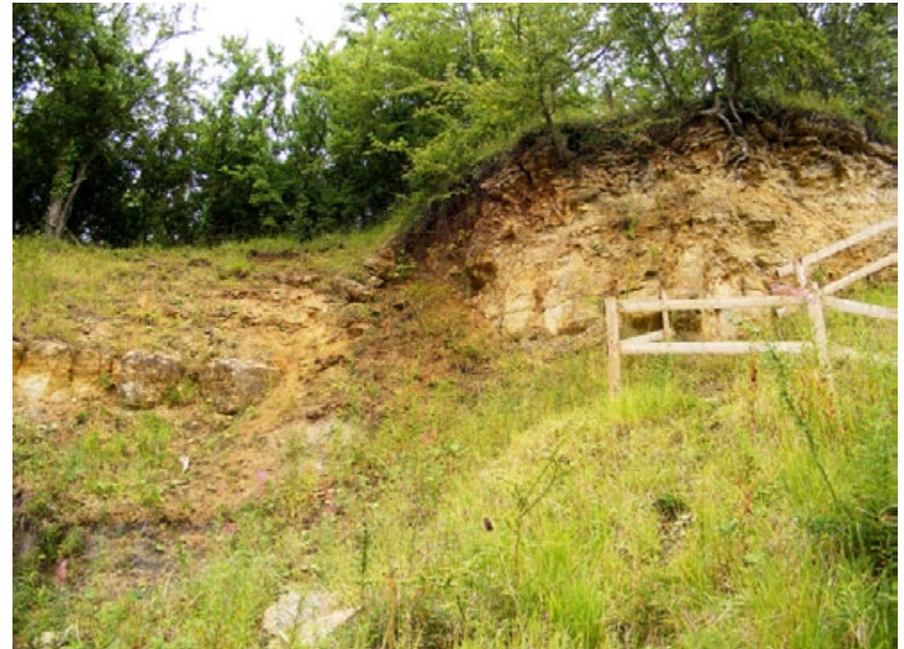
Faulting in Jurassic limestone and mudstone rocks exposed at the now disused Ketton Quarry SSSI.

There are four quarries, all designated as SSSI for the exposures of the Lincolnshire Limestone Formation and rare ammonite fossils found there. These provide opportunities for education and interpretation of the geodiversity and natural features of the area.