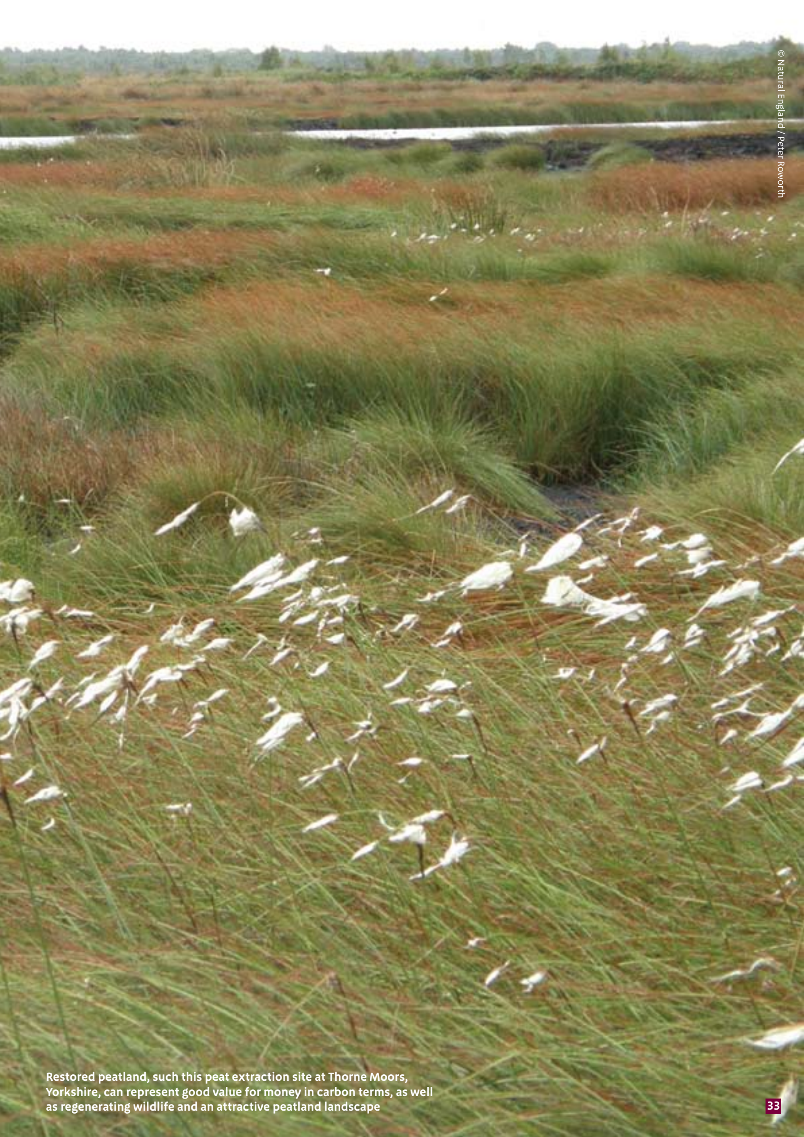
Restored peatland, such as this peat extraction site at Thorne Moors, Yorkshire, can represent good value for money in carbon terms, as well as regenerating wildlife and an attractive peatland landscape