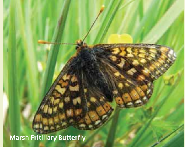
Marsh Fritillary Butterfly

A recent and welcome sight on the reserve is the marsh fritillary butterfly, previously lost to the reserve in the mid 1990s. Thanks to a captive breeding programme and the re-introduction programme in 2007, it is now thriving and can be seen flying between late May and the end of June. A way marked trail and interpretative panels are available on the site during the flight period, providing further information about the species and leading the visitor to the compartment where the butterflies reside.