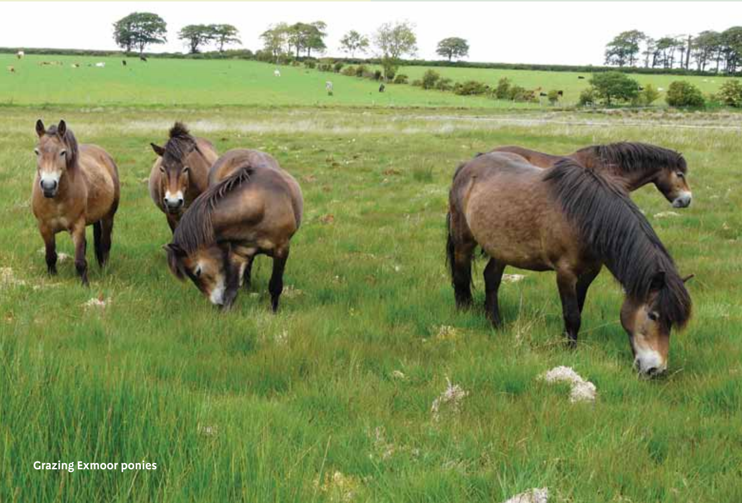
Grazing Exmoor ponies

During the late 1800s the site had a number of practices carried out by man. Land on higher ground was improved for agriculture and forestry but later abandoned during the second agricultural depression. Trees and scrub followed with birch and rowan being the first species to occupy the drier ground, and willow in the wetter areas. Some Scots pine planting took place in the western boundary of the site creating what is now known