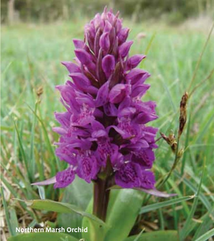
Northern Marsh Orchid

creating a lovely pastel haze. In the heathland uncommon plants such as dwarf gorse offer a vibrant splash of colour from July to November.