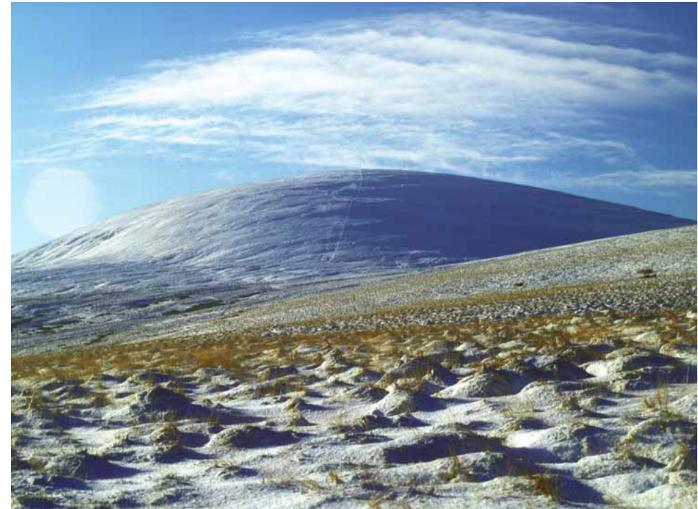
The distinctive form of Cheviot at the heart of the Cheviots, a large mass of granite intruded into the volcanic lavas.

The Cheviots display many typical glacial and post-glacial features. The curious hollows of Bizzle and Hen Hole are cirques or corries carved out of the north face of the hills by glacial scouring. Water from melting ice cut the meltwater channels below Yeavinger Bell. The modern drainage pattern, distinctively radial in form, is deeply incised into the underlying lavas, creating a series of steep-sided