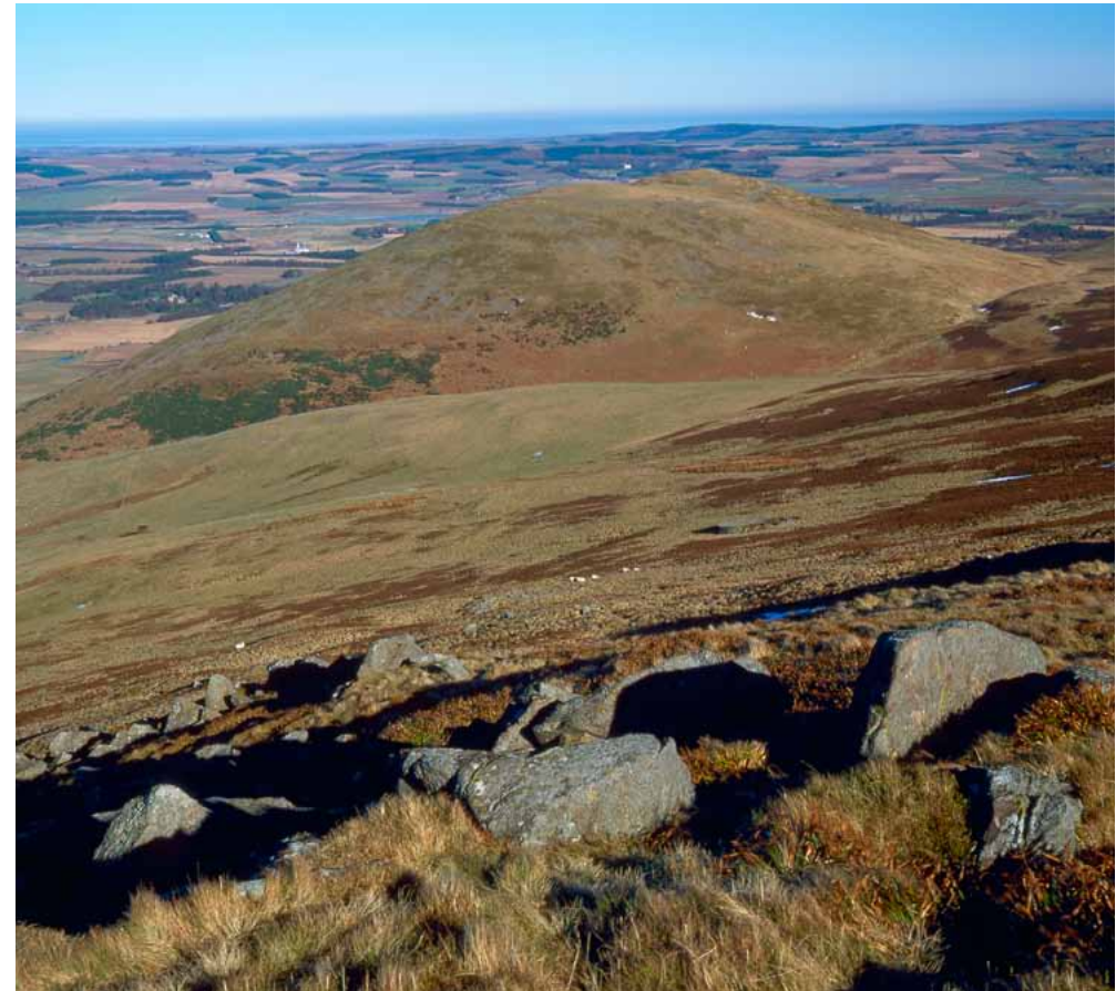
The rounded forms of hills such as Yeavinger Bell tower above the lowland belt of the Cheviot Fringe to the east.

Roads are restricted to valley floors with only footpaths, unsurfaced bridleways and restricted byways connecting valleys and crossing the border into Scotland. The Cheviots also form the northern section of the Northumberland National Park.