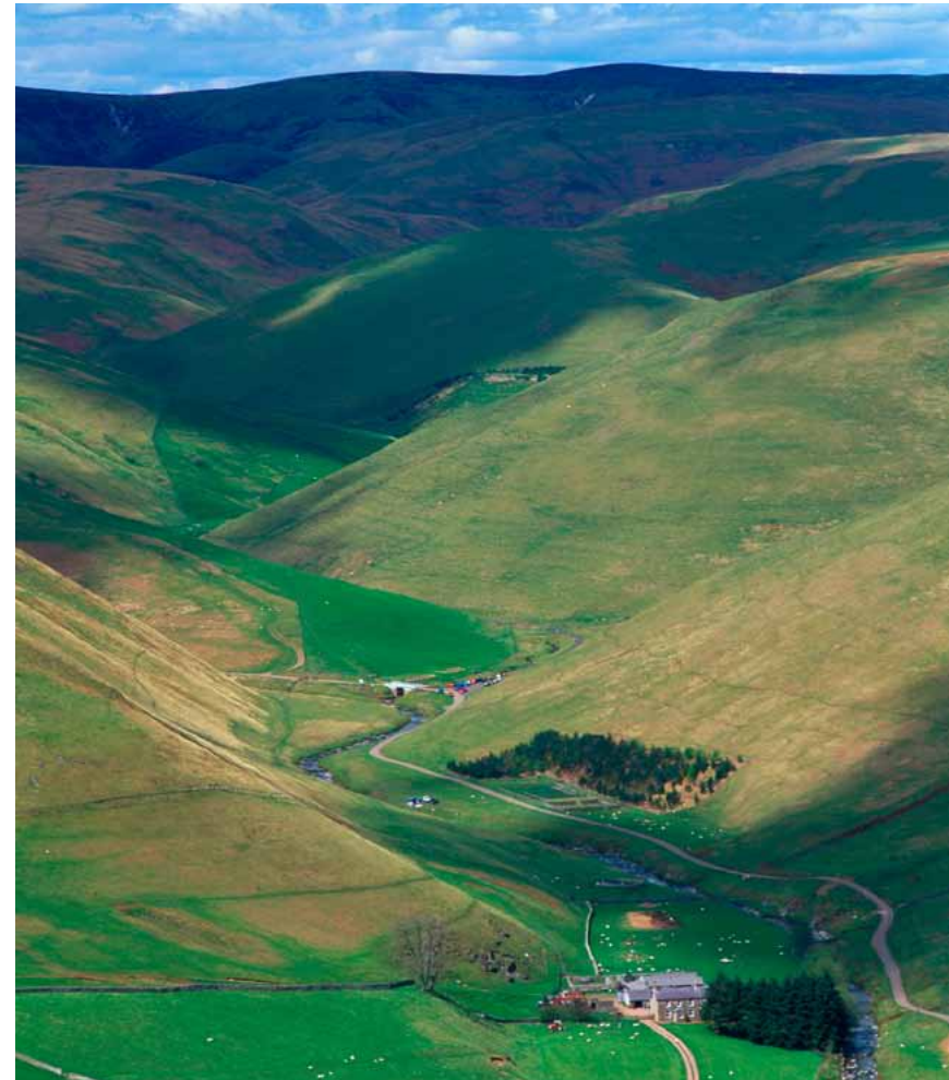
Settlement is sparse, with isolated farmsteads in the sheltered valley bottoms and small hamlets and villages in the foothills, with roads restricted to valley floors. This contributes to the highly valued sense of wilderness and isolation, tranquility, and dark night skies of the Cheviots.

The fast-flowing upper reaches of a number of rivers tumble through steep-sided valleys that radiate from the central Cheviot core. The River Alwin joins the River Coquet to flow east across the Cheviot Fringe while the River Breamish and the College and Harthope burns flow into the River Till, meandering northwards through the Cheviot Fringe NCA and forming part of the catchment of the internationally important River Tweed Special Area of Conservation (SAC). Broadleaved woodland, gorse scrub and a few unimproved, colourful, herb-rich meadows (relicts of once more widespread grasslands) add much to the variety of the valley bottoms and are of national importance for nature conservation.