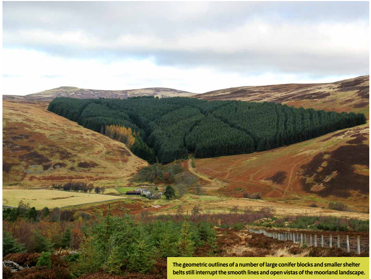
The geometric outlines of a number of large conifer blocks and smaller shelter belts still interrupt the smooth lines and open vistas of the moorland landscape.