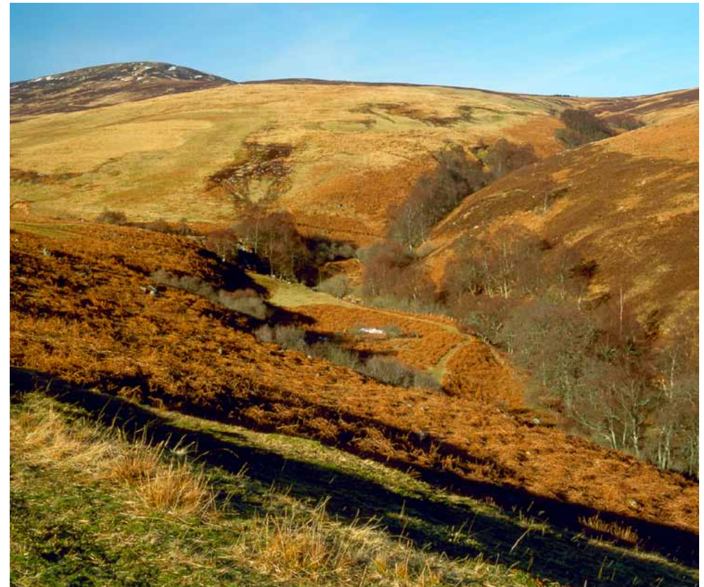
Steep-sided valleys with fast-flowing burns radiate from the Cheviots, supporting relict semi-natural broadleaved woodland, gorse scrub, wet flushes and species-rich meadows.

Biodiversity and geodiversity are crucial in supporting the full range of ecosystem services provided by this landscape. Wildlife and geologically-rich landscapes are also of cultural value and are included in this section of the analysis. This analysis shows the projected impact of Statements of Environmental Opportunity on the value of nominated ecosystem services within this landscape.