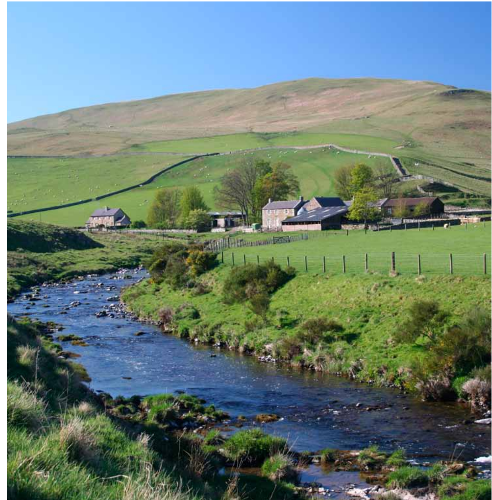
Farmsteads, commonly built from sandstone with slate or clay pantile roofs, nestle in the valley bottoms surrounded by smaller in-bye fields enclosed by dry stone walls and post and wire fencing.

With its high rainfall, impervious rocks, peaty soils and extensive semi-natural habitats, this area has an important role to play in the regulation of water quality and flow and carbon storage; however, climate change will bring its own challenges for maintaining these important ecological processes.