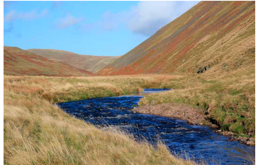
The high rainfall in the Cheviots NCA drains into the pristine headwaters of the rivers Till and Coquet which are crucial for supplying the Cheviot Fringe NCA and beyond with water

have the potential to sequester further carbon from the atmosphere. Sensitive land management and restoration measures such as grip blocking (drain blocking) should help to reduce the scale of stored carbon being released into the atmosphere and could restore some of the carbon storage capacity and sequestration ability of the peat soils. Extending woodland cover (avoiding deep peat) will also improve carbon capture.