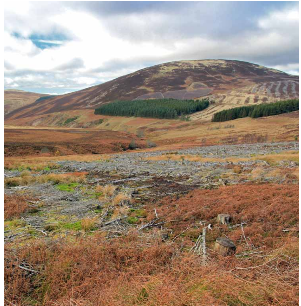
The impact of conifer plantations on the landscape is being reduced by more sympathetic rotation plans and the large-scale restructuring and removal of forest blocks, restoring open moorland habitats (such as here in the College Valley) and broadleaved woodland.

SEO 4: Protect, restore and extend native woodland cover by managing existing woodland, restructuring and increasing the broadleaved component of conifer plantations, and restoring woodland in the cleughs. This will improve habitat connectivity, enhance landscape value, improve water quality and soil erosion, manage water flow, contribute to climate change mitigation, and provide timber and wood fuel.