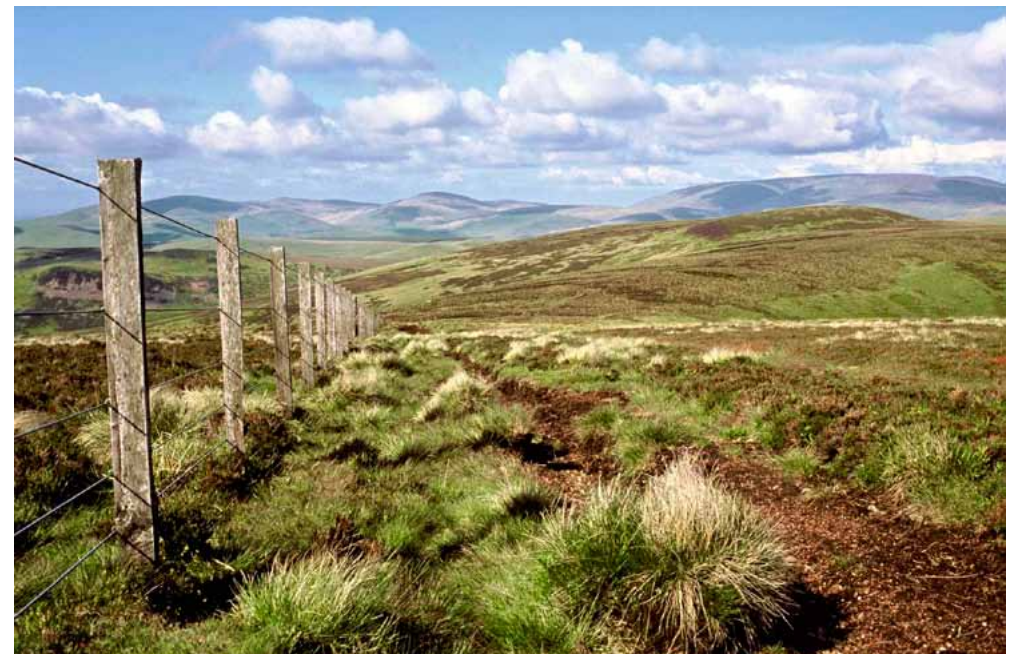
The Cheviots form a smooth, sinuous cluster of rounded hills dominated by broad moorland horizons. The higher ground is enclosed by dry stone walls and more recent post and wire fencing.

post and wire fencing for new boundaries. The estimated boundary length for the JCA is 1,227 km. Only about 2 per cent of this total length was included in Countryside Stewardship agreements between 1999 and 2003. There has been limited uptake of boundary feature management through Environmental Stewardship with only 59 km of hedgerows and 55 km of stone walls included in agreements by 2011.