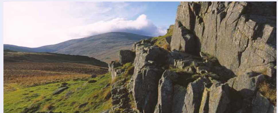
Occasional granitic tors and rocky outcrops interrupt the otherwise smooth lines of the Cheviots, in places supporting rare relict Arctic-Alpine flora.