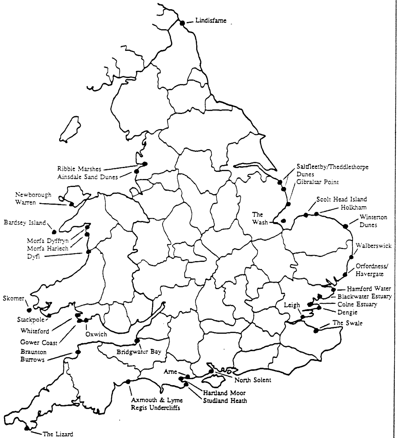
Figure 2.3.2 Coastal National Nature Reserves in England and Wales