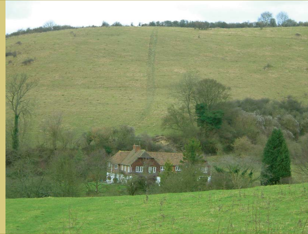
Steep scarp slope

Walk through this area to New Barn Farm on the far side. To the right of the buildings at New Barn Farm is a wooden gate, head through this gate and follow the permissive footpath (this route is alleged to date from