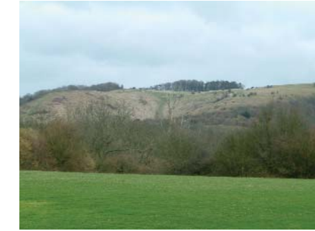
Devils Kneading Trough