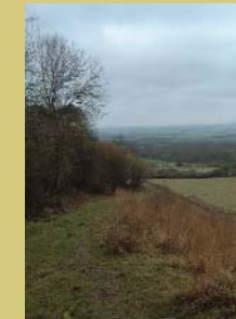
Track from New Barn Farm

Roman times) down through the woodland. Follow the track to the bottom of the field and climb over the stile in the bottom corner. Follow the path along the fence to the next stile, climb over and turn right on the road. Follow the road and take the next left into Hampton Lane.* Follow the road, at the end of the houses take the public footpath on the right into a field. Follow straight across the field and over the stile. As you cross this next field you will see the remains of Hampton Manor on your left. Earth banks from Hampton Manor are believed to date back to the 13th Century.