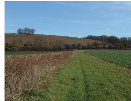
Arable field margin

Scale 1:25 000