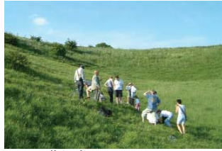
Farm walk in the Wye Downs