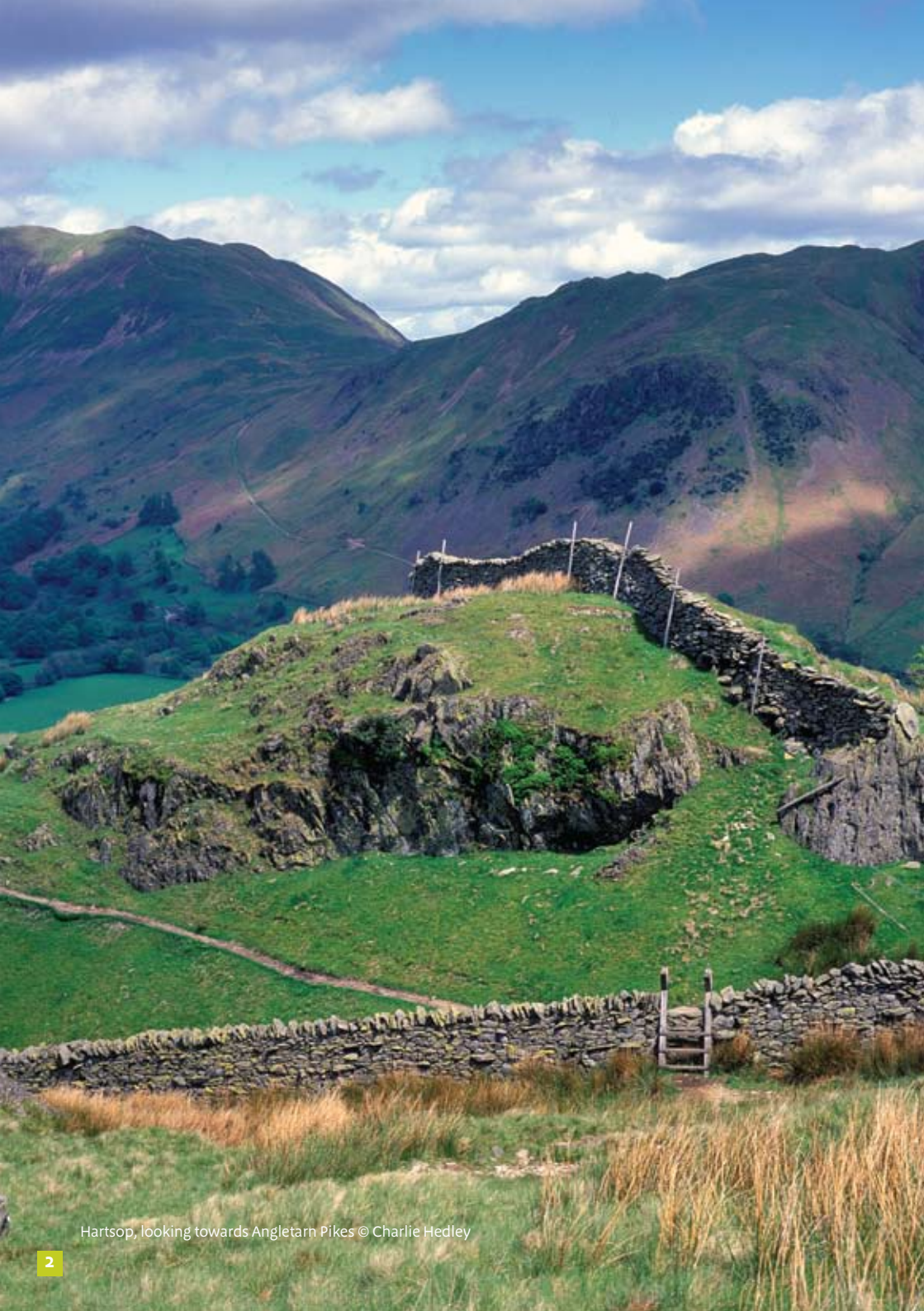
Hartsop, looking towards Angletarn Pikes