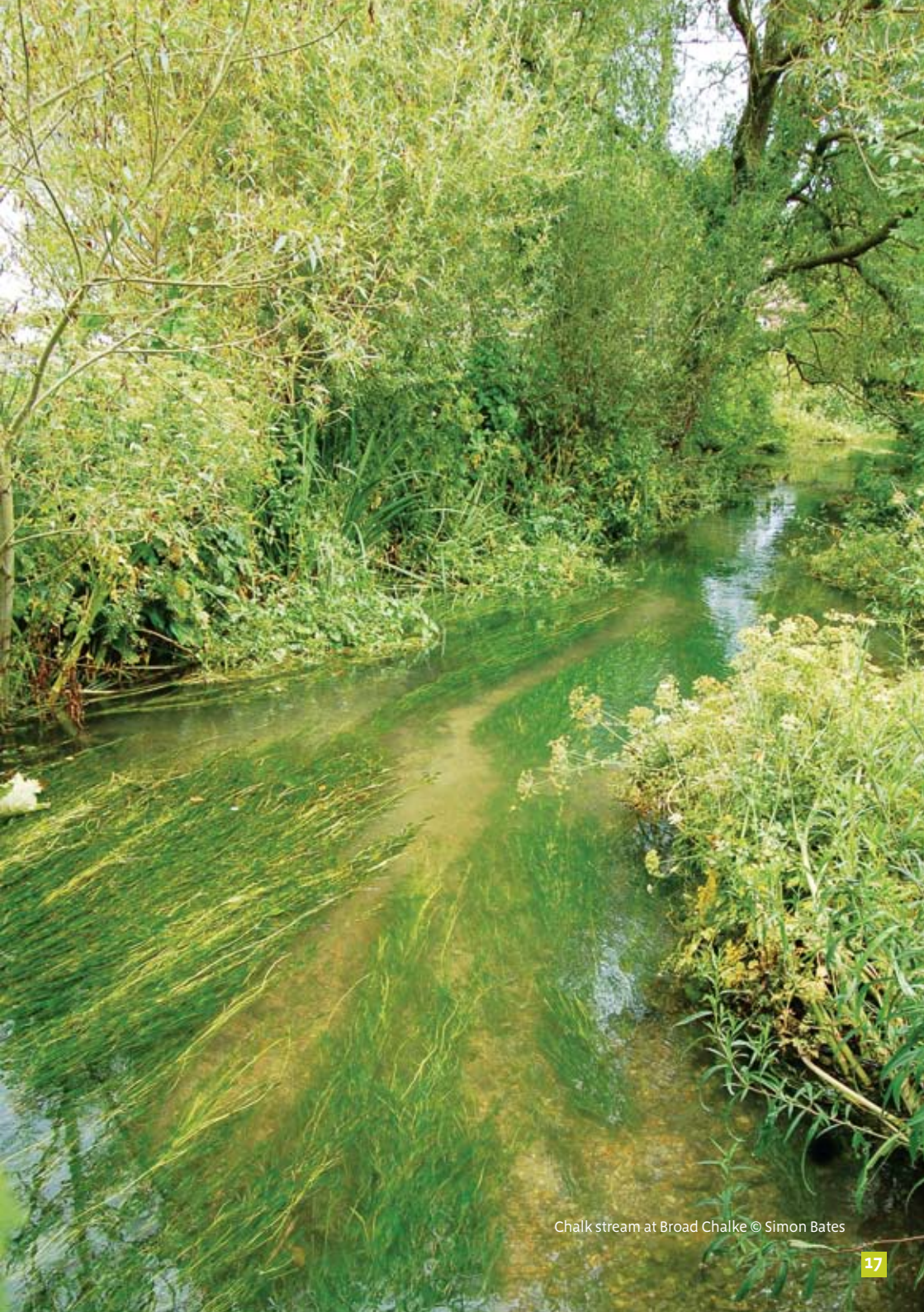
Chalk stream at Broad Chalke