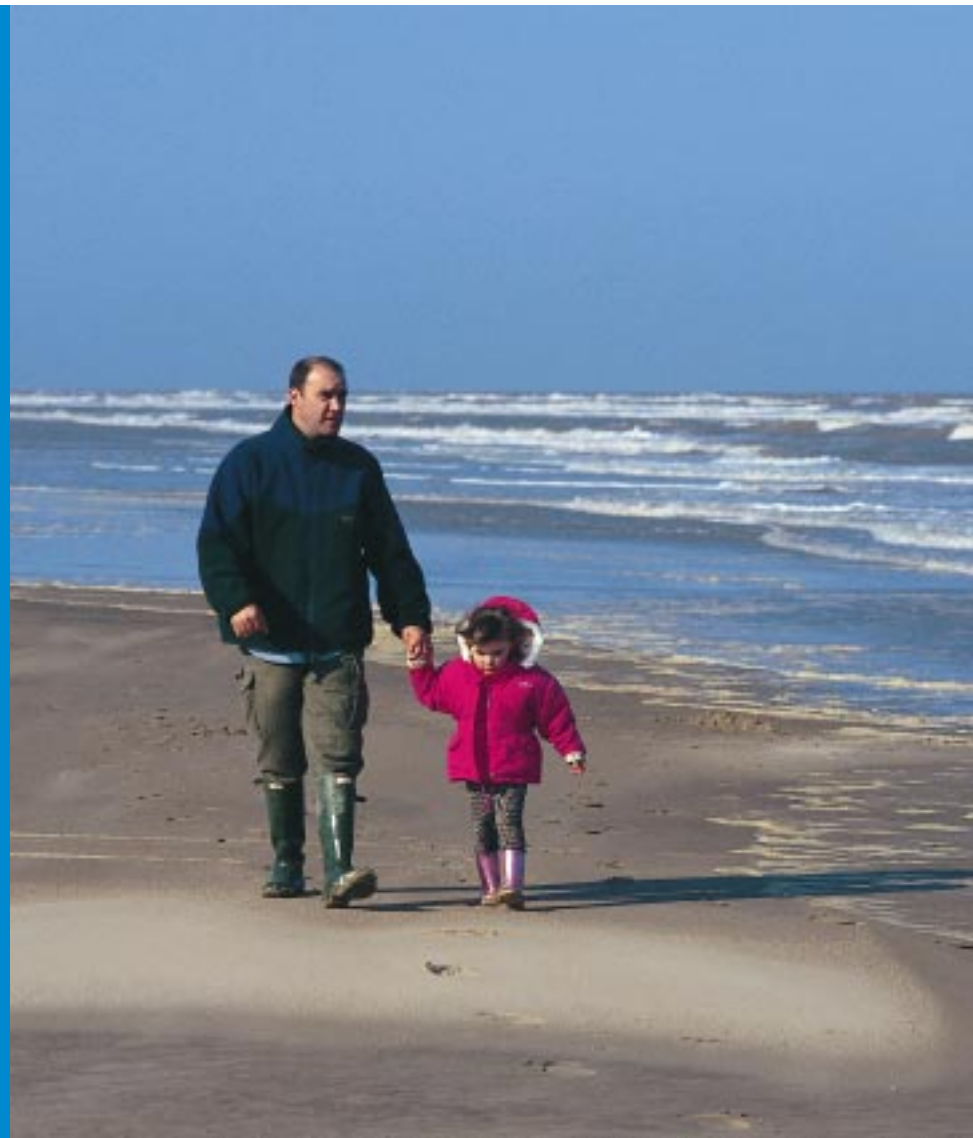
Saltfleetby - Theddlethorpe Dunes NNR, Lincolnshire.