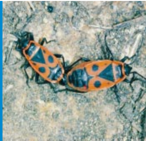
Fire Bugs Pyrrhocoris apterus mating. 409040-00001-020