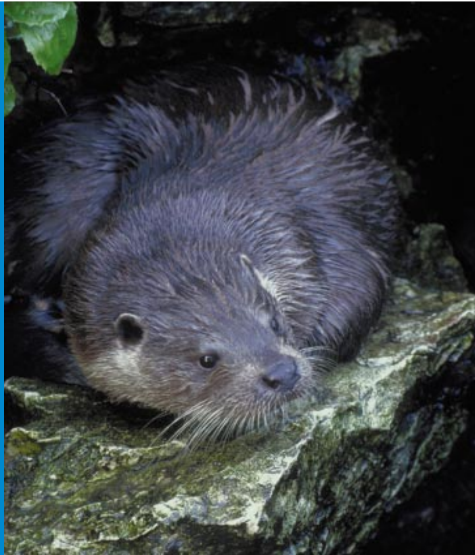
Otter Lutra lutra.