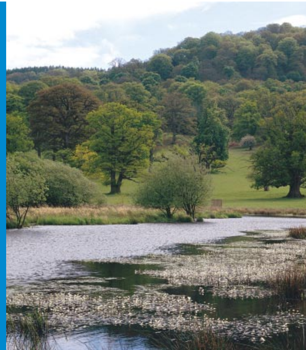
Ornamental pond at Moccas Park NNR, Herefordshire.

As well as its outstanding wildlife features, Moccas Park National Nature Reserve, Herefordshire has very strong cultural links. The park is part of Herefordshire's Georgian parkland legacy. It has been shaped by active management over the years. Its look was influenced by such 18th century landscape figures as Capability Brown and his successor, Humphrey Repton. Moccas is a jewel in the 10-20,000 hectares of England that are classified as actively managed lowland wood-pasture and parkland, a priority habitat in the UK Biodiversity Action Plan.