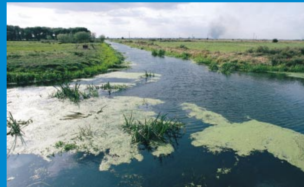
Nene Washes SSSI, Whittlesey.