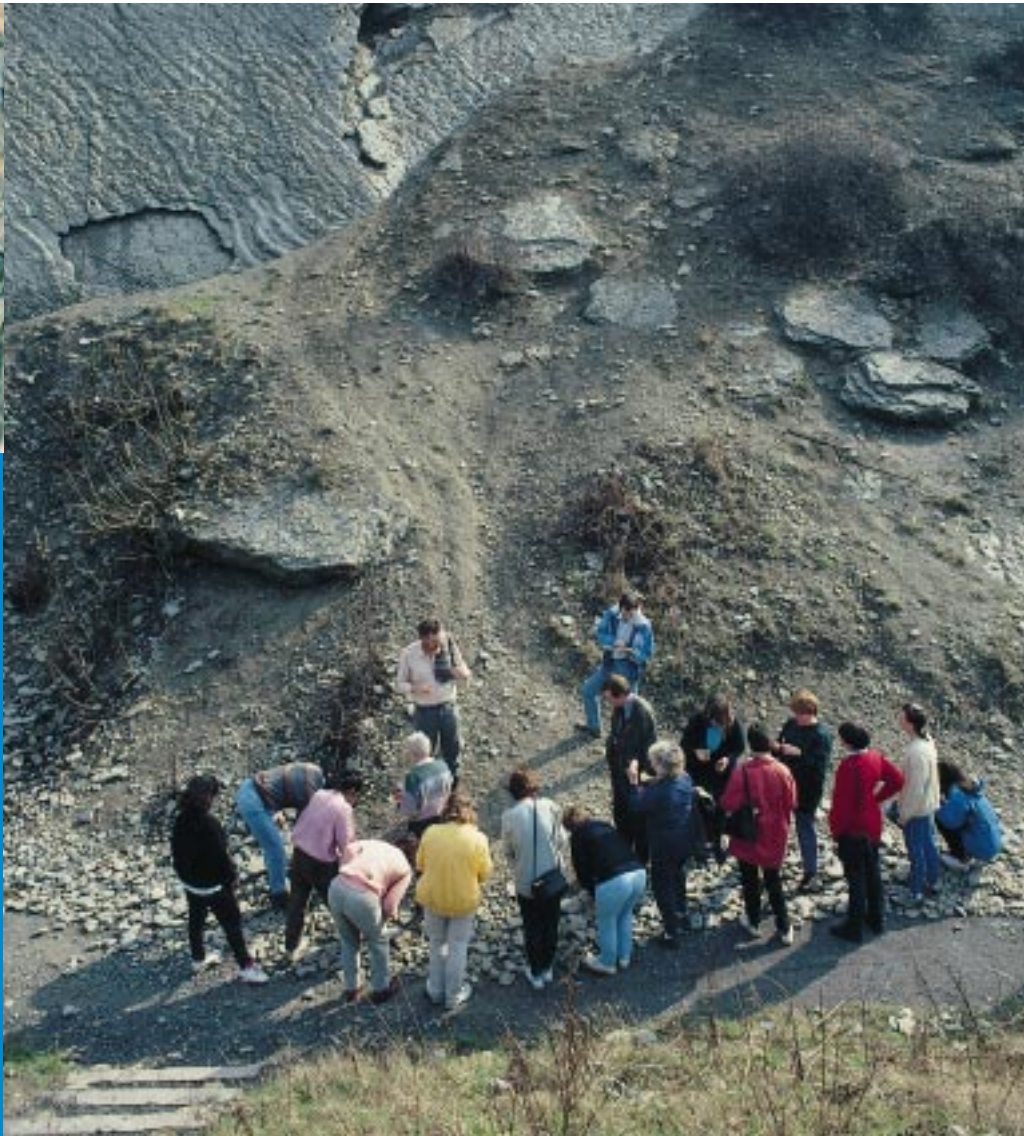
Visiting teachers search for fossils at Wren's Nest NNR, West Midlands. 11,444

The applied study of insect defence biochemicals is still in its infancy and in situ conservation will provide the best way to maintain the information archive.