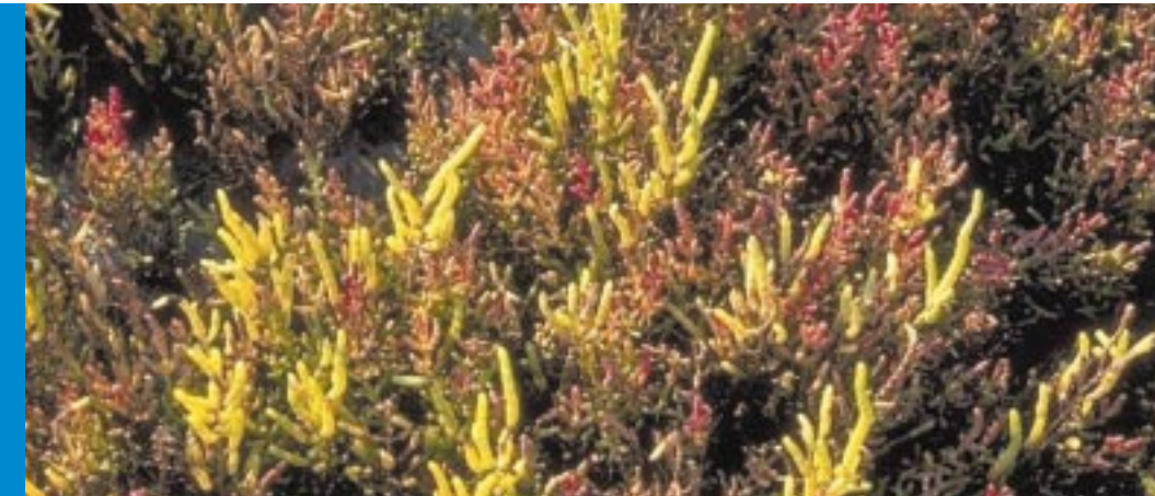
Samphire Salicornia sp. 18,617A

Floodplains can be managed in a way which reduces risk to people and the built environment, and at the same time provide additional habitat and other benefits. An actively managed washland can, in the right circumstances, provide benefits including conservation, recreation and productive uses (such as the production of reed/sedge or biofuel). Inter-tidal habitats can soak up wave energy, providing an important coastal defence function.