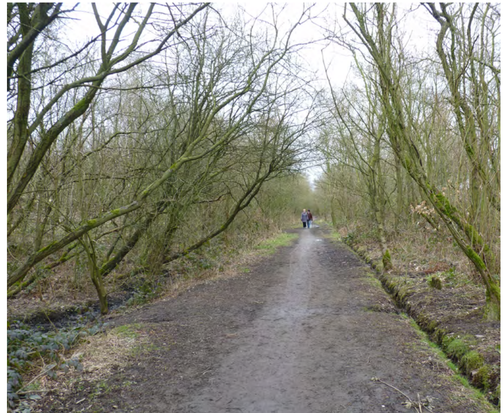
The large population within the Lancashire Coal Measures has access to many public rights of way, as well as community forest areas, country parks, Local Nature Reserves, and urban green spaces.

Biodiversity and geodiversity are crucial in supporting the full range of ecosystem services provided by this landscape. Wildlife and geologically-rich landscapes are also of cultural value and are included in this section of the analysis. This analysis shows the projected impact of Statements of Environmental Opportunity on the value of nominated ecosystem services within this landscape.