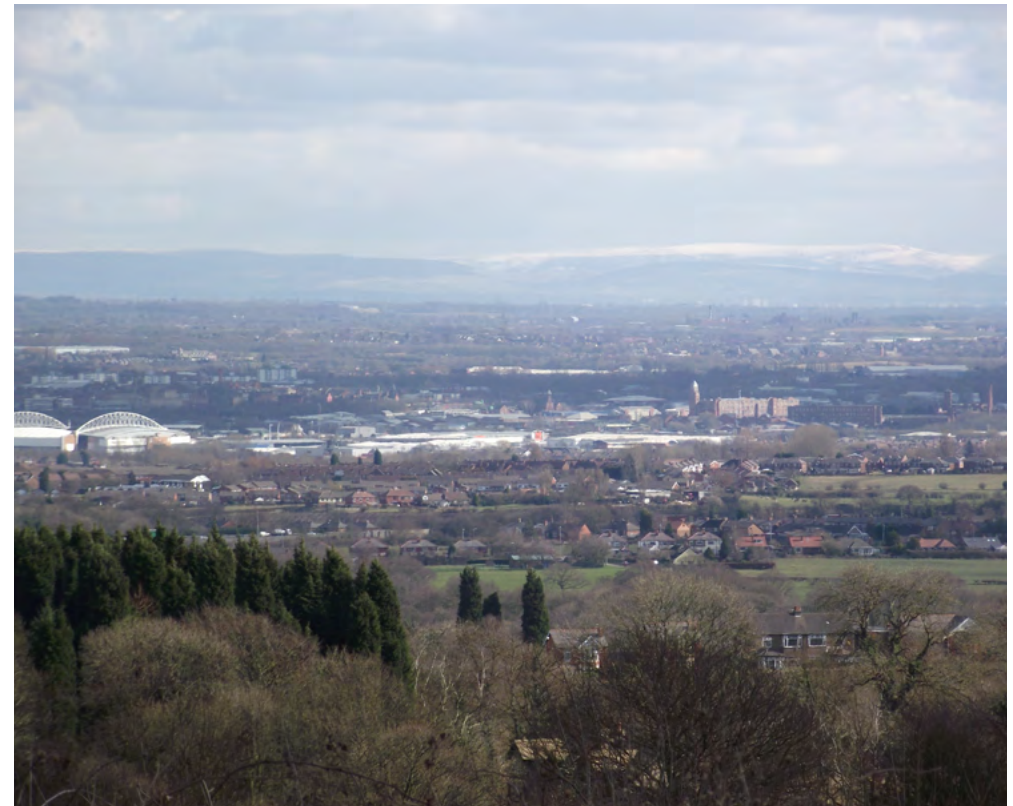
The foothills of the southern Pennines at Horwich and Rivington to the north-east of this area, provide a backdrop of upland views.

The Lancashire Coal Measures NCA forms a busy communications hub, with a number of strategically important transport routes passing through it. The M6 and M61 motorways, as well as the West Coast Main Line railway, are important arterial routes running north to south. East to west, the M58, A580 and regional rail network link the Merseyside and Manchester conurbations.