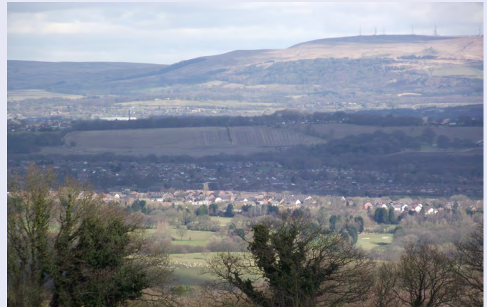
Landscape within the Lancashire Coal Measures is a complex mosaic of farmland, scattered urban centres, industry, active mineral sites and derelict or reclaimed workings.