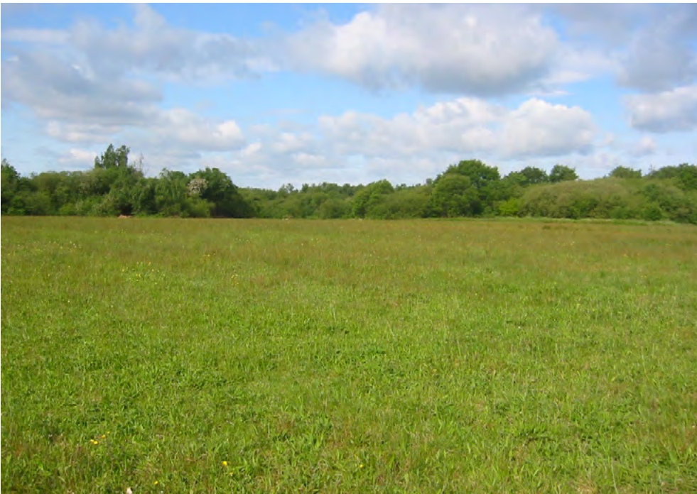
Important grasslands include Stanley Bank Meadow Site of Special Scientific Interest. The meadow is species-rich with many plants which are typical of damp unimproved neutral grassland.

The Lancashire Coal Measures NCA surrounds the towns of St Helens and Wigan. The industrial heritage of the area is based on its long coal mining history, heavy industry, restored mineral workings and subsidence flashes, interspersed with a complex mosaic of farmland and urban centres. This all gives the area a strong and distinctive cultural identity.