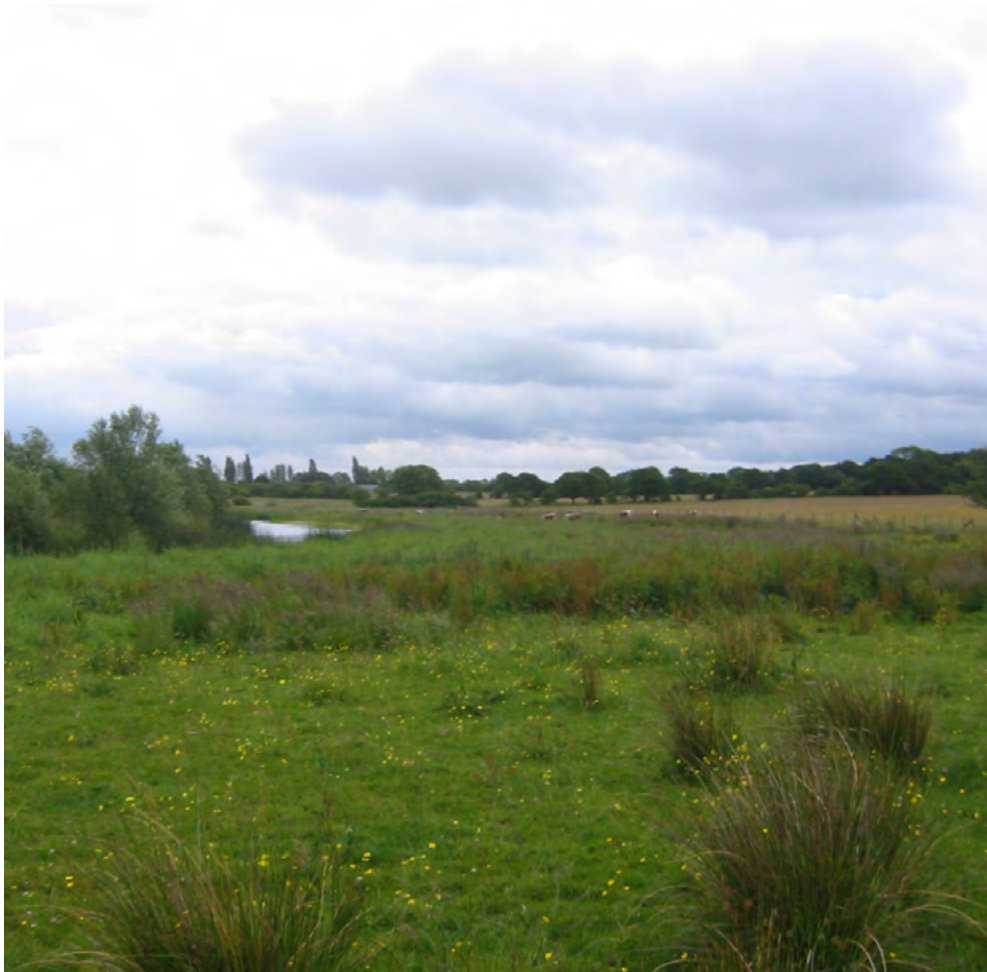
Flashes have developed, for example at Abram Flashes, from subsidence due to deep mining activities. Their gradual colonisation has resulted in the development of a mosaic of wetland habitats.