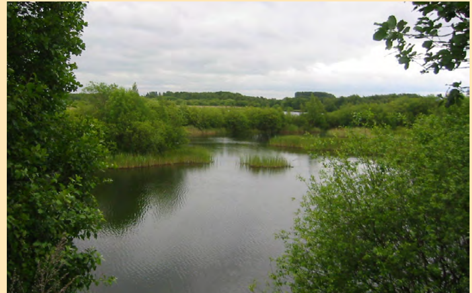
Bryn Marsh and Ince Moss form an integral part of the Wigan Flashes complex of wetlands running between Wigan and Leigh. This now contributes to the area's sense of place and offers an extensive mosaic of wildlife habitats.