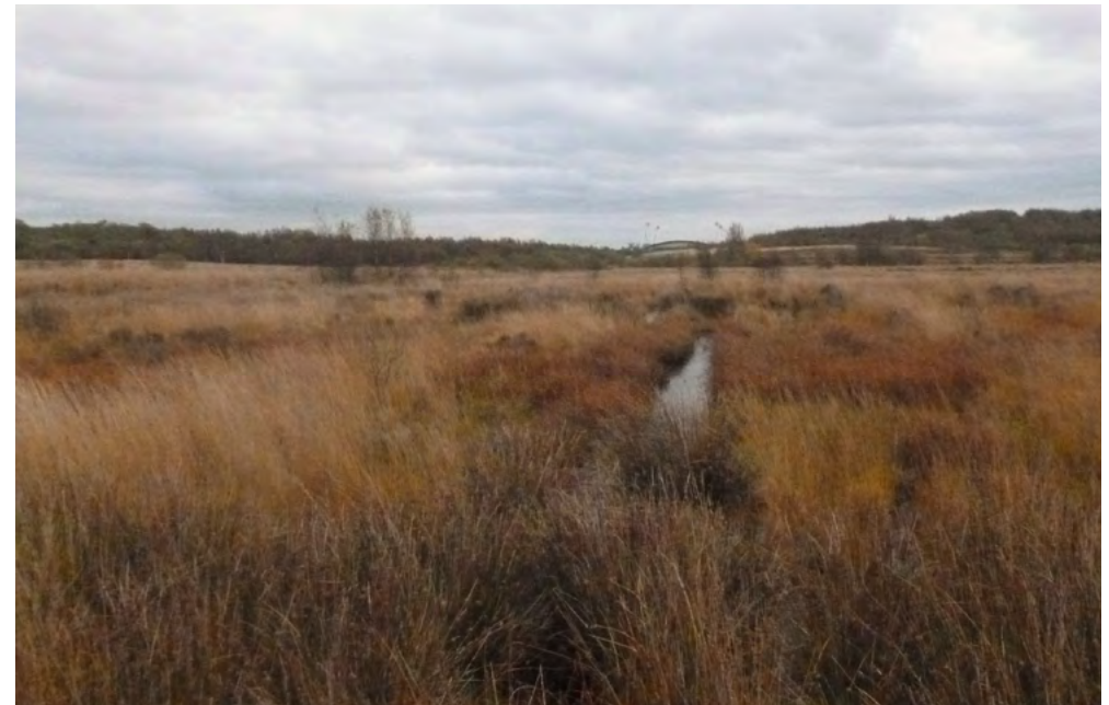
Remnant examples of lowland raised bog can still be found in the area, such at Red Moss Site of Special Scientific Interest near Horwich.

The warmer, post-glacial climate led to wetter conditions, with increasing vegetation accompanied by localised waterlogging. Bog vegetation (in particular, sphagnum mosses) expanded and large deposits of peat accumulated on the lower and flatter areas within boulder clay-lined depressions and basins. Remnant examples of this can still be found in the area, for example at Red Moss SSSI near Horwich.