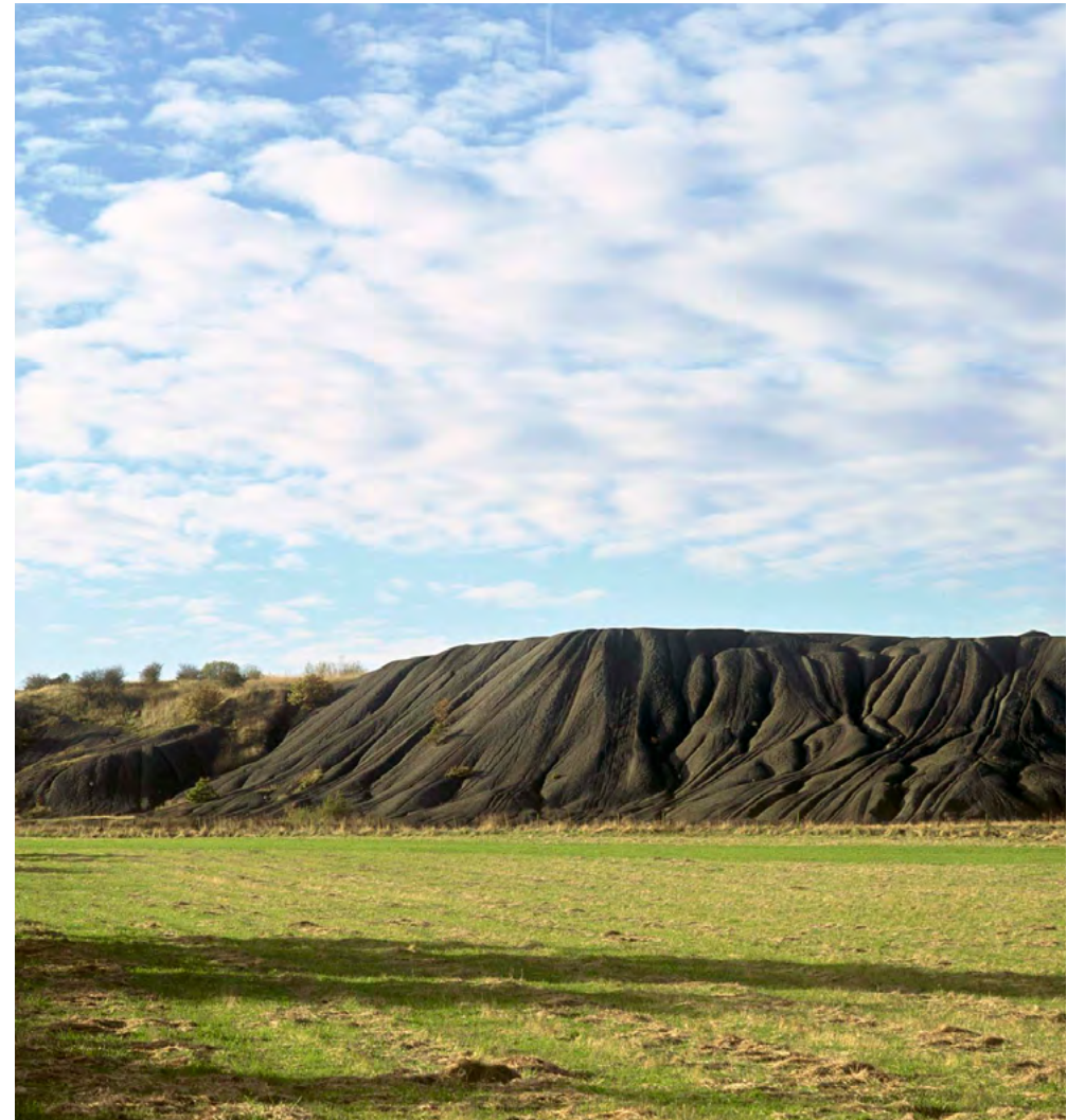
Past industrial activity left a number of waste spoil heaps, many of which are now being reclaimed and restored, often to landscapes of recreational and biodiversity value.