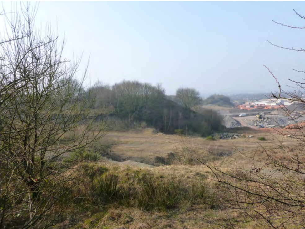
Ravenhead Brickworks Site of Special Scientific Interest is an important geological site for Carboniferous stratigraphy and both non-marine and marine bivalve fossils.

The introduction of the railways to the area in the 19th century massively increased the exploitation of the South Lancashire Coalfield, which continued to develop with fewer but deeper mines. This period saw expansion in industrial manufacturing and a major extension of the urban fabric, with large numbers of terraced properties and larger houses being built. Industrial changes created a concentration of colliers in towns such as Wigan and Worsley, and colliery villages such as Billinge and Tyldesley emerged. The siting of glass and copper industries on the Coal Measures steadily transformed a crossroads, chapel and inn into the centre of modern-day St Helens.