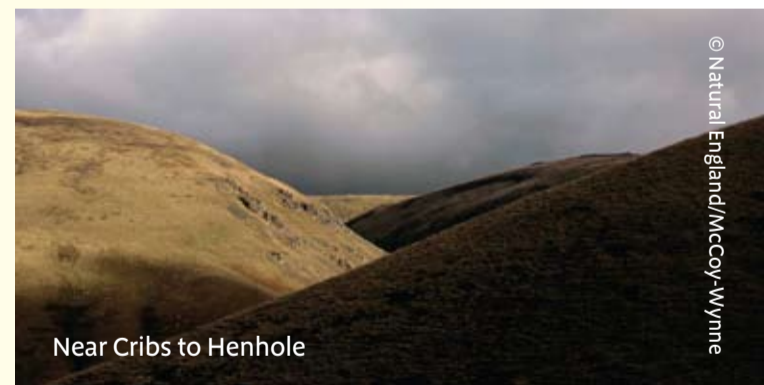
Near Cribbs to Henhole

The area is underlain by sedimentary rocks of Carboniferous age. Resistant sandstones give rise to distinctive craggy landforms in the North Tyne Valley such as the Shitlington Crags. Some of the moors, such as those between the North Tyne and Redesdale valleys, are dominated by heather and are managed for grouse. These treeless moorlands contrast with the vast expanses of coniferous forest which dominate large parts of the area.