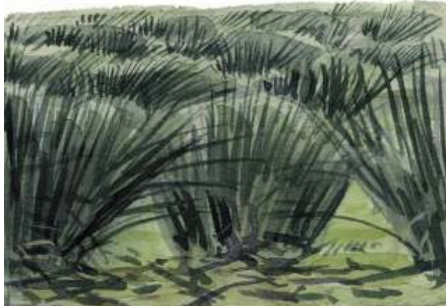
Sward too dense for the main area of the field

Only small areas of the field should look like this as it is too dense for birds to nest or move around in.