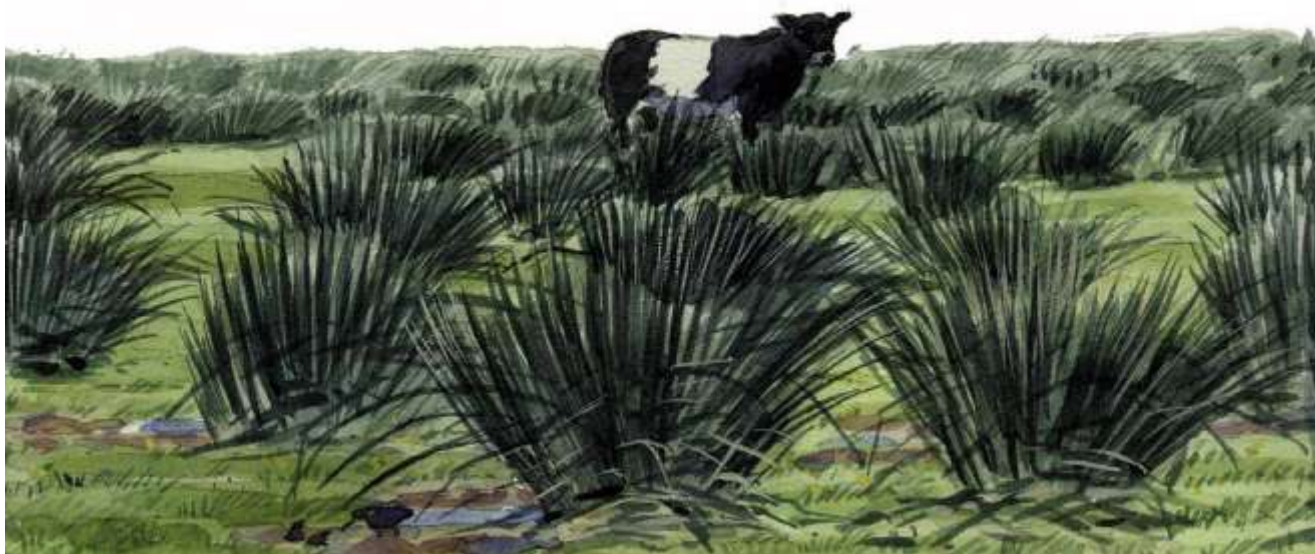
Most of the field should look like this

A shorter sward among the tussocks and the open muddy margins of shallow pools are important for feeding, especially for the chicks.