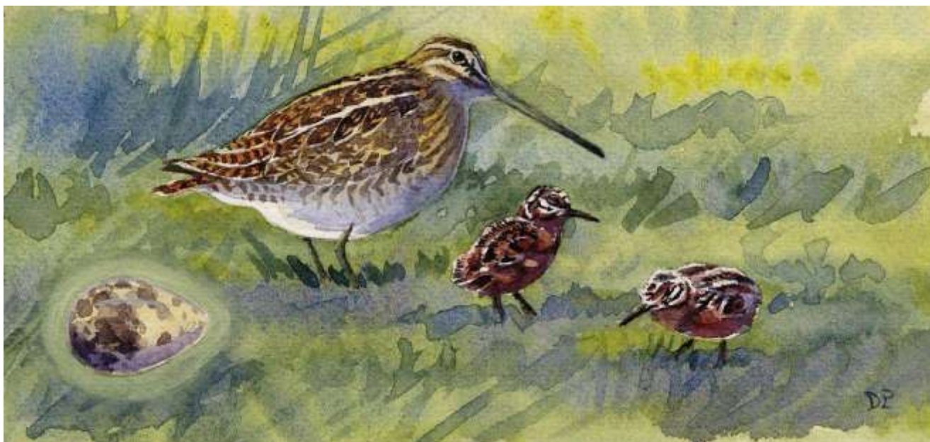
Adult snipe with chicks and (inset) egg

Snipe are medium sized, mottled brown wading birds with short legs and long straight bills. In lowland wet grassland their numbers have declined steeply in the past twenty-five years. Getting the condition of lowland wet grassland right at key times of the year should help to increase snipe numbers. The condition in autumn as stock come off the land for the winter is critical because it influences the conditions in the spring when the breeding season begins and in early summer when chicks are being reared.