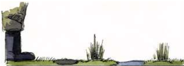
Cross section of too short sward

Drier areas of the field can be this short, but it is too short for the wet areas. Where the sward is too short there will not be enough cover for snipe to feel safe.