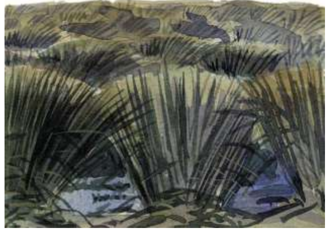
Too rank for main area of the field

Only small areas of the field should look like this as it is too dense for birds to move around in or to see out from.