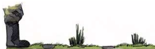
Cross section of sward too short

Drier areas of the field can be this short but aim for the ideal structure in wet areas as there is not enough cover for snipe to feel safe.