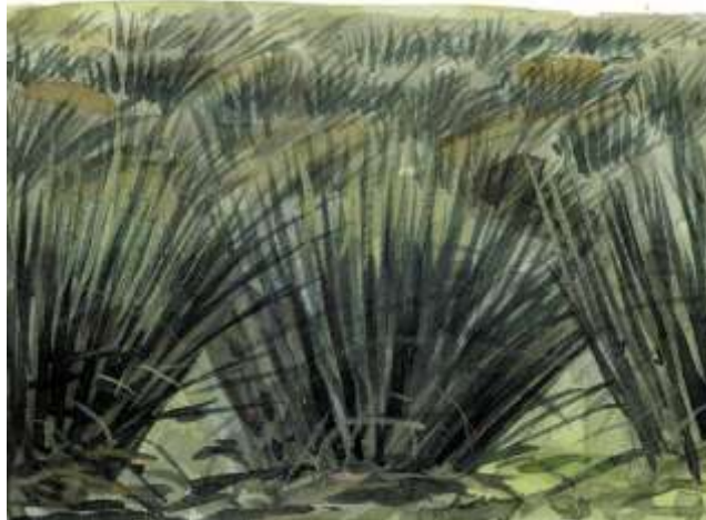
Sward too dense for main area of field

Only small areas should be this dense as it is too dense for birds to move around in or to see out from and it is not suitable for nesting.