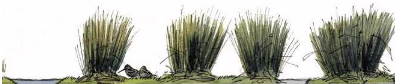
Cross section showing what most of the field should look like