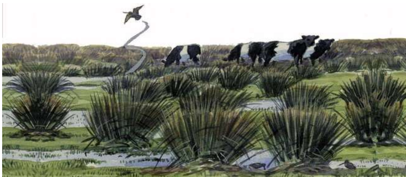
Ideal conditions for most of the field