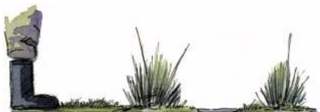
Cross section of sward too short

Drier areas of the field can be this short but it is too short for wet areas as there is not enough cover for snipe to feel safe.