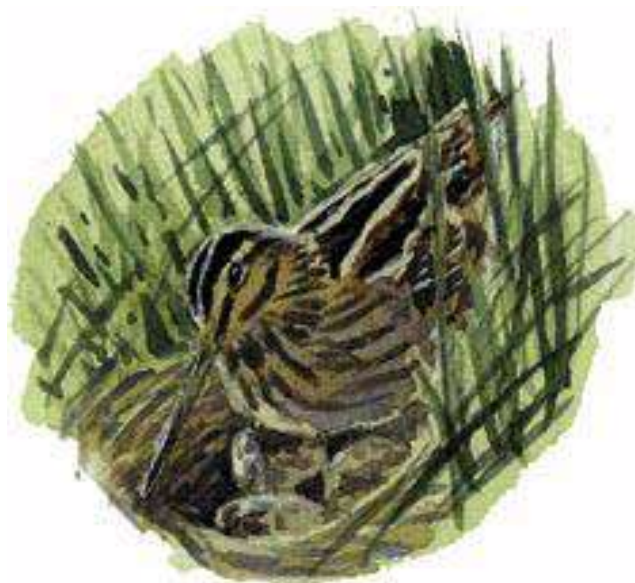
Nest with adult incubating

The outcomes shown may not be appropriate or suitable for all sites. Please consult scheme handbooks or your Natural England adviser for further information.