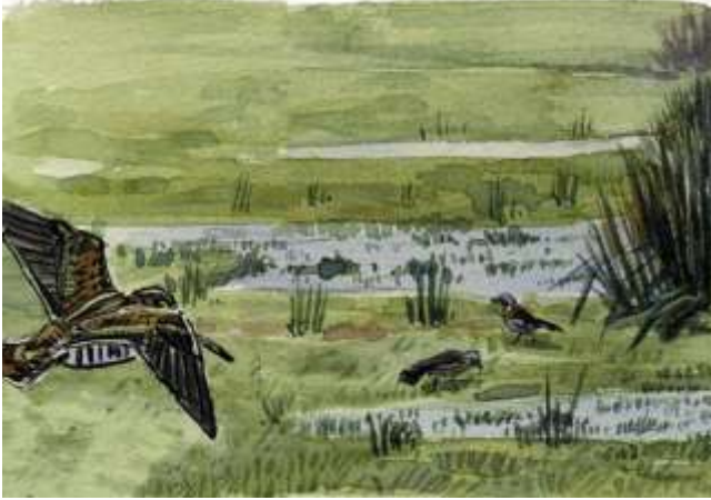
Sward too short

Drier areas of the field can be this short, but it is too short for the wet areas. Where the sward is too short there will not be enough cover for snipe to feel safe.