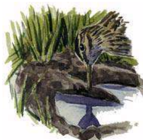
Hoof prints are valuable for feeding

Some bare ground from individual hoof prints is desirable but too much poaching that leads to larger areas of puddled ground is not. It is best to remove stock in very wet weather.