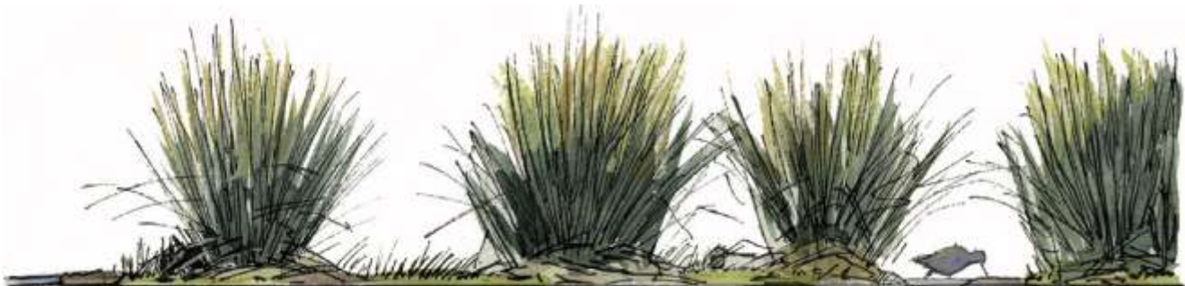
Cross section showing what the main area of the field should be like