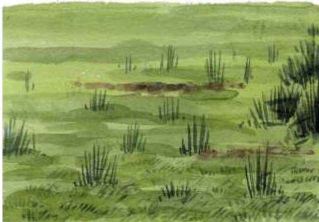
Sward too short for the main area of the field

Drier areas of the field can be this short but aim for the ideal structure in wet areas as there is not enough cover for snipe to feel safe.