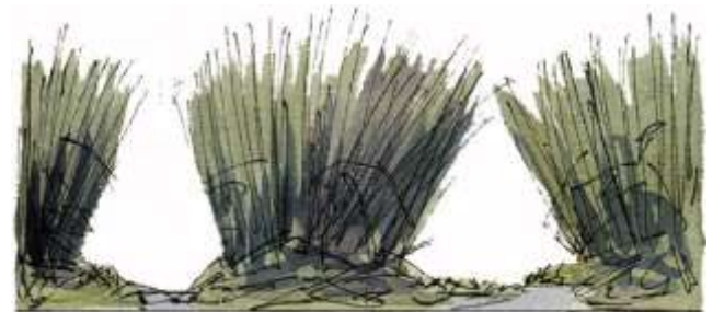
Cross section of too dense sward

Only small areas of the field should look like this as it is too dense for birds to move around in or to see out from.