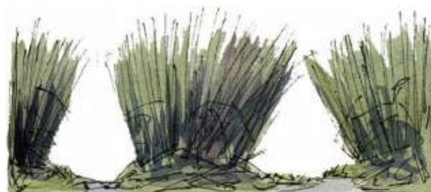
Cross section of sward too rank

Only small areas should be this dense as it is too dense for birds to move around in or to see out from and it is not suitable for nesting.