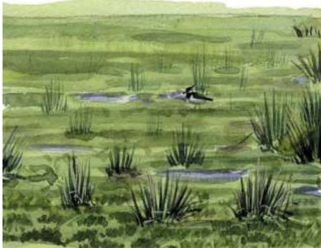
Sward too short

Drier areas of the field can be this short but it is too short for wet areas as there is not enough cover for snipe to feel safe.