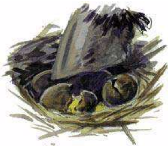
Nest and eggs being trampled

It is best to avoid grazing until June to maintain the sward structure and avoid trampling early nests or young. If this is not possible, the stocking rate should be very low to minimise damage.