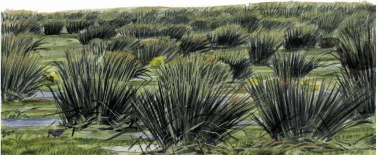
Most of the field should look like this

It will be not so dense that birds cannot see approaching danger. Snipe will nest in the shorter sward amongst tussocks.