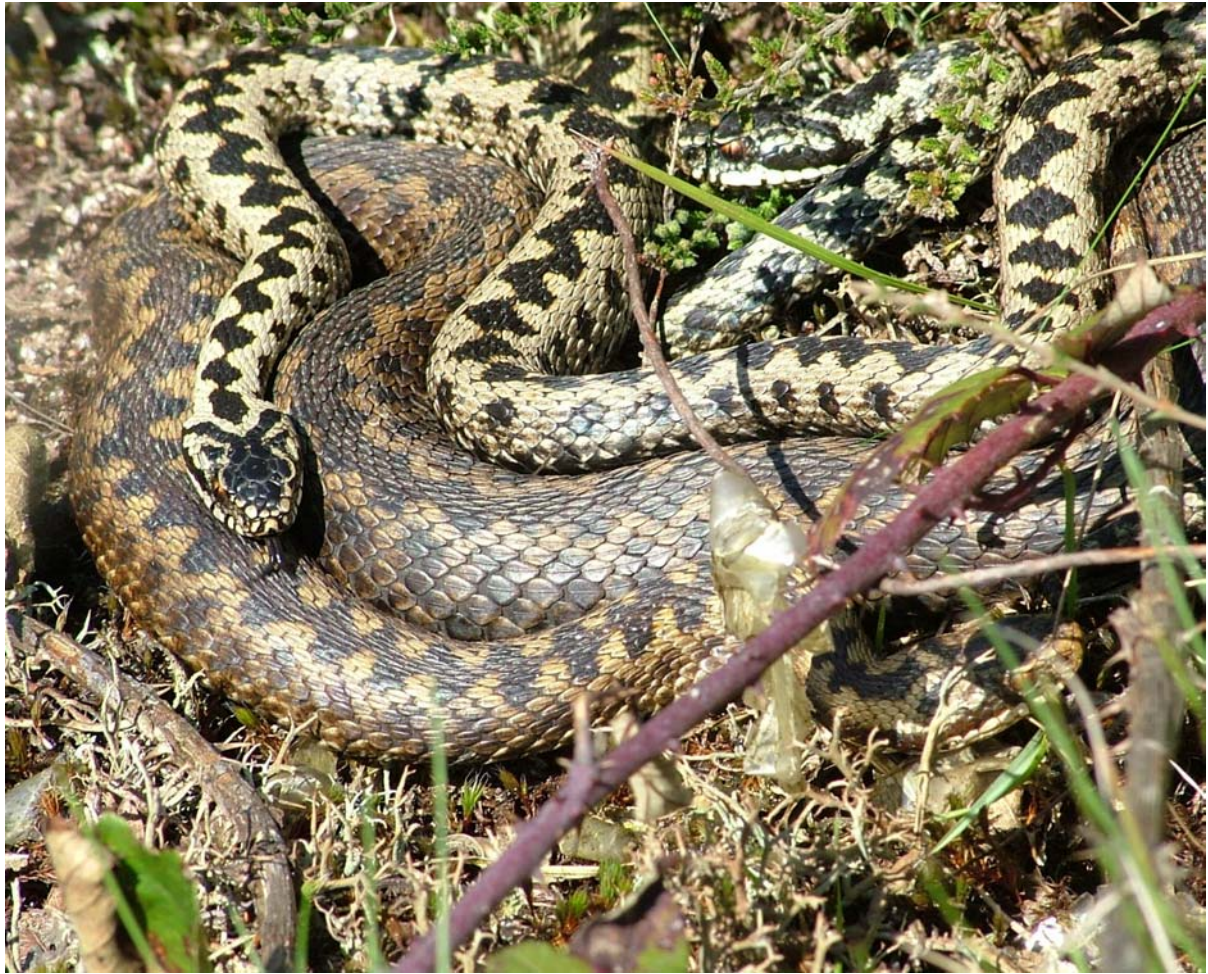
Two male adders court a female at site X

Thus it can be said that, in spite of a lack of systematic monitoring such as that proposed in the recommendations section of the general report, adders have been recorded annually on the site since the time of their release and that breeding occurred in 2003 and mating was seen a year later. A count of eight animals represents a healthy number in the initial stages of colonisation after a release and would indicate a total population which is perhaps much higher, though there is no accepted methodology to estimate total populations from emergence counts.