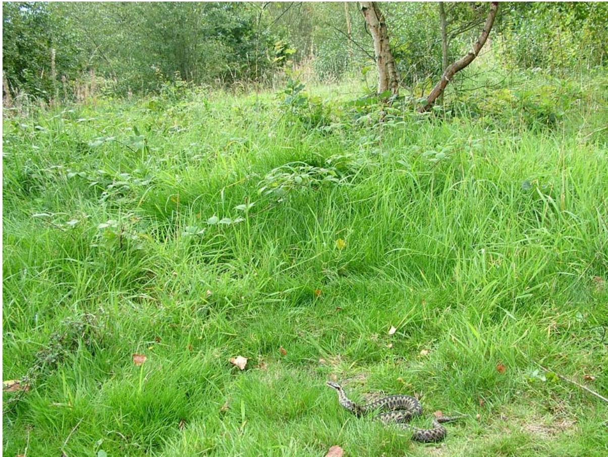
Site Y - core area complete with one of only a few adders (in the foreground) which make up the population

immediate surroundings. A programme of low intensity grazing and mechanised- and hand-clearance of scrub has restored some of the previously open character of the area over the past few decades.