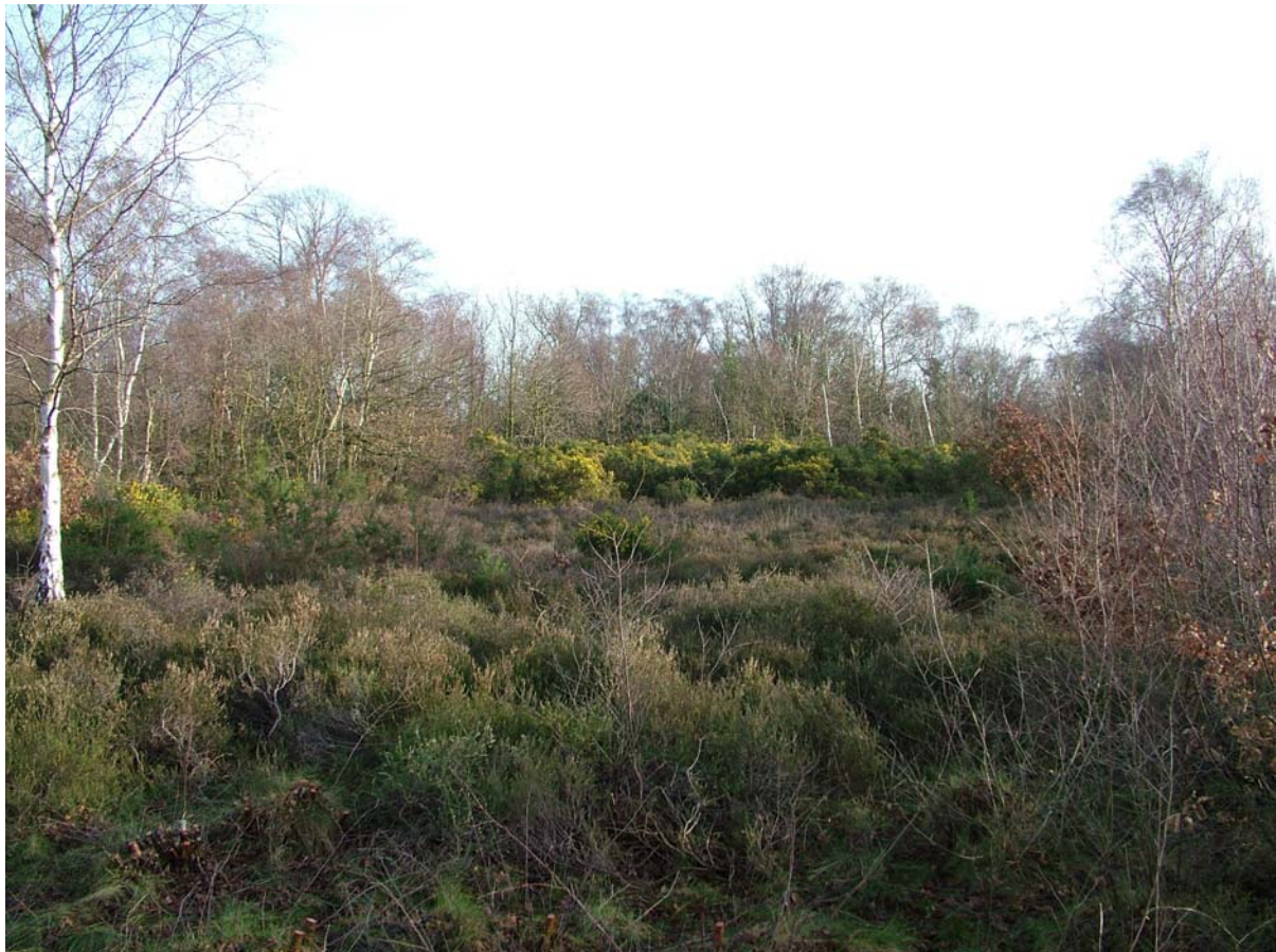
Tree and scrub encroachment can adversely affect adder populations where they remain.

Although agricultural improvement has not been important in the recent loss of populations from Greater London, given its more urban character, several factors listed for declines in other counties are significant, especially arson, human pressure and lack of sympathetic management.